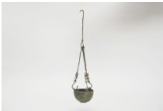
1019 ANCIENT ROMAN CHAIN LAMP (3rd-4th century).Ae. Very Fine. Weight:232 gr Diameter:37 cm