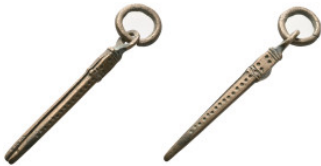
1152 ANCIENT ROMAN BRONZE TWEEZER.(1st-2nd century).Ae. Weight:5,9 gr Diameter: 63,4 mm