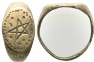
1126 ANCIENT ROMAN BRONZE RING.(3rd-4th centuries).Ae. Weight:4,7 gr Diameter:21,3 mm