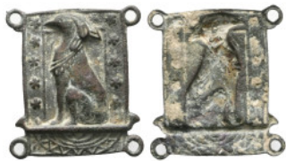
1138 ANCIENT GREEK BRONZE FIGURINE.Circa 300-250. Very Fine Weight:1,7 gr Diameter:32,4 mm