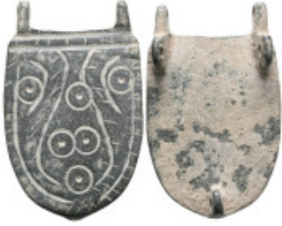
1142 ANCIENT ROMAN BRONZE MILITARY BUCKLE.(1st-2nd century).Ae. Weight:12,4 gr Diameter:42 mm