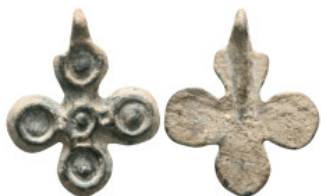
1098 ANCIENT BYZANTINE EMPIRE BRONZE CROSS ( 8th - 10 th century ) .Ae Weight:4,6 gr Diameter:27,8 mm