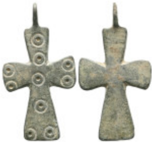
1103 ANCIENT BYZANTINE EMPIRE BRONZE CROSS ( 8th - 10 th century ) .Ae Weight:3,5 gr Diameter:36,8 mm