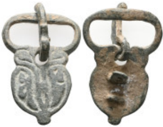
1143 ANCIENT ROMAN BRONZE MILITARY BUCKLE.(1st-2nd century).Ae. Weight:16,2 gr Diameter:48,5 mm