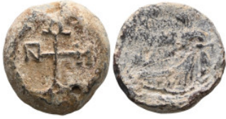
888 Byzantine Lead Seals, 7th - 13th Centuries Weight:23,7 gr Diameter:21,7 mm