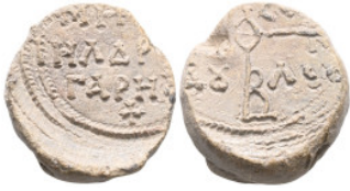
881 Byzantine Lead Seals, 7th - 13th Centuries Weight:18,8 gr Diameter:25,8 mm