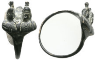
1110 ANCIENT ROMAN BRONZE ANCIENT ROMAN MARRIAGE RING.(3rd-4th centuries).Ae. Weight:1,9 gr Diameter:21,4 mm