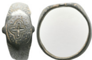
1129 ANCIENT ROMAN BRONZE RING.(3rd-4th centuries).Ae. Weight:3,7 gr Diameter:20,2 mm