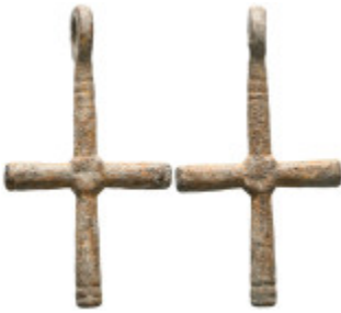
1102 ANCIENT BYZANTINE EMPIRE BRONZE CROSS ( 8th - 10 th century ) .Ae Weight:11,1 gr Diameter:57 mm