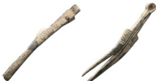
1153 ANCIENT ROMAN BRONZE TWEEZER.(1st-2nd century).Ae. Weight:7 gr Diameter:56,2 mm