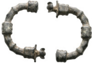
1148 ANCIENT GREEK BRONZE FIBULA.(4th-3th Century BC).Ae. Weight:25,4 gr Diameter:48,9 mm