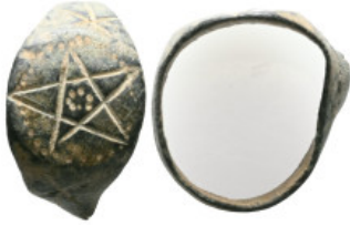
1130 ANCIENT ROMAN BRONZE RING.(3rd-4th centuries).Ae. Weight:4,5 gr Diameter:22 mm