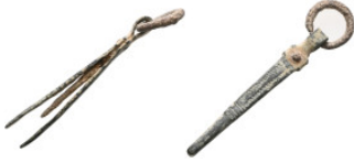
1155 ANCIENT ROMAN BRONZE TWEEZER.(1st-2nd century).Ae. Weight:5,4 gr Diameter:60,8 mm