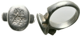
1136 ANCIENT ROMAN SILVER RING.(3rd-4th centuries).AR. Weight:12,6 gr Diameter:28,1 mm