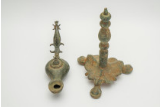
1017 ANCIENT ROMAN OIL LAMP.(3rd-4th century).Ae. Very Fine. Weight:1,45 kg Diameter:29 cm