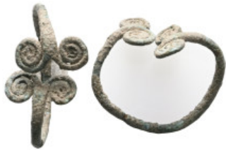
1137 ANCIENT ROMAN BRONZE RING.(3rd-4th centuries).Ae. Weight:2,2 gr Diameter:25,4 mm