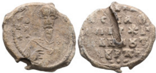
891 Byzantine Lead Seals, 7th - 13th Centuries Weight:5,4 gr Diameter:22 mm