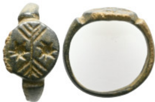
1127 ANCIENT ROMAN BRONZE RING.(3rd-4th centuries).Ae. Weight:3,4 gr Diameter:19,1 mm