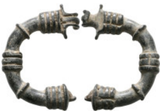
1146 ANCIENT GREEK BRONZE FIBULA.(4th-3th Century BC).Ae. Weight:33,6 gr Diameter:47,5 mm