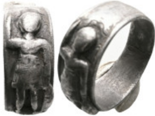
1131 ANCIENT ROMAN SILVER RING.(3rd-4th centuries).AR. Weight:7,3 gr Diameter:23,2 mm