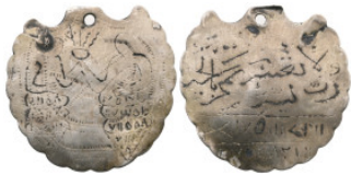
1157 ANCIENT ISLAMIC SILVER PENDANT.(Circa 1st - 2nd century).Ae. Weight:3,4 gr Diameter:33,8 mm