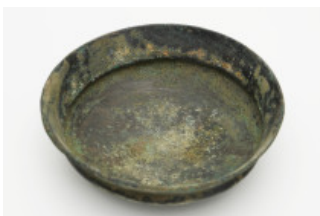
1022 ANCIENT ROMAN BRONZE PLATE .(3rd-4th century).Ae. Very Fine. Weight:240 gr Diameter:15 cm