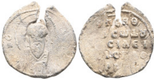
882 Byzantine Lead Seals, 7th - 13th Centuries Weight:7,1 gr Diameter:26 mm