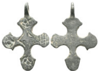
1099 ANCIENT BYZANTINE EMPIRE BRONZE CROSS ( 8th - 10 th century ) .Ae Weight:3,7 gr Diameter:30 mm