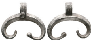
1166 ANCIENT ROMAN SILVER FIGURINE.(1st - 2nd Century).AR Weight:2,8 gr Diameter:23,7 mm