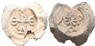
886 Byzantine Lead Seals, 7th - 13th Centuries Weight:10,5 gr Diameter:24 mm