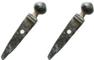
1145 ANCIENT ROMAN BRONZE SWORD PENDANT.(Circa 1st - 2nd century).Ae. Weight:6,6 gr Diameter:44,3 mm