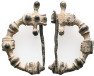
1149 ANCIENT GREEK BRONZE FIBULA.(4th-3th Century BC).Ae. Weight:11,6 gr Diameter:43,2 mm