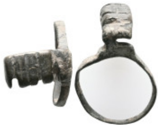
1171 ANCIENT ROMAN BRONZE RING KEY .(1st-2nd century).Ae. Weight:5,3 gr Diameter:29,1 mm