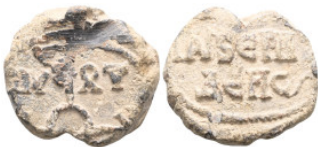
885 Byzantine Lead Seals, 7th - 13th Centuries Weight:18,7 gr Diameter:27 mm