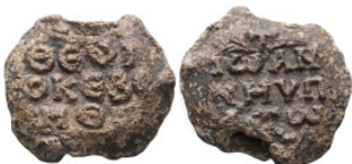
894 Byzantine Lead Seals, 7th - 13th Centuries Weight:19,4 gr Diameter:25,8 mm