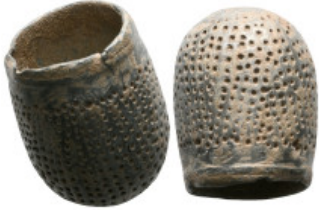
1167 ANCIENT BYZANTINE THIMBLE.(9th-110th century).Ae. Weight:33,6 gr Diameter:29,2 mm