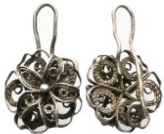
1160 ANCIENT ROMAN SILVER COUPLE (1st-2nd century).AR. Weight:1,4 gr Diameter:23,7 mm