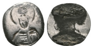
1117 ANCIENT ROMAN SILVER RING PIECE .(3rd-4th centuries).AR. Weight:0,5 gr Diameter:11,5 mm