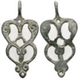
1162 ANCIENT ROMAN BRONZE FIGURINE.(1st - 2nd Century).Ae Weight:3,1 gr Diameter:37,4 mm