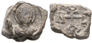
890 Byzantine Lead Seals, 7th - 13th Centuries Weight:13,5 gr Diameter:19,8 mm