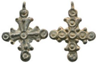
1095 ANCIENT BYZANTINE EMPIRE BRONZE CROSS ( 8th - 10 th century ) .Ae Weight:8,5 gr Diameter:43,1 mm