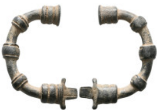
1147 ANCIENT GREEK BRONZE FIBULA.(4th-3th Century BC).Ae. Weight:16,3 gr Diameter:43,7 mm