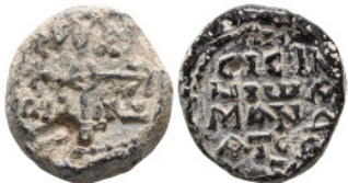
893 Byzantine Lead Seals, 7th - 13th Centuries Weight:11,8 gr Diameter:19 mm