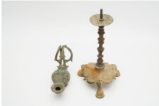
1018 ANCIENT ROMAN OIL LAMP.(3rd-4th century).Ae. Very Fine. Weight:1,45 kg Diameter:33,5 cm