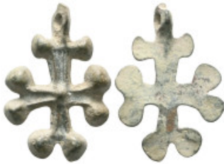
1101 ANCIENT BYZANTINE EMPIRE BRONZE CROSS ( 8th - 10 th century ) .Ae Weight:2,8 gr Diameter:27,4 mm