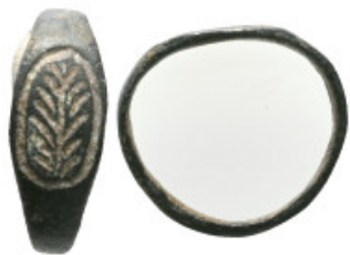
1128 ANCIENT ROMAN BRONZE RING.(3rd-4th centuries).Ae. Weight:1 gr Diameter:16,2 mm