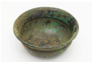
1021 ANCIENT ROMAN BRONZE PLATE .(3rd-4th century).Ae. Very Fine. Weight:283 gr Diameter:15 cm