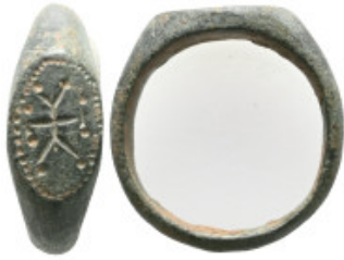
1124 ANCIENT ROMAN BRONZE RING.(3rd-4th centuries).Ae. Weight:6,4 gr Diameter:23,6 mm