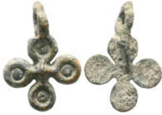
1100 ANCIENT BYZANTINE EMPIRE BRONZE CROSS ( 8th - 10 th century ) .Ae Weight:2,4 gr Diameter:23,6 mm