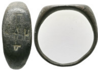
1125 ANCIENT ROMAN BRONZE RING.(3rd-4th centuries).Ae. Weight:5 gr Diameter:22,4 mm