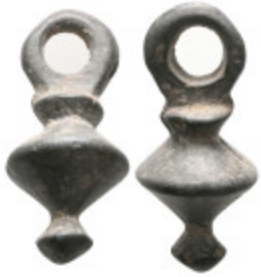
1163 ANCIENT ROMAN BRONZE FIGURINE.(1st - 2nd Century).Ae Weight:6,3 gr Diameter:26 mm