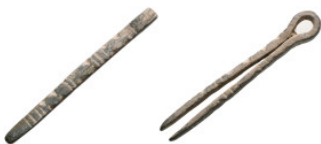
1154 ANCIENT ROMAN BRONZE TWEEZER.(1st-2nd century).Ae. Weight:6 gr Diameter:52,4 mm