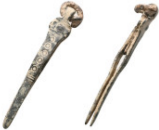
1156 ANCIENT ROMAN BRONZE TWEEZER.(1st-2nd century).Ae. Weight:5,1 gr Diameter:56 mm