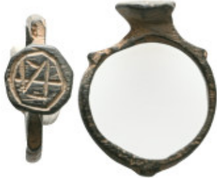
1132 ANCIENT ROMAN BRONZE RING.(3rd-4th centuries).Ae. Weight:2,8 gr Diameter:24,6 mm