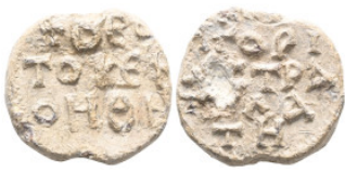
883 Byzantine Lead Seals, 7th - 13th Centuries Weight:10,4 gr Diameter:20,8 mm