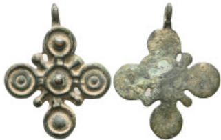
1096 ANCIENT BYZANTINE EMPIRE BRONZE CROSS ( 8th - 10 th century ) .Ae Weight:6 gr Diameter:37 mm