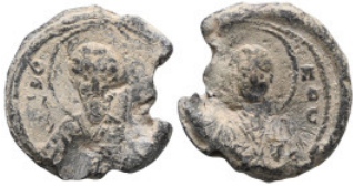
889 Byzantine Lead Seals, 7th - 13th Centuries Weight:8,9 gr Diameter:22,8 mm