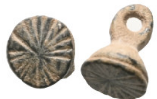
1161 ANCIENT ROMAN BRONZE STAMP SEAL.(1st-2nd century).Ae. Weight:1 gr Diameter:9,9 mm