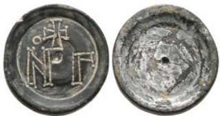
1174 ANCIENT BYZANTINE BRONZE COMMERCIAL WEIGHT.(Circa 6th-9th Century).Ae. Weight:13,6 gr Diameter:22 mm