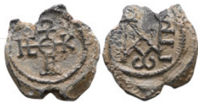
892 Byzantine Lead Seals, 7th - 13th Centuries Weight:9,1 gr Diameter:24 mm