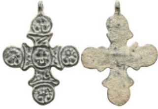
1094 ANCIENT BYZANTINE EMPIRE BRONZE CROSS ( 8th - 10 th century ) .Ae Weight:8,5 gr Diameter:50 mm