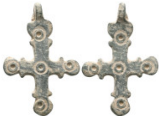
1097 ANCIENT BYZANTINE EMPIRE BRONZE CROSS ( 8th - 10 th century ) .Ae Weight:5,6 gr Diameter:39 mm