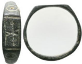
1133 ANCIENT ROMAN BRONZE RING.(3rd-4th centuries).Ae. Weight:2,4 gr Diameter:21,3 mm