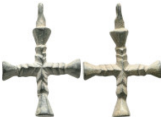
1104 ANCIENT BYZANTINE EMPIRE BRONZE CROSS ( 8th - 10 th century ) .Ae Weight:5,4 gr Diameter:36 mm