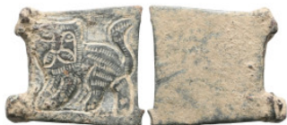
1140 ANCIENT ROMAN BRONZE MILITARY BUCKLE.(1st-2nd century).Ae. Weight:7,2 gr Diameter:36,7 mm