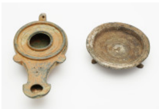
1020 ANCIENT ROMAN OIL LAMP.(3rd-4th century).Ae. Very Fine. Weight:950 gr Diameter: 19 cm