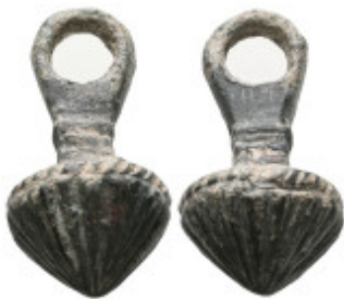
1165 ANCIENT ROMAN BRONZE FIGURINE.(1st - 2nd Century).Ae Weight:9,6 gr Diameter:26,8 mm