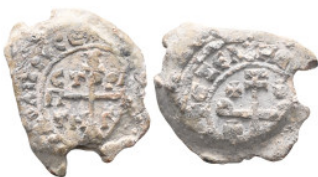
887 Byzantine Lead Seals, 7th - 13th Centuries Weight:21,4 gr Diameter:29,3 mm