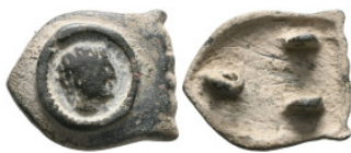
1139 ANCIENT ROMAN BRONZE MILITARY BUCKLE.(1st-2nd century).Ae. Weight:12,7 gr Diameter:29,7 mm