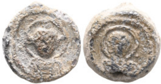
884 Byzantine Lead Seals, 7th - 13th Centuries Weight:15,2 gr Diameter:20,2 mm