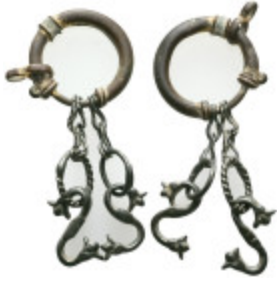
1135 ANCIENT ROMAN SILVER AND BRONZE RING.(3rd-4th centuries).AR. , AE Weight:6,8 gr Diameter:51,2 mm