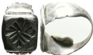
1134 ANCIENT ROMAN SILVER RING.(3rd-4th centuries).AR. Weight:5,9 gr Diameter:20,7 mm