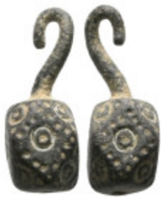
1164 ANCIENT ROMAN BRONZE FIGURINE.(1st - 2nd Century).Ae Weight:5 gr Diameter:21,5 mm