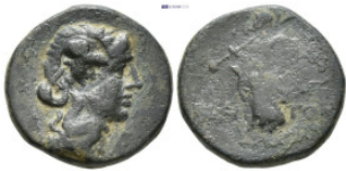
273 Uncertain Greek Ancient Coins. AE (3.8 Gr. 17mm.)