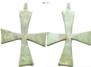
694 Bronze cross pendant. (85mm, 45.93 g)