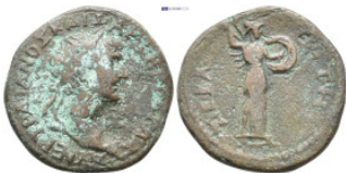
275 Bithynia, Koinon of Bithynia AE (21mm, 6.44 g) Trajan (98-117) Obv: AYT NEP TPAIANOC KAICAP C(EB ΓEP); laureate head of Trajan, r. Rev: CEBACTH; Athena standing r., brandishing spear with r. hand and holding shield in l.