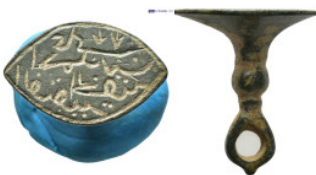
714 Bronze Stamp Seal (4.94 Gr. 24mm.) SOLD AS SEEN, NO RETURN!