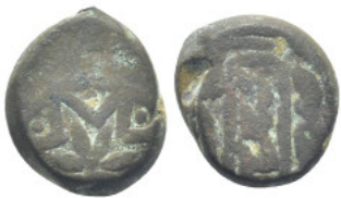
650 Islamic coin (16mm, 5.8 g)