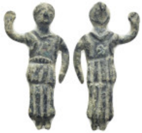
697 Bronze figurine. (42mm, 11.85 g)