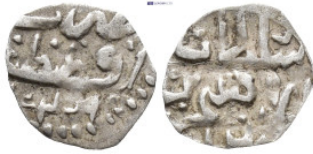
655 Islamic coin. (9mm, 0.18 g)