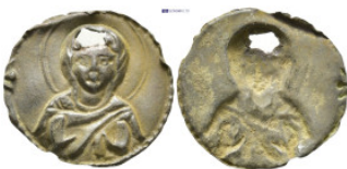
682 An applique relief with Mary. (1.42 Gr. 25mm.) SOLD AS SEEN, NO RETURN!