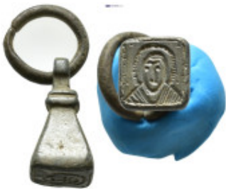
718 Byzantine bronze stamp seal. Conical-shaped seal, loop at top for suspension. Saint? Bust. (21mm, 9.42 g)