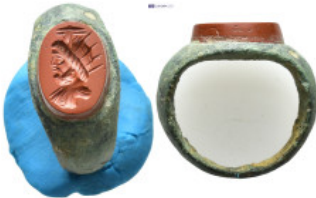
710 Bronze Ring with red stone. (6.19Gr. 12mm.) SOLD AS SEEN, NO RETURN!