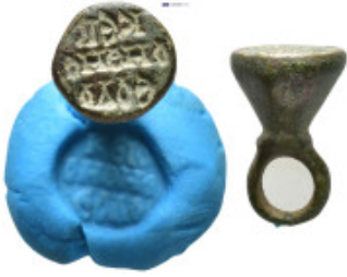
715 Bronze Stamp Seal (6.33 Gr. 24mm.) SOLD AS SEEN, NO RETURN!