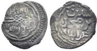
648 Islamic coin (16mm, 1.15 g)