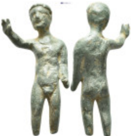
701 Bronze nude male statuette. (57mm, 37.3 g)