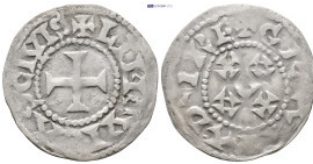
658 CAROLINGIANS. Odo (Eudes). King of West Francia, 887-898. AR Denier (22mm, 1.48 g). Limovicas (Limoges) mint. + GRATIA D - I RE, ODO with quadrilateral Os across field; cross pattée above and below / + LIMOVICAS CIVIS, cross pattée.