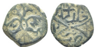
640 Islamic coin (12mm, 1.3 g)