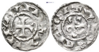
678 Medieval World coin. (21mm, 1.45 g)