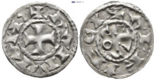
676 Medieval World coin. (20mm, 1.47 g)