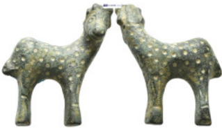
698 Bronze horse figurine (35mm, 24.6 g)