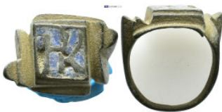
712 Bronze Ring. (20mm, 12.11 g)