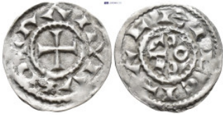
677 Medieval World coin. (20mm, 1.52 g)