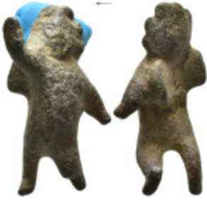
696 Bronze figurine (38mm, 20.31 g)