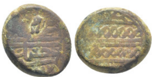
652 Islamic coin (17mm, 5.9 g)