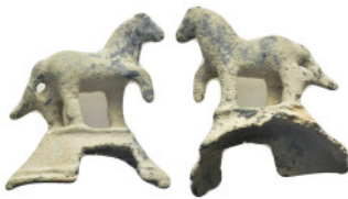
745 Roman Prancing Horse Statuette (49mm, 33.22 g) A bronze figure of a horse advancing with one leg raised, wearing parade equipment, on a hollow-formed socle base with stub feet.