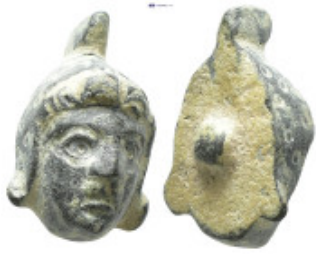
689 Bronze male head with Phrygian cap. (21mm, 9.9 g)