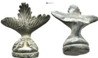
695 Bronze Eagle statuette. (38mm, 33.85 g)