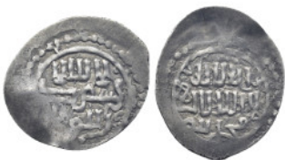
653 Islamic coin (19mm, 1.09 g)