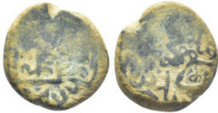
642 Islamic coin (14mm, 3.0 g)