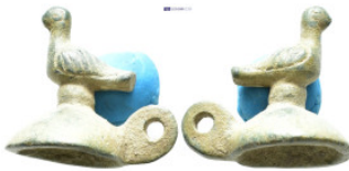
691 Bronze bird pattern oil lamp lid. (28mm, 24.1 g)