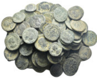
753 Mixed lot 100 pieces. SOLD AS SEEN NO RETURNS.