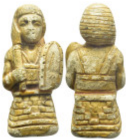
746 Sasanian statue in lime stone. (57mm, 20.4 g)