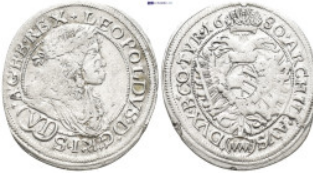
656 AUSTRIA: Leopold I, 1657-1705, AR 6 kreuzer (26mm, 2.66 g)