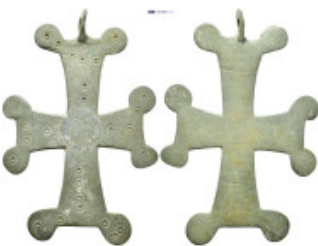
719 Byzantine pendant cross. (31.44 Gr. 99mm.) SOLD AS SEEN, NO RETURN!