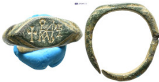
692 Bronze Byzantine ring cross and monogram. (23mm, 6.66 g)