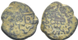
645 Islamic coin (15mm, 2.22 g)