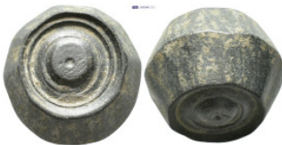
693 Bronze Coin Weight. (30.2 Gr. 20mm.) SOLD AS SEEN, NO RETURN!