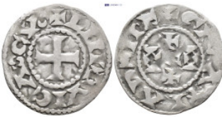
657 CAROLINGIANS. Odo (Eudes). King of West Francia, 887-898. AR Denier (22mm, 1.32 g). Limovicas (Limoges) mint. + GRATIA D - I RE, ODO with quadrilateral Os across field; cross pattée above and below / + LIMOVICAS CIVIS, cross pattée.