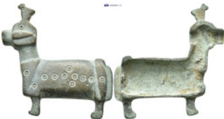
699 Bronze horse lock. (46mm, 18.85 g)