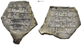
635 Islamic coin. (20mm, 2.91 g)