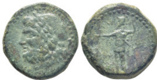
267 Greek coin. (24mm, 11.6 g)