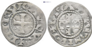
660 CAROLINGIANS. Odo (Eudes). King of West Francia, 887-898. AR Denier (23mm, 1.35 g). Limovicas (Limoges) mint. + GRATIA D - I RE, ODO with quadrilateral Os across field; cross pattée above and below / + LIMOVICAS CIVIS, cross pattée.