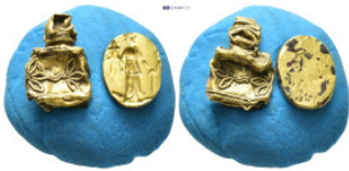
679 2 Pieces Gold Antiques (1.56 Gr. ) SOLD AS SEEN, NO RETURN!