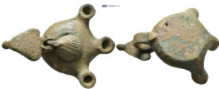
717 Bronze Triple-Nozzle Oil Lamp. (72mm, 117.78 g)