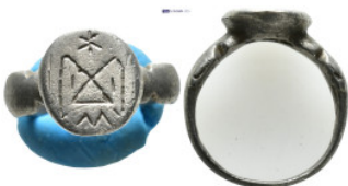
720 Byzantine period silver ring. (18mm, 6.73 g)