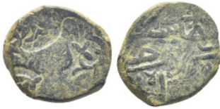
644 Islamic coin (15mm, 2.15 g)