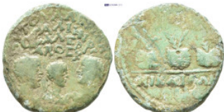
274 BITHYNIA, Nicaea. Valerian I, Gallienus, and Valerian II Caesar. AD 256-257/8. AE. (6.9 Gr. 24mm.) Radiate, draped, and cuirassed bust of Valerian I right, facing radiate, draped, and cuirassed bust of Gallienus left; between, smaller radiate, draped, and cuirassed bust of Valerian II right Rev. Three agonistic urns set on voided base, the outer two each containing a single palm branch, the central containing two.