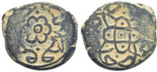
649 Islamic coin (16mm, 3.1 g)