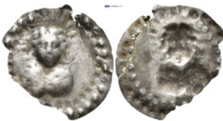
266 Greek coin. (20mm, 0.83 g)