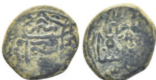
646 Islamic coin (15mm, 2.8 g)