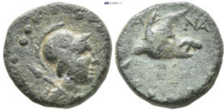
270 Greek coin. (3.7 Gr. 14mm.)