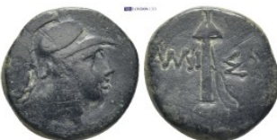
269 PONTOS. Amisos. Time of Mithradates VI Eupator, circa 100-85 BC. AE (19mm, 7.7 g) Head of Ares to right, wearing crested Corinthian helmet. Rev. AMI-ΣΟΥ Sword in sheath.