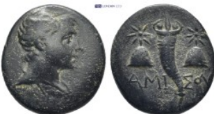
268 Pontos, Amisos. Ca. 125-100 B.C. AE (17mm, 3.87 g). Bare-headed bust of Perseus right / AMI-ΣΟΥ, cornucopia between caps of the Dioscuri, stars above each.