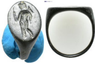
709 Bronze ring with eros figure. (18mm, 5.76 g)