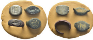
743 Ring Bezels x 4 pieces