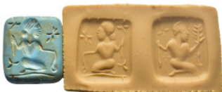
748 Sasanian double side stamp 5-7 AD. (29mm, 12.46 g)