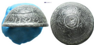
713 Bronze shield shaped object. (21mm, 5.9 g)