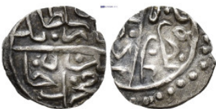
654 Islamic coin. (11mm, 0.68 g)