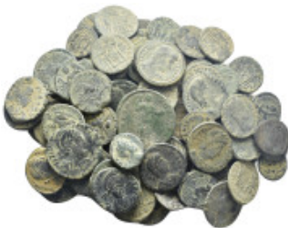
754 Mixed lot 100 pieces. SOLD AS SEEN NO RETURNS.