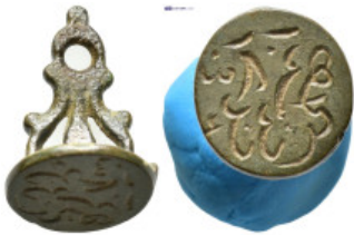
716 Bronze stamp seal with pierce handle and round bezel. (22mm, 4.26 g)