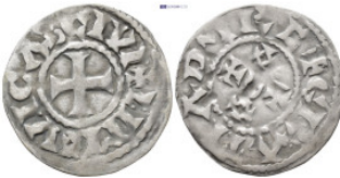
659 CAROLINGIANS. Odo (Eudes). King of West Francia, 887-898. AR Denier (22mm, 1.54 g). Limovicas (Limoges) mint. + GRATIA D - I RE, ODO with quadrilateral Os across field; cross pattée above and below / + LIMOVICAS CIVIS, cross pattée.