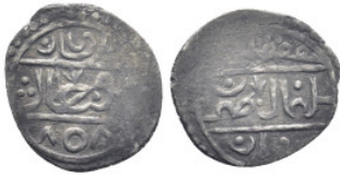
641 Islamic coin (14mm, 0.77 g)