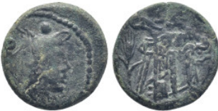
265 Greek coin. (19mm, 6.2 g)