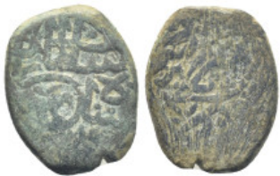
651 Islamic coin (17mm, 2.8 g)