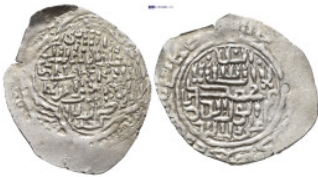
637 Islamic coin. (28mm, 1.8 g)