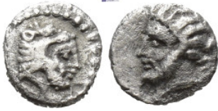
264 Greek coin (6mm, 0.29 g)