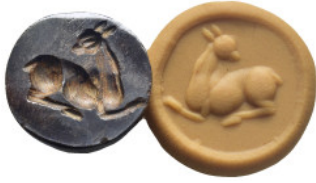
749 Sasaninan stamp deer 7 AD. (21mm, 4.82 g)