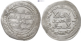
634 Umayyad Caliphate. 'Umar ibn Abd al-Aziz. AH 99-101 / AD 717-720. AR Dirhem (29mm, 2.66 g)