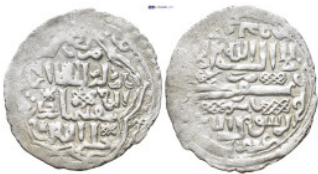
636 Islamic coin. (26mm, 1.62 g)