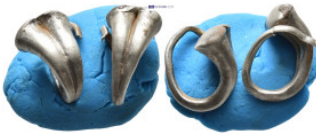
752 Silver earrings 2 pieces. (7,19 g)