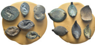
744 Ring Bezels x 6 pieces