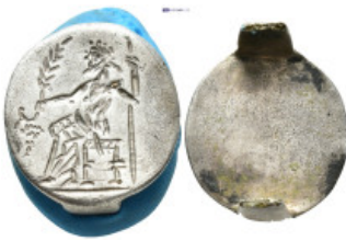
751 Silver Ring piece (3.76 Gr. 21mm.) SOLD AS SEEN, NO RETURN!