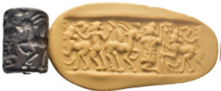
681 Akkadian 3000-2720 BC Hamatite Stone. (39mm, 25.8 g)