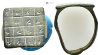
711 Bronze Ring. (12mm, 6.75 g)