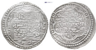
638 Islamic coin. (28mm, 1.81 g)