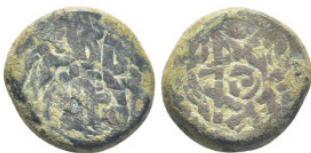
647 Islamic coin (15mm, 6.29 g)