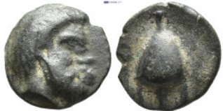
271 Uncertain Greek Ancient Coins. AE (0.83 Gr. 9mm.)