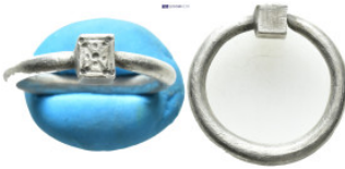
750 Silver Ring (6.72 Gr. 21mm.) SOLD AS SEEN, NO RETURN!