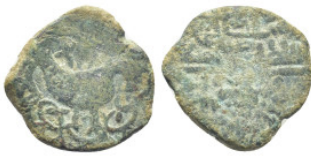
643 Islamic coin (15mm, 1.53 g)