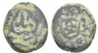
639 Islamic coin (11mm, 1.29 g)