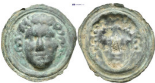
700 Bronze medusa head applique. (58mm, 5.0 g)