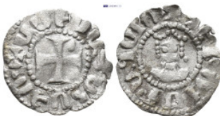
661 Cilician Armenia, Levon V (1373-1375). AR Obol (14mm, 0.55 g) Cross. Rev: Facing bust of Levon.