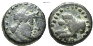
272 Uncertain Greek Ancient Coins. AE (3.1 Gr. 13mm.)