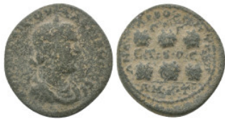
547 Roman Provincial Coin. AE Weight: 15.0 g Diameter: 27.90 mm