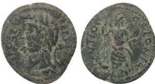
550 Roman Provincial Coin. AE Weight: 4.58 g Diameter: 23.68 mm