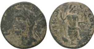
551 Roman Provincial Coin. AE Weight: 4.65 g Diameter: 21.11 mm