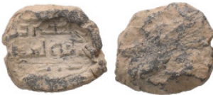
1432 Islamic Lead Seals Weight: 7.97 g Diameter: 17.98 mm 2