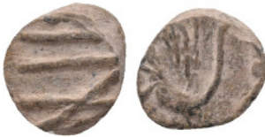
1430 Byzantine Lead Seals Weight: 7.45 g Diameter: 17.01 mm 2