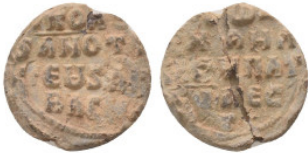
1373 Byzantine Lead Seals Weight: 4.60 g Diameter: 19.78 mm 2