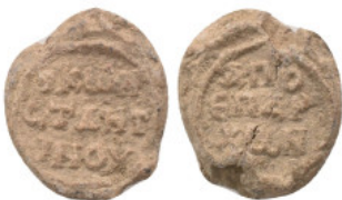
1376 Byzantine Lead Seals Weight: 13.08 g Diameter: 26.07 mm 2