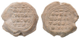
1375 Byzantine Lead Seals Weight: 8.96 g Diameter: 19.64 mm 2