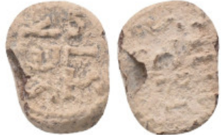
1401 Byzantine Lead Seals Weight: 7.60 g Diameter: 22.42 mm 2