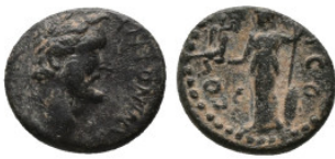
548 Roman Provincial Coin. AE Weight: 4.36 g Diameter: 15.68 mm