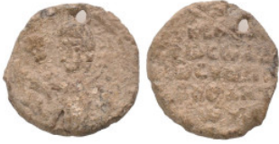
1386 Byzantine Lead Seals Weight: 6.97 g Diameter: 21.06 mm 2