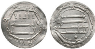
1433 Islamic Coins, AR Weight: 2.90 g Diameter: 23.61 mm 2