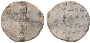
1387 Byzantine Lead Seals Weight: 7.10 g Diameter: 25.84 mm 2