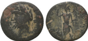
552 Roman Provincial Coin. AE Weight: 5.13 g Diameter: 20.60 mm