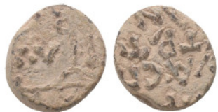
1406 Byzantine Lead Seals Weight: 11.23 g Diameter: 19.47 mm 2