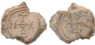
1391 Byzantine Lead Seals Weight: 11.96 g Diameter: 24.93 mm 2