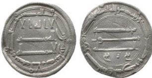
1434 Islamic Coins, AR Weight: 2.62 g Diameter: 24.75 mm 2