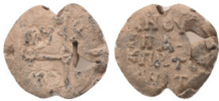
1403 Byzantine Lead Seals Weight: 9.80 g Diameter: 25.22 mm 2