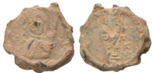
1405 Byzantine Lead Seals Weight: 10.99 g Diameter: 21.33 mm 2