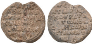
1389 Byzantine Lead Seals Weight: 16.12 g Diameter: 28.09 mm 2