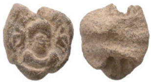
1388 Byzantine Lead Seals Weight: 7.13 g Diameter: 17.66 mm 2