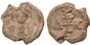
1374 Byzantine Lead Seals Weight: 8.81 g Diameter: 22.48 mm 2