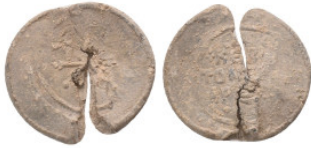
1400 Byzantine Lead Seals Weight: 7.05 g Diameter: 26.57 mm 2