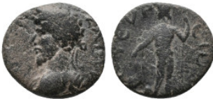
549 Roman Provincial Coin. AE Weight: 4.71 g Diameter: 19.15 mm