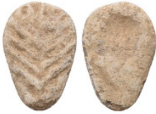
1428 Byzantine Lead Seals Weight: 6.54 g Diameter: 23.43 mm 2