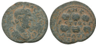
546 Roman Provincial Coin. AE Weight: 18.41 g Diameter: 28.43 mm