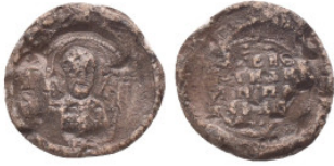
1372 Byzantine Lead Seals Weight: 6.84 g Diameter: 21.93 mm 2