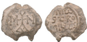
1378 Byzantine Lead Seals Weight: 11.86 g Diameter: 16.83 mm 2