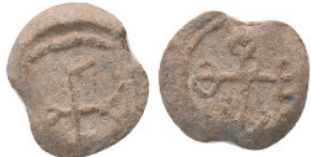
1404 Byzantine Lead Seals Weight: 10.86 g Diameter: 20.91 mm 2