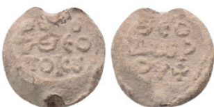
1377 Byzantine Lead Seals Weight: 12.40 g Diameter: 20.91 mm 2