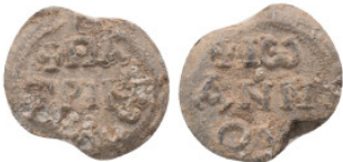
1392 Byzantine Lead Seals Weight: 10.76 g Diameter: 24.59 mm 2