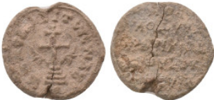
1390 Byzantine Lead Seals Weight: 6.08 g Diameter: 23.23 mm 2