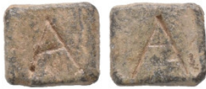
1429 Byzantine Lead Seals Weight: 2.87 g Diameter: 10.30 mm 2