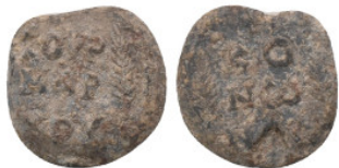
1402 Byzantine Lead Seals Weight: 9.78 g Diameter: 20.22 mm 2