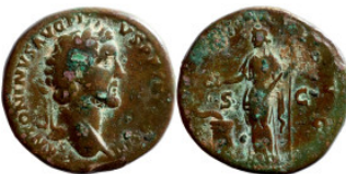
414 Sestertius bronze Roman Imperial 32mm 24,68g