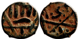
730 Osman coin 14mm 2,40g