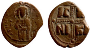
1085 Byzantine Empire coin 27mm 7,86g