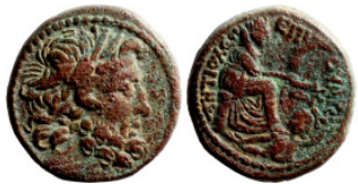
80 Greek bronze coin 1-4 Century 19mm 7,84g