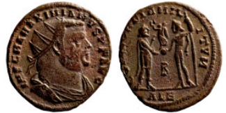
628 Roman Imperial coin 20mm 2,58g