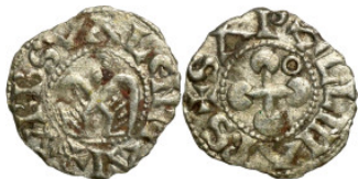
492 Medieval coin 17mm 0,67g