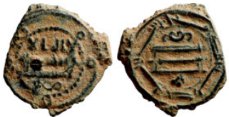
1180 Islamic coin 18mm 3,00g