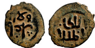
1109 Osman coin 12mm 1,68g