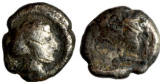
7 Greek silver coin 1-4 Century 8mm 0,79g