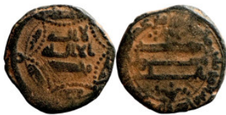
1186 Islamic coin 17mm 2,57g Artificial sand patina