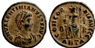
773 Roman Imperial coin 18mm 3,29g Artificial sand patina