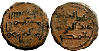
1256 Osman coin 20mm 2,81g