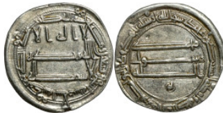
470 Islamic silver coin 21mm 3,00g