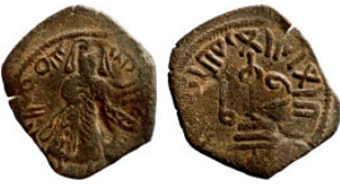
1113 Osman coin 17mm 2,85g