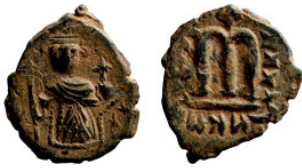
924 Byzantine Empire coin 24mm 3,44g