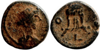
840 Roman Imperial coin 10mm 0,94g