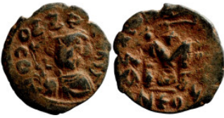
925 Byzantine Empire coin 23mm 4,56g