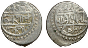
517 Osman coin 13mm 1,13g