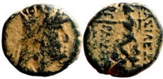
172 Greek bronze coin 1-4 Century 18mm 6,41g Artificial sand patina