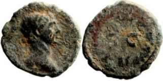
838 Roman Imperial coin 11mm 1,19g