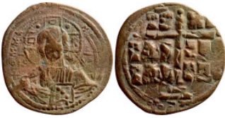
1051 Byzantine Empire coin 38mm 23,96g