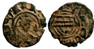
1233 Osman coin 12mm 1,30g Artificial sand patina