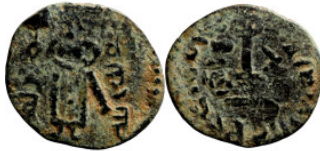
1147 Islamic coin 16mm 2,72g