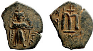
939 Byzantine Empire coin 21mm 4,30g