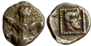
20 Greek silver coin 1-4 Century 6mm 0,33g