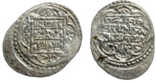
501 Osman coin 22mm 1,65g