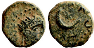
334 Roman Imperial coin 13mm 2,05g