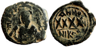
1042 Byzantine Empire coin 29mm 6,83g