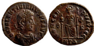
637 Roman Imperial coin 17mm 2,13g