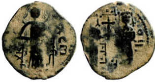
923 Byzantine Empire coin 26mm 4,43g