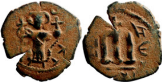
937 Byzantine Empire coin 20mm 3,33g