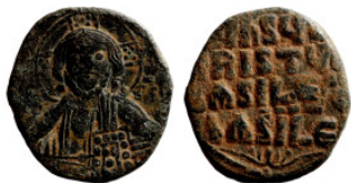
1013 Byzantine Empire Silver coin 25mm 5,78g