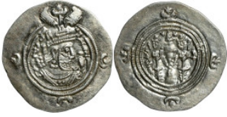
459 Sasanian silver drachm 31mm 4,14g