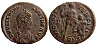
619 Roman Imperial coin 21mm 4,78g