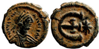
1101 Byzantine Empire coin 13mm 1,35g