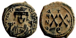
969 Byzantine Empire coin 21mm 2,62g