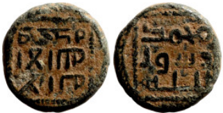
1255 Osman coin 17mm 2,77g