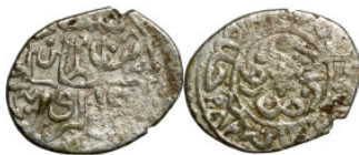
504 Osman coin 19mm 2,16g