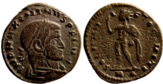
625 Roman Imperial coin 21mm 3,20g