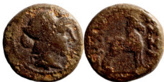
83 Greek bronze coin 1-4 Century 17mm 6,58g