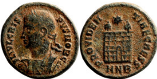
820 Roman Imperial coin 17mm 3,07g