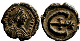
956 Byzantine Empire coin 15mm 1,24g