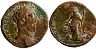
411 Sestertius bronze Roman Imperial 29mm 23,40g