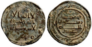
1168 Islamic coin 20mm 4,83g