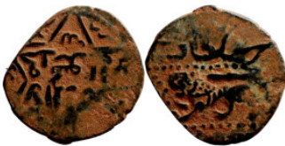
1137 Islamic coin 17mm 1,77g