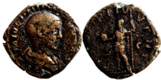
335 Dupondius bronze Roman Imperial 28mm 14,12g