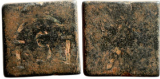
1020 Antiquities 8mm 1,46g