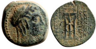
161 Greek bronze coin 1-4 Century 18mm 6,58g