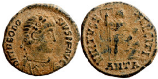
561 Roman Imperial coin 20mm 4,76g