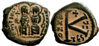
898 Byzantine Empire coin 16mm 2,71g Artificial sand patina