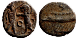
171 Sidon. Ba'alšillem II, circa 401-366 BC. 1/16 Shekel silver Phoenician galley left, waves below. Rev. Persian king or hero, holding dagger in his right hand, standing right, fighting lion standing left on its hind legs; all within incuse square. 9mm 0,64g