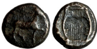
26 Greek silver coin 1-4 Century 7mm 0,41g