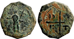
941 Byzantine Empire coin 20mm 4,38g