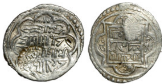
503 Osman coin 19mm 1,60g