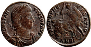
626 Roman Imperial coin 21mm 3,75g