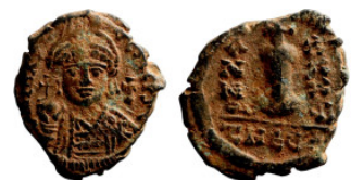
954 Byzantine Empire coin 18mm 2,57g