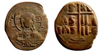
1037 Byzantine Empire coin 27mm 5,97g