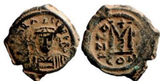
1040 Byzantine Empire coin 28mm 10,53g