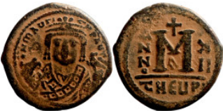
963 Byzantine Empire coin 28mm 12,10g