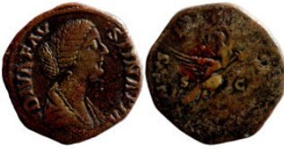
363 Sestertius bronze Roman Imperial 31mm 22,24g