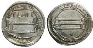
483 Islamic silver coin 22mm 2,97g