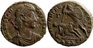
622 Roman Imperial coin 20mm 5,32g