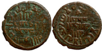
1106 Osman coin 15mm 0,26g