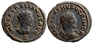
644 Roman Imperial coin 19mm 3,14g