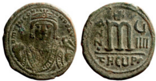
992 Byzantine Empire coin 29mm 10,59g