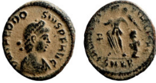
796 Roman Imperial coin 14mm 1,03g Artificial sand patina