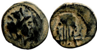
1128 Antik coin 10mm 0,96g