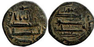
1203 Islamic coin 14mm 2,19g