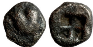
12 Greek silver coin 1-4 Century 7mm 0,65g