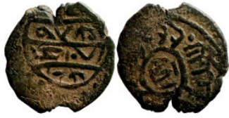
1160 Osman coin 12mm 0,70g