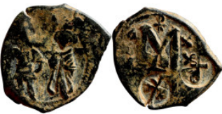
1089 Byzantine Empire coin 28mm 11,50g