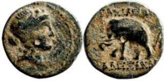
168 Greek bronze coin 1-4 Century 14mm 2,77g