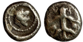
10 Greek silver coin 1-4 Century 8mm 0,59g