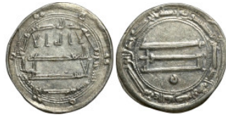
469 Islamic silver coin 23mm 2,96g