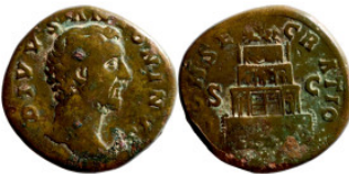
413 Sestertius bronze Roman Imperial 30mm 23,19g