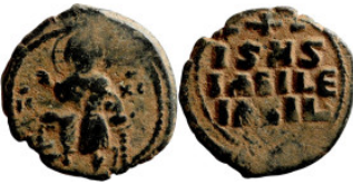
1086 Byzantine Empire coin 26mm 4,32g