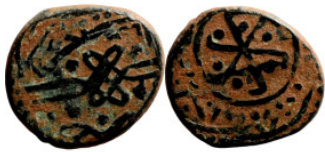
1261 Osman coin 15mm 2,65g