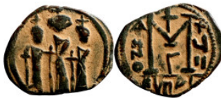
192 Antik coin 19mm 4,09g Artificial sand patina