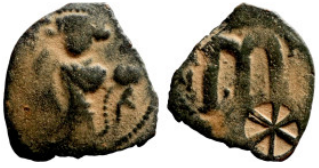
902 Byzantine Empire coin 18mm 3,00g Artificial sand patina