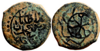
1211 Osman coin 15mm 2,89g