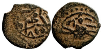
1156 Osman coin 12mm 1,55g