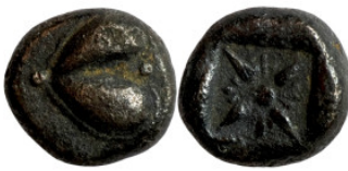
17 Greek silver coin 1-4 Century 7mm 0,77g