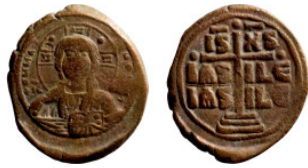
1064 Byzantine Empire coin 28mm 9,43g