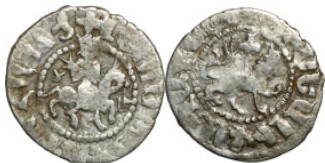
491 Medieval coin 19mm 1,74g