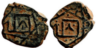
1222 Osman coin 14mm 1,87g