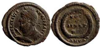
630 Roman Imperial coin 19mm 1,95g