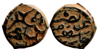
1157 Osman coin 12mm 1,31g