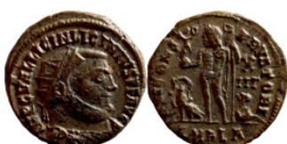
640 Roman Imperial coin 18mm 3,36g