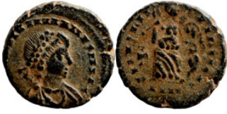
578 Roman Imperial coin 12mm 1,43g