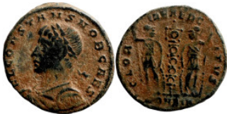
574 Roman Imperial coin 16mm 1,57g