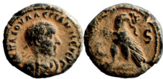
589 Roman Imperial coin 21mm 9,73g Artificial sand patina