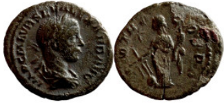
641 Roman Imperial coin 17mm 2,62g