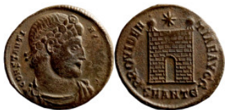
631 Roman Imperial coin 19mm 2,10g