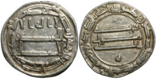
474 Islamic silver coin 21mm 2,93g