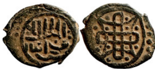
1149 Osman coin 15mm 2,56g Artificial sand patina