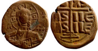
1041 Byzantine Empire coin 27mm 10,64g