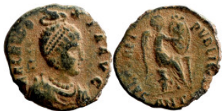
828 Roman Imperial coin 16mm 2,19g