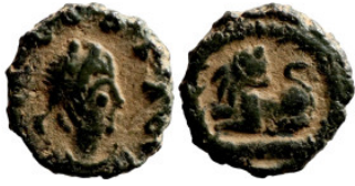
704 Antik coin bronze 9mm 0,87g Artificial sand patina