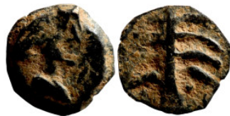
700 Antik coin bronze 9mm 0,66g Artificial sand patina