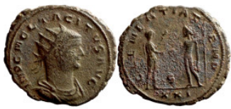
643 Roman Imperial coin 20mm 4,14g