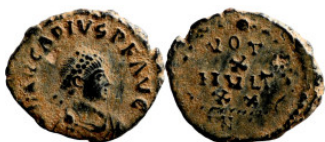
717 Antik coin bronze 11mm 0,96g