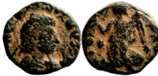
190 Antik coin 11mm 1,55g Artificial sand patina