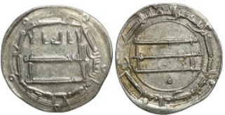
465 Islamic silver coin 23mm 2,97g