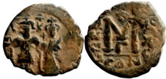
1091 Byzantine Empire coin 23mm 4,62g