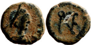
708 Antik coin bronze 8mm 0,80g Artificial sand patina