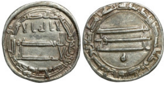
481 Islamic silver coin 21mm 2,95g