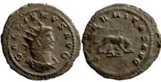
624 Roman Imperial coin 22mm 2,56g