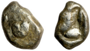
4 Greek silver coin 1-4 Century 16mm 4,19g