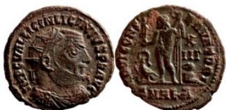
654 Roman Imperial coin 18mm 2,88g