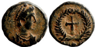
766 Roman Imperial coin 10mm 0,98g