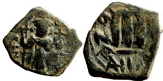
1093 Byzantine Empire coin 22mm 5,00g