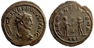
621 Roman Imperial coin 22mm 3,84g