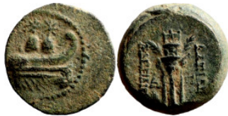
163 Greek bronze coin 1-4 Century 16mm 3,93g