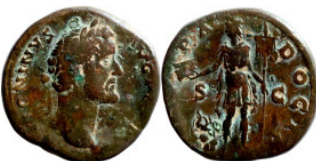
415 Sestertius bronze Roman Imperial 31mm 27,94g