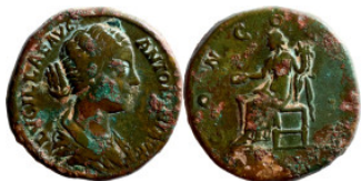
386 Sestertius bronze Roman Imperial 30mm 26,87g