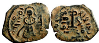
1004 Islamic coin 18mm 2,64g