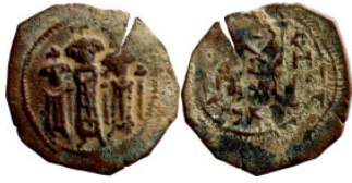
922 Byzantine Empire coin 25mm 3,59g