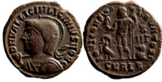
634 Roman Imperial coin 18mm 3,83g