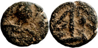
705 Antik coin bronze 8mm 0,61g Artificial sand patina