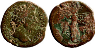
364 Sestertius bronze Roman Imperial 30mm 26,38g