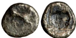
25 Greek silver coin 1-4 Century 7mm 0,36g