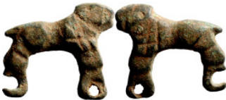
1023 Antiquities 25mm 2,70g