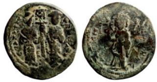
1043 Byzantine Empire coin 27mm 9,16g