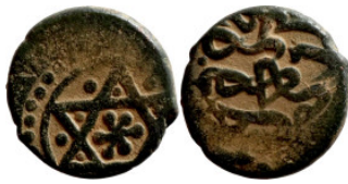
1212 Osman coin 17mm 2,64g Artificial sand patina