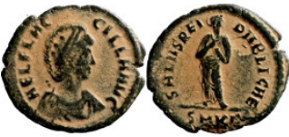
769 Roman Imperial coin 21mm 3,69g Artificial sand patina