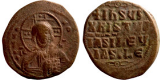
1048 Byzantine Empire coin 28mm 12,42g