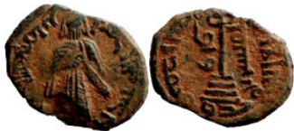
1143 Islamic coin 19mm 1,06g