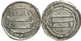
467 Islamic silver coin 23mm 2,97g