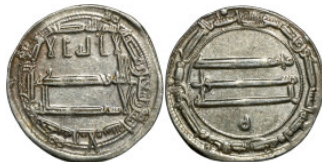
472 Islamic silver coin 21mm 2,97g