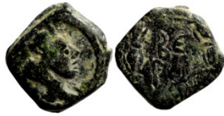
588 Roman Imperial coin 9mm 0,77g