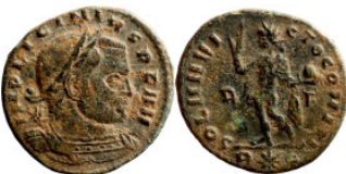
822 Roman Imperial coin 19mm 3,16g