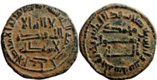
1172 Islamic coin 22mm 3,09g