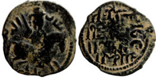
1251 Osman coin 21mm 2,87g