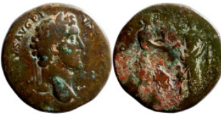
366 Sestertius bronze Roman Imperial 32mm 27,20g