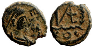
587 Roman Imperial coin 9mm 1,33g