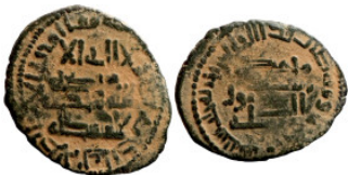
1173 Islamic coin 20mm 2,50g Artificial sand patina