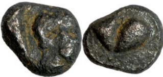
6 Greek silver coin 1-4 Century 10mm 1,69g