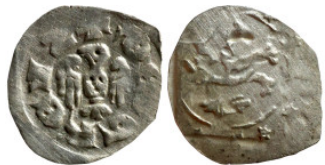
449 Rudolf von Habsburg, 1276-1281 Steiermark: Pfennig Graz or Oberzeirin 15mm 0,53g