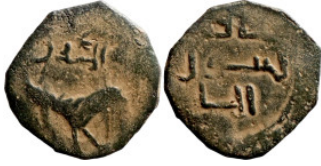
1132 Islamic coin 21mm 2,32g Artificial sand patina