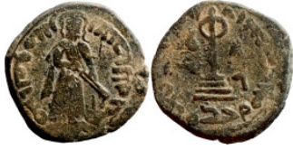
1111 Osman coin 21mm 2,13g