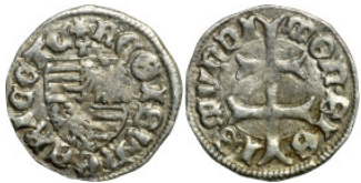
531 World silver coin 14mm 0,65g