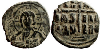
1058 Byzantine Empire coin 28mm 6,73g