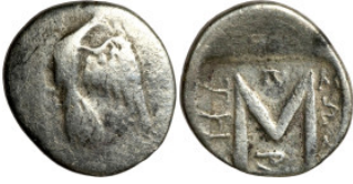
1 Byzantine Empire Silver coin 15mm 2,00g