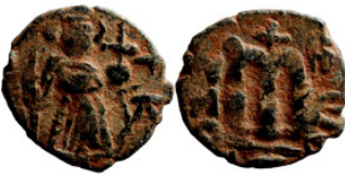
938 Byzantine Empire coin 22mm 4,28g