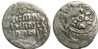
507 Osman coin 16mm 1,03g