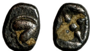
27 Greek silver coin 1-4 Century 7mm 0,39g