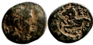
699 Antik coin bronze 10mm 1,40g Artificial sand patina