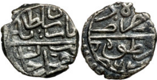
519 Osman coin 11mm 0,77g