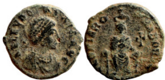
834 Roman Imperial coin 15mm 2,45g