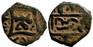
1221 Osman coin 14mm 1,71g Artificial sand patina