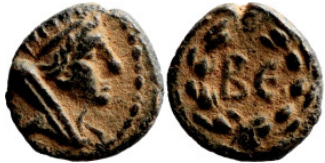
719 Antik coin bronze 9mm 0,78g Artificial sand patina