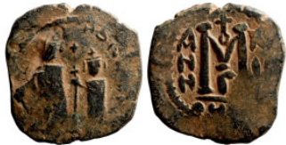
1045 Byzantine Empire coin 27mm 8,54g