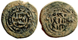
1167 Islamic coin 21mm 2,78g