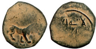
1134 Islamic coin 19mm 2,00g Artificial sand patina