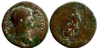
357 Sestertius bronze Roman Imperial 31mm 24,00g