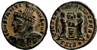
771 Roman Imperial coin 18mm 2,73g