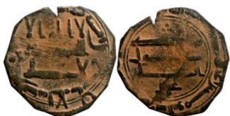
1166 Islamic coin 20mm 4,65g Artificial sand patina