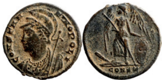
827 Roman Imperial coin 17mm 2,24g