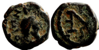
701 Antik coin bronze 9mm 0,75g Artificial sand patina