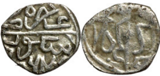
520 Osman coin 10mm 0,40g