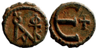
1102 Byzantine Empire coin 23mm 4,30g