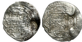
502 Osman coin 20mm 1,64g