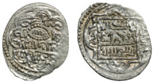
499 Osman coin 20mm 1,63g