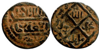
1116 Antik coin 17mm 2,80g