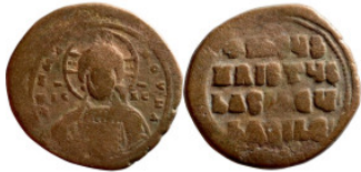
1035 Byzantine Empire coin 32mm 11,59g