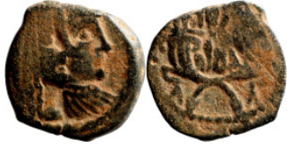
760 Roman Imperial coin 17mm 2,95g