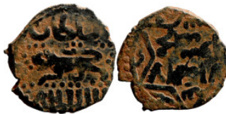
1151 Osman coin 16mm 2,94g