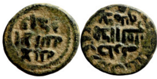
1204 Islamic coin 15mm 2,34g