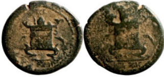
72 Greek bronze coin 1-4 Century 18mm 4,66g Artificial sand patina