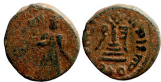
1263 Osman coin 16mm 2,84g