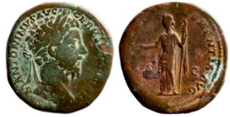
383 Sestertius bronze Roman Imperial 30mm 23,91g