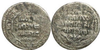
506 Osman coin 17mm 1,50g