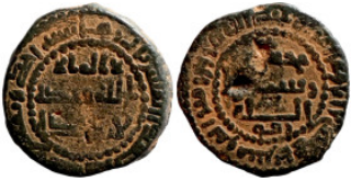
1190 Islamic coin 19mm 3,21g Artificial sand patina