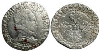
541 ½ Frank Henryk Walezy 1587 Lyon Poland - France 28mm 6,96g