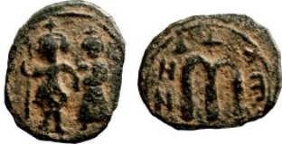
895 Byzantine Empire coin 22mm 3,10g Artificial sand patina