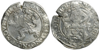
537 Niederlande, Friesland, Löwentaler 1576 40mm 27,00g