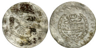
505 Osman coin 17mm 0,52g