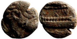
169 Greek bronze coin 1-4 Century 8mm 0,84g