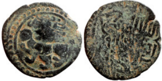
1133 Islamic coin 23mm 2,47g