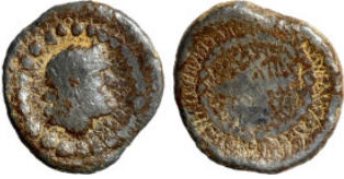
2 Greek silver coin 1-4 Century 14mm 1,94g