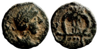
702 Antik coin bronze 9mm 0,70g Artificial sand patina