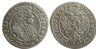
194 Haus Habsburg 3 Kreuzer 1703 Leopold I. (1657-1705) Prag 21mm 1,62g