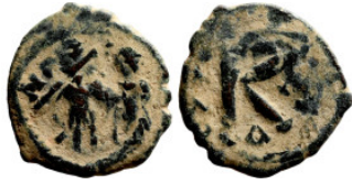
901 Byzantine Empire coin 19mm 1,41g