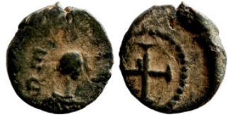
698 Antik coin bronze 10mm 0,66g Artificial sand patina