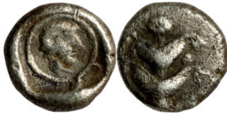
9 Greek silver coin 1-4 Century 8mm 0,67g