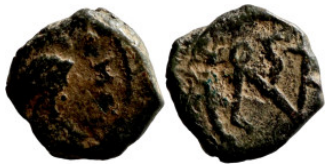
713 Antik coin bronze 8mm 0,71g Artificial sand patina