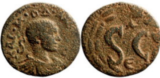
819 Roman Imperial coin 17mm 3,60g