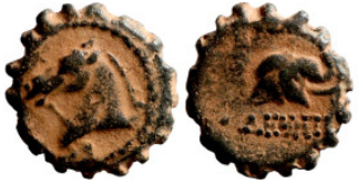
58 Greek bronze coin 1-4 Century 17mm 3,56g Artificial sand patina