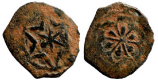
1219 Osman coin 15mm 2,62g