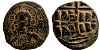
1059 Byzantine Empire coin 29mm 10,04g