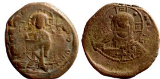
1061 Byzantine Empire coin 28mm 11,67g