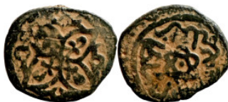
1215 Osman coin 16mm 1,81g Artificial sand patina