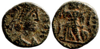
721 Antik coin bronze 9mm 0,92g