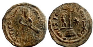
1003 Islamic coin 18mm 1,90g Artificial sand patina