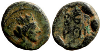
1127 Antik coin 10mm 0,60g