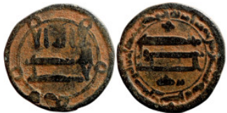
1163 Islamic coin 20mm 2,00g