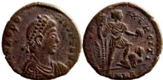
616 Roman Imperial coin 22mm 5,53g