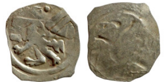
451 Albrecht I. 1282-1298 Pfennig o.J. Graz oder Oberzeiring 14mm 0,34g