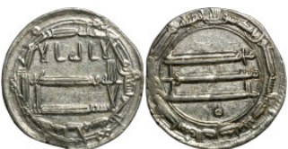
479 Islamic silver coin 21mm 2,95g