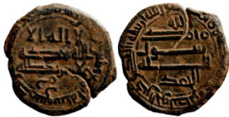
1183 Islamic coin 20mm 2,44g