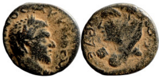
762 Roman Imperial coin 15mm 3,18g Artificial sand patina