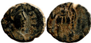
1129 Antik coin 9mm 0,75g