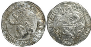
539 Niederlande, Friesland, Löwentaler 1593 40mm 27,16g