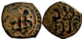
1117 Antik coin 18mm 2,06g