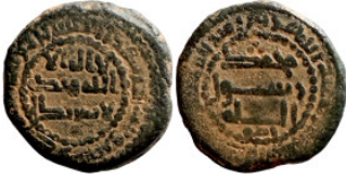
1195 Islamic coin 18mm 2,15g Artificial sand patina