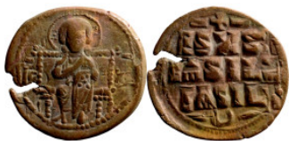
1038 Byzantine Empire coin 28mm 17,84g