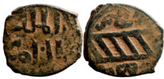
1120 Antik coin 15mm 3,85g