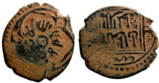
1232 Osman coin 14mm 0,53g