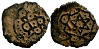
1218 Osman coin 18mm 0,84g Artificial sand patina