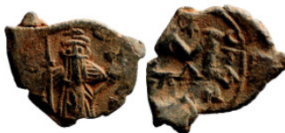
997 Byzantine Empire coin 15mm 2,19g