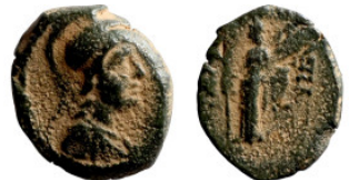
63 Greek bronze coin 1-4 Century 14mm 2,89g Artificial sand patina