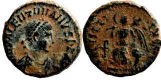
795 Roman Imperial coin 13mm 1,60g Artificial sand patina