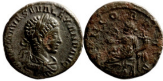
635 Roman Imperial coin 17mm 3,44g