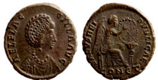
617 Roman Imperial coin 21mm 5,47g