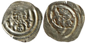
438 Austrian Medieval coin 18mm 0,58g