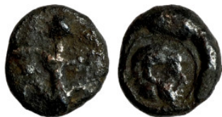
22 Greek silver coin 1-4 Century 6mm 0,32g