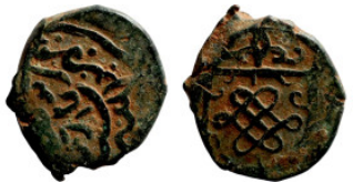
1264 Osman coin 15mm 2,14g