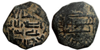
1162 Islamic coin 18mm 2,42g