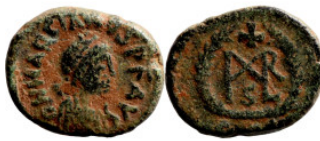
191 Antik coin 9mm 1,24g