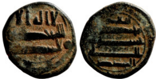
1199 Islamic coin 15mm 1,42g