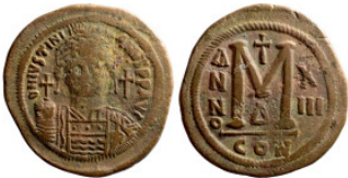
1052 Byzantine Empire coin 34mm 14,10g