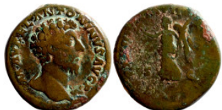
358 Sestertius bronze Roman Imperial 32mm 26,11g