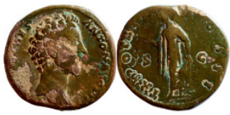
384 Sestertius bronze Roman Imperial 30mm 24,43g