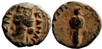
764 Roman Imperial coin 12mm 2,73g Artificial sand patina