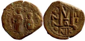
1055 Byzantine Empire coin 30mm 12,55g