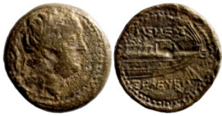
73 Greek bronze coin 1-4 Century 21mm 5,09g