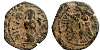
1145 Islamic coin 17mm 3,13g Artificial sand patina