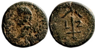
799 Roman Imperial coin 16mm 4,73g Artificial sand patina