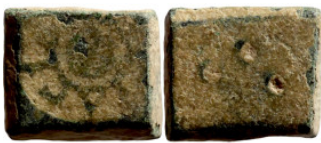
1022 Antiquities 27mm 11,56g