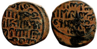
1181 Islamic coin 19mm 2,76g