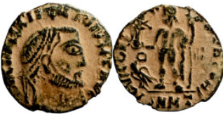
772 Roman Imperial coin 18mm 1,53g Artificial sand patina