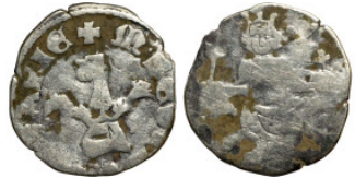
530 World silver coin 14mm 0,56g