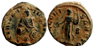
836 Galerius Valerius MAXIMINUS II. 305-313 Daia Follis 14mm 1,52g