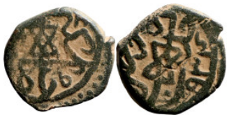
1235 Osman coin 13mm 1,48g Artificial sand patina