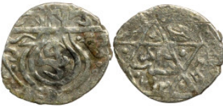
518 Osman coin 12mm 0,42g