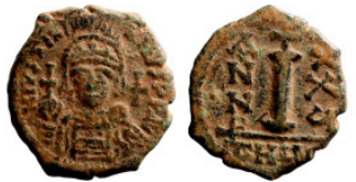
952 Byzantine Empire coin 18mm 3,59g