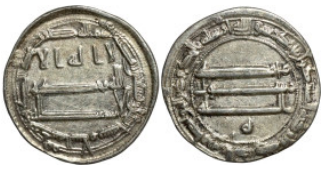
476 Islamic silver coin 21mm 2,90g