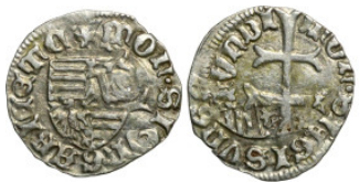
534 World silver coin 14mm 0,52g