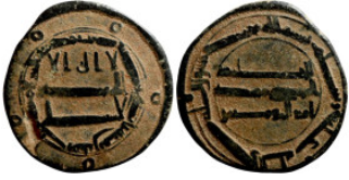
1174 Islamic coin 20mm 2,46g Artificial sand patina