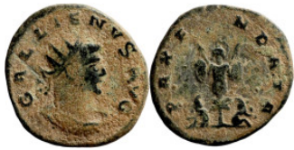
563 Roman Imperial coin 19mm 2,83g