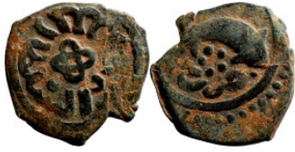
1118 Antik coin 16mm 1,49g