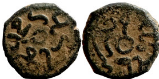
1150 Osman coin 16mm 1,55g Artificial sand patina