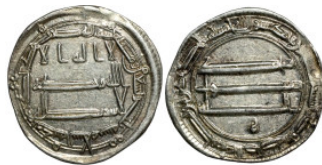
471 Islamic silver coin 22mm 3,00g