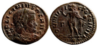
632 Roman Imperial coin 18mm 2,65g