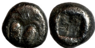
23 Greek silver coin 1-4 Century 7mm 0,70g