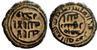
1198 Islamic coin 17mm 2,76g Artificial sand patina