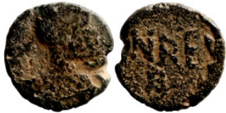
712 Antik coin bronze 8mm 0,64g Artificial sand patina