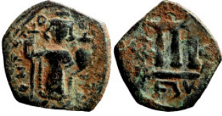
936 Byzantine Empire coin 21mm 2,65g