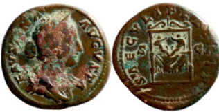
367 Sestertius bronze Roman Imperial 31mm 25,48g