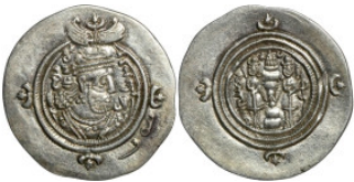
461 Sasanian silver drachm 31mm 4,11g