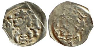
447 Austrian Medieval coin 15mm 0,43g