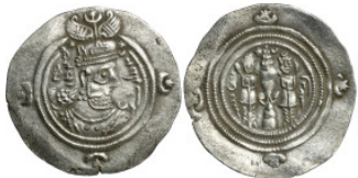
455 Sasanian silver drachm 31mm 3,83g