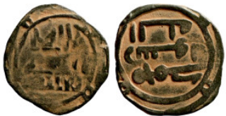
1193 Islamic coin 19mm 1,71g Artificial sand patina