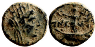
716 Antik coin bronze 12mm 1,58g