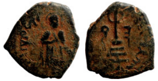
1114 Osman coin 18mm 1,97g