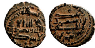
1207 Islamic coin 15mm 1,00g Artificial sand patina