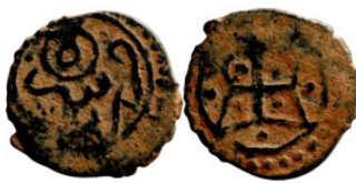
1214 Osman coin 16mm 2,42g