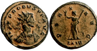
770 Roman Imperial coin 20mm 2,95g Artificial sand patina