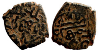
1220 Osman coin 15mm 1,15g