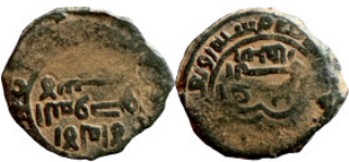
1171 Islamic coin 20mm 3,31g Artificial sand patina