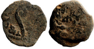
816 Roman Imperial coin 16mm 2,41g