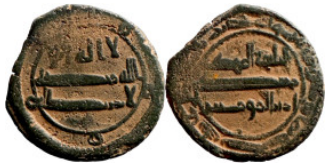
1191 Islamic coin 16mm 2,62g Artificial sand patina