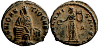
572 Roman Imperial coin 14mm 1,79g