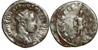
487 Roman silver coin 21mm 3,49g