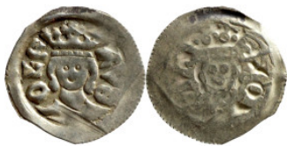
443 RUDOLF VON HABSBURG 1276-1281 - GRAZER PFENNIG Austria 16mm 0,42g