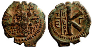
1044 Byzantine Empire coin 28mm 10,58g