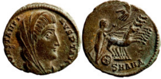
830 Roman Imperial coin 14mm 1,36g