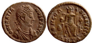
651 Roman Imperial coin 18mm 3,09g