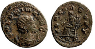
623 Roman Imperial coin 22mm 3,51g