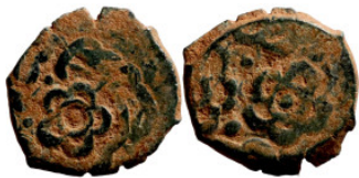
1123 Antik coin 13mm 0,65g