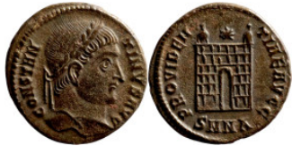
649 Roman Imperial coin 19mm 2,56g