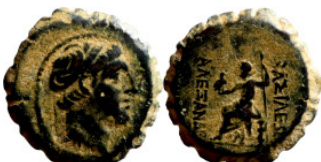
173 Greek bronze coin 1-4 Century 19mm 6,38g