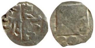
448 Austrian Medieval coin 15mm 0,57g