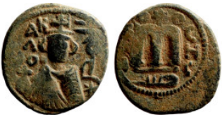
942 Byzantine Empire coin 19mm 4,25g