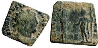
823 Roman Imperial coin 16mm 1,40g