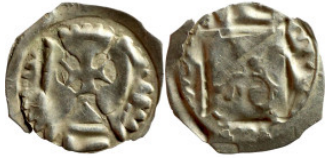
452 Austrian Medieval coin 13mm 0,30g