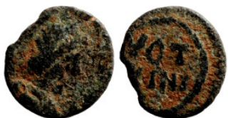
1131 Antik coin 22mm 2,63g