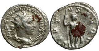
486 Volusian Antoninianus 251-253 AD Silver 20mm 2,92g