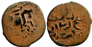
1136 Islamic coin 18mm 2,43g