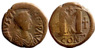
1039 Byzantine Empire coin 30mm 10,70g