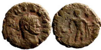
801 Roman Imperial coin 18mm 5,68g Artificial sand patina