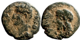
800 Roman Imperial coin 20mm 4,84g Artificial sand patina