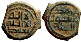
1205 Islamic coin 16mm 1,04g