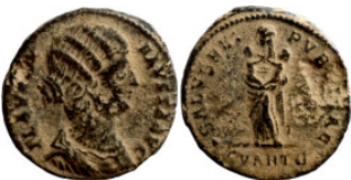
821 Roman Imperial coin 18mm 2,34g