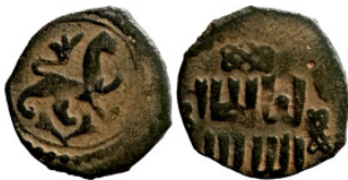
1200 Islamic coin 17mm 0,48g Artificial sand patina