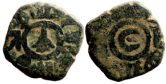
1259 Osman coin 17mm 1,76g