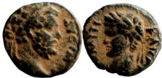
763 Roman Imperial coin 15mm 1,84g Artificial sand patina