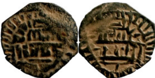
1201 Islamic coin 17mm 1,94g Artificial sand patina