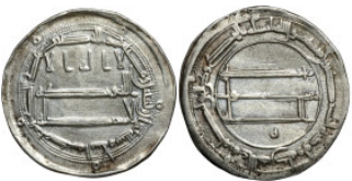
464 Islamic silver coin 23mm 2,96g