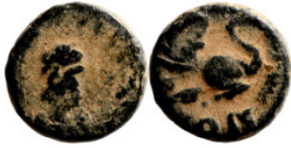
697 Antik coin bronze 9mm 1,05g Artificial sand patina