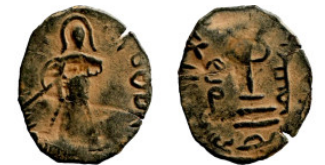
1144 Islamic coin 22mm 2,32g Artificial sand patina