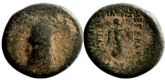
59 Greek bronze coin 1-4 Century 14mm 2,70g Artificial sand patina