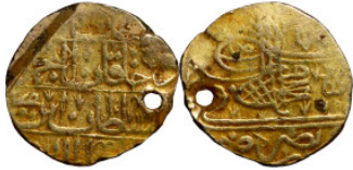
1105 Osman coin 19mm 3,87g