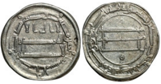
462 Islamic silver coin 23mm 2,94g