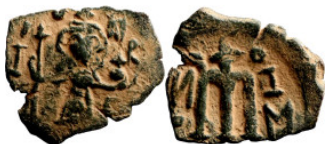
970 Byzantine Empire coin 22mm 2,90g