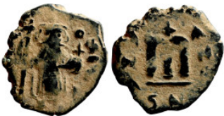
933 Byzantine Empire coin 22mm 4,17g