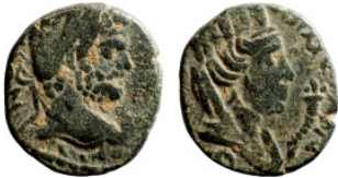
761 Roman Imperial coin 17mm 3,46g