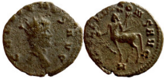
648 Roman Imperial coin 19mm 2,72g