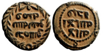
727 Islamic coin 17mm 2,66g Artificial sand patina