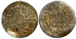
1107 Osman coin 16mm 2,24g