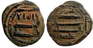
1189 Islamic coin 18mm 4,48g