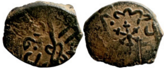
1217 Osman coin 16mm 0,84g Artificial sand patina