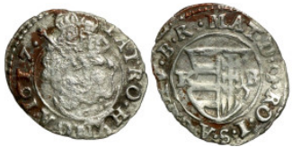
532 World silver coin 13mm 0,46g