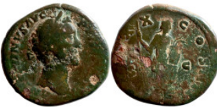
412 Sestertius bronze Roman Imperial 31mm 23,60g