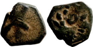
709 Antik coin bronze 8mm 0,55g Artificial sand patina