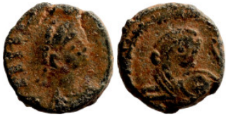
581 Roman Imperial coin 10mm 1,15g