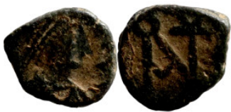
715 Antik coin bronze 7mm 0,60g