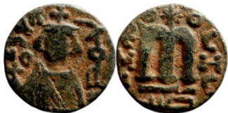
900 Byzantine Empire coin 18mm 2,51g