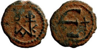
957 Byzantine Empire coin 14mm 2,08g