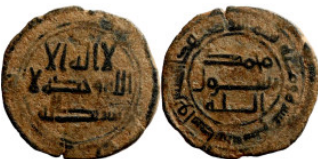
1248 Osman coin 18mm 3,80g