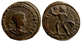
650 Roman Imperial coin 19mm 2,09g