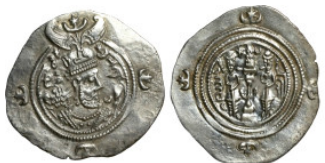
457 Sasanian silver drachm 29mm 3,96g