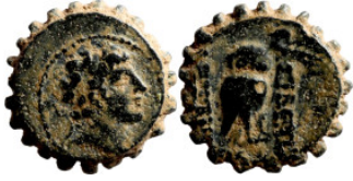
57 Greek bronze coin 1-4 Century 16mm 3,66g