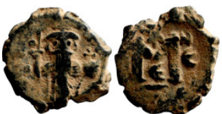
955 Byzantine Empire coin 16mm 2,20g