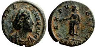
837 Roman Imperial coin 15mm 1,56g