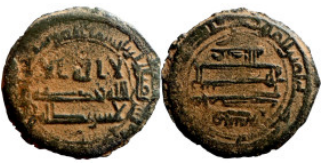
1179 Islamic coin 20mm 3,18g Artificial sand patina