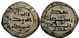
729 Islamic coin 19mm 1,13g Artificial sand patina