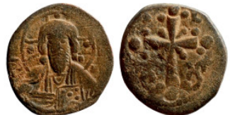
1096 Byzantine Empire coin 20mm 3,52g