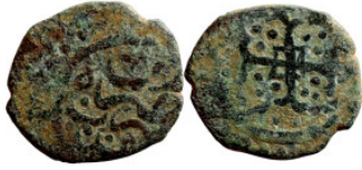
1216 Osman coin 17mm 2,34g