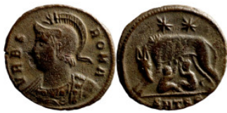
636 Roman Imperial coin 17mm 2,10g