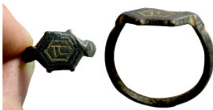
1026 Antiquities 22mm 7,27g