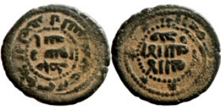
1169 Islamic coin 20mm 2,74g Artificial sand patina