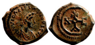
1000 Byzantine Empire coin 15mm 2,00g