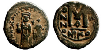
966 Byzantine Empire coin 23mm 6,27g