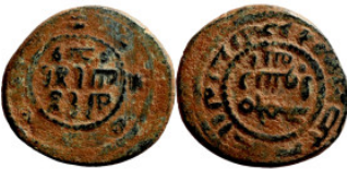
1249 Osman coin 19mm 2,86g