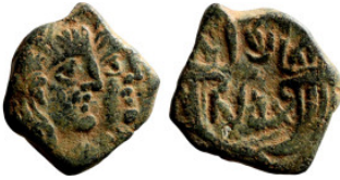
817 Roman Imperial coin 16mm 2,48g