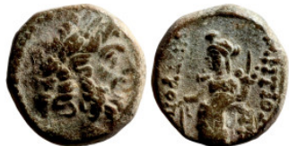
165 Greek bronze coin 1-4 Century 15mm 5,00g