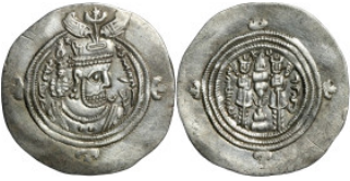
460 Sasanian silver drachm 30mm 4,00g