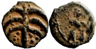
720 Antik coin bronze 9mm 0,50g Artificial sand patina