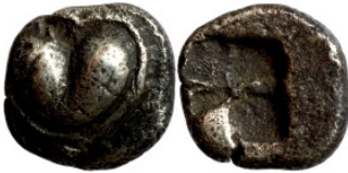
16 Greek silver coin 1-4 Century 7mm 0,60g