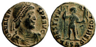
638 Roman Imperial coin 17mm 2,13g