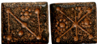
542 Antiquities 13mm 3,81g Artificial sand patina