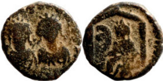
961 Byzantine Empire coin 30mm 11,64g