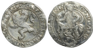
538 Niederlande, Friesland, Löwentaler 1576 41mm 27,00g