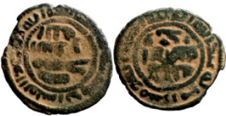
1176 Islamic coin 21mm 3,60g Artificial sand patina