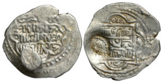
500 Osman coin 20mm 1,59g