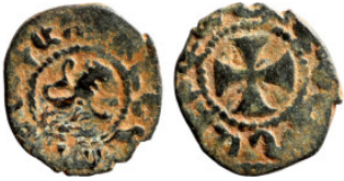
495 Medieval coin 15mm 1,20g