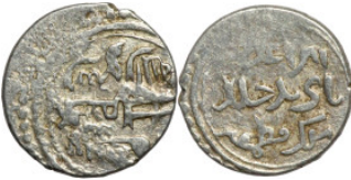
516 Osman coin 11mm 0,87g