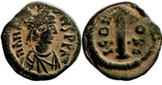
906 Byzantine Empire coin 14mm 1,96g Artificial sand patina