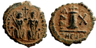
951 Byzantine Empire coin 20mm 4,43g