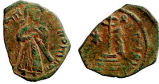
1112 Osman coin 20mm 1,44g