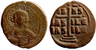
1084 Byzantine Empire coin 28mm 6,93g