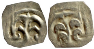
440 Austrian Medieval coin 15mm 0,30g