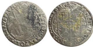
193 ¼ Taler (Ort) 1623 Sigismund III Wasa Silber Poland 29mm 5,89g