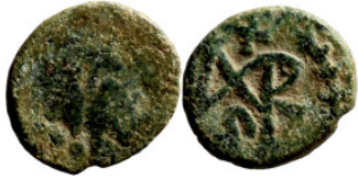
711 Antik coin bronze 8mm 0,49g