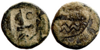
170 Sidon. Ba'alšillem II, circa 401-366 BC. 1/16 Shekel silver Phoenician galley left, waves below. Rev. Persian king or hero, holding dagger in his right hand, standing right, fighting lion standing left on its hind legs; all within incuse square. 9mm 0,65g