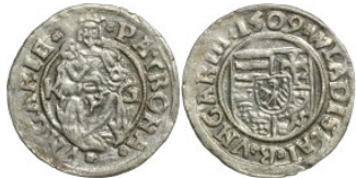
533 World silver coin 15mm 0,53g