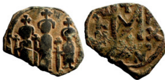
928 Byzantine Empire coin 19mm 3,33g