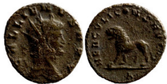
645 Roman Imperial coin 19mm 2,77g