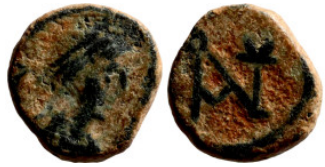
714 Antik coin bronze 8mm 0,68g