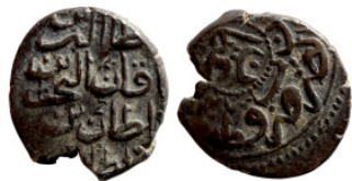
1153 Osman coin 14mm 2,03g