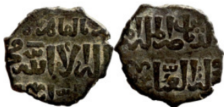
1110 Osman coin 20mm 2,70g