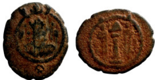
1124 Antik coin 11mm 1,84g