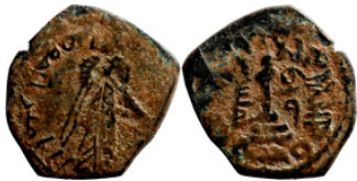
1141 Islamic coin 21mm 2,66g