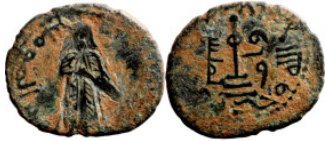
1140 Islamic coin 18mm 1,88g