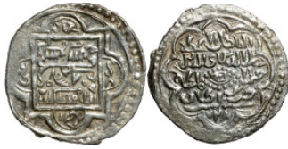
497 Osman coin 18mm 1,61g