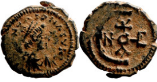
905 Byzantine Empire coin 16mm 1,48g