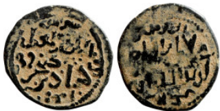
1103 Osman coin 21mm 3,92g