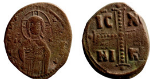
1068 Byzantine Empire coin 27mm 8,26g