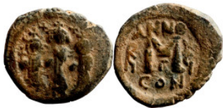
1095 Byzantine Empire coin 21mm 3,72g