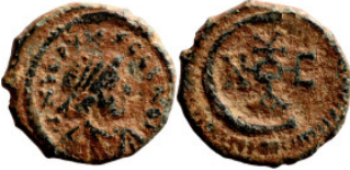
958 Byzantine Empire coin 13mm 2,74g