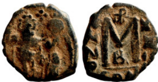
927 Byzantine Empire coin 21mm 4,00g