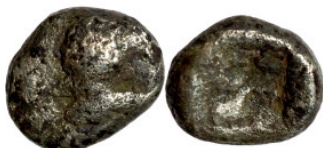
28 Greek silver coin 1-4 Century 6mm 0,36g