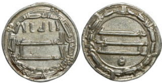
475 Islamic silver coin 21mm 2,92g