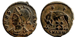
835 Roman Imperial coin 15mm 1,94g