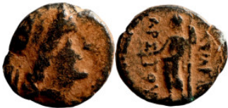
60 Greek bronze coin 1-4 Century 14mm 2,37g Artificial sand patina