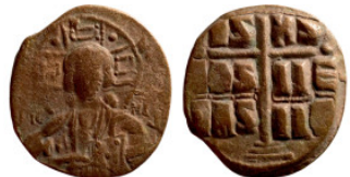
1047 Byzantine Empire coin 28mm 7,18g