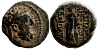
164 Antiochos IX Eusebes Philopator (Kyzikenos), 114/3-95 BC. Ae Antioch on the Orontes. Diademed head of Antiochus IX right, with short, curly beard. Rev. ΒΑΣΙΛΕΩΣ ΑΝΤΙΟΧΟΥ ΦΙΛΟΠΑΤΟΡΟΣ Athena standing left, holding Nike facing right and offering wreath, left hand resting on grounded shield. SC 2368. 17mm 5,18g