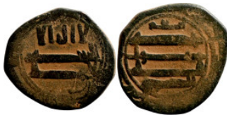
1187 Islamic coin 18mm 2,30g Artificial sand patina