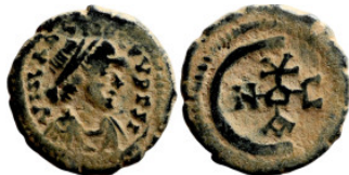
998 Byzantine Empire coin 14mm 1,90g