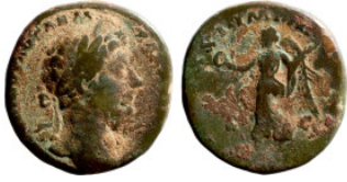
410 Sestertius bronze Roman Imperial 30mm 24,40g