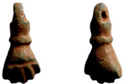
1025 Antiquities 18mm 3,17g