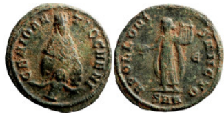
832 Galerius Valerius MAXIMINUS II. 305-313 Daia Follis 16mm 1,29g