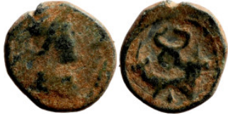
585 Roman Imperial coin 9mm 0,84g