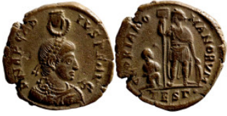
613 Roman Imperial coin 22mm 5,03g