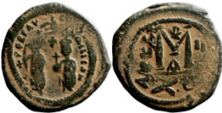
962 Byzantine Empire coin 28mm 10,92g