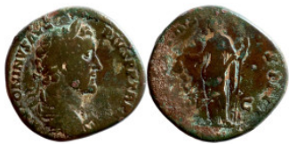
385 Sestertius bronze Roman Imperial 31mm 24,40g