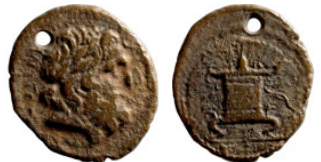
77 Greek bronze coin 1-4 Century 19mm 4,19g