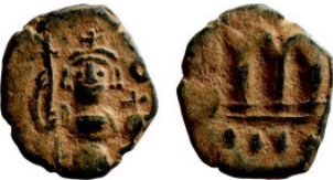
940 Byzantine Empire coin 21mm 3,14g