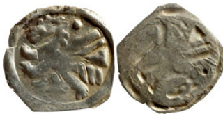
444 Albrecht I. 1282-1298 Pfennig o.J. Graz oder Oberzeiring 15mm 0,39g