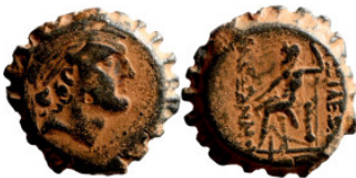
75 Greek bronze coin 1-4 Century 20mm 7.86g Artificial sand patina