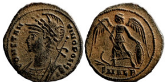
731 Roman Imperial coin 18mm 2,23g