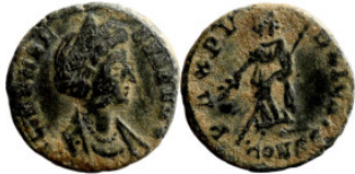
831 Roman Imperial coin 14mm 1,60g