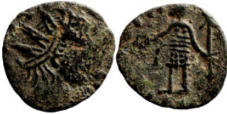
1126 Antik coin 10mm 1,09g