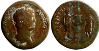
362 Sestertius bronze Roman Imperial 32mm 28,00g