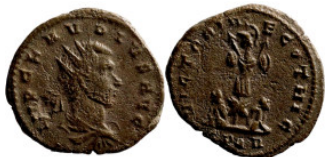
646 Roman Imperial coin 18mm 2,68g