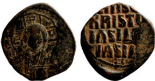
1067 Byzantine Empire coin 27mm 8,10g