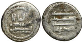
496 Osman coin 18mm 4,67g