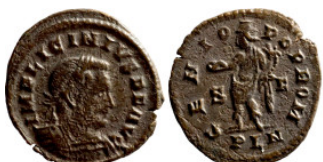
639 Roman Imperial coin 20mm 2,40g