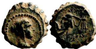
166 Greek bronze coin 1-4 Century 15mm 3,83g