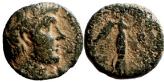
797 Roman Imperial coin 17mm 4,74g Artificial sand patina