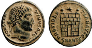
565 Roman Imperial coin 19mm 3,27g