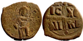
1046 Byzantine Empire coin 29mm 9,59g