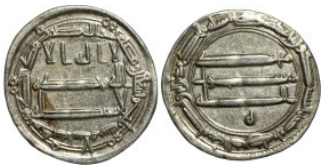
478 Islamic silver coin 22mm 2,95g