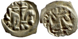
445 Austrian Medieval coin 14mm 0,26g