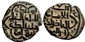
728 Islamic coin 18mm 2,86g Artificial sand patina