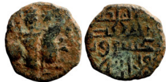
1108 Osman coin 16mm 1,00g