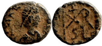
725 Antik coin bronze 8mm 0,85g Artificial sand patina