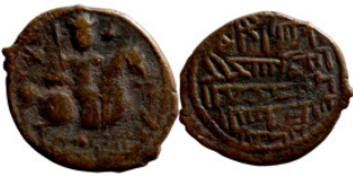
1246 Osman coin 20mm 3,29g