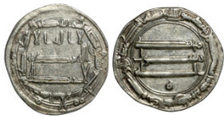
485 Islamic silver coin 22mm 3,00g