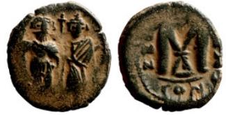
967 Byzantine Empire coin 20mm 6,73g