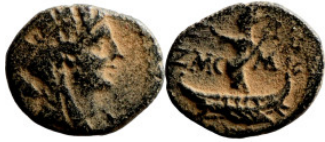
718 Antik coin bronze 11mm 1,57g Artificial sand patina