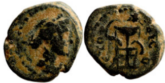
559 Roman Imperial coin 14mm 2,82g