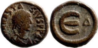
960 Byzantine Empire coin 12mm 1,57g