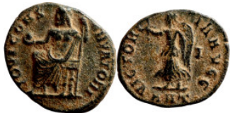
833 Roman Imperial coin 14mm 1,48g