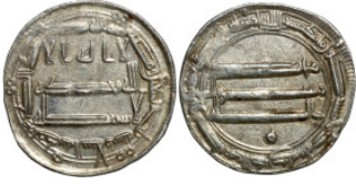
480 Islamic silver coin 21mm 3,00g