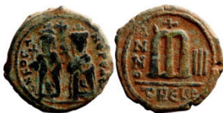
994 Byzantine Empire coin 21mm 4,07g