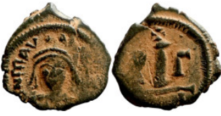
903 Byzantine Empire coin 16mm 1,56g Artificial sand patina