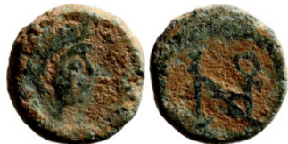
703 Antik coin bronze 8mm 1,00g Artificial sand patina