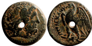
81 Greek bronze coin 1-4 Century 18mm 4,00g