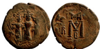
1014 Byzantine Empire Silver coin 23mm 5,11g