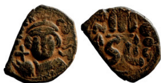
1015 Byzantine Empire Silver coin 22mm 4,67g