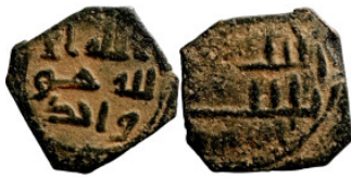
1206 Islamic coin 17mm 2,77g Artificial sand patina