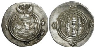
456 Sasanian silver drachm 30mm 4,19g