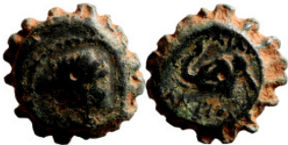
62 Greek bronze coin 1-4 Century 14mm 3,57g