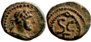
580 Roman Imperial coin 9mm 1,28g