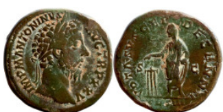
388 Sestertius bronze Roman Imperial 30mm 27,50g