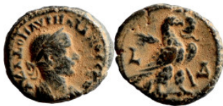
590 Roman Imperial coin 19mm 9,38g Artificial sand patina