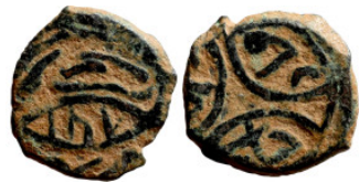
1234 Osman coin 15mm 2,60g