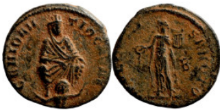
573 Roman Imperial coin 14mm 1,52g