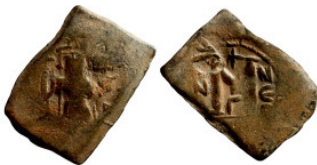
1088 Byzantine Empire coin 26mm 5,56g