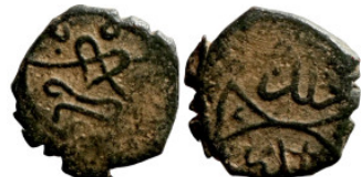
1159 Osman coin 12mm 0,79g