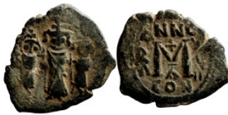
926 Byzantine Empire coin 23mm 6,56g