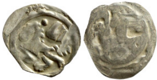
441 Albrecht I. 1282-1298 Pfennig o.J. Graz oder Oberzeiring 16mm 0,48g