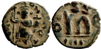
932 Byzantine Empire coin 23mm 3,77g