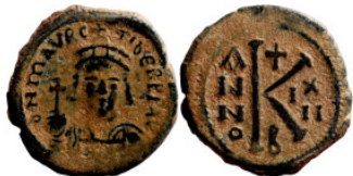
935 Byzantine Empire coin 21mm 3,50g