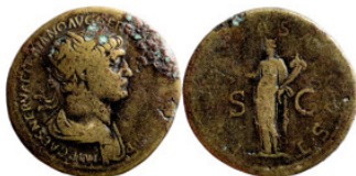
339 Dupondius bronze Roman Imperial 28mm 10,59g