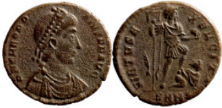
614 Roman Imperial coin 21mm 5,68g