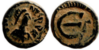
579 Roman Imperial coin 12mm 2,25g