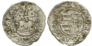
535 World silver coin 14mm 0,51g