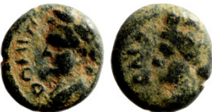
765 Roman Imperial coin 12mm 2,36g