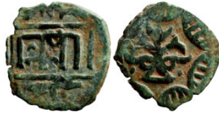
1210 Osman coin 16mm 3,06g