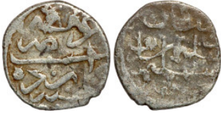
515 Osman coin 11mm 0,68g