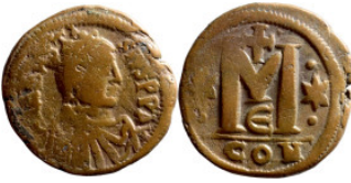
1050 Byzantine Empire coin 33mm 12,13g