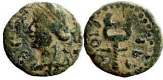
333 Roman Imperial coin 13mm 1,54g