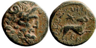
78 Greek bronze coin 1-4 Century 18mm 6,06g