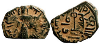
1139 Islamic coin 18mm 3,25g Artificial sand patina