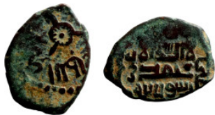
1262 Osman coin 13mm 1,59g