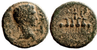
798 Roman Imperial coin 19mm 4,46g Artificial sand patina