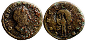
354 As bronze Roman Imperial 23mm 8,52g