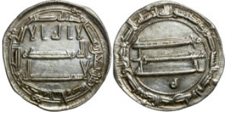
473 Islamic silver coin 21mm 3,00g