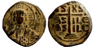
1060 Byzantine Empire coin 29mm 9,96g Artificial sand patina