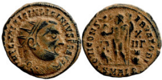
567 Roman Imperial coin 19mm 3,08g