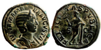
360 Sestertius bronze Roman Imperial 30mm 22,21g