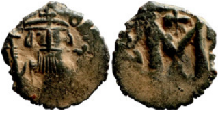
904 Byzantine Empire coin 16mm 1,87g Artificial sand patina