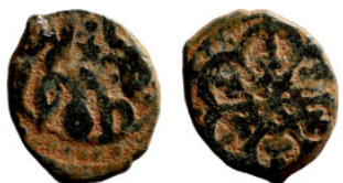
1236 Osman coin 14mm 1,64g