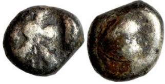
8 Greek silver coin 1-4 Century 10mm 1,93g