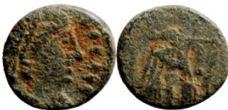
1130 Antik coin 9mm 0,49g