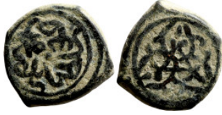
1230 Osman coin 13mm 1,78g