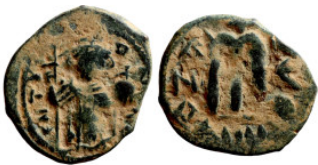
934 Byzantine Empire coin 21mm 4,59g