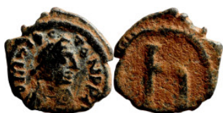
1018 Byzantine Empire Silver coin 13mm 14,76g