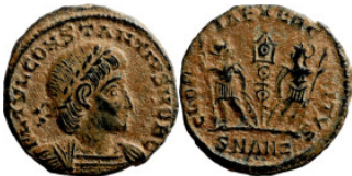
575 Roman Imperial coin 15mm 1,75g