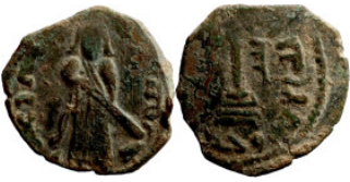
1254 Osman coin 16mm 5,11g