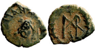
706 Antik coin bronze 10mm 0,57g Artificial sand patina