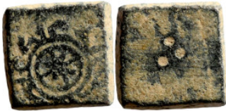
1021 Antiquities 8mm 1,47g