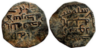
1194 Islamic coin 19mm 4,68g