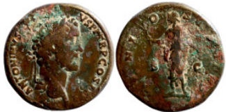
355 Sestertius bronze Roman Imperial 31mm 26,14g