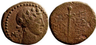
74 Greek bronze coin 1-4 Century 19mm 6,16g