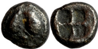
19 Greek silver coin 1-4 Century 6mm 0,51g