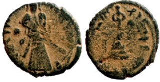
1146 Islamic coin 17mm 1,63g Artificial sand patina