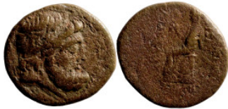
79 Pseudo-autonomous issue, time of Augustus, 27 BC-14 AD. Ae P. Quinctilius Varus, governor under Augustus 7/6 BC. Laureate head of Zeus to right. Rev. ANTIOXEΩN EΠI OYAPOY / ÇK Tyche of Antioch seated to right on throne, holding two grain ears in her right hand; below, river-god Orontes swimming right. McAlee 86; RPC I 4245. 18mm 4,60g