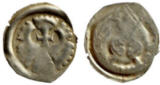
439 Austrian Medieval coin 15mm 0,45g