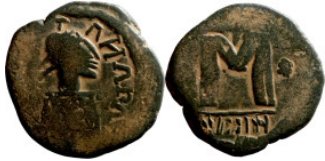
965 Byzantine Empire coin 27mm 9,77g