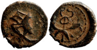
839 Roman Imperial coin 11mm 1,00g