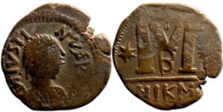
843 Byzantine Empire coin 31mm 17,28g