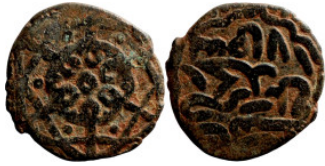
1119 Antik coin 16mm 3,39g