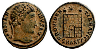
569 Roman Imperial coin 18mm 3,46g