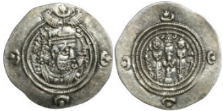
453 Sasanian silver drachm 31mm 3,88g