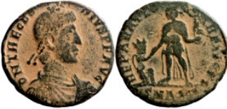
768 Roman Imperial coin 21mm 5,09g Artificial sand patina