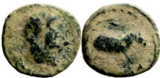
584 Roman Imperial coin 10mm 0,93g