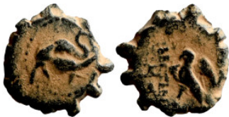
61 Greek bronze coin 1-4 Century 15mm 2,78g Artificial sand patina