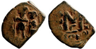
930 Byzantine Empire coin 21mm 4,34g