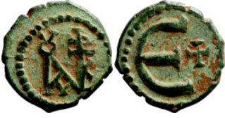
907 Byzantine Empire coin 13mm 1,75g