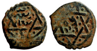
1253 Osman coin 19mm 2,70g