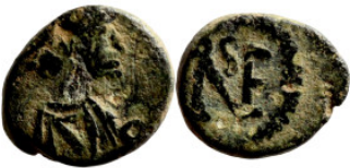
707 Antik coin bronze 7mm 0,81g Artificial sand patina