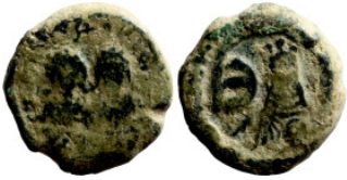
959 Byzantine Empire coin 12mm 2,91g