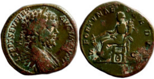
365 Sestertius bronze Roman Imperial 30mm 23,85g