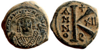
950 Byzantine Empire coin 19mm 2,22g