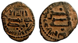
1184 Islamic coin 18mm 2,27g Artificial sand patina