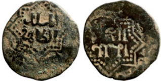
1244 Osman coin 23mm 3,26g Artificial sand patina