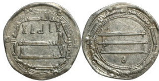
468 Islamic silver coin 22mm 2,98g