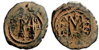
1036 Byzantine Empire coin 29mm 9,25g