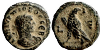
591 Roman Imperial coin 19mm 7,27g Artificial sand patina