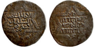
1252 Osman coin 19mm 2,77g