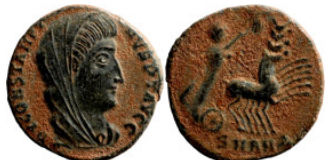
829 Roman Imperial coin 15mm 1,42g