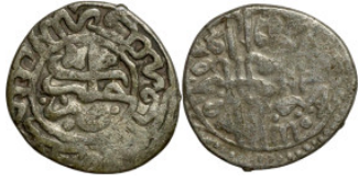
1104 Osman coin 18mm 2,31g