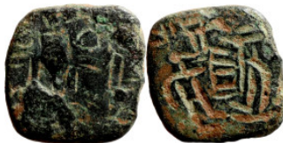
1152 Osman coin 16mm 3,08g