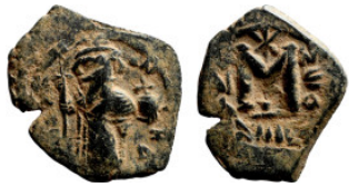
896 Byzantine Empire coin 18mm 2,43g