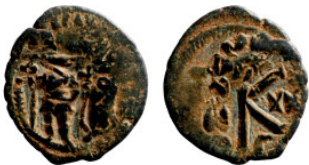
1087 Byzantine Empire coin 28mm 3,69g