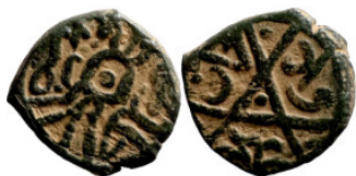
1158 Osman coin 13mm 1,11g