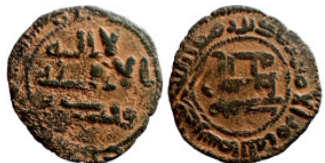
1164 Islamic coin 22mm 3,22g Artificial sand patina