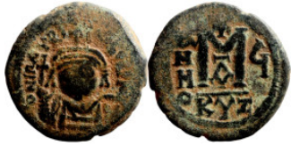
1090 Byzantine Empire coin 23mm 6,04g