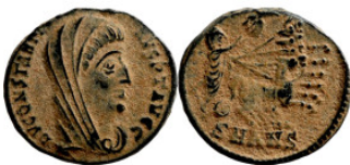
577 Roman Imperial coin 13mm 1,73g