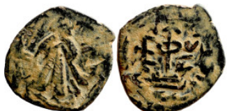
1002 Islamic coin 20mm 2,46g