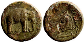
76 Greek bronze coin 1-4 Century 20mm 8,62g