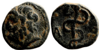
167 Greek bronze coin 1-4 Century 13mm 2,36g