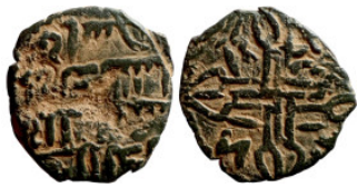
1177 Islamic coin 23mm 5,16g Artificial sand patina