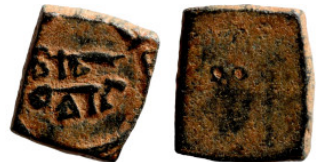
724 Antiquities 9mm 0,97g