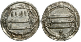
482 Islamic silver coin 21mm 3,00g