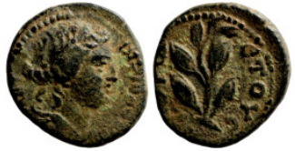
560 Roman Imperial coin 14mm 2,54g