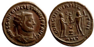
629 Roman Imperial coin 20mm 3,12g