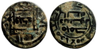
1170 Islamic coin 21mm 3,78g