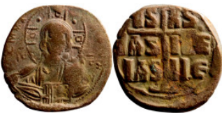
1054 Byzantine Empire coin 28mm 10,81g