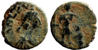
841 Roman Imperial coin 10mm 0,59g