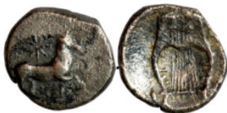
24 Greek silver coin 1-4 Century 8mm 0,45g