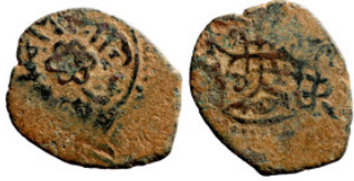
1209 Osman coin 17mm 1,81g