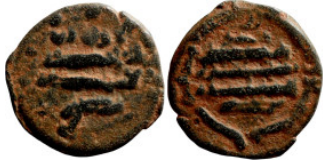
1202 Islamic coin 15mm 2,00g