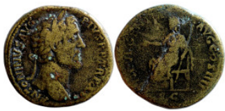
356 Sestertius bronze Roman Imperial 30mm 25,64g