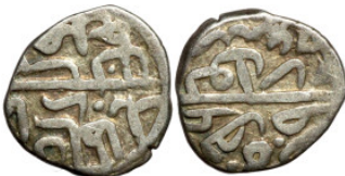
521 Osman coin 10mm 0,67g