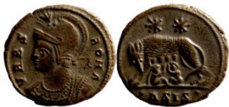
653 Roman Imperial coin 17mm 2,65g