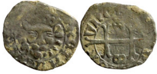
529 World silver coin 13mm 0,72g