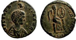
571 Roman Imperial coin 18mm 2,45g