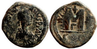
1057 Byzantine Empire coin 27mm 10,06g