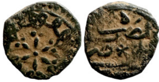
1231 Osman coin 15mm 1,18g Artificial sand patina