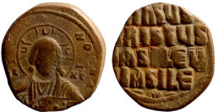
1066 Byzantine Empire coin 28mm 8,74g