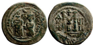
993 Byzantine Empire coin 27mm 9,77g