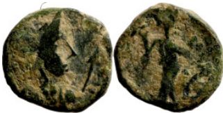
583 Roman Imperial coin 9mm 0,70g