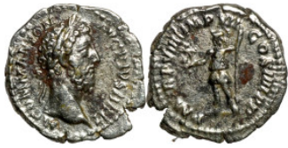
490 Antoninus Pius. A.D. 138-161. AE Denarius Silver 19mm 2,76g