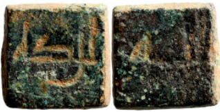
818 Roman Imperial coin 10mm 2,57g