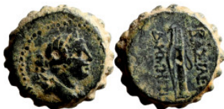
82 Greek bronze coin 1-4 Century 18mm 8,21g