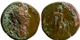
416 Sestertius bronze Roman Imperial 32mm 28,18g