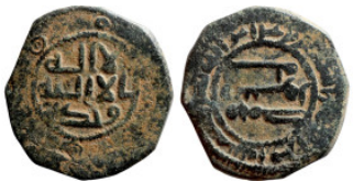
1178 Islamic coin 22mm 3,66g