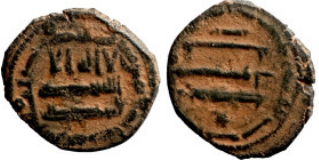
1196 Islamic coin 16mm 2,50g Artificial sand patina