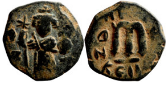
1097 Byzantine Empire coin 19mm 3,12g