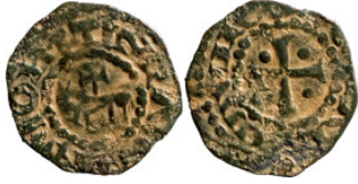
494 Medieval coin 15mm 0,49g