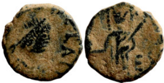
582 Roman Imperial coin 9mm 0,70g