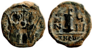
1100 Byzantine Empire coin 15mm 2,10g