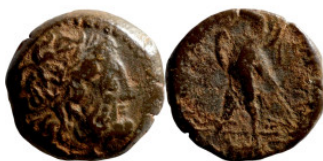
84 Greek bronze coin 1-4 Century 16mm 4,50g