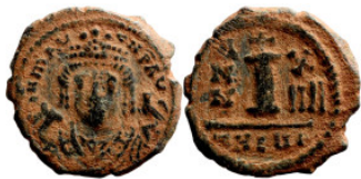
899 Byzantine Empire coin 16mm 2,08g