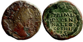
382 Sestertius bronze Roman Imperial 29mm 24,06g