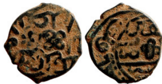
1213 Osman coin 15mm 1,59g