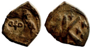
1099 Byzantine Empire coin 17mm 2,72g