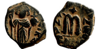
1094 Byzantine Empire coin 19mm 5,06g