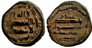
1197 Islamic coin 18mm 3,51g