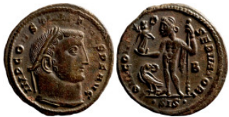
615 Roman Imperial coin 21mm 3,25g