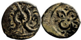
1122 Antik coin 13mm 1,40g