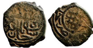
1148 Osman coin 15mm 1,77g Artificial sand patina