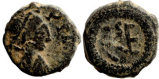
586 Roman Imperial coin 9mm 1,49g