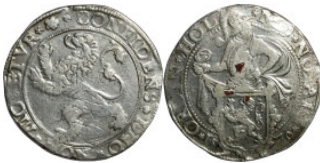
540 Niederlande, Friesland, Löwentaler 1576 40mm 25,27g