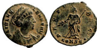
576 Roman Imperial coin 15mm 1,55g