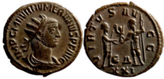
627 Roman Imperial coin 19mm 3,62g