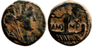
1125 Antik coin 12mm 0,58g