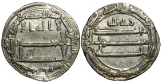
484 Islamic silver coin 20mm 2,94g