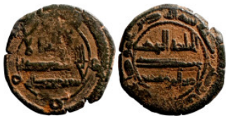
1185 Islamic coin 18mm 3,41g Artificial sand patina