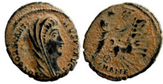
826 Roman Imperial coin 16mm 1,60g