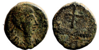
723 Antik coin bronze 9mm 0,70g