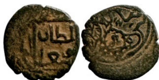
1208 Osman coin 21mm 2,46g Artificial sand patina