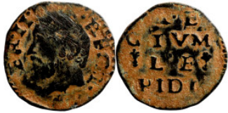
824 Roman Imperial coin 14mm 1,22g