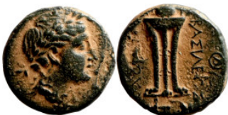
174 Greek bronze coin 1-4 Century 17mm 6,09g Artificial sand patina