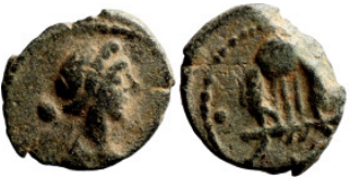
842 Roman Imperial coin 9mm 0,53g