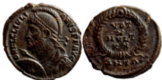
633 Roman Imperial coin 18mm 3,27g