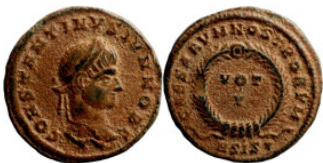
568 Roman Imperial coin 18mm 2,94g