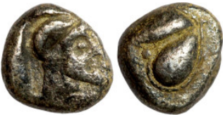
5 Greek silver coin 1-4 Century 9mm 1,83g