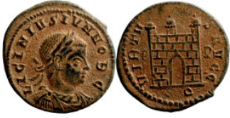
564 Roman Imperial coin 18mm 3,14g