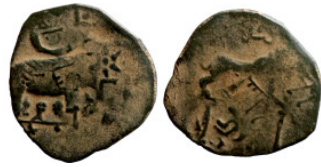
1135 Islamic coin 19mm 3,47g Artificial sand patina