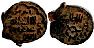
1260 Osman coin 16mm 1,59g