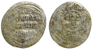
498 Osman coin 19mm 1,39g