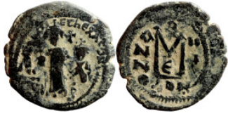
1056 Byzantine Empire coin 29mm 15,14g