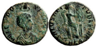
825 Roman Imperial coin 15mm 2,43g