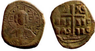
1083 Byzantine Empire coin 26mm 8,37g