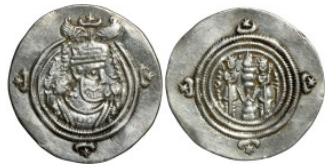
454 Sasanian silver drachm 32mm 3,65g