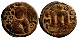
953 Byzantine Empire coin 20mm 3,79g