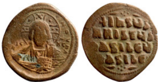
1053 Byzantine Empire coin 29mm 10,43g