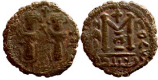
894 Byzantine Empire coin 20mm 1,58g