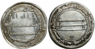
463 Islamic silver coin 24mm 2,95g