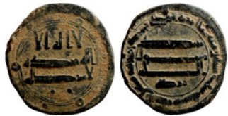
1182 Islamic coin 19mm 2,51g