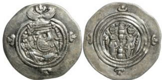
458 Sasanian silver drachm 30mm 4,20g