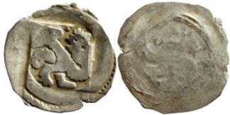
446 Austrian Medieval coin 16mm 0,73g