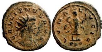
562 Roman Imperial coin 20mm 4,04g