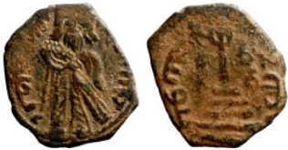
1115 Osman coin 18mm 2,06g