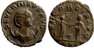
620 Roman Imperial coin 21mm 3,45g