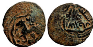
1138 Islamic coin 17mm 2,95g