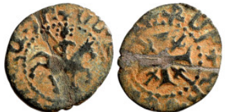
493 Medieval coin 18mm 1,59g