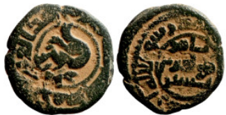
1192 Islamic coin 17mm 1,67g Artificial sand patina