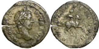
488 Antoninus Pius. A.D. 138-161. AE Antoninianus 20mm 2,58g