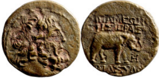
71 Greek bronze coin 1-4 Century 21mm 6,28g