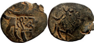
1247 Osman coin 19mm 2,78g Artificial sand patina