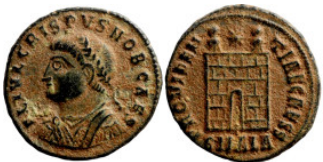
570 Roman Imperial coin 18mm 3,00g