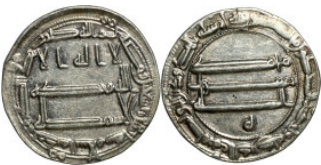
477 Islamic silver coin 20mm 2,95g