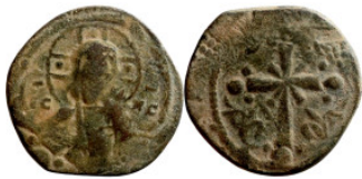
1092 Byzantine Empire coin 21mm 4,95g Artificial sand patina