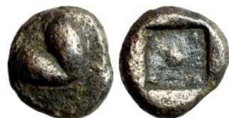
13 Greek silver coin 1-4 Century 7mm 0,74g