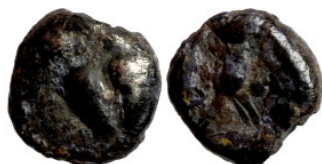
14 Greek silver coin 1-4 Century 8mm 0,64g