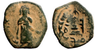
1142 Islamic coin 16mm 2,18g Artificial sand patina