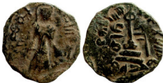
1250 Osman coin 20mm 2,47g