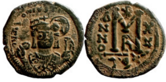
964 Byzantine Empire coin 28mm 10,75g