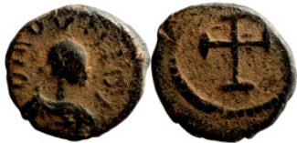
726 Antik coin bronze 9mm 0,82g Artificial sand patina