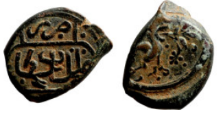
1258 Osman coin 16mm 3,71g