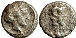
21 Greek silver coin 1-4 Century 8mm 0,72g