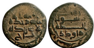
1165 Islamic coin 21mm 1,57g Artificial sand patina