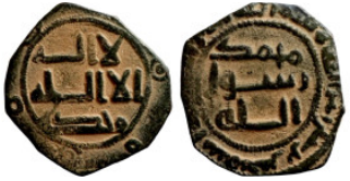
1175 Islamic coin 19mm 3,42g Artificial sand patina