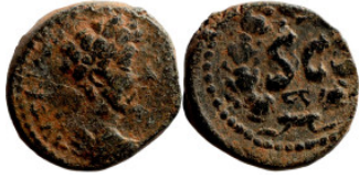
557 Antoninus Pius. A.D. 138-161. AE 16mm 5,06g