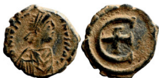
1001 Byzantine Empire coin 19mm 3,29g