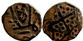
1154 Osman coin 14mm 1,96g