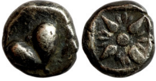
15 Greek silver coin 1-4 Century 7mm 0,73g