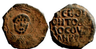
1017 Byzantine Empire Silver coin 15mm 1,88g