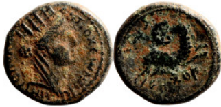
162 Greek bronze coin 1-4 Century 17mm 5,29g