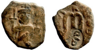
1098 Byzantine Empire coin 19mm 3,08g