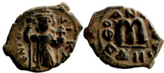
931 Byzantine Empire coin 21mm 3,80g