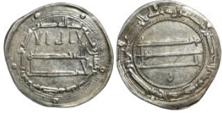
466 Islamic silver coin 23mm 2,96g