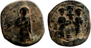
1063 Byzantine Empire coin 30mm 10,79g