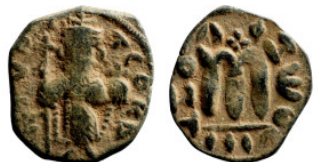
995 Byzantine Empire coin 19mm 2,64g