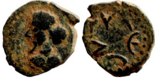
189 Antik coin 11mm 0,89g