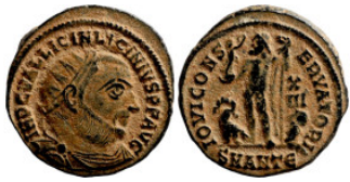
566 Roman Imperial coin 19mm 3,55g