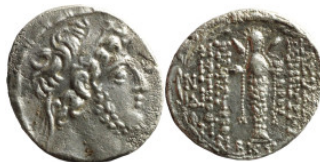
195 Demetrios III Eukairos (97/6-88/7 BC). Tetradrachm. Damaskos. Dated SE 221 (92/1 BC). 27mm 15,47g