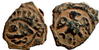
1257 Osman coin 15mm 3,88g