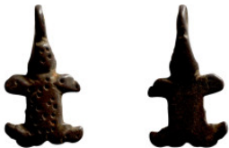
1024 Antiquities 17mm 2,40g