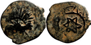
1245 Osman coin 18mm 3,55g