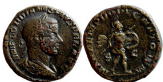
387 Sestertius bronze Roman Imperial 28mm 21,88g