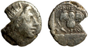
3 Greek silver coin 1-4 Century 13mm 1,66g