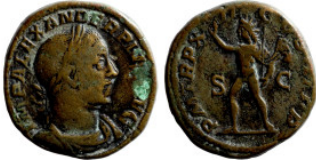
361 Sestertius bronze Roman Imperial 30mm 22,80g