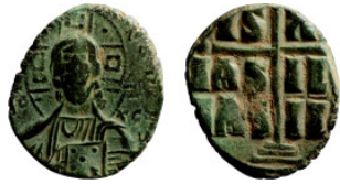
1065 Byzantine Empire coin 28mm 9,43g