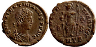
642 Roman Imperial coin 17mm 2,63g