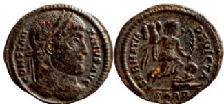
647 Roman Imperial coin 19mm 1,94g