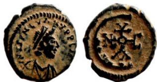
999 Byzantine Empire coin 15mm 2,51g