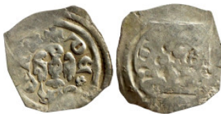
442 Rudolf von Habsburg, 1276-1281 Steiermark: Pfennig Graz or Oberzeiring 17mm 0,59g