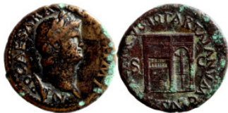
337 Dupondius bronze Roman Imperial 26mm 10,13g