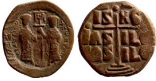
1062 Byzantine Empire coin 28mm 9,28g