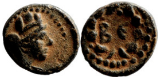
722 Antik coin bronze 9mm 1,04g