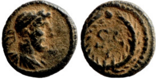
767 Roman Imperial coin 10mm 0,85g