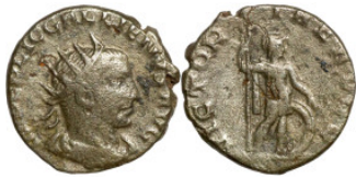
489 Roman Imperial coin 19mm 3,22g