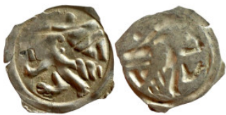
450 Albrecht I. 1282-1298 Pfennig o.J. Graz oder Oberzeiring 15mm 0,23g