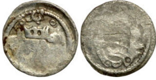
536 World silver coin 9mm 0,20g