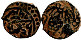
1161 Osman coin 20mm 2,36g