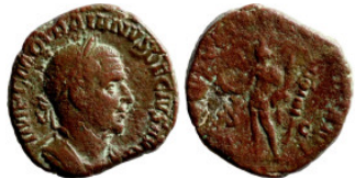
336 Sestertius bronze Roman Imperial 27mm 19,75g