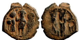
1016 Byzantine Empire Silver coin 22mm 4,23g