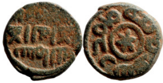
1121 Antik coin 14mm 1,76g