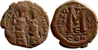
1049 Byzantine Empire coin 33mm 17,19g