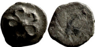
710 Antik coin Silver 7mm 0,47g