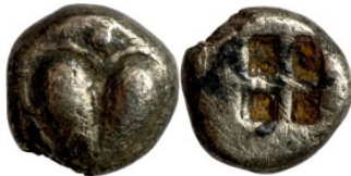
11 Greek silver coin 1-4 Century 7mm 0,68g