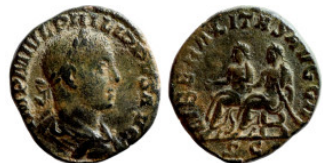
338 Sestertius bronze Roman Imperial 28mm 17,33g