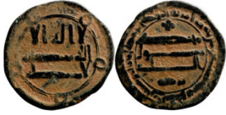
1188 Islamic coin 18mm 1,75g