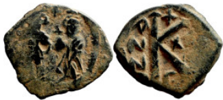
897 Byzantine Empire coin 17mm 5,45g