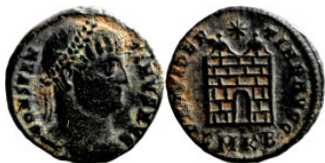
652 Roman Imperial coin 18mm 3,10g