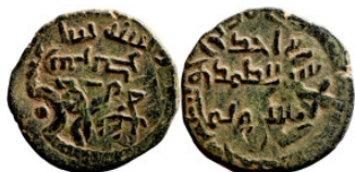
1005 Islamic coin 19mm 2,05g