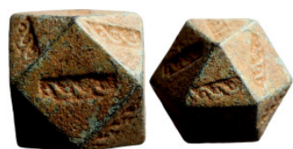
1019 Antiquities 16mm 5,65g