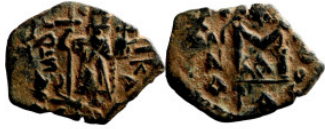
929 Byzantine Empire coin 24mm 4,00g