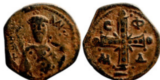
996 Byzantine Empire coin 22mm 2,97g