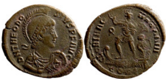
618 Roman Imperial coin 21mm 3,82g