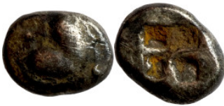
18 Greek silver coin 1-4 Century 7mm 0,66g