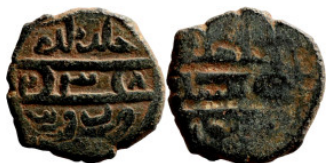
1155 Osman coin 14mm 1,12g