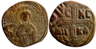
1034 Byzantine Empire coin 29mm 13,94g