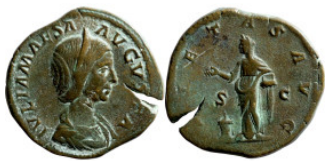
359 Sestertius bronze Roman Imperial 31mm 21,37g