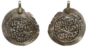
1088 Antiquities 32mm 2,86g