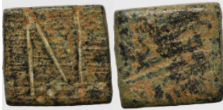
1046 Antiquities 12mm 4,38g