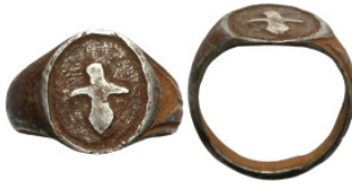
1069 Antiquities 18mm 3,20g