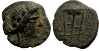
108 Roman Empire Bronze 10mm 1,03g