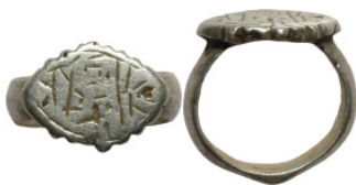
1065 Antiquities 18mm 5,00g