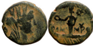
109 Roman Empire Bronze 11mm 1,78g