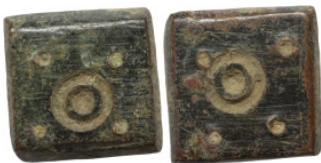
1050 Antiquities 10mm 2,90g