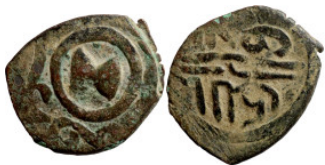
688 Islamic. Uncertain. CU. 20mm 2,34g