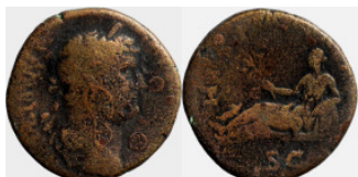
134 Hadrian. Sestertius from the 'Travel Series' Obverse: Bare-headed and draped bust right. Reverse: HISPANIA, Hispania reclining left on rock, holding olive branch; SC in exergue. 24mm 9,21g