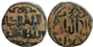
687 Islamic. Uncertain. CU. 19mm 3,17g