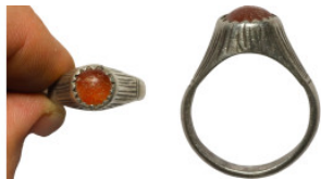
1063 Antiquities 25mm 4,40g