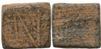
1051 Antiquities 11mm 4,40g