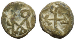
1092 Antiquities 13mm 3,58g