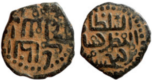
685 Islamic. Uncertain. CU. 21mm 3,15g