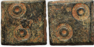
1038 Antiquities 14mm 5,71g