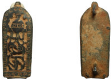
1076 Antiquities 47mm 17,79g