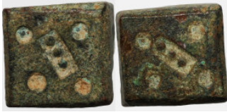
1045 Antiquities 10mm 6,00g