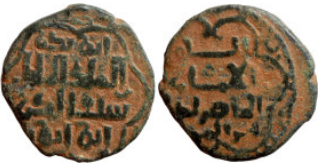
686 Islamic. Uncertain. CU. 19mm 2,96g