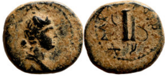
129 Roman Provincial Bronze coin 12mm 2,34g