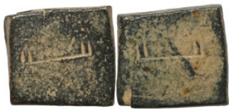
1054 Antiquities 10mm 2,87g