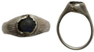
1066 Antiquities 25mm 3,86g