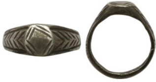
1059 Antiquities 25mm 7,15g