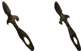
1079 Antiquities 82mm 23,18g