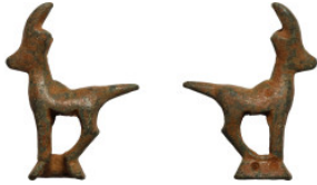
1081 Antiquities 38mm 13,24g