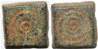
1048 Antiquities 13mm 5,70g