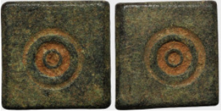
1032 Antiquities 11mm 14,31g