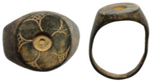
1071 Antiquities 26mm 8,77g