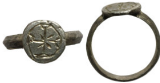
1070 Antiquities 15mm 1,23g