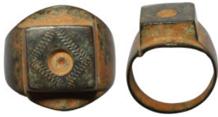
1062 Antiquities 26mm 10,32g