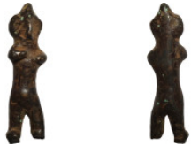
1077 Antiquities 59mm 34,62g