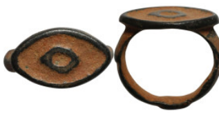
1072 Antiquities 18mm 3,74g