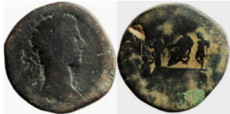
132 Commodus (177-192 A.D.). Sestertius. Obverse: laureate, cuirassed bust of Commodus right, seen from behind Reverse: Commodus seated left on curule chair set on platform, attended by soldier standing left behind, Liberalitas standing left before, tessera upward in right hand, cornucopia cradled in left, citizen mounting steps to accept coins; 31mm 26,90g