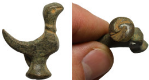
1085 Antiquities 33mm 14,89g