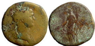
133 Trajan. As. Obverse:, laureate head right Reverse: Abundantia standing left, holding corn-ears and cornucopiae, child at foot 26mm 14,30g