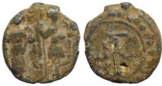
1089 Antiquities 21mm 8,08g