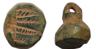
1049 Antiquities 12mm 6,79g