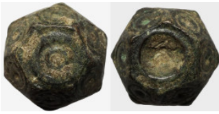
1034 Antiquities 14mm 14,60g