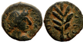
110 Roman Empire Bronze 11mm 1,87g