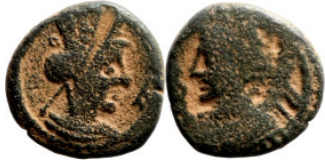
130 Roman Provincial Bronze coin 14mm 2,90g Artificial sand patina