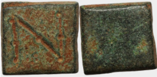
1039 Antiquities 13mm 4,29g