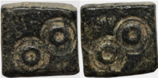
1043 Antiquities 12mm 5,72g