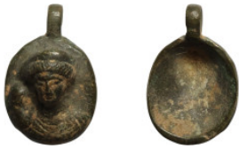
1082 Antiquities 32mm 11,83g