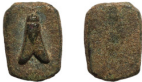
1091 Antiquities 18mm 5,53g