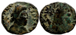
113 Johannes (?). Follis. Obverse: DN IOHANN-ES PF AVG, Pearl-diademed, draped & cuirassed bust right Reverse: SALVS REI-PVBLICAE, Victory walking left, holding trophy over shoulder & dragging captive 11mm 1,28g