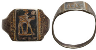
1068 Antiquities 21mm 3,40g