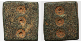
1037 Antiquities 14mm 5,69g