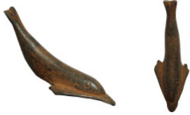
1080 Antiquities 57mm 21,32g