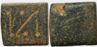
1041 Antiquities 13mm 4,28g