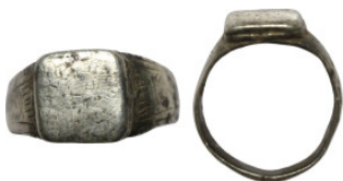
1058 Antiquities 25mm 7,61g