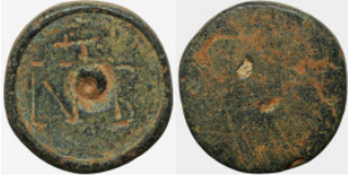
1031 Antiquities 17mm 8,54g