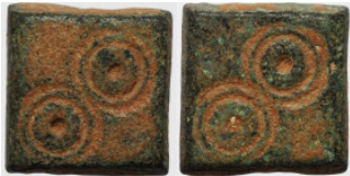
1040 Antiquities 11mm 5,74g