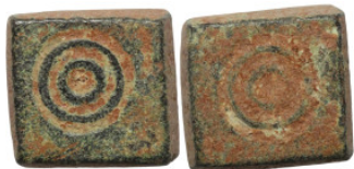
1057 Antiquities 9mm 2,87g