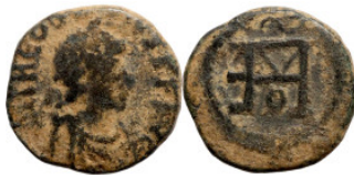
111 Theodosius II, Follis. Obverse: . Obverse: Diademed, draped & cuirassed bust right. Reverse: Monogram 12mm 1,43g