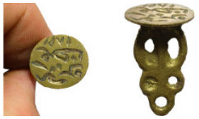
1075 Antiquities 25mm 4,67g