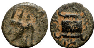
114 Roman Empire Bronze 12mm 1,00g