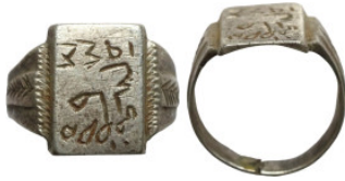
1067 Antiquities 20mm 3,75g