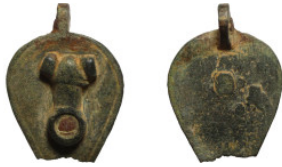
1090 Antiquities 24mm 3,41g