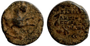
684 Greek. 3rd-1st century BC. AE bronze 16mm 3,25g Artificial sand patina