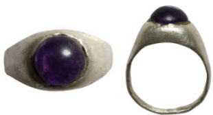
1064 Antiquities 25mm 5,95g