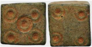
1033 Antiquities 12mm 14,52g