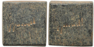
1053 Antiquities 11mm 3,95g