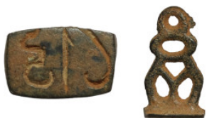
1086 Antiquities 24mm 2,71g