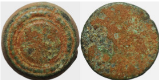
1042 Antiquities 15mm 5,90g