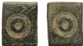
1056 Antiquities 10mm 2,89g