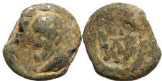
1093 Antiquities 13mm 3,42g