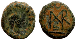
112 Marcian, 450-457. Nummus. D N MARCIANVS P F AV Diademed, draped and cuirassed bust right. Rev. Monogram in wreath. 10mm 1,35g