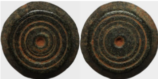
1044 Antiquities 12mm 4,07g