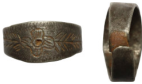
1061 Antiquities 23mm 4,93g