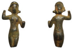
1078 Antiquities 52mm 26,82g