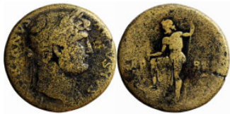
131 Hadrian. Sestertius,. Obverse: HADRIANVS AVGVSTVS, laureate bust right, slight drapery on far shoulder. Reverse: Neptune standing left, right foot set on prow, holding trident and acrostolium. 31mm 22,86g