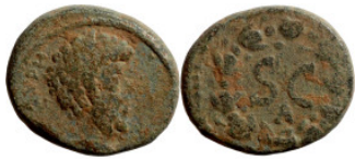
683 Roman Empire Bronze 15mm 5,19g