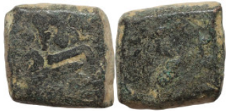
1052 Antiquities 11mm 3,11g