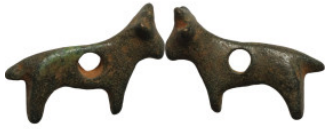
1087 Antiquities 24mm 4,76g