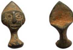
1083 Antiquities 38mm 24,25g