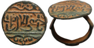
1073 Antiquities 19mm 5,00g