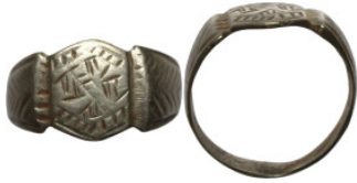
1060 Antiquities 21mm 4,79g