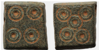
1047 Antiquities 11mm 5,76g