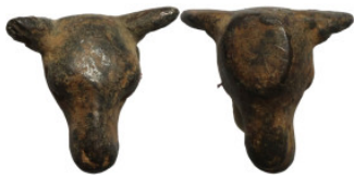
1084 Antiquities 23mm 15,33g