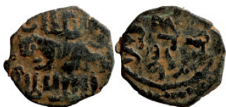
689 Islamic. Uncertain. CU. 15mm 1,61g