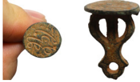
1074 Antiquities 24mm 4,03g