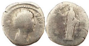
115 Faustina the Elder AR Denarius, 138-40 AD. - 2.61g, 17mm 1