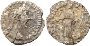
241 Commodus AR Denarius, 177-192 AD - 2.62g, 18mm