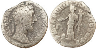
240 Commodus AR Denarius, 177-192 AD - 1.66g, 16mm