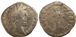
202 Marcus Aurelius AR Denarius, 161-180 AD. - 1.88g, 17mm 1