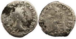
196 Marcus Aurelius AR Denarius, 161-180 AD. - 2.73g, 17mm 1