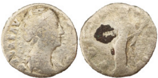
112 Faustina the Elder AR Denarius, 138-40 AD. - 3.08g, 16mm 1