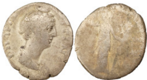
114 Faustina the Elder AR Denarius, 138-40 AD. - 2.38g, 17mm 1