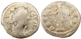
113 Faustina the Elder AR Denarius, 138-40 AD. - 2.89g, 17mm 1