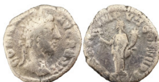
246 Commodus AR Denarius, 177-192 AD - 2.15g, 15mm