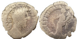
243 Commodus AR Denarius, 177-192 AD - 1.84g, 16mm