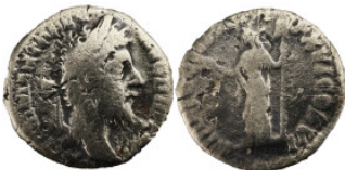
201 Marcus Aurelius AR Denarius, 161-180 AD. - 1.9g, 17mm 1