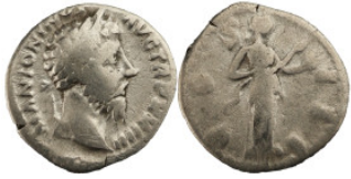
197 Marcus Aurelius AR Denarius, 161-180 AD. - 3.14g, 18mm 1