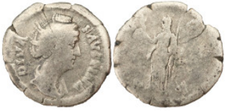
110 Faustina the Elder AR Denarius, 138-40 AD. - 2.42g, 18mm 1