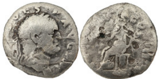
4 Vespasian AR Denarius, 69-79 AD. - 2.87g, 17mm