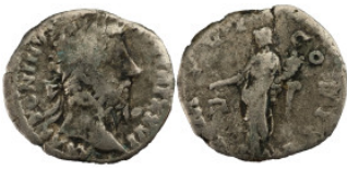
198 Marcus Aurelius AR Denarius, 161-180 AD. - 2.6g, 17mm 1