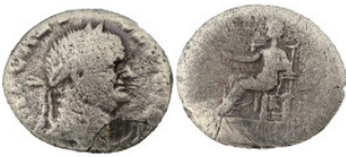
3 Vespasian AR Denarius, 69-79 AD. - 2.02g, 17mm