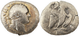
1 Vespasian AR Denarius, 69-79 AD. - 2.27g, 18mm