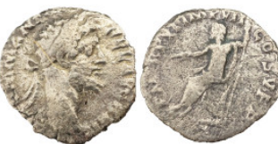
244 Commodus AR Denarius, 177-192 AD - 2.64g, 17mm