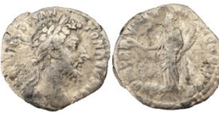
242 Commodus AR Denarius, 177-192 AD - 2.3g, 18mm