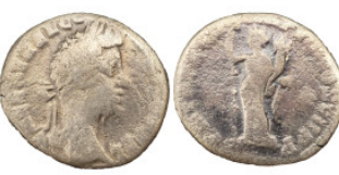
245 Commodus AR Denarius, 177-192 AD - 1.85g, 17mm