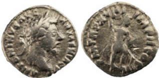
200 Marcus Aurelius AR Denarius, 161-180 AD. - 2.81g, 17mm 1