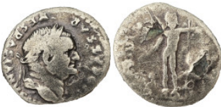
5 Vespasian AR Denarius, 69-79 AD. - 2.53g, 18mm