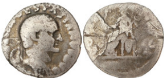
7 Vespasian AR Denarius, 69-79 AD.- 2.52g, 16mm