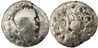
2 Vespasian AR Denarius, 69-79 AD. - 2.3g, 18mm