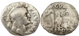
6 Vespasian AR Denarius, 69-79 AD. - 2.71g, 18mm