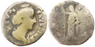
111 Faustina the Elder AR Denarius, 138-40 AD. - 2.32g, 17mm 1