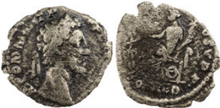
199 Marcus Aurelius AR Denarius, 161-180 AD. - 2.4g, 17mm 1