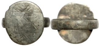
1269 Antiquities 21mm 3.63g