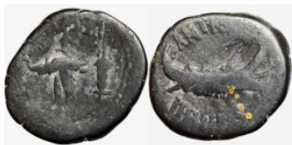
426 Legionary Denarius (I century BC) 17mm 3.34g 2