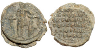
1259 Antiquities 27mm 16.93g