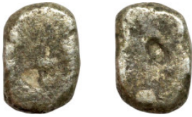
1236 Antiquities 10mm 1.59g