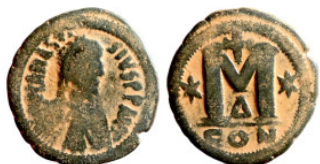
685 Anastasius I (491-518) Follis. Obverse: DN ANASTASVS PP AVG diademed, draped, and cuirassed bust right Reverse: Large M 33mm 16.82g Artificial sand patina