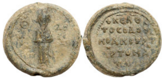
1263 Antiquities 22mm 10.00g