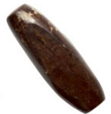
1286 Antiquities 21mm 5.20g