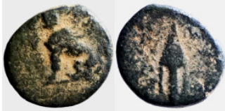
680 Antik coin 11mm 0.84g Artificial sand patina