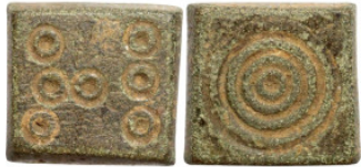
1290 Antiquities 12mm 5.62g