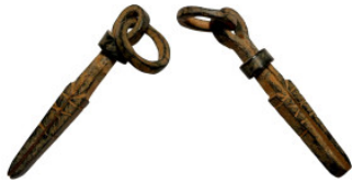
1255 Antiquities 50mm 6.24g