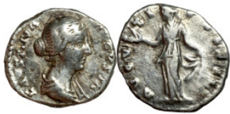
423 Faustina minor. Denarius. Obverse: Bust of Empress. Reverse: Standing Pietas 17mm 2.70g 2