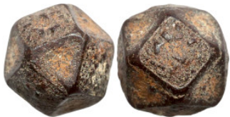
1300 Antiquities 9mm 1.81g