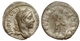
424 Alexander Severus. Denarius. Obverse IMP SEV ALEXAND AVG, laureate head right, with neatly trimmed beard; Reverse ANNONA AVG, Annona standing left, two heads of grain downward in right hand over modius overflowing with grain at feet left, grounded anchor in left hand 18mm 2.21g 2