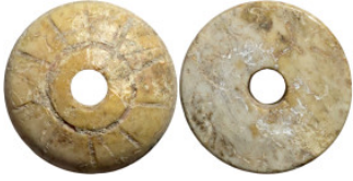
1212 Antiquities 26mm 5.82g