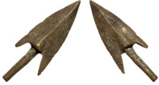
1254 Antiquities 47mm 10.64g