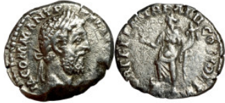
422 Commodus (179-192) Silver Denarius 18mm 2.56g 2