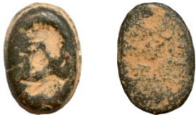
1244 Antiquities 13mm 1.35g