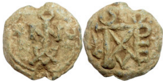
1264 Antiquities 22mm 10.13g