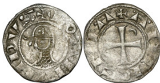
815 Principality of Antioch. Bohemond III (1163-1201) Denier. Antioch. Obverse: BOANVHDVS, helmeted and mailed head left; crescent before, star behind Reverse: + ANTI:OCHIA, cross pattée; crescent in second quarter 17mm 0.84g