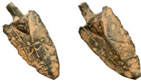
1256 Antiquities 37mm 11.10g