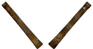
1252 Antiquities 51mm 5.28g