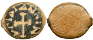
1238 Antiquities 12mm 1.36g