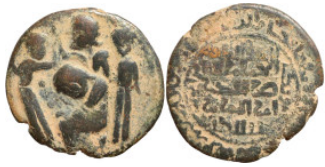
1208 Antiquities 32mm 11.54g