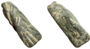
1291 Antiquities 22mm 1.85g