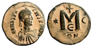
681 Anastasius I (491-518) Follis. Obverse: DN ANASTASVS PP AVG diademed, draped, and cuirassed bust right Reverse: Large M 33mm 17.00g Artificial sand patina