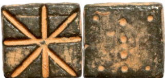
1239 Antiquities 9mm 1.44g