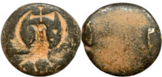
1237 Antiquities 12mm 1.55g