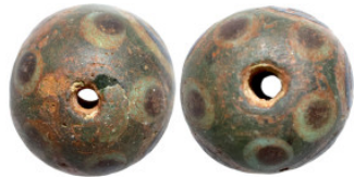
1266 Antiquities 17mm 10.35g