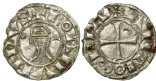
811 Principality of Antioch. Bohemond III (1163-1201) Denier. Antioch. Obverse: BOANVHDVS, helmeted and mailed head left; crescent before, star behind Reverse: + ANTI:OCHIA, cross pattée; crescent in second quarter 18mm 0.72g