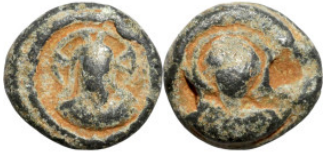
1296 Antiquities 13mm 3.26g