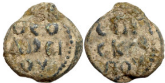
1295 Antiquities 18mm 7.22g