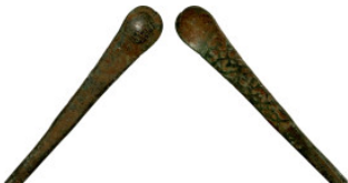
1251 Antiquities 98mm 7.68g