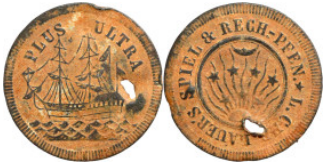
1213 Antiquities 29mm 2.94g