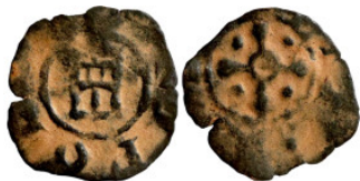
807 Antik coin 14mm 0.31g Artificial sand patina