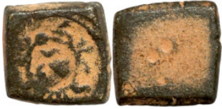
1240 Antiquities 9mm 1.38g