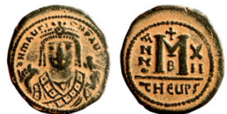
683 Maurice Tiberius (582-602) Follis. Antioch. Obverse: Crowned bust facing, wearing consular robes, holding mappa and eagle-tipped scepter , Reverse: Large M cross above, ANNO 28mm 12.08g Artificial sand patina