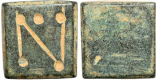
1297 Antiquities 12mm 4.41g