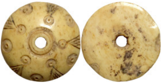
1257 Antiquities 26mm 4.75g