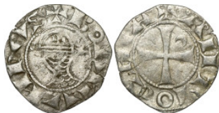
813 Principality of Antioch. Bohemond III (1163-1201) Denier. Antioch. Obverse: BOANVHDVS, helmeted and mailed head left; crescent before, star behind Reverse: + ANTI:OCHIA, cross pattée; crescent in second quarter 17mm 0.68g