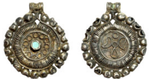
1253 Antiquities 30mm 6.28g