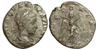
425 Caracalla (211-217) Denarius. Obverse: Busto of young caracalla. Reverse: Victory walking to right 17mm 2.74g 2