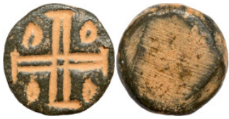
1242 Antiquities 11mm 1.75g