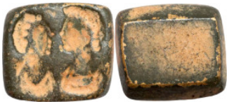
1299 Antiquities 11mm 3.63g