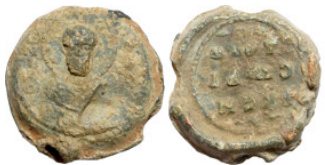
1294 Antiquities 17mm 6.85g