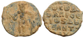
1261 Antiquities 24mm 14.56g