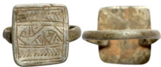
1273 Antiquities 20mm 2.70g