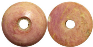
1265 Antiquities 24mm 3.48g