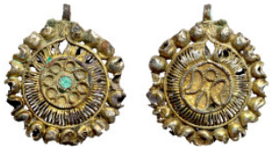
1207 Antiquities 27mm 4.83g