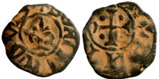
805 Antik coin 16mm 0.87g Artificial sand patina