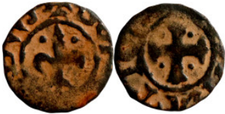
803 Antik coin 14mm 0.69g Artificial sand patina