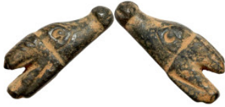
1289 Antiquities 22mm 6.54g