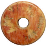
1283 Antiquities 16mm 1.84g