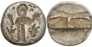
1249 Antiquities 10mm 1.23g