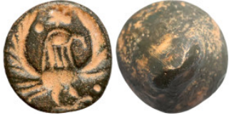
1233 Antiquities 13mm 3.45g