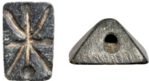
1292 Antiquities 15mm 1.27g