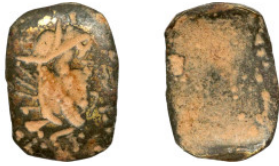
1248 Antiquities 14mm 0.80g