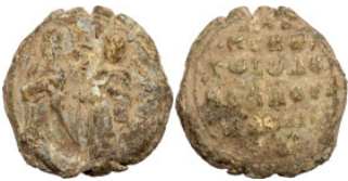
1258 Antiquities 35mm 37.88g