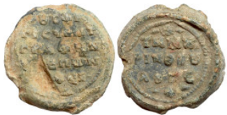
1293 Antiquities 16mm 5.43g