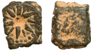
1243 Antiquities 11mm 1.52g