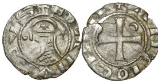
814 Principality of Antioch. Bohemond III (1163-1201) Denier. Antioch. Obverse: BOANVHDVS, helmeted and mailed head left; crescent before, star behind Reverse: + ANTI:OCHIA, cross pattée; crescent in second quarter 17mm 0.57g