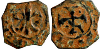
802 Antik coin 14mm 0.99g