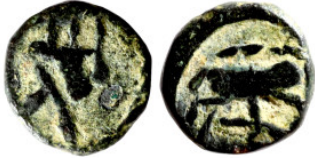
679 Antik coin 9mm 0.73g