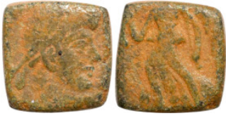
1247 Antiquities 9mm 1.35g