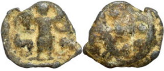
1234 Antiquities 16mm 2.20g