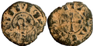
808 Antik coin 17mm 0.63g Artificial sand patina