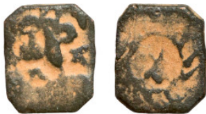
1245 Antiquities 11mm 0.90g