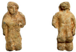
1210 Antiquities 39mm 18.26g