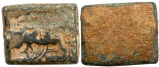
1298 Antiquities 9mm 1.72g