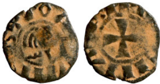
810 Antik coin 16mm 0.69g Artificial sand patina