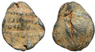
1260 Antiquities 28mm 17.35g