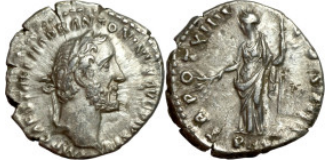
421 Antonius Pius (137-161) Denarius. Obverse: Laureate bust. Reverse: Pax standing left, holding branch & scepter 18mm 3.50g 2