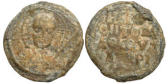
1262 Antiquities 25mm 15.03g