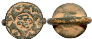
1274 Antiquities 18mm 2.80g