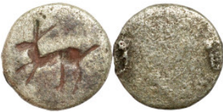
1250 Antiquities 12mm 1.40g