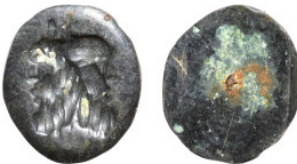
1246 Antiquities 12mm 0.81g