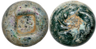
1205 Antiquities 35mm 29.62g