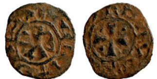
806 Antik coin 14mm 0.55g