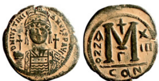
684 Justinian I (527-656) Follis. Obverse: DN IVSTINIANVS PP AVG, Armoured facing bust holding globus Reverse: Large M between ANNO and regnal year 38mm 22.00g Artificial sand patina