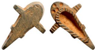
1209 Antiquities 39mm 20.37g