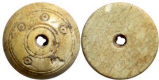
1211 Antiquities 26mm 6.32g