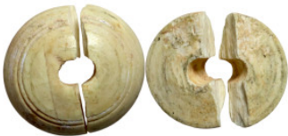
1216 Antiquities 28mm 4.97g