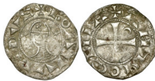
812 Principality of Antioch. Bohemond III (1163-1201) Denier. Antioch. Obverse: BOANVHDVS, helmeted and mailed head left; crescent before, star behind Reverse: + ANTI:OCHIA, cross pattée; crescent in second quarter 18mm 0.71g