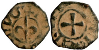
804 Antik coin 15mm 0.71g Artificial sand patina