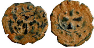
809 Antik coin 14mm 0.55g