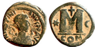
682 Justinian I (527-565) Follis. Obverse: D N IVSTINIANVS PP AVG, diademed, draped, and cuirassed bust right Reverse: Large M, mintmark 29mm 16.71g Artificial sand patina