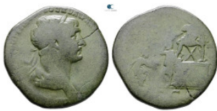
381 Trajan AD 98-117. Rome Sestertius Æ 33 mm, 22,69 g Fine 1