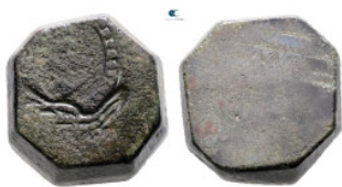
941 Islamic. Weight \text{Æ} 17 mm, 15,69 g Fine