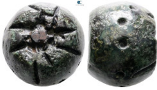
939 Byzantine. Weight \text{Æ} 33 mm, 123,63 g Fine