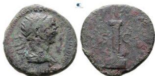
385 Trajan AD 98-117. Rome Dupondius Æ 27 mm, 13,70 g Fine 1