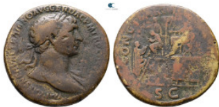
383 Trajan AD 98-117. Rome Sestertius Æ 34 mm, 21,43 g Fine 1