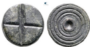
944 Islamic. Weight \text{Æ} 17 mm, 3,92 g Very Fine