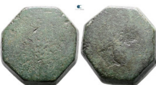
945 Islamic. Weight \text{Æ} 51 mm, 317,62 g Fine