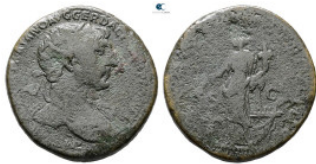
380 Trajan AD 98-117. Rome Sestertius Æ 32,58 mm, 25,02 g Fine 1