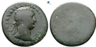
382 Trajan AD 98-117. Rome Sestertius Æ 34 mm, 22,28 g Fine 1