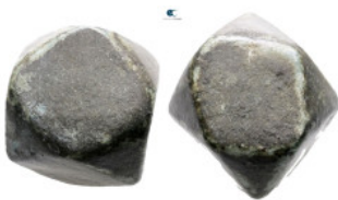
943 Islamic. Weight \text{Æ} 20 mm, 28,48 g Very Fine