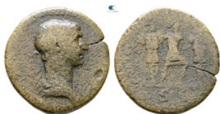
384 Trajan AD 98-117. Rome Dupondius Æ 26 mm, 10,10 g Fine 1