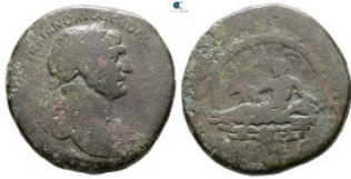
379 Trajan AD 98-117. Rome Sestertius Æ 32 mm, 26,03 g Fine 1