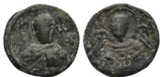
1080 Byzantine Seal (1,6g 14,6mm diameter)