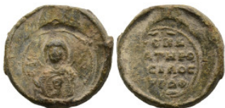
1093 Byzantine Lead Seal (9,8g 23,2mm diameter)