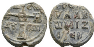
1103 Byzantine Lead Seal (15,9g 24,1mm diameter)