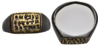
1146 Ancient stamp ring (5,2g 22,8mm diameter)