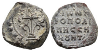
1068 Byzantine Lead Seal (11,35g 22,2mm diameter)