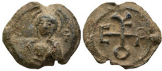
1095 Byzantine Lead Seal (10g 26,2mm diameter)