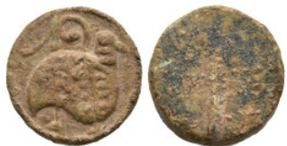
1097 Tessera (4,3g 15mm diameter)