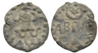
1069 EGYPT. Uncertain. Circa 2nd-4th centuries. Gnostic Tessera Lead (2,45g 17mm diameter) Obv: IAⲓ Abrasax facing, with the head of a rooster and snakes for legs, holding a whip in his right hand and a shield in his left. Rev. ABPA/CAE Star-in-crescent. Leu 3 (2018), 194. Leu Web Auction 12 (2020), 1009, Leu Web Auction 17 (2021), 2115-6