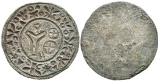
1089 Stamp Seal (2,8g 24,9mm diameter)