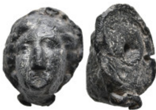
1211 Ancient bronze applique (31,3g 24,6mm diameter)