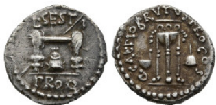
734 Brutus (Spring-early summer 42 BC). Military mint traveling with Brutus in southwestern Asia Minor; L Sestius, proquaestor. AR Quinarius (14,5mm 1,7g) Obv: L SESTI / PROQ. Quaestorial chair, against which rests staff; modius below Rev: Q CAEPIO BRVTVS PRO COS. Tripod; simpulum to left, apex to right. Crawford 502/4; CRI 203; Sydenham 1292; RSC 13; RBW 1770