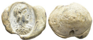
1112 Lead Seal (6,7g 17,2mm diameter)