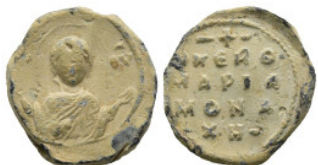
1100 Byzantine Lead Seal (4,1g 16mm diameter)