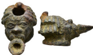
1213 Ancient oil lamp (105,8g 61mm diameter)