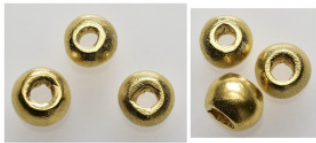
1194 3 pieces gold object (7g 20mm diameter)