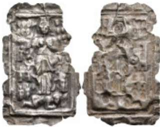
1128 Ancient Byzantine applique (3,59g 76,4mm diameter) 10