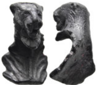
1212 Ancient object (31,5mm 37,5mm diameter)