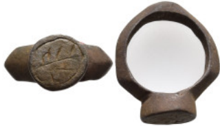
1165 Ancient ring (9,2g 26,5mm diameter)