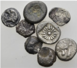
1216 8 pieces Greek silver coins / SOLD AS SEEN, NO RETURN!