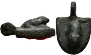
1124 Ancient object (24,18g 37,5mm diameter)