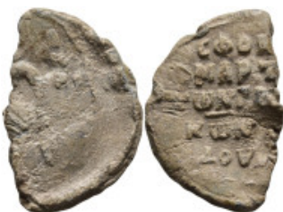
1084 Byzantine Lead Seal (11,5g 34,9mm diameter)