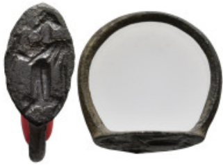
1134 Ancient ring Obv: Zeus (?) standing left, holding eagle (1,54g 19,8mm diameter)