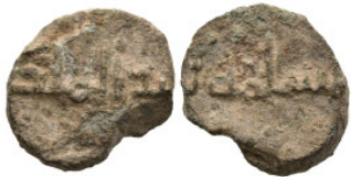
1096 Islamic Lead Seal (7,7g 20mm diameter)