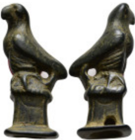
1122 Ancient eagle figurine (27,01g 37,5mm diameter)