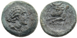
729 Greek AE Bronze (16,9mm 3,6g)