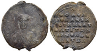
1088 Byzantine Lead Seal (9,3g mm diameter)