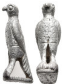
1206 Ancient silver eagle (5,2g 24,2mm diameter)