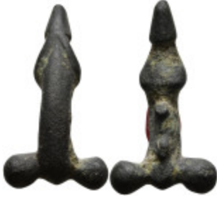
1125 Bronze phallic amulet (Fascinum) (14,58g 34mm diameter) 10