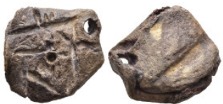
1113 Lead Seal (6,8g 18,9mm diameter)