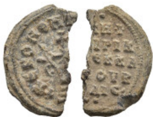
1083 Byzantine Lead Seal (3,4g 22,6mm diameter)