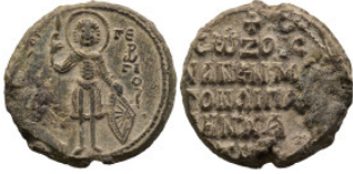
1094 Byzantine Lead Seal (23,1g 33,6mm diameter)