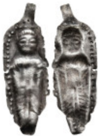
1129 Ancient necklace (0,81g 38mm diameter) 10