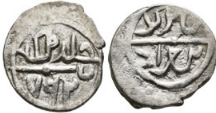
1014 OTTOMAN EMPIRE. Bayazid I (791-804 AH / 1389-1402 AD). Uncertain mint. Dated AH 792 (AD 1389). AR Akçe (14,9mm 1,2g) Obv: Naskh legend, pellet above: Beyazid | bin Murad. Rev: Naskh legend: khallada mulkahu | sene | 792 (May his kingdom flourish | date | 792). Srećković 5; Sultan type 7, 39-47; Album 1291.