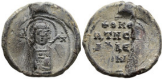
1074 Byzantine Lead Seal (6,4g 24,1mm diameter)