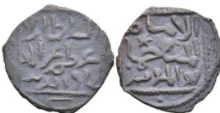
1017 Islamic coin AE Bronze (20,7mm 2,7g)