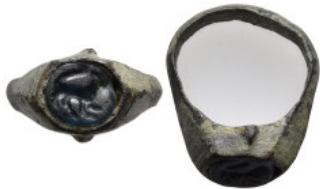
1166 Ancient ring with gemstone (7,2g 25,5mm diameter) Obv: Lion standing right