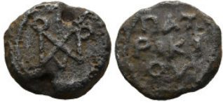
1087 Byzantine Lead Seal (7,4g 21,1mm diameter)