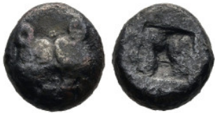
730 LESBOS. Uncertain mint. (Circa 500-450 BC). BI 1/12 Stater (9,4mm 0,9g) Obv: Confronted heads of two boars. Rev: Quadripartite incuse square. HGC 6, 1067 var. (letters on obverse); Klein 348; Rosen 542-3; SNG München 646