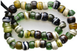
1215 51 pieces ancient bead