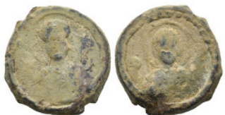
1078 Byzantine Lead Seal (4,98g 17,1mm diameter)