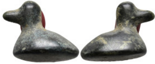
1178 Ancient duck figurine (4,9g 27mm diameter)