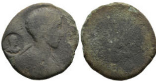
732 Roman Provincial AE Bronze (33,6mm 14,6g)