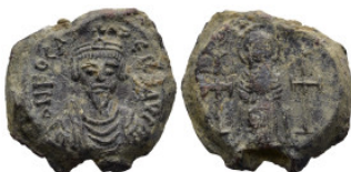
1102 Byzantine Lead Seal of Phocas, Emperor (AD 602-610). Constantinople (17,1g 25,9mm diameter) Obv: O N FOCAS PERP AVI Crowned, draped and cuirassed bust of Phocas facing, holding globus cruciger in his right hand Rev: The Virgin, nimbate and wearing a chiton and maphorion, enrobed, standing facing, holding the infant Christ before her; to left and right, a large cross potent with an elongated shaft