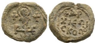
1091 Byzantine Lead Seal (13,9g 24,3mm diameter)