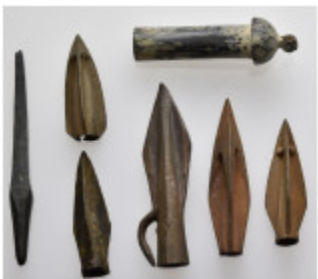
1153 7 pieces ancient object