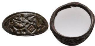
1169 Ancient ring (3,3g 22,6mm diameter)