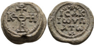
1075 Byzantine Lead Seal (18,5g 27,6mm diameter)