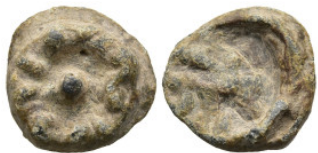
1099 Lead Seal (5,9g 17mm diameter)