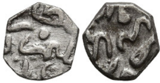
1013 Islamic coin AR Silver (8,1mm 0,2g)