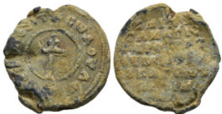
1076 Byzantine Lead Seal (10,3g 24,5mm diameter)