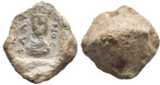
1108 Lead Seal (5,7g 16,9mm diameter)