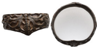
1168 Ancient archer ring (6,1g 26mm diameter)