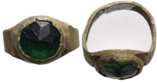
1170 Ancient ring with gemstone (2,2g 16,9mm diameter)