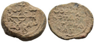
1110 Byzantine Lead Seal (13,6g 25,9mm diameter)