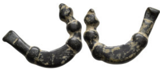
1159 Ancient fibula (23,9g 36,4mm diameter)