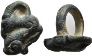
1121 Ancient ring (12g 21,9mm diameter)