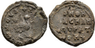
1073 Byzantine Lead Seal (4,13g 20mm diameter)