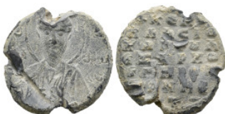
1106 Byzantine Lead Seal (8,6g 23,8mm diameter)