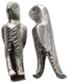
1152 Ancient silver eagle figurine (1,8g 18,9mm diameter)