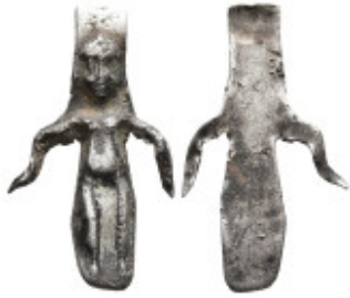
1207 Ancient silver object (0,7g 24,1mm diameter)