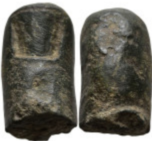
1123 Ancient finger (39,92g 28,7mm diameter)