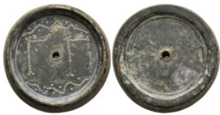
1180 Byzantine weight (80,7g 38,3mm diameter)