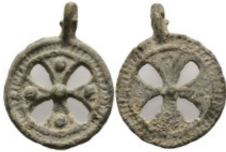
1126 Ancient necklace (4,42g 27,8mm diameter) 10