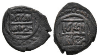
1019 Islamic AE Bronze (15,4mm 3,1g)