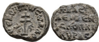
1070 Byzantine Lead Seal (4,09g 18,3mm diameter)