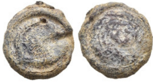
1114 Lead Seal (2,1g 11,6mm diameter)