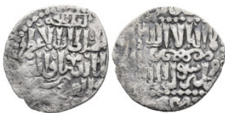
1018 Islamic AR Dirham (22,2mm 2,5g)