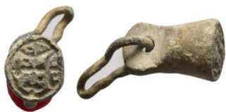
1182 Ancient stamp seal (14,8g 21mm diameter)