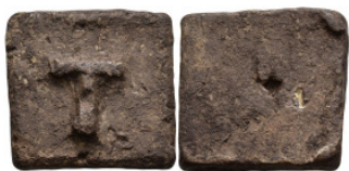
1184 Ancient lead weight (118,7g 40mm diameter) Obv: Large T