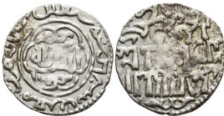
1015 Islamic coin AR Silver (22,9mm 2,7g)