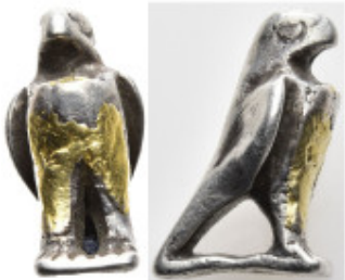
1151 Ancient silver eagle figurine; gold plated chest (7,9g 22,3mm diameter)