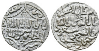
1016 Islamic coin AR Silver (23,1mm 2,8g)