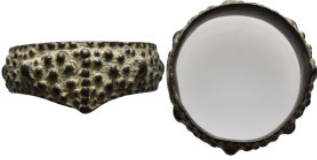
1120 Ancient ring (5,45g 25mm diameter)