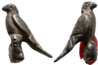
1133 Ancient eagle object (4,07g 16,9mmdiameter)