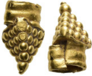
1191 Ancient gold object (0,6g 5,3mm diameter)