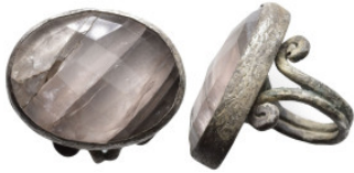
1156 Ancient ring with gemstone (20,6g 32mm diameter)