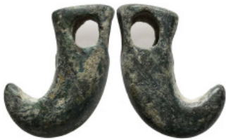
1160 Ancient object (18,9g 36,5mm diameter)