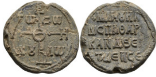
1066 Byzantine Lead Seal (22,17g 31,9mm diameter)