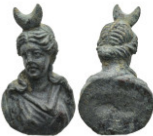
1116 Bust of Selene (11,66g 27,2mm)