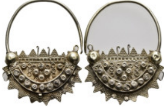
1132 Ancient earring (4,16g 44,7mm diameter)