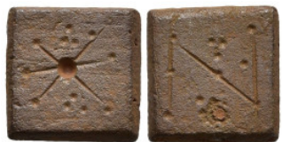
1176 Byzantine weight (4,1g 12,7mm diameter)