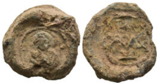
1092 Byzantine Lead Seal (14,1g 23,6mm diameter)