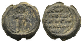
1077 Byzantine Lead Seal (5,85g 17mm diameter)