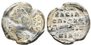
1111 Byzantine Lead Seal (4,8g 21,4mm diameter)