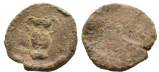
1098 Tessera Obv: Amphora Rev: Blank (1g 11,9mm diameter)