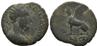
733 Uncertain mint. Commodus (AD 177-192) AE Bronze (24,6mm 5,9g) Obv: IMP CAES COMMODO AVG. Laureate-headed bust of Commodus wearing cuirass and paludamentum, right, seen from rear Rev: LEG XV. Griffin seated, left, raising right paw over small wheel RPC IV.3, 17513 Very Rare