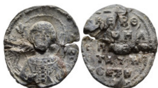
1072 Byzantine Lead Seal (6,41g 22,6mm diameter)