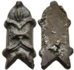
1179 Ancient belt buckle (11,9g 24,6mm diameter)