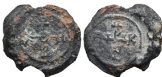
1086 Byzantine Lead Seal (9,1g 24mm diameter)