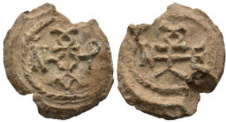
1090 Byzantine Lead Seal (9,6g 24,8mm diameter)