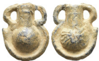
1205 Ancient ampulla (5,7g 14,6mm diameter)