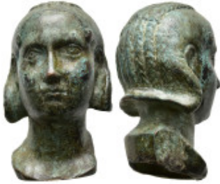
1214 Ancient bust (131,6g 62mm diameter)