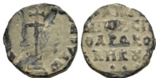
1101 Byzantine Lead Seal (4g 16,6mm diameter)