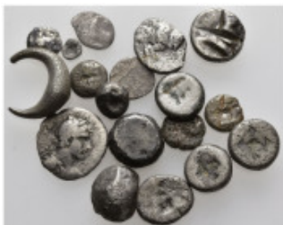
1219 17 pieces mixed coins and 1 pieces ancient object / SOLD AS SEEN, NO RETURN!