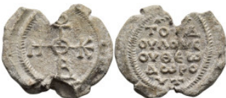
1079 Byzantine Lead Seal (15,3g 30,9mm diameter)