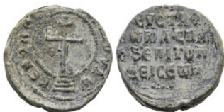
1085 Byzantine Lead Seal (6,9g 22,7mm diameter)