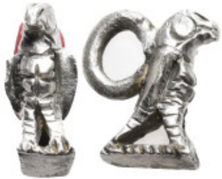
1174 Ancient silver eagle pendant or figurine (4,6g 17,1mm diameter)