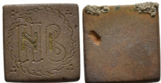
1175 Byzantine coin weight (Circa 4th-6th centuries). Square AE Two Nomismata (9,8g 18,5mm diameter) Obv: Large NB within wreath. Rev: Blank. Cf. Bendall 102; cf. Pera 226ff.