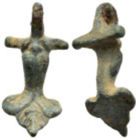
1115 Ancient object (2,84g 25,2mm)