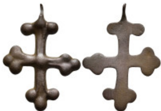
1162 Byzantine cross (3,3g 36,8mm diameter)