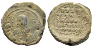
1109 Byzantine Lead Seal (13,6g 25,9mm diameter)