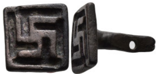
1181 Ancient stamp seal (80,7g 25mm diameter) Obv: Swastika