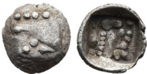
731 Greek AR Obol (6,9mm 6g)