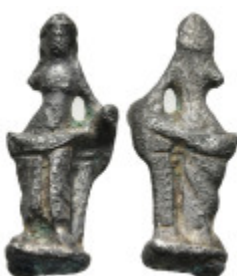
1118 Figurine of Aphrodite (1,65g 19,8mm)