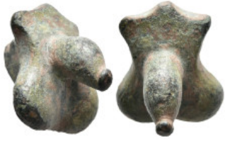
1199 Ancient phallic applique (14g 19,5mm diameter)