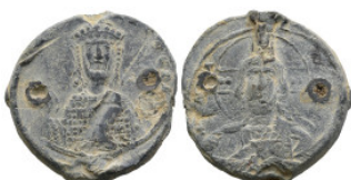
1105 Byzantine Lead Seal (17,9g 28,3mm diameter)