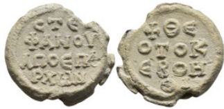
1067 Byzantine Lead Seal (11,88g 24,9 mm diameter)