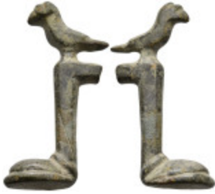
1164 Ancient object (36g 60mm diameter)