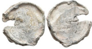
1107 Byzantine Lead Seal (6,7g 25,4mm diameter)