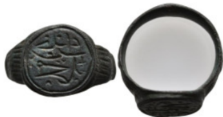
1147 Ancient islamic stamp ring (6,2g 23,6mm diameter)