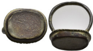
1167 Ancient ring (2,2g 24,9mm diameter)