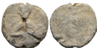
1081 Byzantine Lead Seal (18,3g 28,3mm diameter)