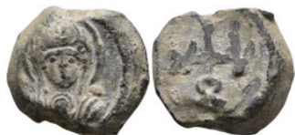
1071 Byzantine Lead Seal (6,6g 17,8mm diameter)