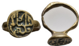
1145 Ancient stamp ring (3,8g 21,1mm diameter)