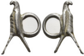
1149 Ancient silver eagle pendant or figurine (0,8mm 16,5mm diameter)