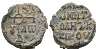
1104 Byzantine Lead Seal (15g 30,1mm diameter)