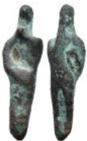
1117 Ancient figurine (1,31g 21mm)