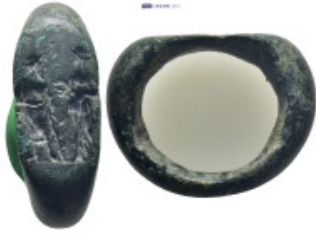
759 Bronze ring with Asklepios and Hygieia. (12mm, 13.76 g)