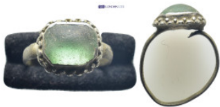
828 Silver ring with light green stone (2.9 Gr. 12mm.) SOLD AS SEEN, NO RETURN!