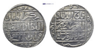
636 Islamic coin. (15mm, 1.7 g)