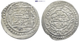
639 Islamic coin. (16mm, 0.8 g)