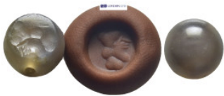
820 Sassanian bead. (15mm, 4.03 g)