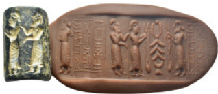
787 Cylinder Seal. (43mm, 53.4 g)