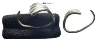
824 Silver ear ring. (18mm, 1.4 g)