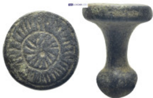
769 Bronze stamp seal. (11.9 Gr. 21mm.) SOLD AS SEEN, NO RETURN!