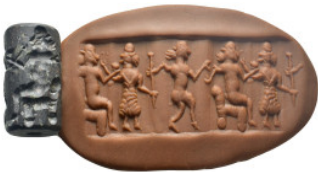
786 Cylinder Seal. (41mm, 36.73 g)