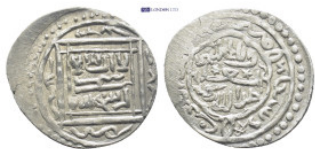
635 Islamic coin. (15mm, 0.8 g)