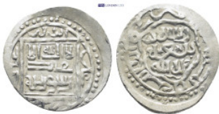
642 Islamic coin. (16mm, 0.8 g)