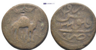
589 CIVIC COPPER: AE falus (8.74g), Iravan, AH1133, A-3236, dromedary camel right. (22mm, 8.81g)