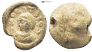
584 Lead seal.(3.3 Gr. 14mm.)