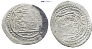
645 Islamic coin. (17mm, 0.9 g)