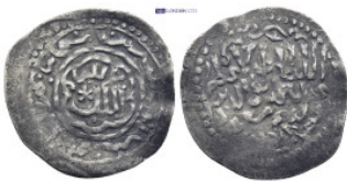
649 Islamic coin. (24mm, 1.91 g)