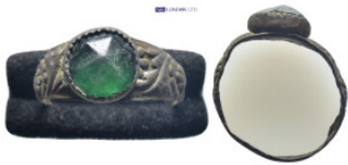
827 Silver ring with green stone. (15mm, 2.35 g)