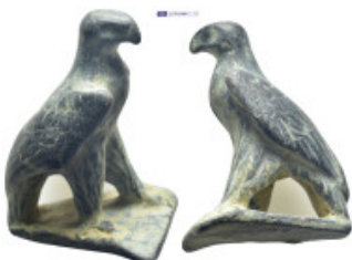
811 Roman Bronze Eagle Statuette. 1st-2nd century AD. (40.8 Gr. 37mm.) SOLD AS SEEN, NO RETURN!