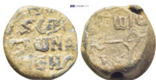
581 Byzantine Seal Lead (8.8 Gr. 18mm.)