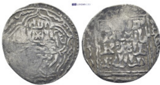
648 Islamic coin. (23mm, 1.75 g)