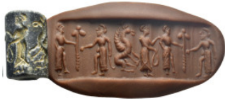
783 Cylinder Seal. (35mm, 33.4 g)