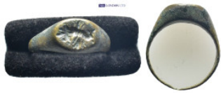
765 Bronze ring. (8mm, 3.1 g)