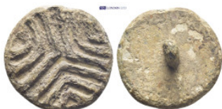
583 Lead seal. (20mm, 6.42 g)