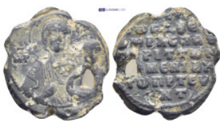
579 Byzantine Seal Lead (8.1 Gr. 24mm.)