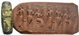
793 Cylinder Seal. (51mm, 25.81 g)