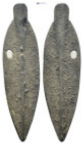
767 Bronze Roman arrow head. (51mm, 4.96 g)