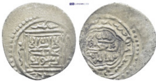
640 Islamic coin. (16mm, 0.8 g)