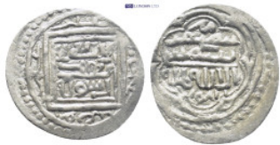
634 Islamic coin. (15mm, 0.8 g)