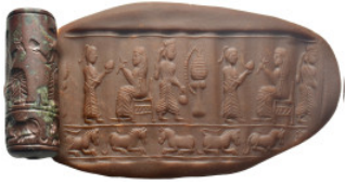
790 Cylinder Seal. (45mm, 22.72 g)