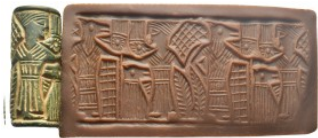
788 Cylinder Seal. (44mm, 31.7 g)