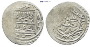
631 Islamic coin. (15mm, 0.7 g)