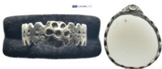
797 Flower patterned silver ring (2.1 Gr. 12mm.) SOLD AS SEEN, NO RETURN!