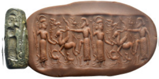
791 Cylinder Seal. (50mm, 30.29 g)