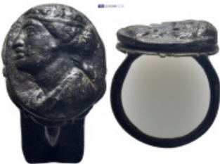
762 Bronze ring. (18mm, 13.44 g)