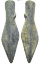
766 Bronze Roman arrow head. (44mm, 5.82 g)