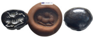
821 Sassanian bead. (21mm, 10.57 g)