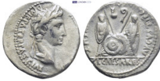
331 Augustus (27 BC-14 AD). Denarius Lugdunum (Lyon). (3.5 Gr. 18mm.) Laureate head right. Rev. Gaius and Lucius Caesar standing facing; two shields and two sceptres between; above, simpulum and lituus.