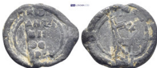
580 Byzantine Seal Lead (8.3 Gr. 21mm.)