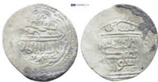
647 Islamic coin. (19mm, 1.8 g)