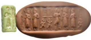
784 Cylinder Seal. (36mm, 24.69 g)