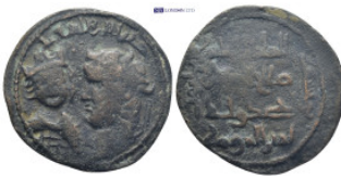
586 Artuqids (Mardin), Husam al-Din Yuluq Arslan (AH 580-597 / AD 1184-1200) AE Dirham (32mm, 9.52 g) Obv: Draped and crowned bust in left field facing, head turned slightly to right, looking at diademed Roman style head to left; above, legend in Kufic bearing the name and title of Husam al-Din, Malik of Diyār Bakr. Rev: Legend in Kufic bearing the name of al-Nasir I Salah al-Din Yusuf, the preserver of the state and commander of the faithful.