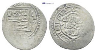
637 Islamic coin. (16mm, 0.7 g)