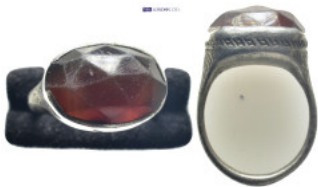
829 Silver ring with red stone. (6.5 Gr. 16mm.) SOLD AS SEEN, NO RETURN!