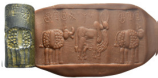
794 Cylinder Seal. (52mm, 57.9 g)