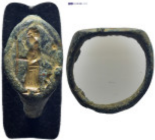
760 Bronze ring. (11mm, 3.33 g)