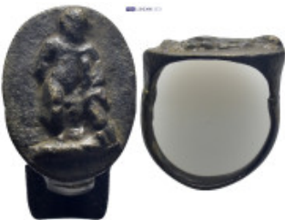
763 Bronze ring. (21mm, 10.79 g)