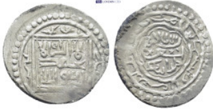
638 Islamic coin. (16mm, 0.8 g)