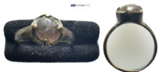
810 Ring with stone. (8mm, 2.4 g)