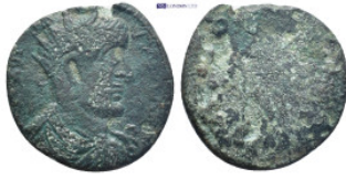
330 Roman Provincial coin. (29mm, 10.29 g)