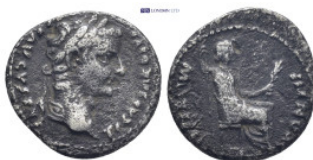
335 Tiberius. Denarius. 14-37 AD. Lugdunum. (17mm, 3.39 g) Anv.: TI CAESAR DIVI AVG F AVGVSTVS. Laureate head of Tiberius right. Rev.: PONTIF MAXIM. Livia (as Pax), holding scepter and olive branch, seated right on chair, feet on footstool; ornate chair legs, single line below