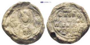
577 Byzantine Seal Lead (14 Gr. 20mm.)