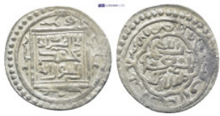
633 Islamic coin. (15mm, 0.8 g)