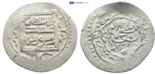
632 Islamic coin. (15mm, 0.8 g)