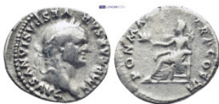
336 Vespasian (69-79) Denarius Rome. (3.1 Gr. 18mm.) Head laureate right. Rev. Pax seated left resting left elbow on throne and holding branch.