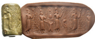
789 Cylinder Seal. (44mm, 52.29 g)