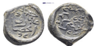
582 Islamic Lead Seal. (14mm, 5.6 g)