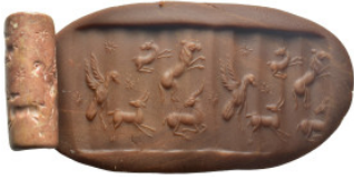
805 Mesopotamia, Hanigalbad 1400--1200 BC Jasper Stone. (39mm, 16,15 g)