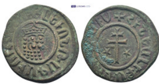
650 ARMENIA, Cilician Armenia. Royal . Levon I. 1198-1219. Æ Tank (28mm, 7.9 g). Crowned leonine head facing slightly right / Patriarchal cross; six-pointed star to left and right.