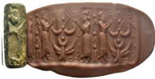
792 Cylinder Seal. (51mm, 23.3 g)