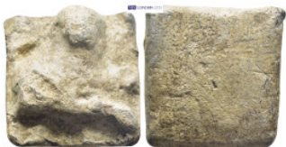
823 Seal and Weight PB Thracian Chersonese, Lysimachia. 1/8 mina weight (c. 4th-2nd centuries BC) A square lead weight with rounded corners. On the obverse there is a lion protome jumping right, in relief. On the top corners, from the left, [Λ-Y]. The reverse is blank. (31mm, 76.0 g)