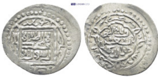
644 Islamic coin. (17mm, 0.8 g)