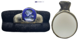
819 Roman silver blue intaglio carnelian ring. (8mm, 2.96 g)