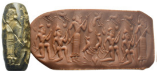
795 Cylinder Seal. (55mm, 47.22 g)