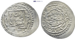
641 Islamic coin. (16mm, 0.8 g)