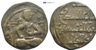
587 Artuqids (Mardin). Nasir al-Din Artuq Arslan. AH 597-637 / AD 1200-1239. Æ Dirham (27mm, 9.66 g). Unlisted (Mardin[?]) mint. Dated AH 628 (AD 1230/1). Turkish male figure, crosslegged, seated facing on low, quadrate platform, resting hand on thigh and holding globus; stars flanking head; Artuqid tamgha below; name of Nasir al-Din Artuq Arslan to outer right and left / Names and titles of Abbasid caliph and Ayyubid overlord in five lines; AH date to outer right and left.