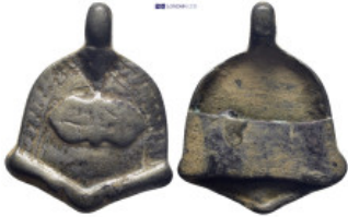
825 Silver pendant. (33mm, 8.42 g)