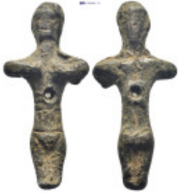
750 Bronze figurine. (45mm, 13.5 g)