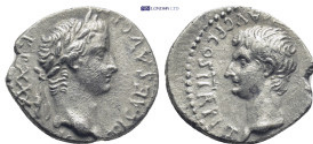
334 Tiberius (14-37) - With Drusus Minor - AR Denarius (3.9 Gr. 17mm.) Laureate head of Tiberius to right Rev. Head of Drusus Minor to left.