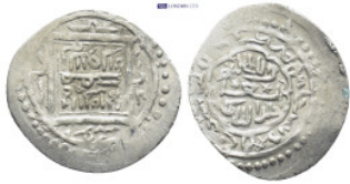
646 Islamic coin. (18mm, 0.8 g)