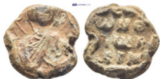
578 Byzantine Seal Lead (4.6 Gr. 16mm.)