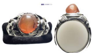
831 Silver ring with stone. (20mm, 8.9 g)