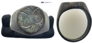
761 Bronze ring. (16mm, 11.2 g)