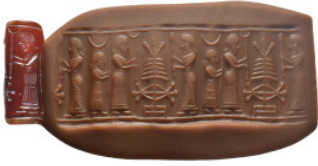
782 Cylinder Seal. (26mm, 4.53 g)