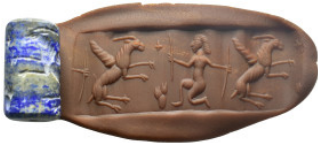
807 Mesopotamian, 1924-1878 BC Lapis Lazuli Stone.