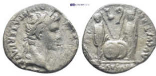
332 Augustus (27 BC-14 AD). Lugdunum (Lyon) Denarius (3 Gr. 16mm.) Laureate head right. Rev. Gaius and Lucius Caesar standing facing; two shields and two sceptres between; above, simpulum and lituus.