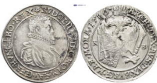
651 AUSTRIA, Holy Roman Empire. Rudolf II. Emperor, 1576-1612. AR Half Taler (13,5 Gr. 35mm.) + RVDOL · II · D · G · RO · IM · S · AV · GER · HVN · BOE · REX Rev. * ARCHIDVX · AVS · DVX · BVRG · MAR · MORA · 1586? * K B