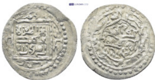
643 Islamic coin. (17mm, 0.6 g)