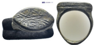
809 Ottoman period ring. (18mm, 11.4 g)