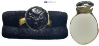
818 Roman gold intaglio carnelian. (4mm, 1.69 g)