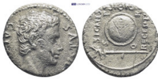
333 Augustus. Denarius. (16mm, 3.35 g) 19 BC. Colonia Patricia (Córdoba). Anv.: CAESAR AVGVSTVS bare head of Augustus right. Rev.: SIGNIS RECEP(TIS) above and below S.P.Q.R. around shield inscribed CL. V., Roman eagle on left and standard on right.