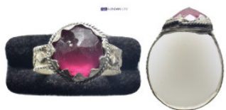
830 Silver ring with stone. (14mm, 2.5 g)