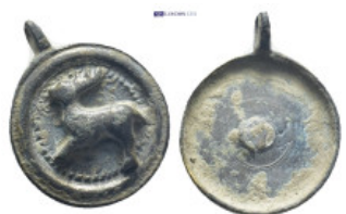
758 Bronze pendant with stag figure. (19mm, 2.8 g)