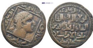
588 Artuqids (Mardin). Qutb al-Din Il-Ghazi II (AH 572-580 / 1176-1184 AD). Ae Dirhem. (30mm, 10.52 g) Obv: Diademed head right within pelleted lozenge. Rev: Legend.