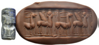
785 Cylinder Seal. (39mm, 24.9 g)