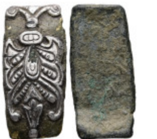
639 4.82 g 30.48 mm AE Ancient object