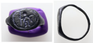
637 3.16 g 18.93 mm AE Ancient object