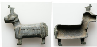
659 31.80 g 65.91 mm AE Ancient object