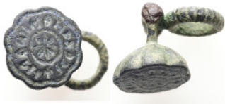
612 11.62 g 26.80 mm AE Ancient object