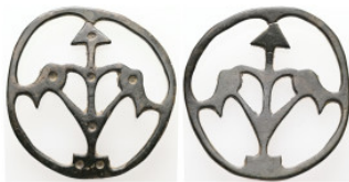
787 10.39 g 44.57 mm AE Ancient object