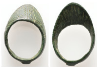
790 14.07 g 23.27 mm AE Ancient object