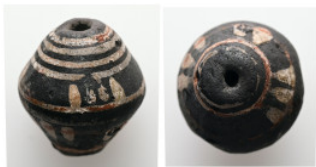
789 13.33 g 26.49 mm Stone Ancient object