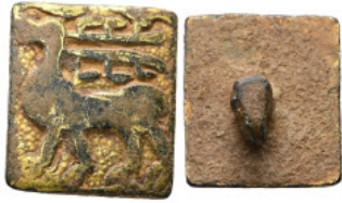
676 3.85 g 24.30 mm Gold plated Ancient object