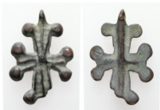
681 4.99 g 35.31 mm AR Ancient object