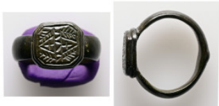
715 8.90 g 19.87 mm AE Ancient object