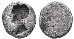
587 1.08 g 8.36 mm AR Ancient object