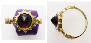
600 4.01 g 17.22 mm GOLD Ancient object