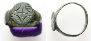
828 4.06 g 19.01 mm AE Ancient object