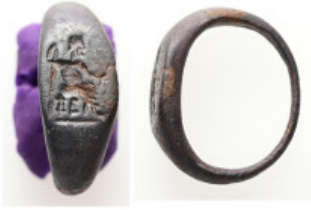
604 6.19 g 20.26 mm AE Ancient object