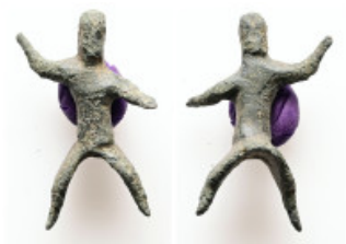
794 17.30 g 49.20 mm AE Ancient object