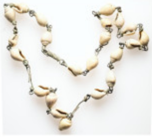
619 23.06 g 250 mm AE Ancient object