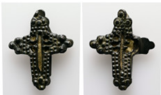
719 12.24 g 44.49 mm AE Ancient object