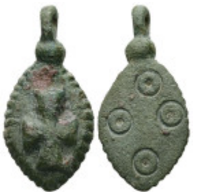
638 4.33 g 31.02 mm AE Ancient object