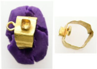
588 1.10 g 12.91 mm GOLD Ancient object