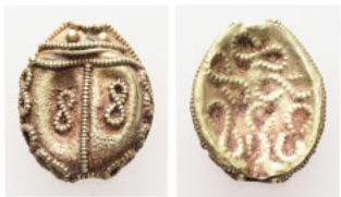
590 1.41 g 14.37 mm GOLD Ancient object