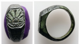
720 14.33 g 18.24 mm AE Ancient object