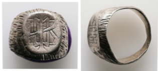
714 7.71 g 19.57 mm Ar Ancient object