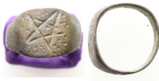
745 3.23 g 16.07 mm AE Ancient object