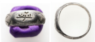
682 5.22 g 18.52 mm AR Ancient object