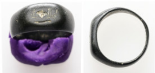
679 4.37 g 16.18 mm AE Ancient object