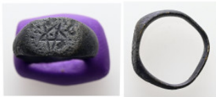
636 2.70 g 15.99 mm AE Ancient object