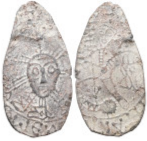
609 9.82 g 44.50 mm PB Ancient object