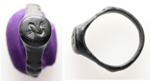
768 5.55 g 19.74 mm AE Ancient object