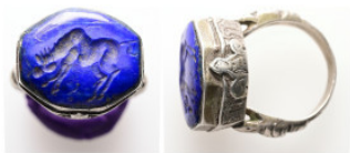
788 12.96 g 18.59 mm AR Modern object