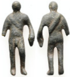
622 24.97 g 58.16 mm AE Ancient object