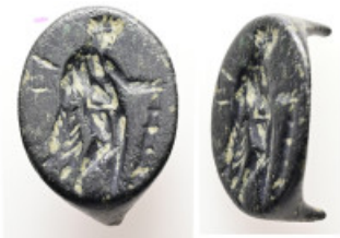
607 7.21 g 23.47 mm AE Ancient object