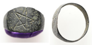
740 2.68 g 19.10 mm AE Ancient object