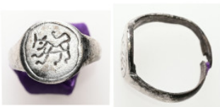
769 5.61 g 18.45 mm AR Ancient object