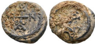
654 9.72 g 21.37 mm PB Ancient object