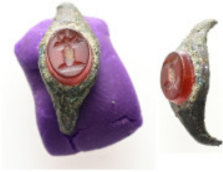
586 1.03 g 16.53 mm AE Ancient object