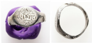
680 4.74 g 16.94 mm AR Ancient object