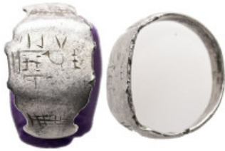
598 3.51 g 17.16 mm AR Ancient object