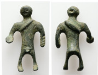
658 23.16 g 51.20 mm AE Ancient object