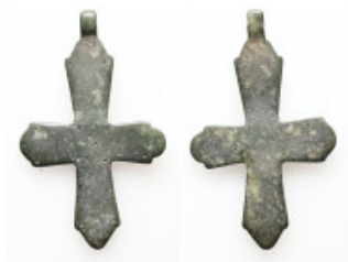
797 20.05 g 72.20 mm AE Ancient object