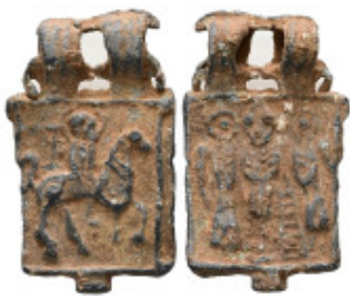
678 4.28 g 27.89 mm PB Ancient object