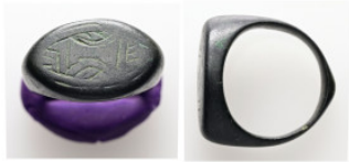
785 9.92 g 18.39 mm AE Ancient object