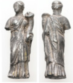
610 11.21 g 32.12 mm AR Ancient object