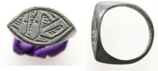
764 4.86 g 18.91 mm AE Ancient object