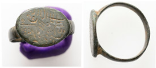
677 3.91 g 19.41 mm AE Ancient object