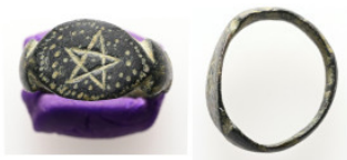
746 3.26 g 17.71 mm AE Ancient object