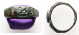
829 4.77 g 18.36 mm AE Ancient object