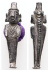
603 6.18 g 33.05 mm AR Ancient object