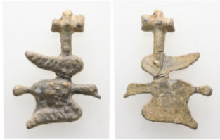
741 2.98 g 28.04 mm PB Ancient object