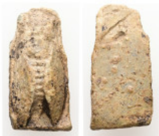
606 6.82 g 24.80 mm PB Ancient object