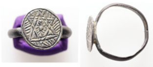
744 3.13 g 20.75 mm AE Ancient object