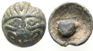
743 3.03 g 16.20 mm AE Ancient object