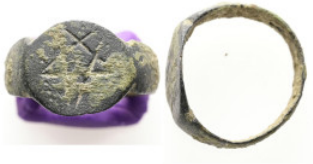
742 3.01 g 18.37 mm AE Ancient object