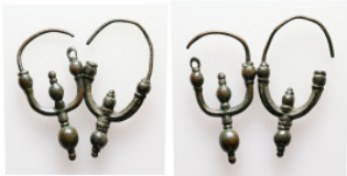
718 11.97 g 47.37 mm AE Ancient object