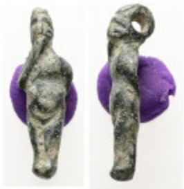
738 1.74 g 21.54 mm AE Ancient object