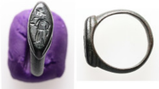
824 3.03 g 15.33 mm AE Ancient object