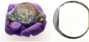
736 1.26 g 16.35 mm AE Ancient object