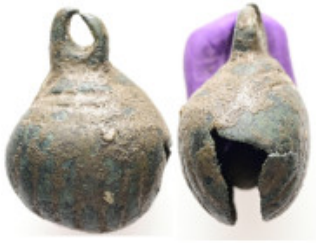
791 14.41 g 28.58 mm AE Ancient object