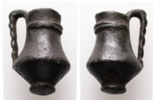
795 17.31 g 35.68 mm AE Ancient object