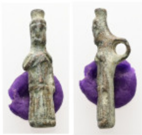
737 1.74 g 21.35 mm AE Ancient object