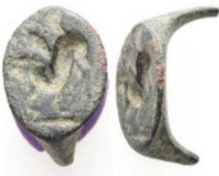
766 5.42 g 24.00 mm AE Ancient object