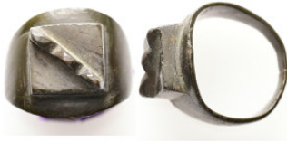
784 9.82 g 21.73 mm AE Ancient object