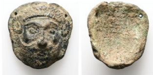
635 Roman bronze applique Bronze applique horned head of Zeus Ammon Weight: 84.77 g. Diameter: 52.13 mm.