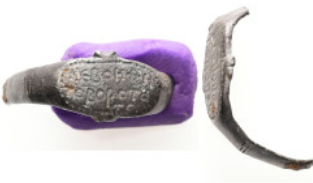
739 2.65 g 25.95 mm AE Ancient object