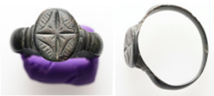
826 3.68 g 19.96 mm AE Ancient object