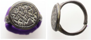
763 4.83 g 16.40 mm AE Ancient object