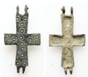
608 7.55 g 52.70 mm AE Ancient object