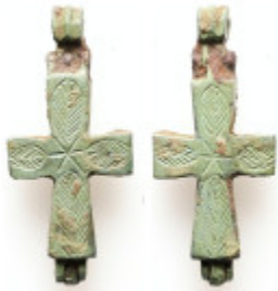
623 27.14 g 56.89 mm AE Ancient object