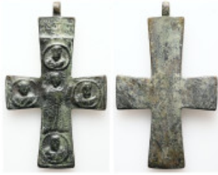
634 75.52 g 91.43 mm AE Ancient object