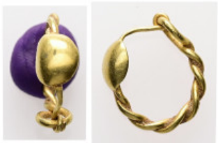
589 1.21 g 14.87 mm GOLD Ancient object