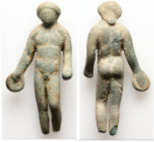
735 102.54 g 88.29 mm AE Ancient object