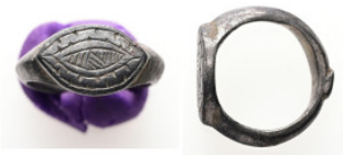
765 5.06 g 15.47 mm AE Ancient object