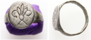
823 2.97 g 16.48 mm AE Ancient object