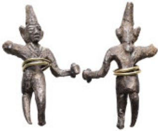
611 11.24 g 42.42 mm AR Ancient object