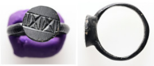
827 4.00 g 17.76 mm AE Ancient object