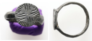
825 3.49 g 18.25 mm AE Ancient object