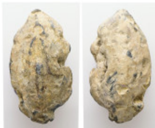
624 31.14 g 32.11 mm PB Ancient object