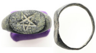
747 3.27 g 19.75 mm AE Ancient object