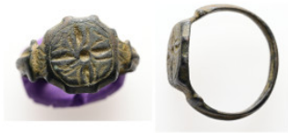
601 4.03 g 19.12 mm AE Ancient object