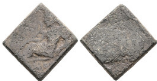
602 4.47 g 19.83 mm AE Ancient object