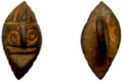
1194 Antiquities 16mm 3,91g0