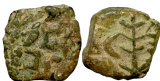
1203 Antiquities 12mm 2,15g0