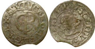
1006 Uncertain Imperial Bronze coin 13mm 1,13g0