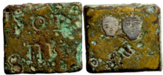
1209 Antiquities 20mm 11,87g0