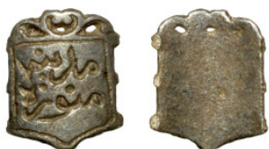
1202 Antiquities 13mm 1,16g0