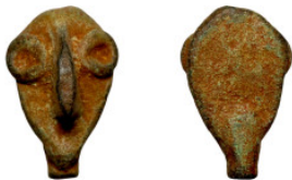
1184 Antiquities 25mm 9,51g0