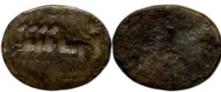
1198 Antiquities 16mm 1,55g0