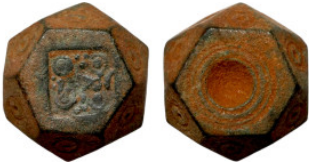
1180 Antiquities 18mm 29,62g0