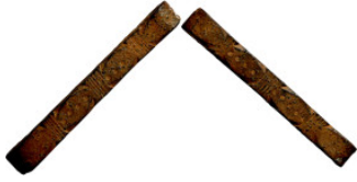
1207 Antiquities 53mm 6,19g0