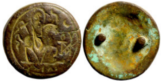
1208 Antiquities 24mm 20,66g0