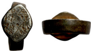
1212 Antiquities 16mm 2,39g0