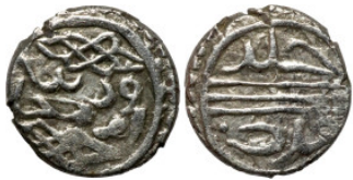
1008 Ottoman Empire (XIV-XX century) Silver Coin. Obverse: Arabic inscription. Reverse: Arabic inscription 12mm 0,83g0