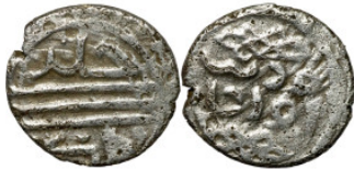
1007 Ottoman Empire (XIV-XX century) Silver Coin. Obverse: Arabic inscription. Reverse: Arabic inscription 11mm 1,13g0