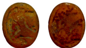
1205 Antiquities 11mm 0,33g0