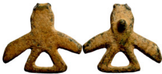
1211 Antiquities 28mm 7,73g0