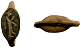
1225 Antiquities 19mm 2,23g0