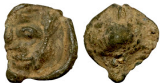
1200 Antiquities 13mm 1,89g0