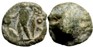
1240 Antiquities 11mm 2,27g0