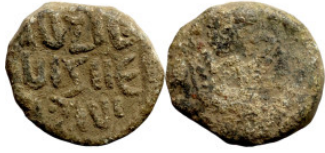
1235 Antiquities 18mm 9,17g0