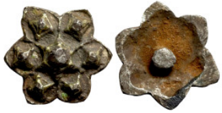
1238 Antiquities 21mm 4,62g0