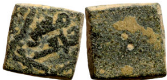
1241 Antiquities 8mm 0,93g0