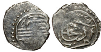
1009 Ottoman Empire (XIV-XX century) Silver Coin. Obverse: Arabic inscription. Reverse: Arabic inscription 10mm 0,90g0