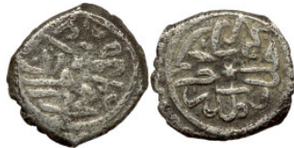
1010 Ottoman Empire (XIV-XX century) Silver Coin. Obverse: Arabic inscription. Reverse: Arabic inscription 10mm 0,59g0