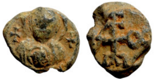
1239 Antiquities 13mm 5,16g0