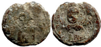
1237 Antiquities 17mm 5,86g0