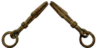
1185 Antiquities 45mm 3,12g0