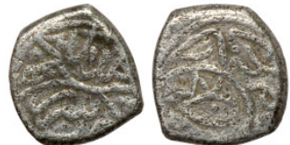
1012 Ottoman Empire (XIV-XX century) Silver Coin. Obverse: Arabic inscription. Reverse: Arabic inscription 9mm 1,01g0