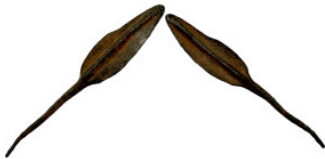
1183 Antiquities 51mm 2,62g0