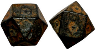
1197 Antiquities 9mm 5,87g0