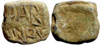
1236 Antiquities 18mm 7,93g0