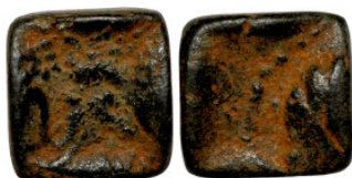
1201 Antiquities 10mm 2,97g0