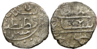
1011 Ottoman Empire (XIV-XX century) Silver Coin. Obverse: Arabic inscription. Reverse: Arabic inscription 10mm 0,87g0