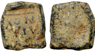
1181 Antiquities 20mm 8,85g0