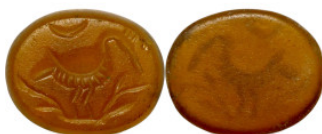
1204 Antiquities 15mm 1,32g0