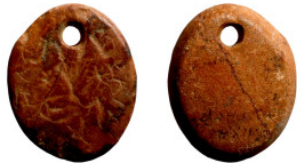
1210 Antiquities 23mm 3,45g0