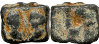
1199 Antiquities 12mm 5,27g0