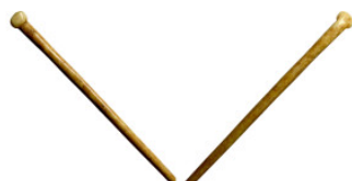
1206 Antiquities 110mm 2,13g0