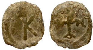
1182 Antiquities 21mm 7,84g0