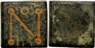
1196 Antiquities 12mm 4,29g0