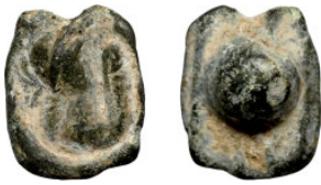
1195 Antiquities 16mm 4,51g0