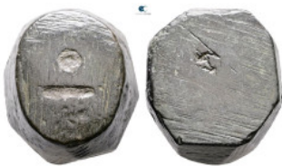
768 Byzantine. Weight \text{Æ} 21 mm, 32,07 g Fine