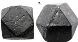
770 Islamic. Weight \text{Æ} 27 mm, 59,13 g Fine