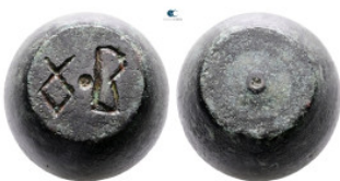
769 Byzantine. Weight \text{Æ} 22 mm, 53,88 g Very Fine