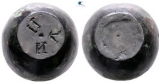
766 Byzantine. Weight \text{Æ} 23 mm, 50,75 g Very Fine