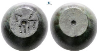
767 Byzantine. Weight \text{Æ} 25 mm, 82,53 g Very Fine