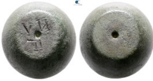
765 Byzantine. Weight \text{Æ} 23 mm, 53,82 g Very Fine