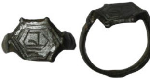
966 Ancient bronze stamp ring (20mm, 2,84g)