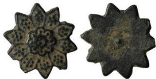
887 Ancient bronze appliqué of a flower (29mm, 4,70g)