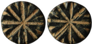
894 Bronze stamp (12mm, 1,45g)