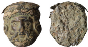
990 Ancient bronze appliqué (47mm, 105,99g)