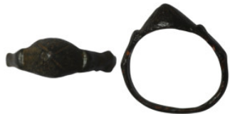
962 Ancient bronze ring with ornament (25mm, 3,48g)