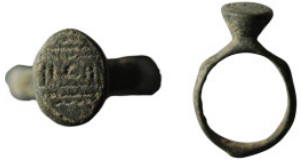
321 Ancient bronze stamp ring (30mm, 5,55g)