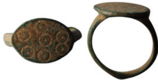
329 Byzantine bronze ring with eye motif (20mm, 2,97g)