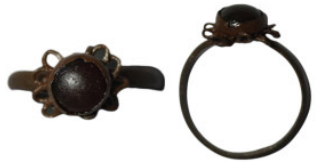
973 Ancient bronze ring with gemstone (20mm, 1,07g)