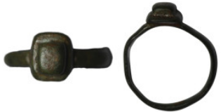
988 Ancient bronze ring with square ornament (25mm, 3,13g)