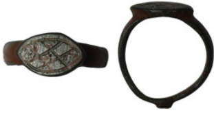
964 Ancient bronze stamp ring (21mm, 2,35g)