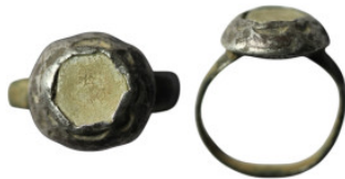
877 Ancient silver ring (22mm, 2,60g)