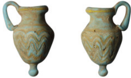
910 One handle cup (50mm, 13,73g)