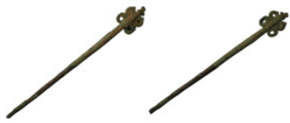
902 Ancient bronze medical instrument (106mm, 7,20g)