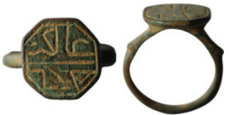
870 Ancient bronze stamp ring (27mm, 7,50g)