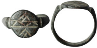
950 Ancient bronze stamp ring (20mm, 2,35g)