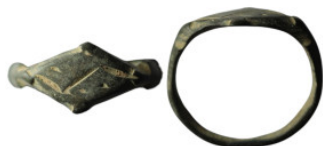
327 Ancient bronze ring with ornament (20mm, 2,06g)