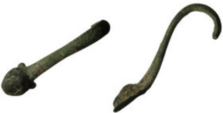
898 Ancient bronze handle (106mm, 64,93g)