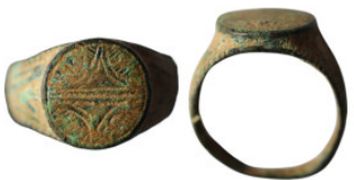
871 Ancient bronze stamp ring (23mm, 7,40g)