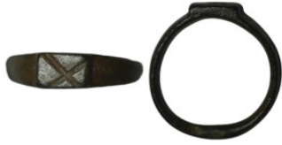
985 Ancient bronze ring with ornament (20mm, 1,67g)