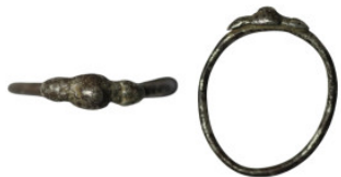
880 Ancient silver ring (27mm, 1,72g)