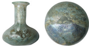
912 Glass Sprinkler Flask perfume bottle. Roman, 2nd-4th Century A.D (37mm, 8,18g)