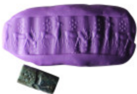
934 Mesopotamia 1840-1810 BC Lapis Lazuli Stone 28mm, 11,67g ex. Hedrini Collection, will be shipped with certificate!