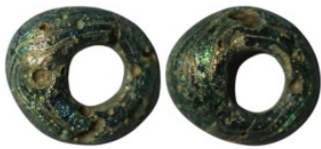
924 Ancient bead (14mm, 1,04g)