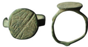
330 Ancient bronze stamp ring (25mm, 3,77g)