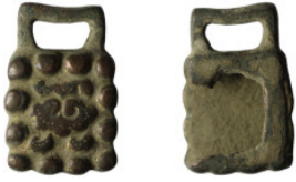
221 Ancient bronze object (20mm, 7,35g)