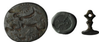
1026 Islamic bronze stamp seal (23mm, 5,01g)