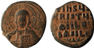
716 Anonymous Follis. Time of Basil II with Constantine VIII (AD 976-1025). Constantinople AE Follis (29mm, 9,16g) Artificial sandpatina