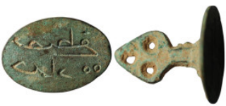
897 Islamic bronze stamp seal (26mm, 7,12g)