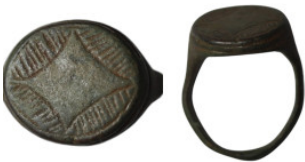
995 Ancient bronze ring with ornament (28mm, 9,12g)