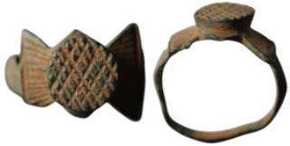
336 Ancient bronze ring with ornament (20mm, 3,95g)