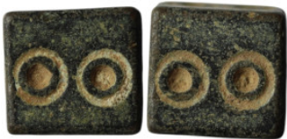
892 Byzantine weight (12mm, 14,59g)