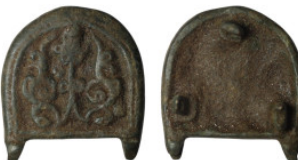
991 Ancient bronze belt buckle (33mm, 20,04g)