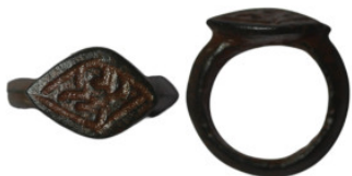
954 Ancient bronze stamp ring (19mm, 2,80g)