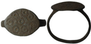
996 Byzantine bronze ring with eye motif (20mm, 2,40g)