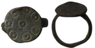
1032 Byzantine bronze ring with eye motif (21mm, 3,02g)