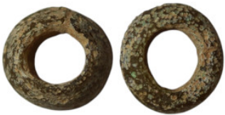
931 Ancient bead (12mm, 1,05g)