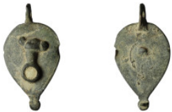
997 Ancient bronze appliqué (32mm, 2,33g)