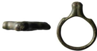
331 Ancient bronze ring (24mm, 2,74g)