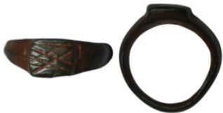
989 Ancient bronze stamp ring (17mm, 1,68g)