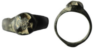
874 Ancient bronze ring with gemstone (25mm, 3,85g)