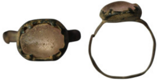
881 Ancient bronze ring with gemstone (23mm, 2,39g)