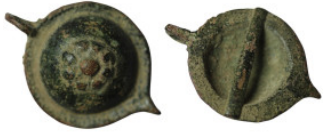
587 Roman bronze fibula. (circa 1st-3rd centuries AD) (44mm, 12,98g)