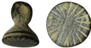
715 Ancient bronze stamp seal (11mm, 1,38g)