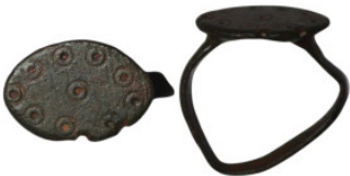
982 Byzantine bronze ring with eye motif (22mm, 2,56g)