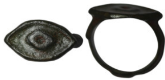
959 Byzantine bronze ring with eye motif (20mm, 3,34g)