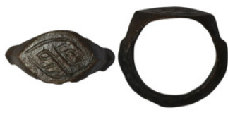
975 Ancient bronze stamp ring (22mm, 3,35g)