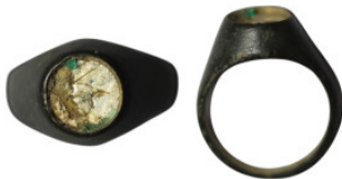
225 Ancient bronze ring with gemstone (24mm, 7,29g)