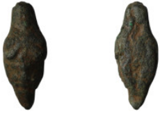
1027 Ancient bronze appliqué (32mm, 11,30g)