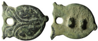
591 Ancient bronze belt buckle (31mm, 10,55g)