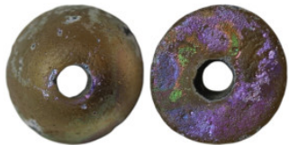
927 Ancient bead (18mm, 3,03g)