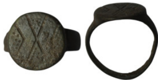
1025 Ancient bronze stamp ring (22mm, 3,91g)