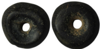
928 Ancient bead (15mm, 1,16g)