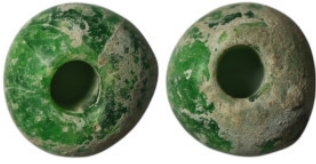
929 Ancient bead (12mm, 1,58g)