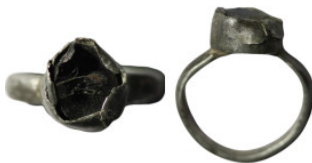
878 Ancient silver ring (22mm, 3,30g)