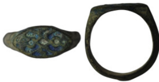
224 Ancient bronze ring with ornament (21mm, 3,33g)