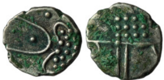
1033 World coin AR Silver (9mm, 0,37g)