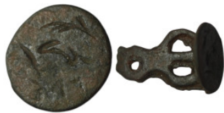
1008 Islamic bronze stamp seal (26mm, 6,07g)