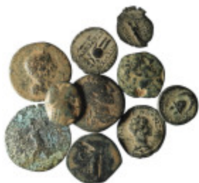
226 10 pieces mixed coins / SOLD AS SEEN, NO RETURN! Artificial sandpatina