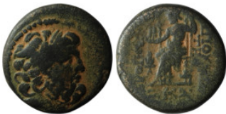
718 SYRIA, Seleucis and Pieria. Antioch. (1st century BC). AE Bronze (21mm, 7,41g)