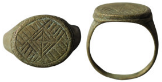
869 Ancient bronze stamp ring (23mm, 6,67g)