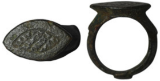
986 Ancient bronze stamp ring (23mm, 5,12g)