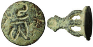
896 Byzantine stamp seal (24mm, 3,63g)