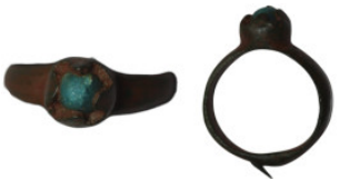
983 Ancient bronze ring with gemstone (22mm, 2,34g)