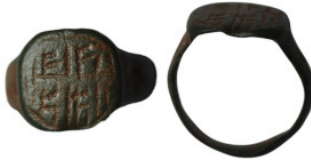
965 Ancient bronze stamp ring (20mm, 2,69g)