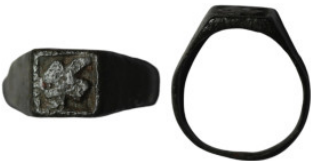
968 Ancient bronze ring with ornament (22mm, 3,21g)