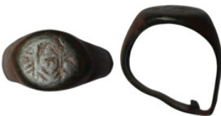
969 Ancient bronze stamp ring (20mm, 4,19g)