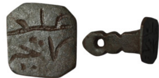
1009 Islamic bronze stamp seal (25mm, 4,95g)