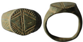
872 Ancient bronze stamp ring (22mm, 7,58g)