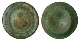
907 Roman glass tessera (?) (37mm, 11,45g)