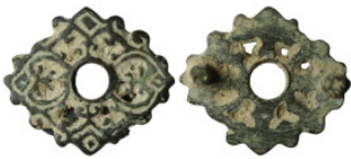
890 Ancient bronze appliqué (23mm, 2,94g)