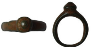
970 Ancient bronze ring with ornament (20mm, 1,98g)