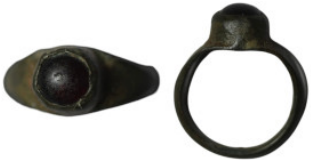
967 Ancient bronze ring with gemstone (19mm, 1,83g)