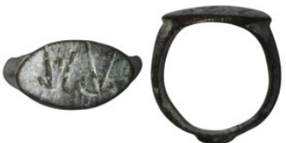
984 Ancient bronze stamp ring (20mm, 2,48g)