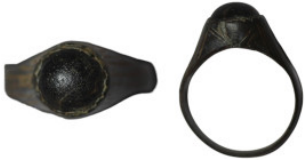
979 Ancient bronze ring with gemstone (25mm, 2,59g)