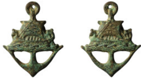
884 Ancient bronze appliqué of a anchor and galley (41mm, 15,74g)