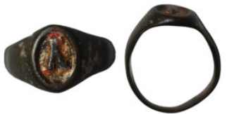
952 Ancient bronze stamp ring (21mm, 2,94g)