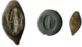
895 Ancient bronze stamp ring (20mm, 1,66g)