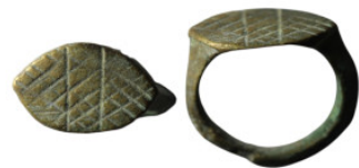
326 Ancient bronze ring with ornament (20mm, 3,14g)