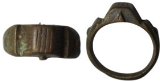
994 Ancient bronze ring with ornament (24mm, 8,39g)