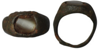
958 Ancient bronze ring with gemstone (25mm, 8,77g)