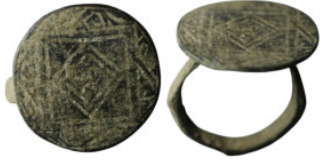
335 Ancient bronze ring with ornament (22mm, 6,01g)