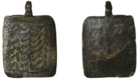
888 Ancient bronze appliqué (27mm, 2,97g)