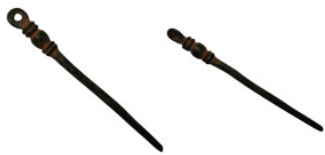
904 Ancient bronze medical instrument (78mm, 7,07g)