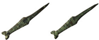
592 Ancient bronze object (60mm, 5,09g)