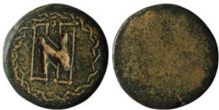
893 Byzantine weight (17mm, 4,20g) Obv: Large N within linear ornament Rev: Blank