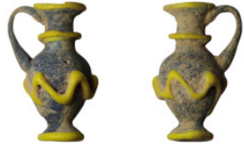
909 One handle cup (38mm, 10,10g)