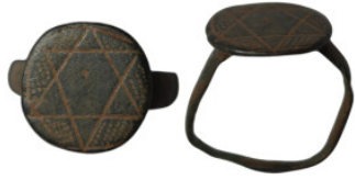
1006 Ancient bronze stamp ring (21mm, 3,39g)