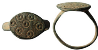
323 Byzantine bronze ring with eye motif (19mm, 2,37g)