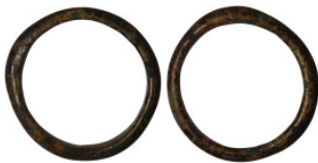
919 Roman glass ring (56mm, 10,95g)