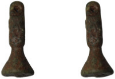
993 Byzantine stamp seal (32mm, 11,20g)