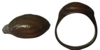
956 Ancient bronze ring with ornament (27mm, 7,96g)