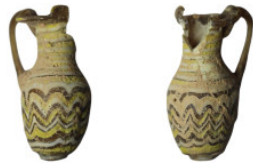
913 One handle cup (51mm, 10,28g)