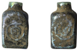
911 Ancient silver object (43mm, 15,33g)