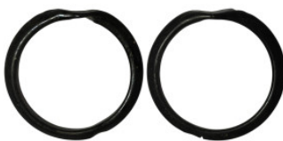
921 Roman glass ring (glass 61mm, 13,77g)