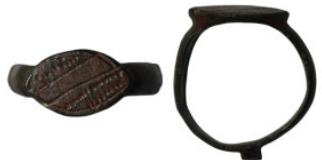
953 Ancient bronze stamp ring (22mm, 2,70g)