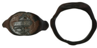
977 Ancient bronze stamp ring (22mm, 2,91g)