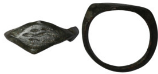
960 Ancient bronze ring with ornament (19mm, 2,32g)