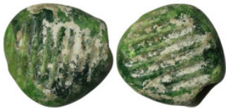
925 Ancient bead (17mm, 2,77g)