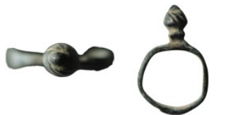
325 Islamic bronze ring with turban motif (28mm, 2,29g)