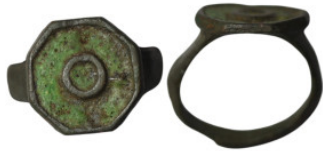
1007 Byzantine bronze ring with eye motif (25mm, 6,67g)