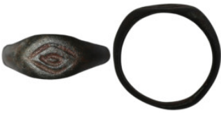
980 Ancient bronze stamp ring (16mm, 1,27g)