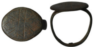
1031 Ancient bronze stamp ring (20mm, 2,77g)