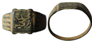
332 Islamic bronze stamp ring (20mm, 4,46g)