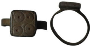
1023 Byzantine bronze ring with eye motif (26mm, 4,84g)