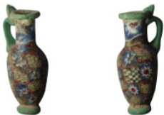
908 One handle cup (45mm, 9,62g)