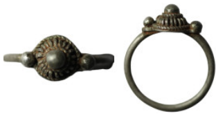
876 Ancient silver ring with ornament (25mm, 2,42g)