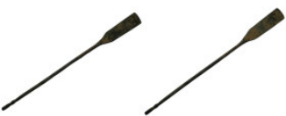
900 Ancient bronze medical instrument (170mm, 10,66g)