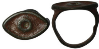
951 Byzantine bronze ring with eye motif (20mm, 4,14g)