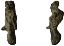
714 Ancient bronze figurine (22mm, 2,12g)