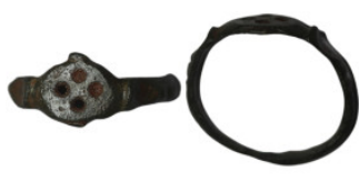
976 Ancient bronze ring with ornament (19mm, 1,69g)