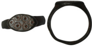
978 Byzantine bronze ring with eye motif (18mm, 2,21g)