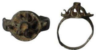
879 Ancient bronze ring with ornament (19mm, 1,42g)