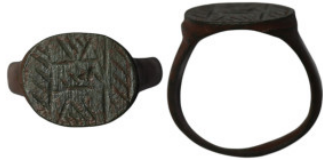
957 Ancient bronze stamp ring (22mm, 4,99g)