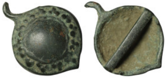
588 Roman bronze fibula. (circa 1st-3rd centuries AD) (35mm, 8,95g)