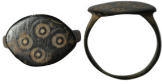
867 Byzantine bronze ring with eye motif (22mm, 3,25g)