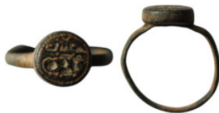
333 Islamic bronze stamp ring (24mm, 3,84g)