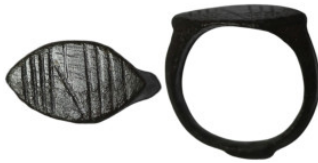
987 Ancient bronze stamp ring (25mm, 2,73g)