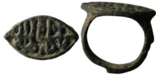
322 Ancient bronze stamp ring (18mm, 3,88g)