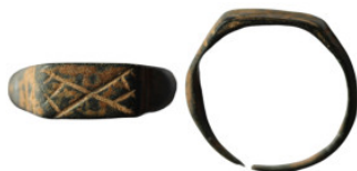
334 Ancient bronze ring with ornament (21mm, 2,64g)