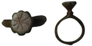
972 Ancient bronze ring with ornament (29mm, 4,32g)