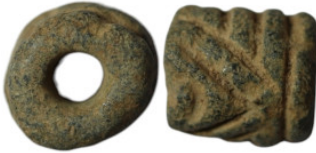
930 Ancient bead (12mm, 1,77g)