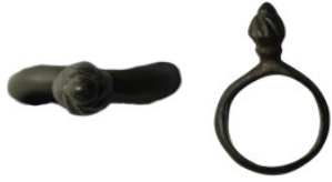
1020 Islamic bronze ring with turban motif (28mm, 2,31g)