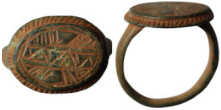
868 Ancient bronze stamp ring (23mm, 6,82g)