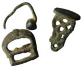
223 3 pieces ancient bronze objects