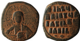
717 Anonymous Follis. Time of Basil II with Constantine VIII (AD 976-1025). Constantinople AE Follis (27mm, 7,08g) Artificial sandpatina