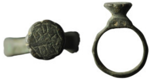
328 Ancient bronze stamp ring (27mm, 5,70g)