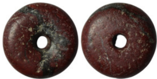
926 Ancient bead (20mm, 4,29g)