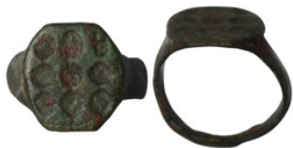
961 Ancient bronze stamp ring (22mm, 3,99g)