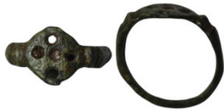
974 Ancient bronze ring with ornament (20mm, 1,62g)