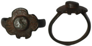
981 Ancient bronze ring with ornament (22mm, 3,71g)