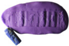
932 Mesopotamia 1840-1810 BC Lapis Lazuli Stone Pendant 30mm, 8,96g ex. Hedrini Collection, will be shipped with certificate!