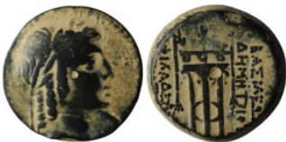
719 SELEUKID KINGS of SYRIA. Demetrios II Nikator, first reign (146-138 BC). Antioch on the Orontes AE Bronze (19mm, 5,51g) Artificial sandpatina