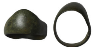
955 Ancient Archer Ring (30mm, 7,71g)