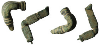
222 2 pieces ancient fibula