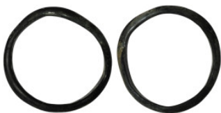
920 Roman glass ring (48mm, 6,57g)