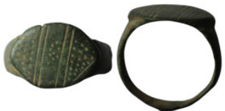
593 Ancient bronze ring with ornament (23mm, 4,26g)