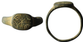
324 Byzantine bronze ring (21mm, 2,53g) Obv: Cross central X; ornament in corners