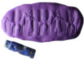
933 Mesopotamia 1840-1810 BC Lapis Lazuli Stone Pendant 35mm, 8,65g ex. Hedrini Collection, will be shipped with certificate!