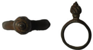
1024 Islamic bronze ring with turban motif (29mm, 3,24g)