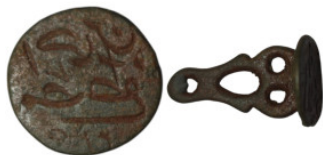
1010 Islamic bronze stamp seal (27mm, 3,97g)