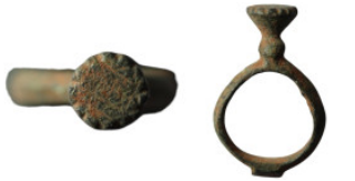
337 Ancient bronze ring with ornament (29mm, 3,78g)