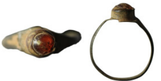
873 Ancient bronze ring with gemstone (25mm, 1,19g)