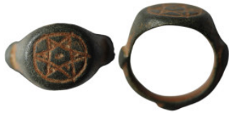
875 Ancient bronze stamp ring (20mm, 4,58g) Obv: Six pointed star