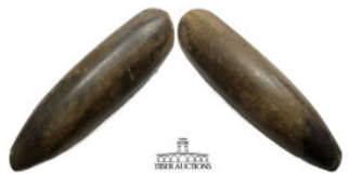
645 Egyptian, Uncertain time period. Carved black and brown granite tool with a fire hardened point. Our best guess is Circa 4th millennium BCE. 121 mm x 27 mm x 27 mm. 200 g.