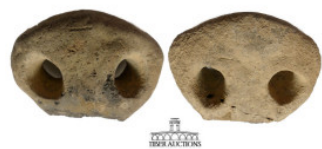
644 Mesopotamia, Circa 4th millennium BCE. Large head fragment of an Eye Goddess Idol with a pair of large "eyes" formed as two open cylinders. Provenance: 108 mm x 65 mm x 34 mm. 200 g.