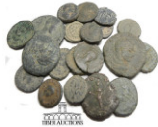
642 20 Ancient Roman bronze coins