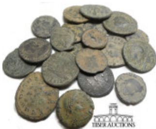
643 20 Ancient Roman bronze coins