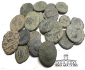
641 20 Ancient Roman bronze coins