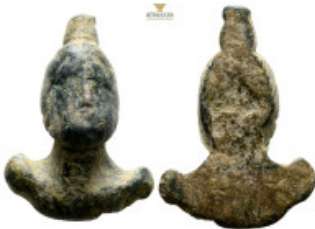
525 Ancient bronze bust of Serapis (22,2g 40,4mm)