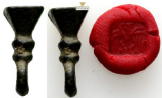
556 Islamic bronze stamp seal (4,96g)