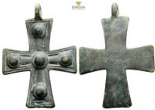
561 Byzantine bronze pendant cross (35,85g 79,1mm)