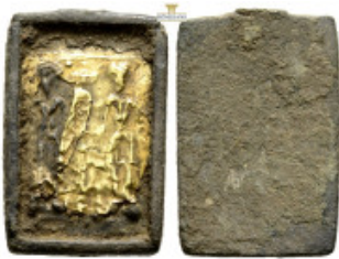
526 Ancient partially gold-plated bronze weight (3,31g 23mm)