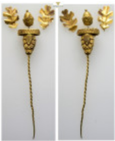
520 Ancient gold earring (6,92g 88,2mm)