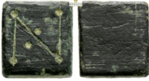
540 Byzantine bronze weight (4,2g 13mm)