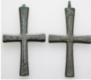
530 Byzantine bronze pendant cross (17,26g 55,4mm)