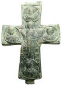
563 Byzantine bronze pendant cross (11,1g 77,8mm)