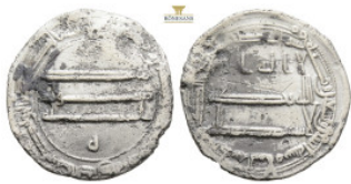
494 Abbasid caliphate.. AR Dirham, 2,66g 21mm