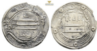
492 Abbasid caliphate.. AR Dirham, 2,63g 22,9mm