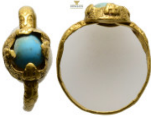
518 Ancient gold ring with gemstone (2,45g 23,5mm)