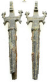
529 Ancient bronze tweezers (14,68g 75,2mm)