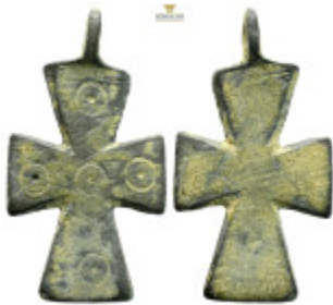
562 Byzantine bronze pendant cross (4,29g 28mm)