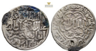
497 Islamic coin.. AR Dirham, 2,78g 23,9mm