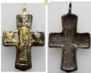
531 Byzantine pendant cross (12,06g 42,1mm)