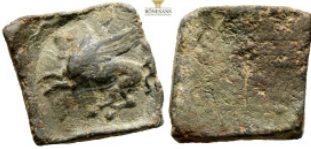
541 ASIA MINOR. Uncertain Lead Tessera, 12,91g 24,1mm Obv: Pegasos flying left Rev: Blank