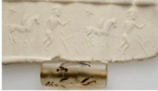
713 Near Eastern Stone Cylinder Seal (32,3mm 13,3g)