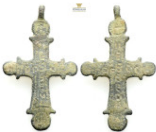
527 Byzantine bronze pendant cross (9,33g 61,5mm)