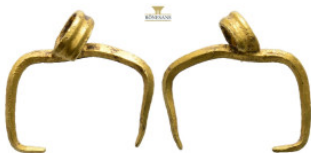
521 Ancient gold earring form crescent (0,43g 13,3mm)