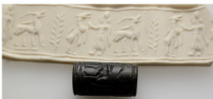
717 Near Eastern Stone Cylinder Seal (26mm 14,2g)