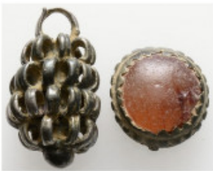
551 Ancient bronze earring and bronze ring with gemstone (6,65g)