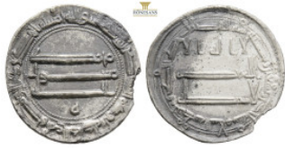
493 Abbasid caliphate.. AR Dirham, 2,62g 21,2mm