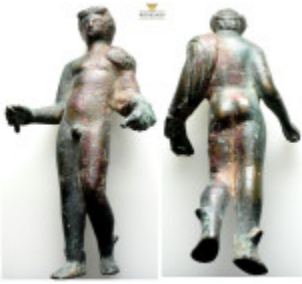
519 Ancient bronze figurine (350g 138mm)