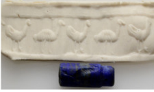
719 Near Eastern Stone Cylinder Seal (26,1mm 12,1g)