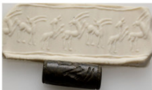
718 Near Eastern Stone Cylinder Seal (26,3mm 11,4g)