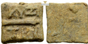
542 MYSIA. Kyzikos Lead Weight, 7g 19,1mm Obv: KYZ / TPI torch Rev: Blank