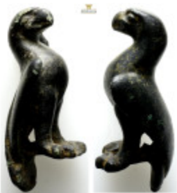
536 Ancient bronze figurine form eagle (98,72g 65mm)