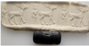
715 Near Eastern Stone Cylinder Seal (30,2mm 13,6g)