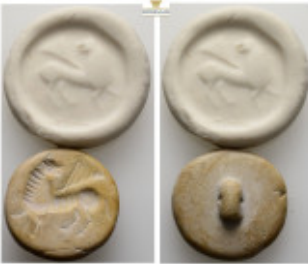
721 Near Eastern Stamp Seal (31,6mm) Obv: Winged mythical animal standing right, head left