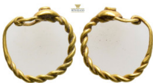
523 Ancient gold earring (0,85g 14,1mm)