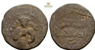
498 Artuqids of Mardin. Nasir al-Din Artuq Arslan, AH 597-637 / AD 1200-1239. AE Dirham, 11,63g 30,7mm