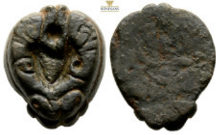
524 Ancient bronze applique (17,6g 23,8mm)