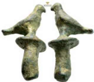
564 Ancient bronze figurine of eagle (18,54g 41,7mm)