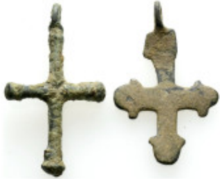
548 Byzantine bronze pendant cross (6,49g)