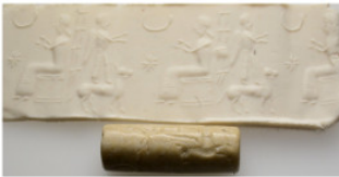
714 Near Eastern Stone Cylinder Seal (41,2mm 14g)