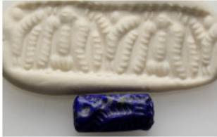
720 Near Eastern Stone Cylinder Seal (21,6mm 10g)