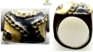
534 Ancient bronze ring with gemstone (13,62g 17,5mm)