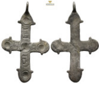
560 Byzantine silver pendant cross (4,54g 45,8mm)