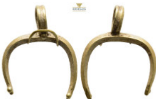
522 Ancient gold earring form crescent (0,95g 16,5mm)