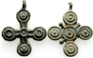
547 Byzantine bronze pendant cross