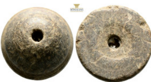
538 Ancient object (17,52g 29,2mm)