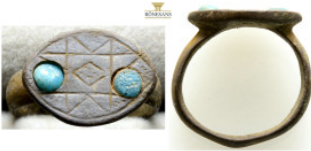
535 Ancient bronze ring with two gemstones (6,56g 18,4mm)