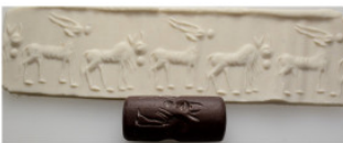
716 Near Eastern Stone Cylinder Seal (33,5g 15g)