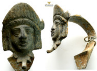
552 Ancient bronze handle (167g 65mm)