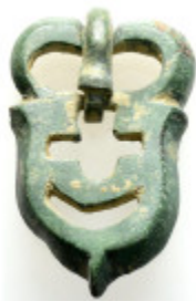
528 Ancient bronze belt buckle (16,85g)