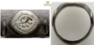
539 Ancient silver ring (7,98g 16,5mm)