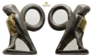
557 Ancient bronze pendant form eagle; eagle's breast gold plated (3,49g 16,3)