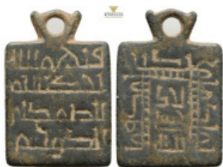
558 Islamic bronze amulet (5,77g 28,7mm)