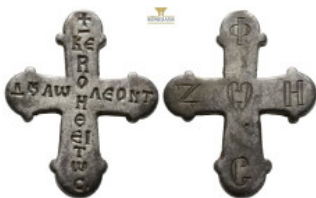
559 Byzantine silver pendant cross (10,32g 33,1mm)