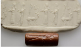
712 Near Eastern Stone Cylinder Seal