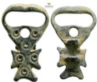
546 Byzantine bronze belt buckle (8,2g 38,1mm)