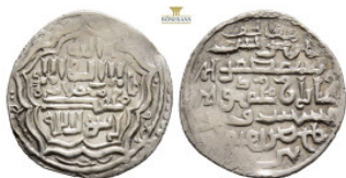
496 Islamic coin.. AR Dirham, 2,16g 20,8mm