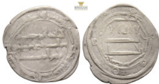
495 Abbasid caliphate.. AR Dirham, 2,72g 25,1mm