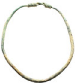
532 Ancient bronze bracelet (6,03g 55,5mm)