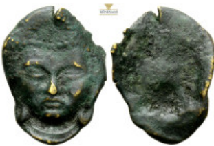
543 Ancient bronze applique (4,85g 29,7mm)