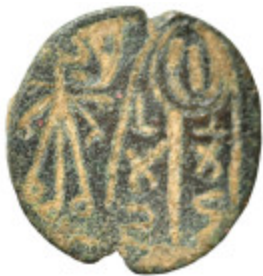
744 Ring head (bronze, 2.73 g). Sold as seen.