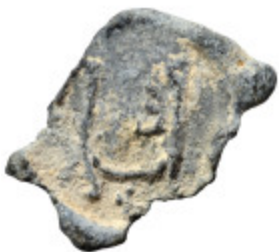
749 Uncertain. Seal (lead, 2.77 g, 19 mm). Sold as seen.