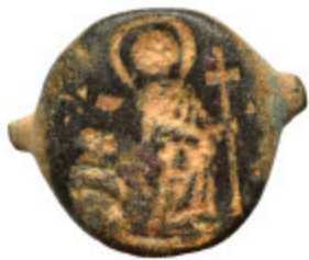
745 Ring head (bronze, 2.27 g). Sold as seen.