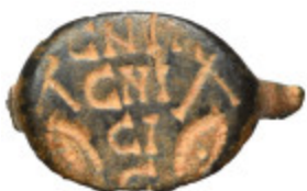
748 Ring head (bronze, 0.69 g). Sold as seen.