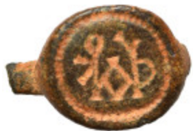
746 Ring head (bronze, 1.38 g). Sold as seen.