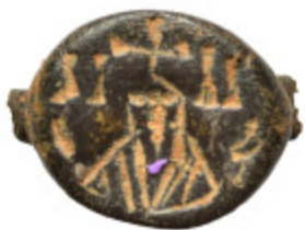
747 Ring head (bronze, 0.91 g). Sold as seen.