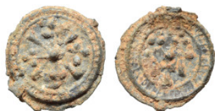
750 Amulet (lead, 0.80 g, 14 mm). Sold as seen.