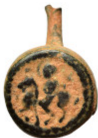
751 Amulet or pendant (bronze, 3.31 g, 12 mm). Sold as seen.