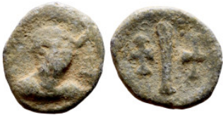
1197 Byzantine period - seal 12mm 1.71g