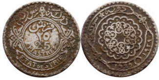
1244 Syria - 1929 - 25 Piastres 24mm 4.86g