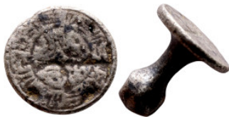
1179 Byzantine period - seal 19mm 8.38g