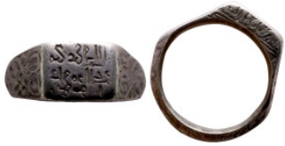
1177 Islamic period - Jewelry 23mm 7.43g