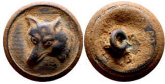
1169 Modern - artifact 23mm 4.47g