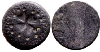
1237 Antik period - Jewelry 14mm 1.58g