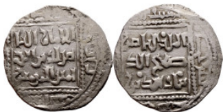
1249 Seljuk (1037-1157, Silver coin. Obverse: Arabic inscription. Reverse: Arabic inscription 22mm 2.92g