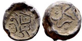
1172 Islamic period - seal 20mm 19.37g