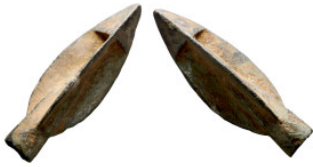
1163 Antik period - arrowhead 33mm 4.09g