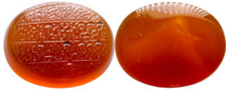
1160 Islamic period - Jewelry 28mm 11.88g