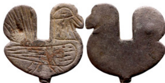
1193 Antik period - Jewelry 15mm 0.76g