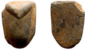
1231 Antik period - Jewelry 18mm 7.23g