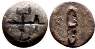
1240 Antik period - Jewelry 11mm 1.85g