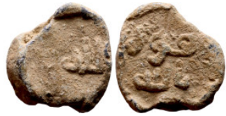
1170 Islamic period - seal 21mm 12.13g