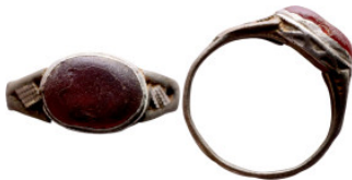
1178 Antik period - Jewelry 19mm 2.36g