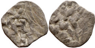
782 Middle Ages (X-XV century) Silver Coin 16mm 0.89g