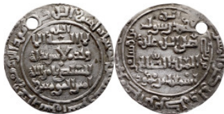
1243 Umayyad/Abbasid. Silver coin. Obverse: Arabic inscription. Reverse: Arabic inscription 25mm 2.77g