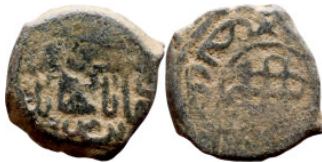
1191 Seljuk (1037-1157, Bronze coin. Obverse: Arabic inscription. Reverse: Arabic inscription 15mm 2.96g