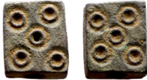
1189 Islamic period - Weight 13mm 3.84g