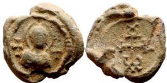
1186 Byzantine period - seal 18mm 6.81g