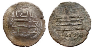
1242 Umayyad/Abbasid. Silver coin. Obverse: Arabic inscription. Reverse: Arabic inscription 24mm 3.93g