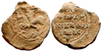
1218 Byzantine period - seal 23mm 8.96g