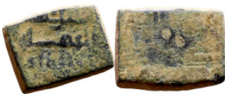
1204 Islamic period - Weight 9mm 0.97g