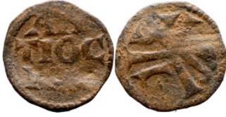
779 Middle Ages (X-XV century) Bronze Coin 16mm 1.12g