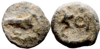
1200 Antik period - seal 12mm 1.25g