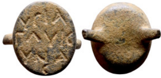
1181 Antik period - Jewelry 17mm 4.93g