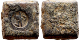
1188 Islamic period - Weight 12mm 5.78g