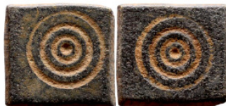
1194 Islamic period - Weight 11mm 2.89g