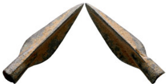
1164 Antik period - arrowhead 36mm 3.26g