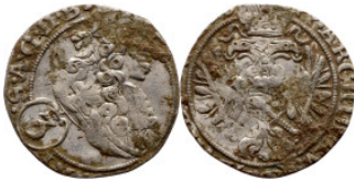
781 Austria - 3 Kreuzer - 1600-1700 16mm 1.09g