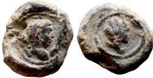
1175 Antik period - seal 18mm 9.32g