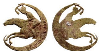
1208 Modern - artifact 43mm 11.56g