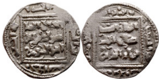
1247 Seljuk (1037-1157, Silver coin. Obverse: Arabic inscription. Reverse: Arabic inscription 22mm 2.90g