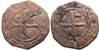
784 Middle Ages (X-XV century) Silver Coin 16mm 0.93g