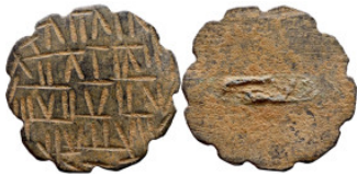
1171 Islamic period - seal 23mm 1.85g