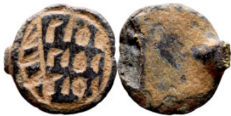
1199 Antik period - Jewelry 12mm 0.84g