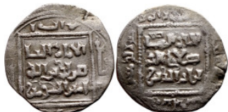
1250 Seljuk (1037-1157, Silver coin. Obverse: Arabic inscription. Reverse: Arabic inscription 21mm 2.90g