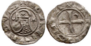
780 Principality of Antioch. Bohemond III (1163-1201) Denier. Antioch. Obverse: BOAMVHDVS, helmeted and mailed head left; crescent before, star behind Reverse: + ANTI:OCHIA, cross pattée; crescent in second quarter 16mm 0.63g