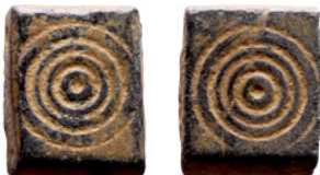
1187 Islamic period - Weight 14mm 5.58g