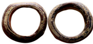
1176 Antik period - Jewelry 18mm 1.07g