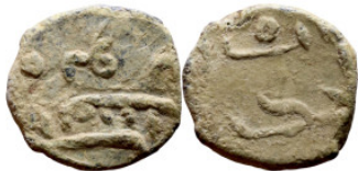
1201 Islamic period - seal 12mm 1.31g