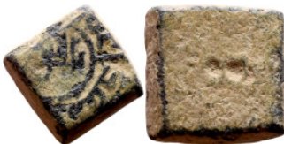
1206 Islamic period - Weight 8mm 1.44g