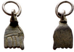
1202 Antik period - Jewelry 16mm 0.51g