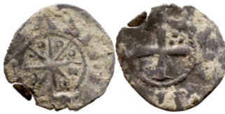
1190 Middle Ages (X-XV century) 14mm 0.34g