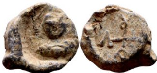
1173 Byzantine period - seal 20mm 8.00g