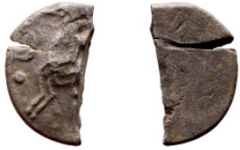
1161 Antik period - Weight 26mm 7.18g