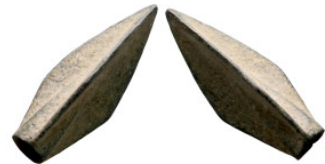
1166 Antik period - arrowhead 30mm 4.46g