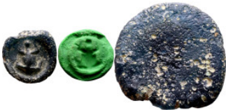
1219 Antik period - seal 21mm 2.13g