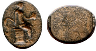
1216 Antik period - Jewelry 27mm 13.37g