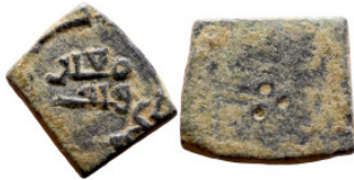
1203 Islamic period - Weight 11mm 1.39g