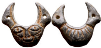
1162 Antik peroid - Figurine 24mm 3.06g