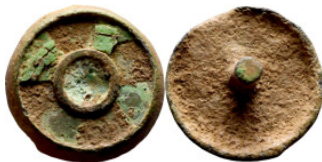
1180 Antik period - Jewelry 16mm 2.42g