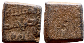
1207 Islamic period - Weight 8mm 0.91g