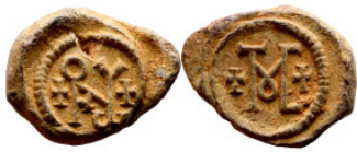
1232 Byzantine period - seal 19mm 5.83g