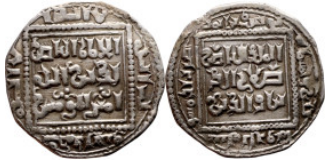
1245 Seljuk (1037-1157, Silver coin. Obverse: Arabic inscription. Reverse: Arabic inscription 22mm 2.89g