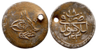
1246 Ottoman Empire (XIV-XX century) Silver Coin. Obverse: Arabic inscription. Reverse: Arabic inscription 23mm 2.64g