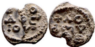
1185 Byzantine period - seal 19mm 4.90g