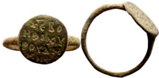
1233 Antik period - Jewelry 22mm 2.79g