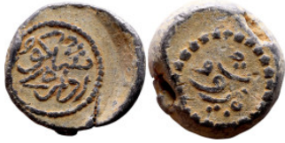
1174 Islamic period - seal 19mm 11.51g