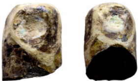
1235 Antik period - Jewelry 12mm 1.28g