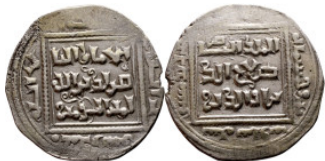
1248 Seljuk (1037-1157, Silver coin. Obverse: Arabic inscription. Reverse: Arabic inscription 23mm 2.97g