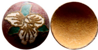
1239 Antik period - Jewelry 12mm 0.96g