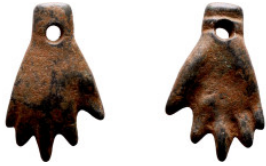
1182 Antik period - Jewelry 23mm 3.88g