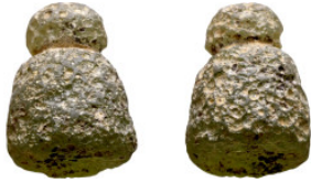
1217 Antik period - Jewelry 27mm 11.68g