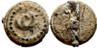
1238 Islamic period - seal 12mm 2.14g