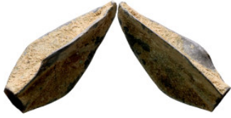
1167 Antik period - arrowhead 25mm 1.93g