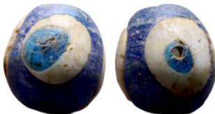
1192 Antik period - Jewelry 14mm 3.89g