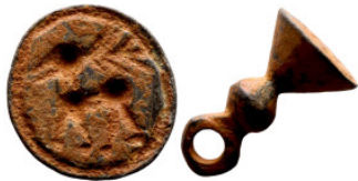
1220 Antik period - seal 24mm 7.18g