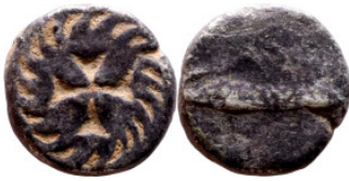
1205 Antik period - Jewelry 10mm 1.17g