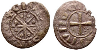
783 Middle Ages (X-XV century) Silver Coin 14mm 0.40g