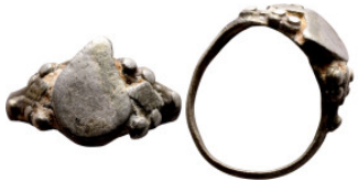
1234 Antik period - Jewelry 16mm 1.84g