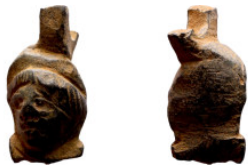
1221 Antik period - Jewelry 23mm 9.68g