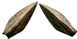
1165 Antik period - arrowhead 33mm 3.76g