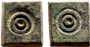
1184 Islamic period - Weight 13mm 5.89g