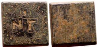
1222 Byzantine period - Weight 17mm 13.20g