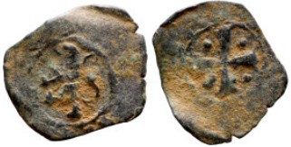
785 Middle Ages (X-XV century) Bronze Coin 15mm 0.57g