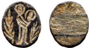
1241 Antik period - Jewelry 9mm 0.59g