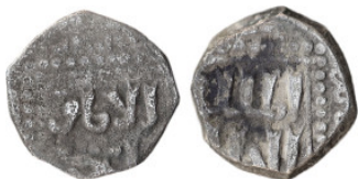
769 Islamic Coin, AR Dirham, (11 mm, 1.41 g).