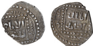
776 Islamic Coin, AR Dirham, (14 mm, 1.50 g).