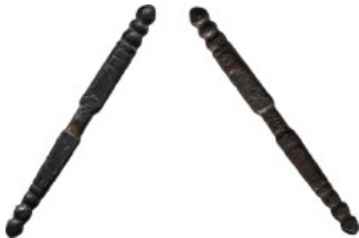
942 This beautifully engraved Roman bronze antique is a unique artifact that reflects the skill of the craftsmen of ancient times. ( 6.3 cm, 6.64 g).