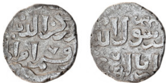
784 Islamic Coin, AR Dirham, (12 mm, 0.91 g).