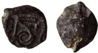
895 Byzantine period - seal. (11 mm, 1.25 g)