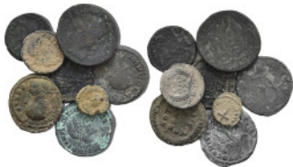
528 Roman Empire, Lot of 8 Coins Follis (21.56 g)