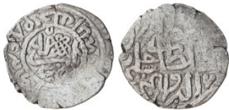
766 Islamic Coin, AR Dirham, (19 mm, 2.80 g).