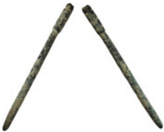
947 Antique bronze, ( 7.7 cm, 9.20 g).