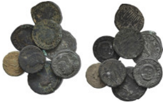
524 Roman Empire, Lot of 8 Coins Follis (26.09 g)