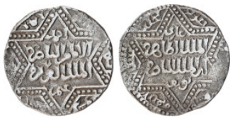
782 Islamic Coin, AR Dirham, (19 mm, 2.89 g).