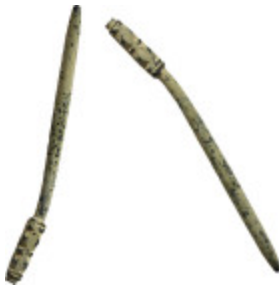
952 Antique bronze, ( 7.7 cm, 7.88 g).