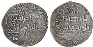
774 Islamic Coin, AR Dirham, (19 mm, 2.90 g).