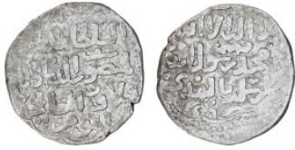
779 Islamic Coin, AR Dirham, (21 mm, 3.30 g).