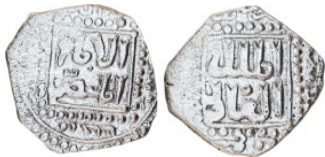
775 Islamic Coin, AR Dirham, (15 mm, 1.44 g).