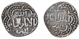
783 Islamic Coin, AR Dirham, (12 mm, 1.10 g).