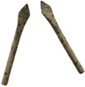
950 Antique bronze, (5.4 cm, 4.78 g).