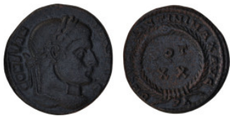
481 Constantine I 307 - 337 AD. Bronze Follis (17 mm, 3.00 g) Obv: DN CONSTANTINI MAX AVG around laurel wreath. Rev: VOT XX in wreath