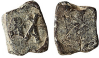
892 Byzantine period - seal. (19 mm, 5.20 g)