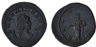
484 Salonina 254-268 AD. Antoninianus (22 mm, 4.26 g.). Antioch. Obv: SALONINA AVG Diademed and draped bust of Salonina to right, resting on a crescent. Rev: SALVS AVG Salus standing front, head to right, feeding serpent out of patera.