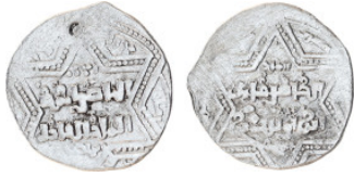
764 Islamic Coin, AR Dirham, (20 mm, 2.71 g).