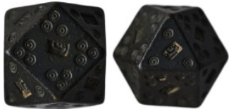
941 Byzantine Weight The weight is characterized by multiple faces decorated with precise geometric engravings that represent the development of arts and techniques in the Byzantine era. The presence of squares and triangles, and their combination with small circles, indicates the craftsmen's interest in showing balance and harmony in the design. While geometric shapes were not merely decorations, they carried symbols and meanings. Circles often symbolize perfection or infinity, while squares and triangles indicate stability and order. This attention to detail reflects the symbolic and artistic dimension of the piece. (27 mm, 59.69 g)