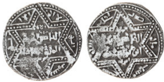
781 Islamic Coin, AR Dirham, (19 mm, 2.87 g).