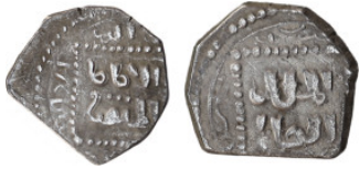
765 Islamic Coin, AR Dirham, (14 mm, 1.23 g).