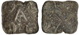
946 Antique bronze, (4.1 cm, 32.41 g).