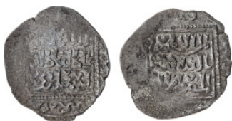
770 Islamic Coin, AR Dirham, (21 mm, 1.93 g).