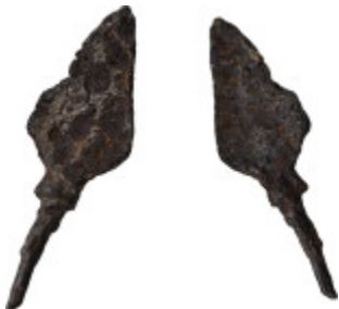
944 Antique Bronze Arrowhead. (5.2 cm, 4.39 g).