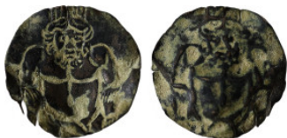
896 Antique looks like a unique piece of art featuring an engraving showing a strange looking man, with his upper body muscular, wearing a crown on his head. This piece may be inspired by mythology or ancient cultures, where it represents a royal or heroic figure.. (25 mm, 1.55 g)