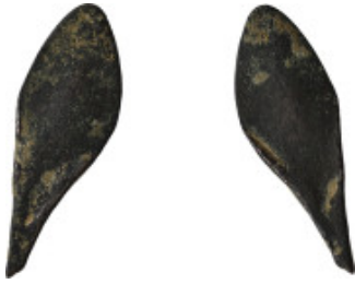
940 Roman bronze antiquies. (35 mm, 3.19 g).