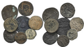
527 Roman Empire, Lot of 8 Coins Follis (19.42 g)