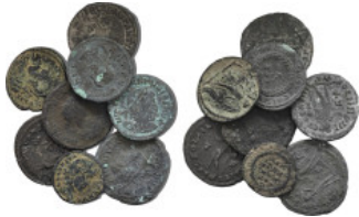
525 Roman Empire, Lot of 8 Coins Follis (20.22 g)