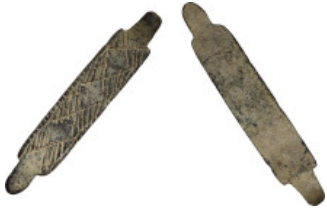
945 Antique bronze, (5.7 cm, 5.00 g).