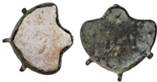
943 This bronze pendant with gemstone is an antique piece of art, featuring an elegant design inspired by traditional styles. (32 mm, 9.38 g).