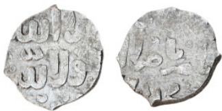
767 Islamic Coin, AR Dirham, (11 mm, 0.67 g).