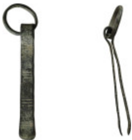
949 Antique bronze, (4.9 cm, 5.44 g).