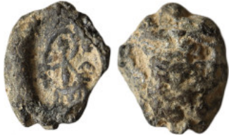
893 Byzantine period - seal. (19 mm, 4.37 g)