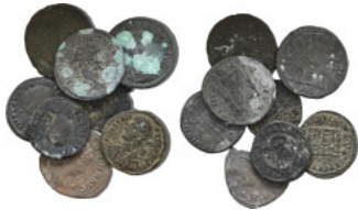
526 Roman Empire, Lot of 8 Coins Follis (23.61 g)