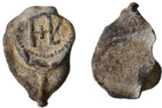
894 Byzantine period - seal. (18 mm, 3.18 g)