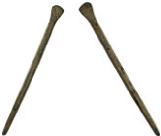
948 Antique bronze, ( 7.1 cm, 4.33 g).