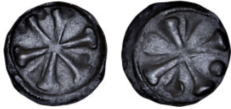
479 Roman Empire Coin, AE (17mm, 0.70 g)