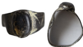
954 Antique ring with gemstone is a type of jewelry that features traditional or ancient designs. (24 mm, 3.23 g).