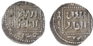
773 Islamic Coin, AR Dirham, (14 mm, 1.46 g).