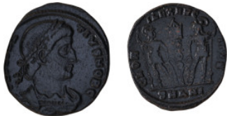
482 Constantius II 337-361 AE Follis (16 mm, 1.52 g) Antioch Obv: CONSTANTIVS AVG, pearl-diademed head right Rev: GLORIA EXERCITVS, two soldiers holding spears and shields with one standard between them with dot to left and right of the banner, SMANI.