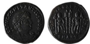
483 Constantius II Æ Follis. Antioch, AD 330-335. (16 mm, 2.66 g) Obv: FL IVL CONSTANTIVS NOB C, laureate cuirassed bust right. Rev: GLORIA EXERCITVS, two soldiers standing holding spears, shields, and two military standards between them, SMANZ in ex.