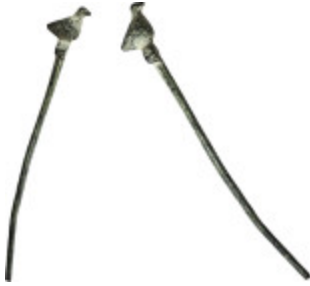
951 Antique bronze, (6.8 cm, 2.89 g)