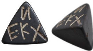
953 Antique weight in the shape of a triangle with Latin letters engraved on it. ( 19 mm, 8.13 g).