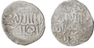
771 Islamic Coin, AR Dirham, (17 mm, 2.00 g).