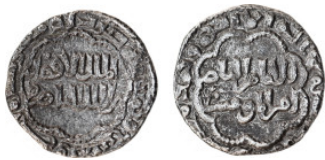
768 Islamic Coin, AR Dirham, (15 mm, 1.32 g).