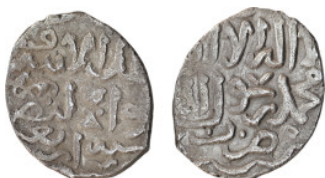
777 Islamic Coin, AR Dirham, (17 mm, 2.06 g).