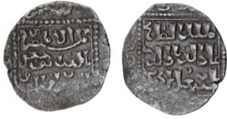
778 Islamic Coin, AR Dirham, (19 mm, 1.82 g).