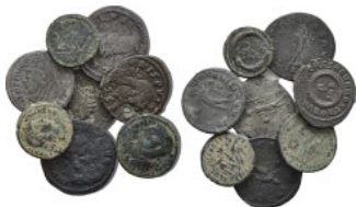
529 Roman Empire, Lot of 8 Coins Follis (21.63 g)