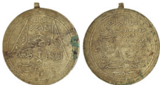
897 Islamic souvenir piece with a Quranic surah written on it. (4.3 mm, 7.76 g).