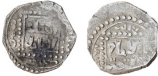
772 Islamic Coin, AR Dirham, (14 mm, 1.45 g).