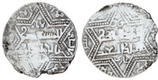
780 Islamic Coin, AR Dirham, (21 mm, 2.65 g).