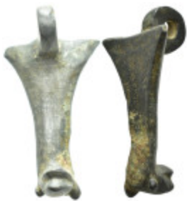
664 Bronze figure pendant (15 Gr. 41mm.)