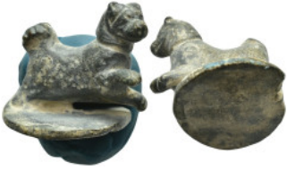
668 Bronze oil lamp cover with lion. (31mm, 47.2 g)