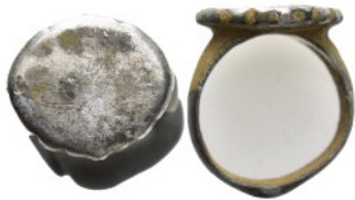
701 Silver ring. (9.4 Gr. 13mm.)