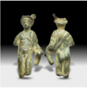
639 Bronze figure of Hermes. (53mm, 42.9 g)