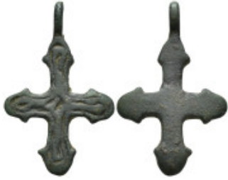
661 Bronze cross pendant. (4.6 Gr. 32mm.)