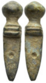
693 modern book buckle (6.3 Gr. 32mm.)