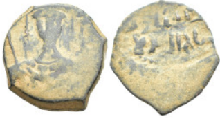
578 Uncertain Byzantine Coins (3.4 Gr. 17mm.)