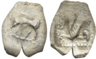
240 Greek coin. (6mm, 0,13 g)