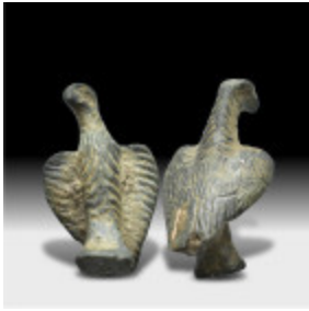
634 Bronz eagle staute. (18.2 Gr. 37mm.)