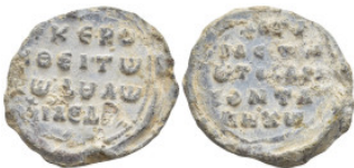
583 BYZANTINE LEAD SEAL. (7.2 Gr. 22mm.) Legend in 4 lines. Rev. Legend in 5 lines.