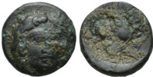
244 Uncertain Greek Coins (0.98 Gr. 9mm.)