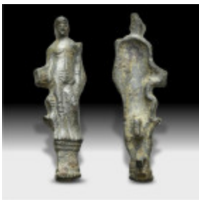
637 Bronze figure (52.9 Gr. 89mm.)