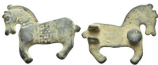
649 A horse shaped belt buckle (9.9 Gr. 39mm.)