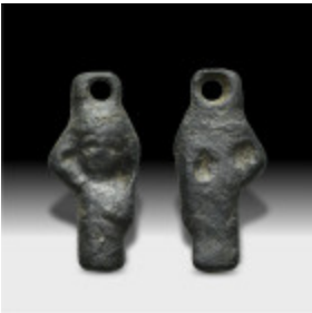
640 Bronze figure pendant (6.3 Gr. 31mm.)