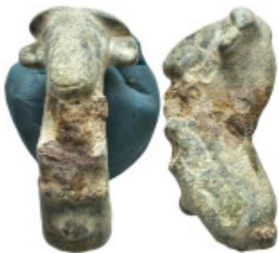
665 Bronze figurine. (49mm, 72.8 g)