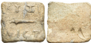
691 Mysia, Kyzikos. PB Lead Hellenistic balance weight. Circa 330 - 30 BC. 49.75 Gr. 39mm.