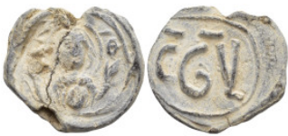
582 BYZANTINE LEAD SEAL. (4.9 Gr. 20mm.)