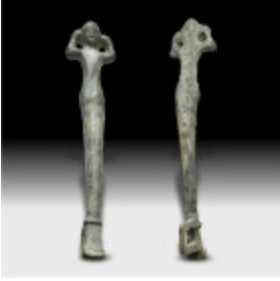
638 Bronze figure (61.9 Gr. 117mm.)