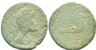
352 Uncertain Roman Provincial Coins (6.9 Gr. 24mm.)