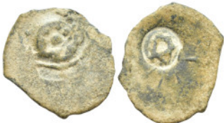
243 Uncertain Greek Coins (0.9 Gr. 15mm.)