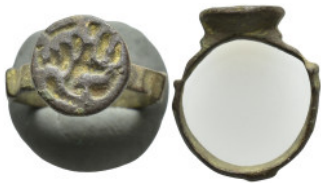
646 A Bronze ring . (5.2 Gr. 16mm.)