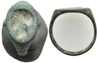
644 A Bronze ring . (4.3 Gr. 16mm.)