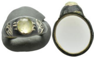
648 A bronze ring with stone. (4.67 Gr. 13mm.)