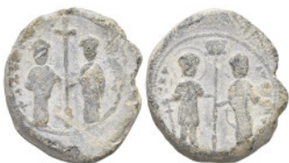
584 BYZANTINE LEAD SEAL. (7.3 Gr. 17mm.)