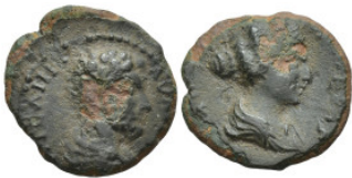
349 Roman Provincial coin. (19mm, 3.5 g)