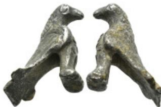
696 Roman period silver eagle pendant. (5 Gr. 22mm.)