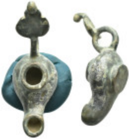
669 Bronze oil lamp. (67mm, 36.9 g)