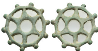
698 Rome 2nd century AD. A bronze discoid. (22 Gr. 45mm.)