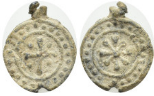
687 Lead pendant (12mm, 1.1 g)