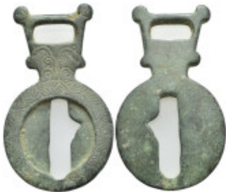
677 Bronze, Belt-buckle (13.7 Gr. 27mm.)