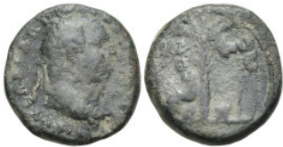
348 Roman Provincial coin. (16mm, 4.1 g)