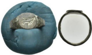
658 Bronze coin. (10mm, 2.3 g)