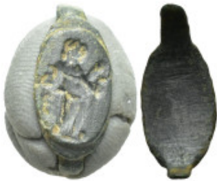
670 Bronze ring part. (0.8 Gr. 15mm.)