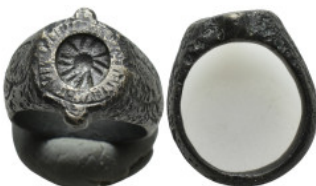
672 Bronze ring. (10.9 Gr. 12mm.)