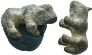
656 Bronze bull figurine. (41mm, 50.2 g)