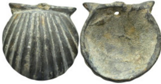
675 Bronze shell. (40mm, 52.9 g)