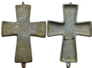
679 Byzantine pendant cross reliquary. (84.8 Gr. 90mm.)