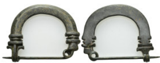
663 BRONZE FIBULA. (45 Gr. 50mm.)