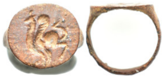
647 A Bronze ring . (5.6 Gr. 21mm.)