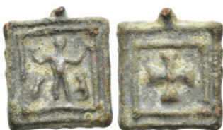
692 Pendant with human and animal figures on one side and a cross within a square on the other side. (2.2 Gr. 11mm.)