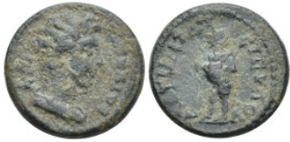
347 Roman Provincial coin. (15mm, 2.4 g)