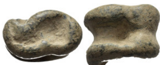
667 Bronze knuckle bones weight. (24mm, 30.1 g)