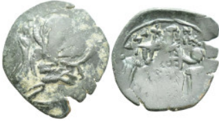
579 Uncertain Byzantine Coins (2.2 Gr. 22mm.)