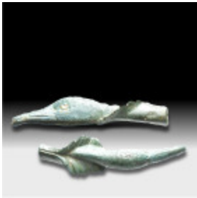
635 Bronze duck head. (50mm, 11.8 g)