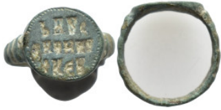
674 Bronze ring. (3.9 Gr. 13mm.)