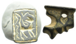
676 Bronze stamp seal. (13.2 Gr. 17mm.)