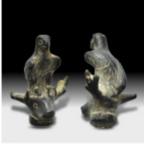
633 Ancient Roman Bronze eagle/deer figurine (1ST-5TH CENTURY AD) (19.3 Gr. 33mm.)