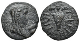
350 Uncertain Provincial Coins AE (1.9 Gr. 14mm.)