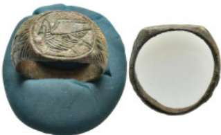
659 Bronze coin. (13mm, 4.7 g)