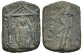
657 Bronze coin weight. (15mm, 2.8 g) Pamphylia, Perge. Obv: temple of Artemis. Rev: bow and quiver.