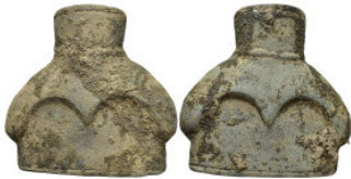
703 Uncertain antiques (101.2 Gr. 61mm.)