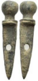
694 modern book buckle (6.8 Gr. 41mm.)