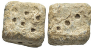
695 Roman Large Dice 2nd-4th century AD. (25 Gr. 14mm.)