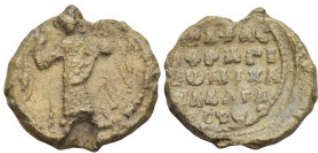
581 BYZANTINE LEAD SEAL. (4.4 Gr. 19mm.)