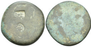
242 Uncertain Ancient Coins (11.4 Gr. 27mm.)