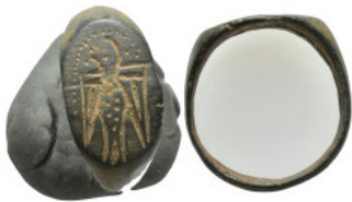
645 A Bronze ring . (4.8 Gr. 19mm.)