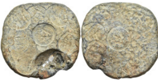
689 Lead weight (45mm, 84.13 g)