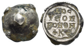
702 Silver stamp seal. (2.6 Gr. 14mm.)