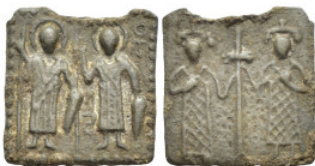
690 Lead weight. Obv: Two nimbate figure standing facing, holding spear and shield. Rev: Two crowned figure tanding facing holding long cross. (16mm, 1.6 g)