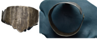
700 Silver ring. (42mm. 17.4 g)