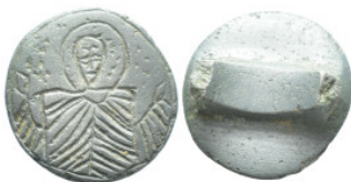
671 Bronze ring part. (3.9 Gr. 17mm.)