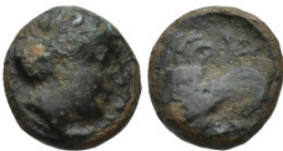
245 Uncertain Greek Coins (1.2Gr. 9mm.)