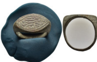
673 Bronze ring. (17mm, 5.8 g)