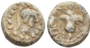
241 Greek coin. (9mm, 1.7 g)