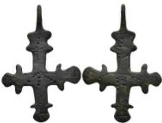
660 Bronze cross pendant. (3.3 Gr. 36mm.)