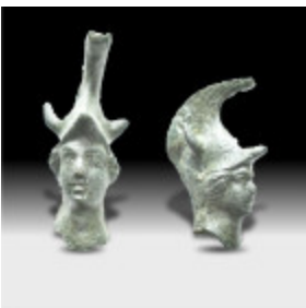
642 Bronze helmeted head. (44mm, 38,3 g)