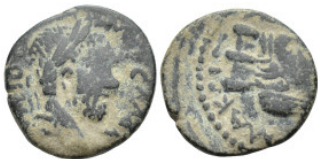
351 Uncertain Roman Provincial Coins (2.9 Gr. 17mm.)