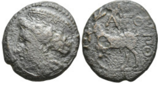
239 Greek coin. (18mm, 6.6 g)