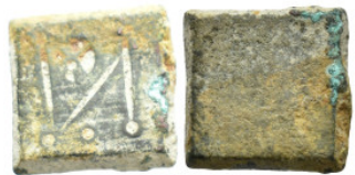
678 Byzantine Coin weights. 4th-5th centuries. AE solidi weight (4.5 Gr. 13mm.). Square type. N Rev. Blank.