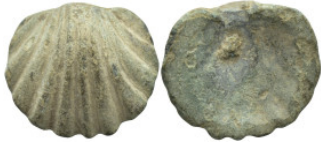
643 A bronze oyster shell (25 Gr. 32mm.)