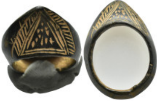
655 Bronze archer's ring. (10.6 Gr. 22mm.)