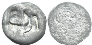
704 Uncertain antiques (4.1 Gr. 22mm.)