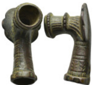
705 Unidentified period PIPE. (10 Gr.33mm.)