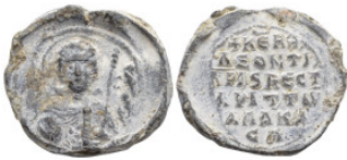
580 BYZANTINE LEAD SEAL. (6.3 Gr. 19mm.) Nimbate facing bust of Saint George, holding spear over his right shoulder and shield on his left arm Rev: Legend in 6 lines.