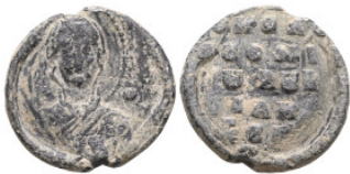
852 Byzantine Lead Seals, 7th - 13th Centuries. Weight:6,9 gr Diameter:22,3 mm