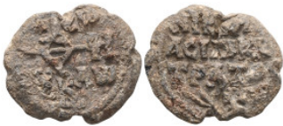
850 Byzantine Lead Seals, 7th - 13th Centuries. Weight:10 gr Diameter:24,8 mm