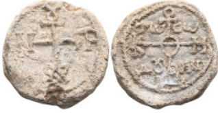
848 Byzantine Lead Seals, 7th - 13th Centuries. Weight:24,4 gr Diameter:27,8 mm