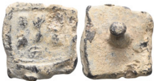
851 Byzantine Lead Seals, 7th - 13th Centuries. Weight:13,5 gr Diameter:26,8 mm