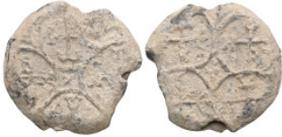
849 Byzantine Lead Seals, 7th - 13th Centuries. Weight:12 gr Diameter:24,8 mm