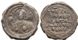
854 Byzantine Lead Seals, 7th - 13th Centuries. Weight:13,8 gr Diameter:25,5 mm