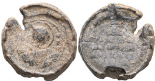
853 Byzantine Lead Seals, 7th - 13th Centuries. Weight:18,7 gr Diameter:27,7 mm