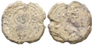
1142 PB Byzantine lead seal. Obv: Half-length of Saint Rev: Obv: Half-length of Saint. Weight: 12.83 g. Diameter: 26.56 mm.