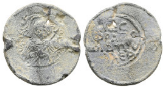
1144 PB Byzantine lead seal. 16.16 g. 31.26 mm.