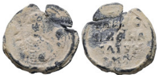
1145 PB Byzantine lead seal. 4.36 g. 20.35 mm.