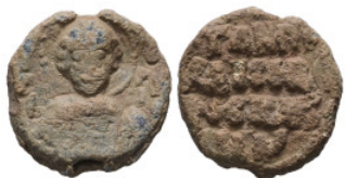
1146 PB Byzantine lead seal. 4.43 g. 17.12 mm.