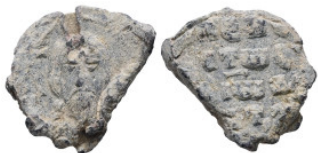
1147 PB Byzantine lead seal. 5.24 g. 19.11 mm.