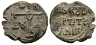
1143 PB Byzantine lead seal. 10.19 g. 29.03 mm.