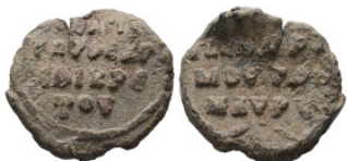
1148 PB Byzantine lead seal. 6.09 g. 20.91 mm.