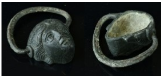
924 Roman Period A door knocker designed in the shape of a woman's face 117 g - 65 x 53 mm