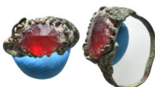
964 Ancient ring with gemstone 2,08 g