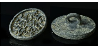
979 Byzantine (8th-10th century) A huge stamp with legends. 650 g - 111 mm