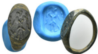
959 Ancient bronze ring 6,15 g - 23,88 mm