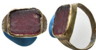
966 Ancient ring with gemstone bronze 5,36 g