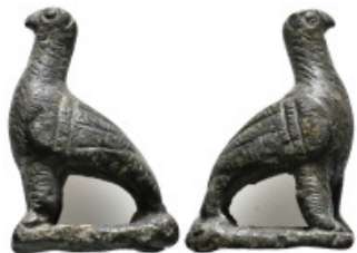
926 Roman Bronze eagle statue 62,08 g - H 43,47 mm