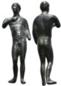
913 Antiquities Bronze nude male statuette. 35,41 g - H 67,70 mm