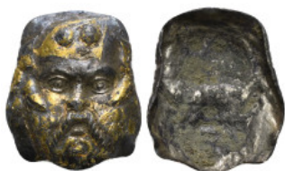
920 Silver, gold plated face of a bearded man's face (Silenos?) 3,06 g - 24,12 mm