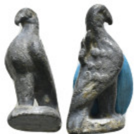
1001 Eagle statue 10,94 g - 25,11 mm