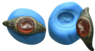
957 Roman Ring with Dolphin Gemstone 2nd-3rd century A.D. 0,99 g - 18,53 mm