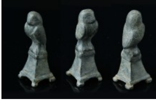
911 Antiquities ANCIENT ROMAN BRONZE OWL STATUETTE.(1st-2nd century).Ae. 41,37 g - H 51,65 mm