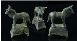
923 Roman bronze figure: humped bull (AD 1st - 3rd centuries) A bronze cast figure of a humped bull on a pedestal. 37,72 g - H 50 mm