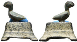
929 Roman Bronze bird statue 22,46 g - H 37,00 mm