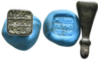
974 Bronze byzantine seal 10,32 g - 27,05 mm