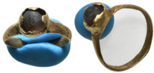
969 Ancient ring with gemstone bronze 2,03 g