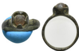
963 Ancient bronze ring with gemstone 2,75 g