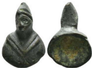
919 Roman bronze face applique 11,74 g - 30,30 mm