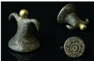
933 A seal reminiscent of a two-armed with gold details. Probably early period. 39,20 g - H 33,02 mm