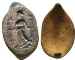
961 Ancient bronze ring 2,89 g - 20,10 mm