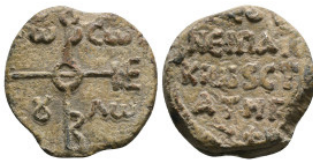
897 Byzantine Seal 15,47 g - 25,96 mm