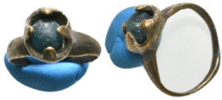
968 Ancient ring with gemstone bronze 2,30 g