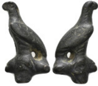
928 Roman Bronze eagle statue 20,69 g - H 35,80 mm