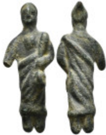
912 Antiquities Bronze male statue with toga. 45,70 g - H 67,56 mm