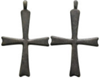
996 Byzantine cross pendant 14,76 g - H 63,35 mm