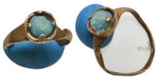
970 Ancient ring with gemstone bronze 1,47 g