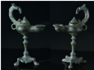
909 A fine Byzantine bronze oil lamp with a griffin head handle Circa 5th-7th century AD. With an elongated body and stand. 900 gr - Height in total : 22.5 cm