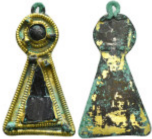
986 Gold and bronze embroidered earrings with gemstone details. 4,00 g - H 37,30 mm