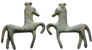
1000 Bronze horse pendant 14,86 g - 43 mm