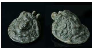
921 Roman Bronze Phalera with Medusa 2nd-3rd century A.D. Domed with mask of Medusa 144,88 g - H 70 mm