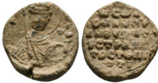
895 Byzantine Seal 9,17 g - 22,35 mm