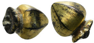
987 Gold plated bud shaped object 6,19 g - 15,11 mm