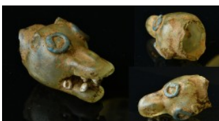
932 Designed in the shape of a wolf's head and produced in glass during the Hellenistic period. 28,04 g - 47 x 30 mm