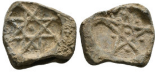
905 Byzantine Seal 11,54 g - 21,90 mm