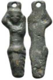
916 Antiquities Bronze female pendant 17,30 g - H 50,44 mm