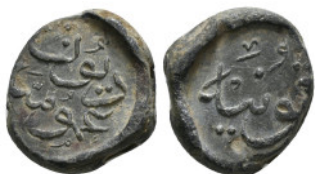
907 Islamic Seal 9,76 g - 19,41 mm