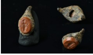
955 Iron ring with a Intaglio Gemstone with Minerva. 2nd-3rd century AD 1,18 g - 18,56 mm