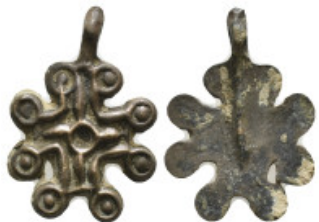
998 Byzantine cross pendant 4,44 g - 29,70 mm