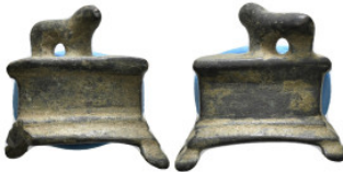
930 Roman period bronze statue 27,29 g - W 30,12 mm