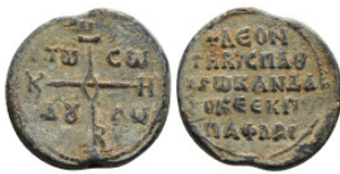
896 Byzantine Seal Leo, imperial spatharokandidatos, and ek prosopou of the Paphlagonia, IX cent. Cruciform invocative monogram of Θεοτόκε βοήθει (type V). In the quarters: τῷ σῷ δούλῳ. Wreath border. Inscription of five lines: +ΛΕΟΝ/ΤΗΡCΠΑΘ/ΑΡΩΚΑΝΔΑ/ΤΟ/ΕΕΚΠ[Ρ]/ΠΑΦΛΑΓ 10,56 g - 23,07 mm