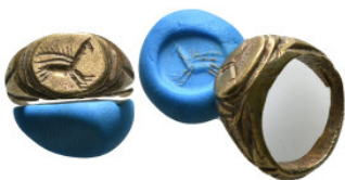
972 Ancient bronze ring with Griffin detail 10,00 g