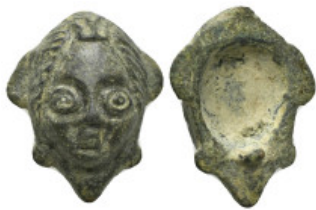
918 Roman bronze face applique 12,00 g - 27,33 mm