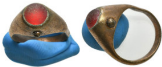
971 Ancient ring with gemstone bronze 5,94 g