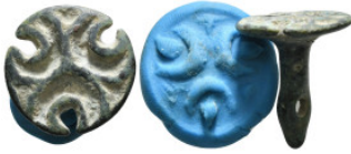
975 Bronze seal 12,54 g - 26,66 mm