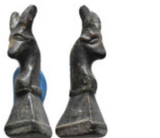
927 Roman Bronze goat statue 22,00 g - H 44,60 mm