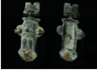
922 Bronze pendant of a bearded man's face (Silenos?) 27,28 g - H 62 mm