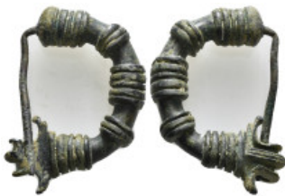
976 Roman period fibula 33,00 g - 46 mm