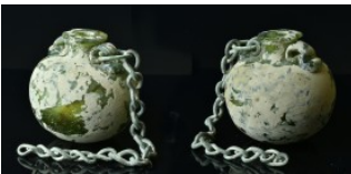
977 Aryballos with chain. 1st - 2nd century AD. Green clear glass. Round body with flattened base, wide cylindrical neck and folded, flattened lip. Two massive volute handles from the shoulder to the neck, attached to a short bronze chain 250 g - 81 x 83 mm - Chain 190 mm