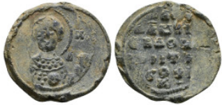
902 Byzantine Seal 8,24 g - 26,32 mm