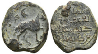
906 Islamic / Byzantine seal 24,21 g - 25,95 mm