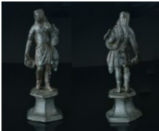
908 Roman Lar? Statuette 1st-2nd century AD. A bronze figurine of a lar? (household deity) standing wearing a loose tunic with knotted band to the waist and shoulder, patera in the right hand 257 gr - H 13.3 cm