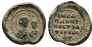
894 Byzantine Seal 4,89 g - 15,90 mm