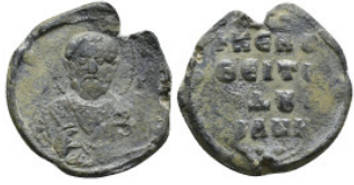
901 Byzantine Seal 8,08 g - 26,59 mm