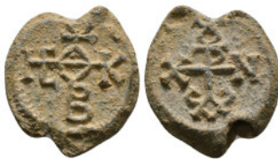
898 Byzantine Seal 10,51 g - 22,05 mm