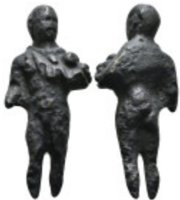
914 Antiquities Bronze male statue 72,10 g - H 71 mm