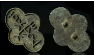
978 Byzantine (8th-10th century) A huge stamp with monogram. 400 g - 128 x 98 mm