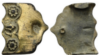
999 Gold plated belt buckle 7,86 g - 32 mm