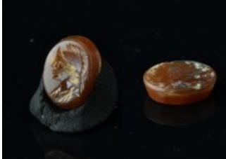
956 Roman Intaglio Gemstone with Minerva. 2nd-3rd century AD 0,61 g - 11,61 mm