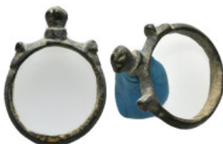
965 Ancient bronze ring 3,00 g