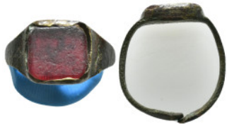
958 Ancient ring with red gemstone 5,13 g - 25,85 mm