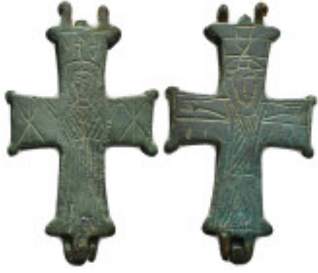
985 Bronze enkolpion. Byzantine, 11th-12th centuries AD. 21,70 g - H 57,60 mm