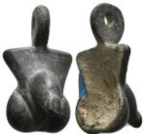
931 Roman Roman Phallic Pendant. 1st century AD. 23,86 g - H 41,07 mm