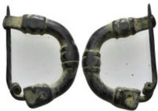
988 Roman period bronze fibula 9,08 g - 29,57 mm