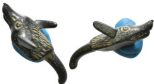
973 Bronze wolf head 8,66 g - 34,69 mm