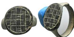
962 Ancient bronze ring 2,80 g - 18,75 mm