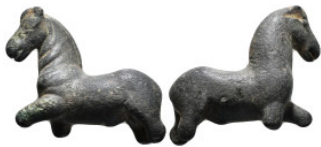
925 Roman Bronze horse statue 115,19 g - 55 x 43 mm