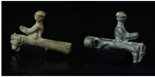
917 A Roman bronze figurine of an ram head, male form on it. 16,49 g - W 44,03 mm