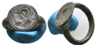
960 Ancient bronze ring 7,56 g - 23,72 mm