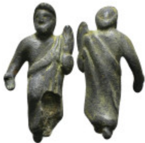
915 Antiquities Bronze male statue 28,46 g - H 49,00 mm