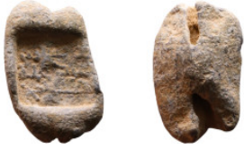
1619 Islamic Period - Seals 18mm 13,23g