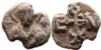
1720 Byzantine Period - Seals 17mm 5,14g