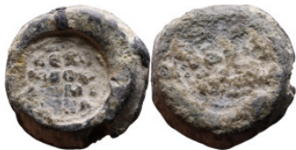
1721 Byzantine Period - Seals 17mm 8,34g