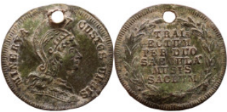
1622 Free imperial city of Nuremberg - Jeton 22mm 0,97g