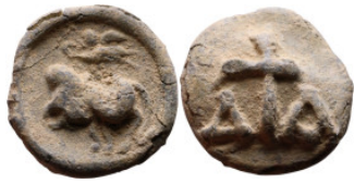
1718 Byzantine Period - Seals 17mm 4,82g