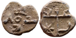
1723 Byzantine Period - Seals 18mm 7,00g