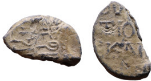
1738 Byzantine Period - Seals 13mm 3,91g