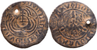
1621 Germany - XVII century - Bronze coin 24mm 2,23g