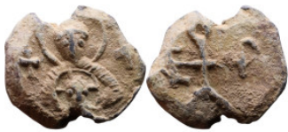
1704 Byzantine Period - Seals 21mm 6,67g