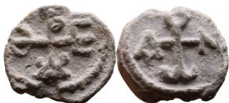
1708 Byzantine Period - Seals 18mm 7,34g