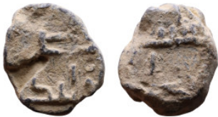
1711 Islamic Period - Seals 16mm 9,89g