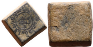
1650 Islamic Period - Weight 12mm 5,89g