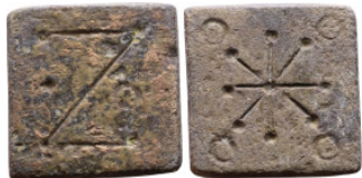
1722 Byzantine Period - Weight 15mm 3,63g