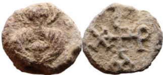
1734 Byzantine Period - Seals 16mm 4,42g