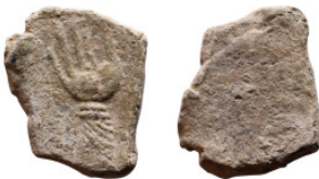
1707 Byzantine Period - Seals 17mm 6,51g