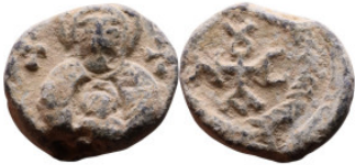
1733 Byzantine Period - Seals 16mm 6,11g