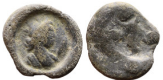
1714 Byzantine Period - Seals 17mm 3,49g