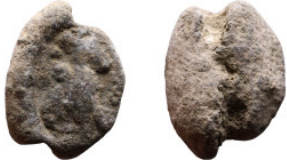
1730 Byzantine Period - Seals 15mm 5,88g