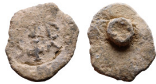
1740 Byzantine Period - Seals 15mm 2,00g