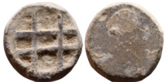
1743 Byzantine Period - Weight 15mm 3,40g