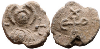
1710 Byzantine Period - Seals 18mm 5,61g