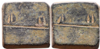
1651 Islamic Period - Weight 12mm 5,71g