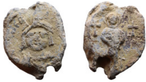
1703 Byzantine Period - Seals 18mm 7,18g