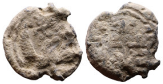
1705 Byzantine Period - Seals 21mm 7,35g