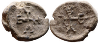
1709 Byzantine Period - Seals 20mm 5,87g