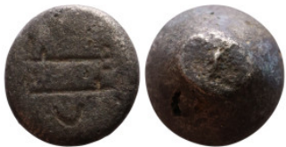
1685 Islamic Period - Weight 8mm 1,34g