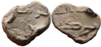
1717 Islamic Period - Seals 19mm 9,13g