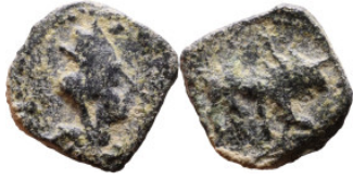
1758 Greek Bronze coin. (IV-I century BC) 12mm 0,93g