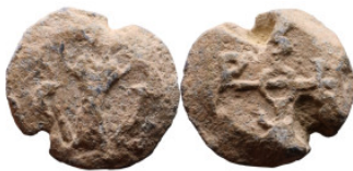
1728 Byzantine Period - Seals 17mm 6,22g