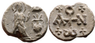
1719 Byzantine Period - Seals 17mm 5,34g