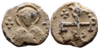
1725 Byzantine Period - Seals 17mm 6,04g