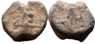
1646 Islamic Period - Seals 16mm 7,68g