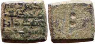
1682 Islamic Period - Weight 8mm 0,92g