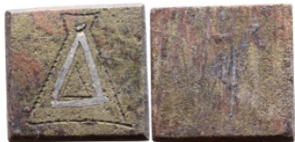
1742 Byzantine Period - Weight 13mm 4,14g