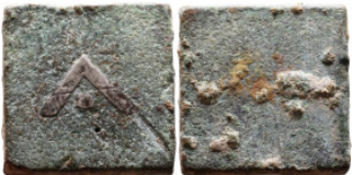
1624 Byzantine Period - Weight 16mm 7,39g