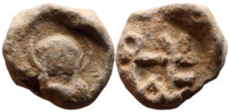
1732 Byzantine Period - Seals 17mm 7,68g