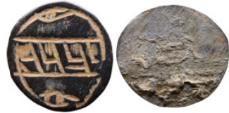
1647 Islamic Period - Weight 17mm 0,68g