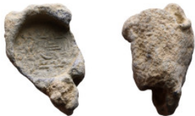
1687 Islamic Period - Seals 21mm 28,00g