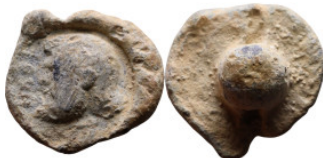
1729 Byzantine Period - Seals 17mm 5,13g