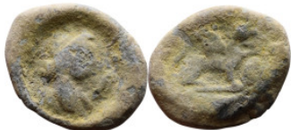
1715 Byzantine Period - Seals 19mm 4,31g