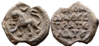
1706 Byzantine Period - Seals 21mm 8,29g