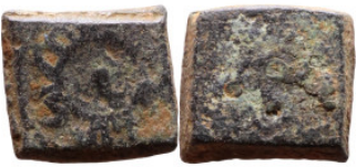
1683 Islamic Period - Weight 8mm 1,39g