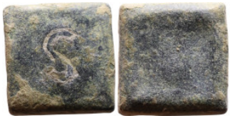
1735 Byzantine Period - Weight 13mm 6,60g