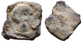
1759 Islamic Period - Seals 10mm 1,07g