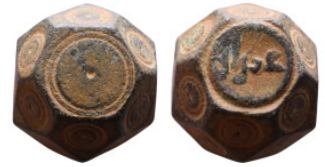
1649 Islamic Period - Weight 13mm 14,43g