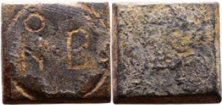
1623 Byzantine Period - Weight 16mm 8,67g