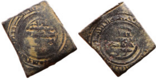
1618 Islamic Period - Weight 19mm 3,72g