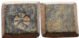
1652 Islamic Period - Weight 11mm 5,78g