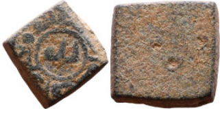
1681 Islamic Period - Weight 8mm 1,41g