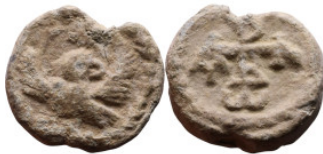
1726 Byzantine Period - Seals 18mm 6,80g