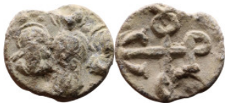
1713 Byzantine Period - Seals 18mm 4,22g