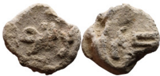
1739 Byzantine Period - Seals 16mm 3,58g