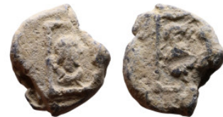
1741 Byzantine Period - Seals 14mm 4,00g