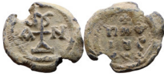
1724 Byzantine Period - Seals 22mm 6,94g