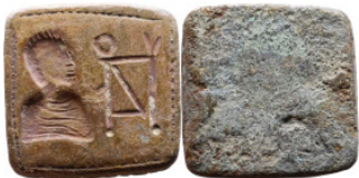
1736 Byzantine Period - Weight 13mm 3,64g