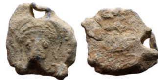
1727 Byzantine Period - Seals 16mm 5,51g