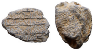
1716 Islamic Period - Seals 21mm 6,22g