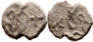
1737 Byzantine Period - Seals 16mm 5,16g