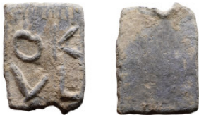
1686 Islamic Period - Seals 20mm 10,36g