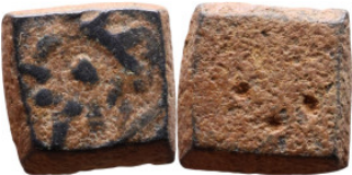
1684 Islamic Period - Weight 8mm 1,52g