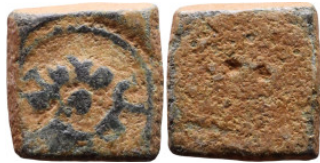
1760 Islamic Period - Weight 9mm 0,95g