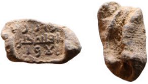
1620 Islamic Period - Seals 26mm 7,65g