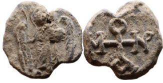
1702 Byzantine Period - Seals 20mm 6,34g