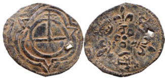
1648 Middle Ages (X-XV century) - Bronze coin 16mm 0,40g