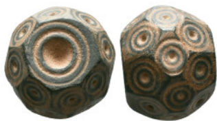
879 ANCIENT ISLAMIC BRONZE COMMERCIAL WEIGHTS (15TH-19TH AD) Reference : Condition: Very Fine Weight: 29,5 gr. Diameter: 19,4 mm