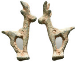
702 Ancient Bronze Ibex Amulet. Reference : Condition: Very Fine Weight: 4,40 gr. Diameter: 33,1 mm