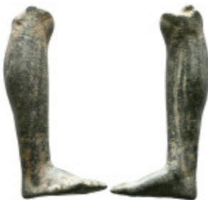
706 Ancient Roman Bronze Foot , Circa 1st - 2nd century A.D, Reference : Condition: Very Fine Weight: 35,5 gr. Diameter: 51,9 mm