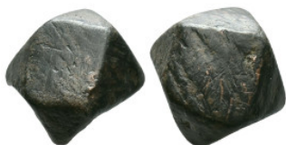
885 ANCIENT ISLAMIC BRONZE COMMERCIAL WEIGHTS (15TH-19TH AD) Reference : Condition: Very Fine Weight: 30,4 gr. Diameter: 20,3 mm