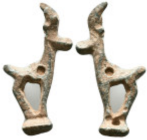
701 Ancient Bronze Ibex Amulet. Reference : Condition: Very Fine Weight: 4,82 gr. Diameter: 34,7 mm