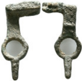
719 Ancient Roman Bronze Door Key Reference : Condition: Very Fine Weight: 14,4 gr. Diameter: 43,6 mm