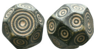
881 ANCIENT ISLAMIC BRONZE COMMERCIAL WEIGHTS (15TH-19TH AD) Reference : Condition: Very Fine Weight: 29,3 gr. Diameter: 17,0 mm