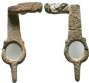
720 Ancient Roman Bronze Door Key Reference : Condition: Very Fine Weight: 10,0 gr. Diameter: 40,2 mm