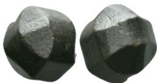
884 ANCIENT ISLAMIC BRONZE COMMERCIAL WEIGHTS (15TH-19TH AD) Reference : Condition: Very Fine Weight: 29,2 gr. Diameter: 17,6 mm