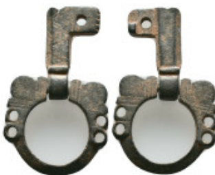
722 Ancient Roman Bronze Door Key Reference : Condition: Very Fine Weight: 6,28 gr. Diameter: 35,0 mm