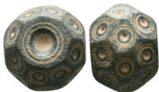
880 ANCIENT ISLAMIC BRONZE COMMERCIAL WEIGHTS (15TH-19TH AD) Reference : Condition: Very Fine Weight: 29,3 gr. Diameter: 18,8 mm