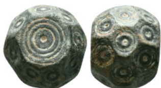
882 ANCIENT ISLAMIC BRONZE COMMERCIAL WEIGHTS (15TH-19TH AD) Reference : Condition: Very Fine Weight: 28,7 gr. Diameter: 18,5 mm