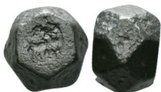
883 ANCIENT ISLAMIC BRONZE COMMERCIAL WEIGHTS (15TH-19TH AD) Reference : Condition: Very Fine Weight: 27,1 gr. Diameter: 17,6 mm