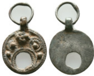
718 Ancient Silver Pendant ! Reference : Condition: Very Fine Weight: 1,69 gr. Diameter: 24,2 mm