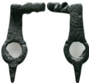
721 Ancient Roman Bronze Door Key Reference : Condition: Very Fine Weight: 7,97 gr. Diameter: 42,3 mm