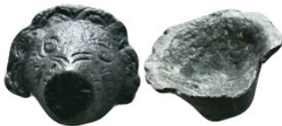
703 Ancient Roman bronze Lion Applique, 1st - 2nd Century A.D Reference : Condition: Very Fine Weight: 11,1 gr. Diameter: 24,6 mm