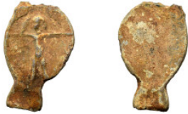
1438 Greek-Roman object (lead, 6.48 g, 27 mm). Sold as seen.