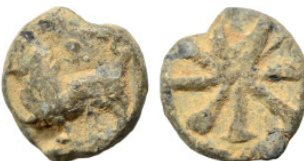
1449 Greek-Roman seal (lead, 3.61 g, 13 mm). Sold as seen.