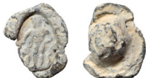
1443 Greek-Roman seal (lead, 10.04 g, 23 mm). Sold as seen.