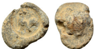
1419 Greek-Roman seal (lead, 3.89 g, 17 mm). Sold as seen.