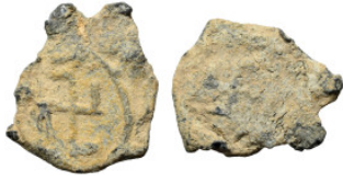
1437 Greek-Roman seal (lead, 4.54 g, 22 mm). Sold as seen.