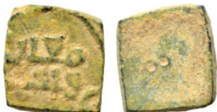
1569 Islamic weight (bronze, 0.95 g, 8x7 mm). Sold as seen.