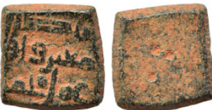
1568 Islamic weight (bronze, 1.42 g, 8x8 mm). Sold as seen.