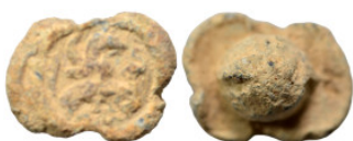
1418 Greek-Roman seal (lead, 15.68 g, 24 mm). Sold as seen.