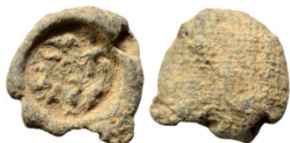
1422 Greek-Roman seal (lead, 5.97 g, 21 mm). Sold as seen.