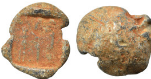
1447 Greek-Roman seal (lead, 10.16 g, 20 mm). Sold as seen.