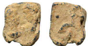
1448 Greek-Roman seal (lead, 4.78 g, 17 mm). Sold as seen.