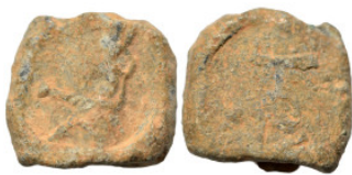
1446 Greek-Roman seal (lead, 7.08 g, 17 mm). Sold as seen.