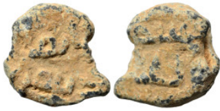
1563 Islamic seal (lead, 6.79 g, 17 mm). Sold as seen.