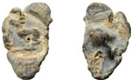
1442 Greek-Roman seal (lead, 2.97 g, 18 mm). Sold as seen.