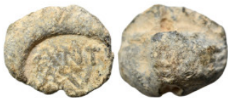
1416 Greek-Roman seal (lead, 19.58 g, 25 mm). Sold as seen.