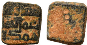
1567 Islamic weight (bronze, 0.96 g, 8x7 mm). Sold as seen.