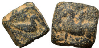
1441 Greek-Roman object (bronze, 4.39 g, 16 mm). Sold as seen.