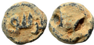
1566 Islamic seal (lead, 4.63 g, 13 mm). Sold as seen.