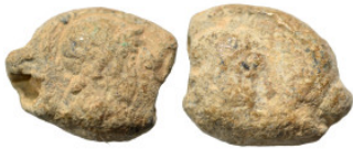
1445 Greek-Roman seal (lead, 4.67 g, 14 mm). Sold as seen.