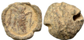
1420 Greek-Roman seal (lead, 3.75 g, 15 mm). Sold as seen.