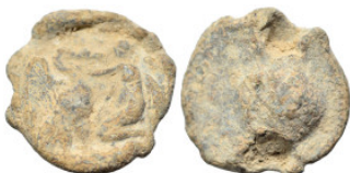
1450 Greek-Roman seal (lead, 3.29 g, 16 mm). Sold as seen.