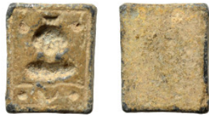
1439 Greek-Roman object (lead, 8.18 g, 20 mm). Sold as seen.