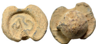
1417 Greek-Roman seal (lead, 8.02 g, 18 mm). Sold as seen.