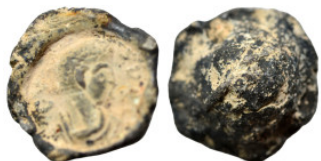
1421 Greek-Roman seal (lead, 6.69 g, 15 mm). Sold as seen.