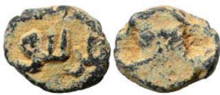
1565 Islamic seal (lead, 4.42 g, 15 mm). Sold as seen.