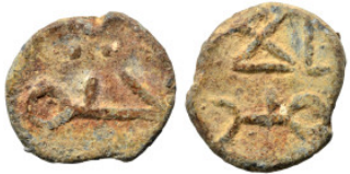
1564 Islamic seal (lead, 2.76 g, 15 mm). Sold as seen.