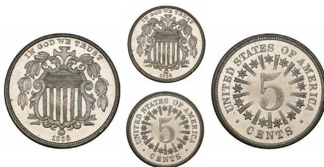
556 U.S.A. , proof shield type nickel, 1866, with rays between stars on reverse, minimal traces of handling, almost as struck, in PCGS holder graded PR65 £1,000-1,500