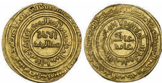
250 Fatimid, al-Hafiz (526-544h) , dinar, Misr 529h, 4.11g (Nicol 2618), obverse struck off-centre, very fine to good very fine £200-250