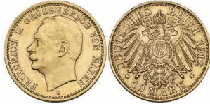
g705 Baden, Friedrich II , 10 mark, 1912 G, variety with broken 0 in 10 MARK, about very fine £600-800