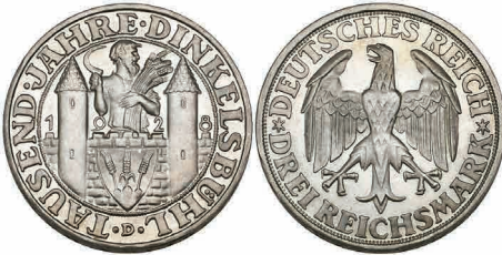
783 Weimar Republic , Dinkelsbühl 1,000 th Anniversary, proof 3 reichsmark, 1928 D, mint state £400-600