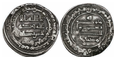
154 Abbasid, al-Muktafi (289-295h) , dirham, al-Qasr al-Fakhir 295h, 3.03g (SCC 1476), fine, rare £120-150