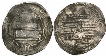
110 Abbasid, temp. al-Ma'mun (194-218h) , dirham, Madinat Arran 208h, rev., citing al-Abbas bin Khalid and Muhammad bin 'Abdallah al-Kalbi , 2.32g (Lowick 837; Vardanyan 158), good fine and rare £150-200