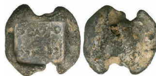
81 Umayyad , lead seal, uniface, in two lines: min furuj | Ardashir Khurra , with string canal running vertically, 9.35g, very fine and rare £200-300