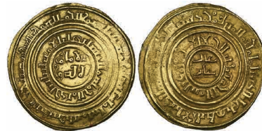
253 Crusaders , imitation of a Fatimid dinar of al-Amir, dated 514h, mint-name blundered, 3.84g, some weakness, good fine to almost very fine £200-250

The child imam al-Fa'iz was only nine years old when this dinar was issued.