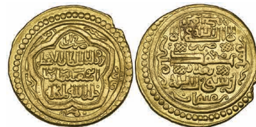
301 Ilkhanid, Abu Sa'id (716-736h) , dinar, Baghdad 722h, 8.56g (Diler 502), edge fault, otherwise good very fine £400-500