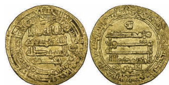
146 Abbasid, al-Mu'tamid (256-279h) , dinar, Misr 258h, rev. , citing the official Nahrir , 4.25g (Bernardi 174De; Album 241), good fine and scarce, a one-year type £200-250