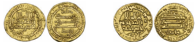
200 Aghlabid, Muhammad II b. Ahmad (250-261h) , dinars (2), 252h and 256h, 4.24, 4.22g (al-'Ush 71, 75), very fine (2) £400-500