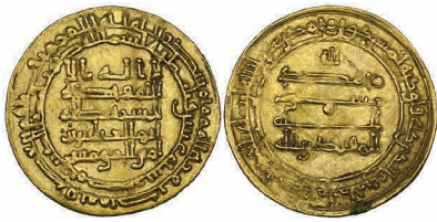
161 Abbasid, al-Muqtadir (295-320h) , dinar, Misr 310h, 3.55g (Bernardi 242De), very fine to good very fine £200-250