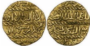
259 Burji Mamluk, Barsbay (825-841h) , ashrafi, Dimashq 829h, 3.39g (cf Balog 713), scrapes both sides, good fine and rare £150-200