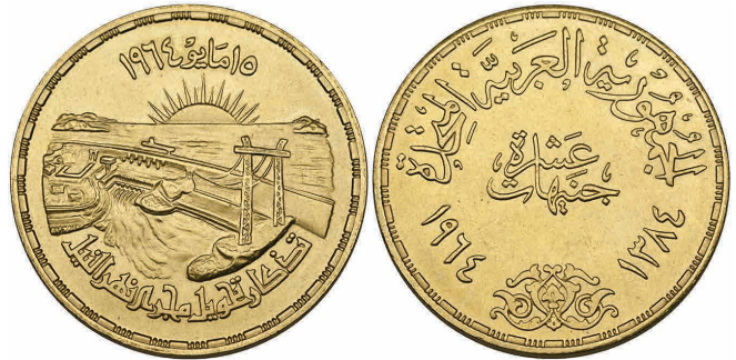
447 Egypt, United Arab Republic (1958-1971) , ten-pounds, 1964/1384h, Diversion of the Nile, 52.08g (KM 409), about uncirculated [2,000 struck] £1,200-1,500

Ex Sotheby's, 28 April 1982, lot 414 (offered with envelope).