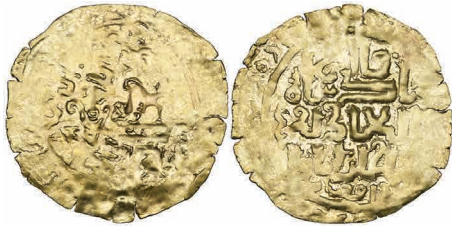
294 Ilkhanid, Abaqa (663-680h) , dinar, Damghan, no date visible, 2.80g (Album 2126.3), very crude and obverse double-struck, fine for issue and rare £180-220