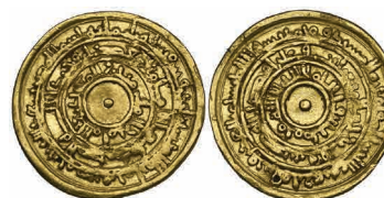
220 Fatimid, al-Mu'izz (341-365h) , dinar, Misr 362h, month of Jumada al-Akhir, 4.06g (Nicol 367), very fine £200-250