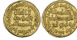
25 Umayyad , dinar, 84h, rev. , two points below y of yulad , 4.30g (ICV 162; W. 194), extremely fine £450-500