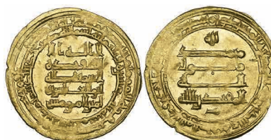
160 Abbasid, al-Muqtadir (295-320h) , dinar, Madinat al-Salam 313h, 3.96g (Bernardi 242Jh), minor edge marks, extremely fine £200-250