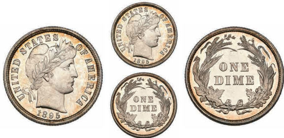
560 U.S.A., proof dime, 1895, an essentially flawless gem mint state example with light gold toning to the fully reflective surfaces, in PCGS holder graded PR66CA £650-850