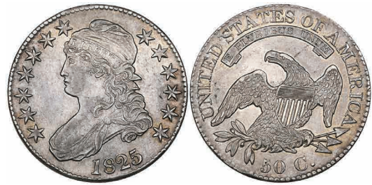
545 U.S.A. , half-dollar, 1825, a few minor scuffs and surface marks, virtually mint state, lightly toned £600-800