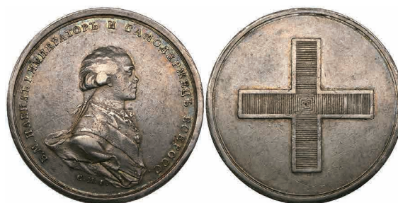
516 Russia, Paul I , Coronation, silver medal, by C. Meisner, undated, similar to the last, 38.5mm, 20.54g (Bitkin M227; Diakov 243.9), almost very fine £300-500

Ex World-Wide Coins of California auction III, 18 November 1982, lot 1101. See also lot 479 and following lot.