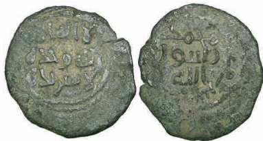
76 Umayyad , fals, 'Asqalan, undated, 3.26g (SNAT IVa, 171), reverse struck off-centre, good fine £150-200