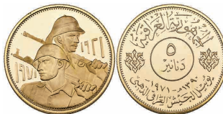
g455 Iraq, Republic, Fiftieth Anniversary of the Iraqi Army, proof gold 5-dinars, 1971/1390h, 13.79g (KM 134), practically as struck £350-400