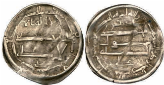
193 Idrisid, Idris II (175-213h) , dirham, Madinat Tilimsan 201h, 1.91g (Album 421), wavy flan, fine and apparently unpublished £150-200