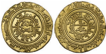
246 Fatimid, al-Amir (495-524h) , dinar, al-Iskandariya 504h, 3.72g (Nicol 2448), edge shaved, good very fine £180-220