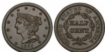
550 U.S.A. , half-cent, 1851, virtually as struck, with rich, chocolate tone, in PCGS holder graded MS63BN £150-200