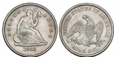
549 U.S.A. , quarter-dollar, 1840 O, no drapery from elbow, extremely fine to good extremely fine, in PCGS holder graded AU58 £600-800