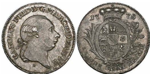
595 Baden, Karl Friedrich , half convention thaler, 1778 H / w, similar type, bare head right, rev. , oval crowned shield with palm and olive sprays (Wielandt 724; KM 126), extremely fine to good extremely fine and well toned £600-800