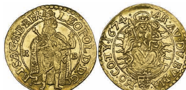
414 Hungary, Leopold I (1658-1705) , ducat, Kremnitz, 1674, 3.44g (F. 128), virtually as struck £1,000-1,500