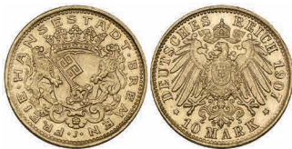
g710 Bremen, Free City , 10 mark, 1907 J, characteristic die flaws on obverse well-developed, virtually mint state £1,000-1,500