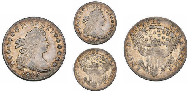
541 U.S.A. , dime, 1805, 4 berries type, extremely fine and with attractive light toning, in PCGS holder graded AU55 £2,000-3,000