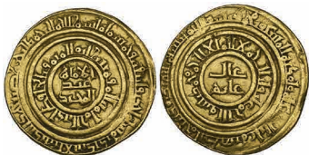
249 Fatimid, al-Hafiz (526-544h) , dinar, al-Iskandariya 541h, 3.94g (Nicol 2608), edge shaved, very fine and scarce £200-250