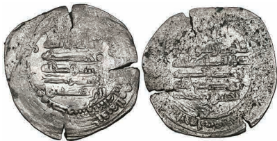
261 Qarmatid, al-Hasan b. Ahmad , dirham, Dimashq 362h, 3.13g (Vardanyan 16), some edge splits, good fine £150-200