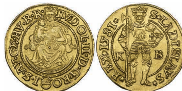
411 Hungary, Rudolph II (1576-1608) , ducat, Kremnitz, 1581, 3.53g (F. 63), very slightly buckled, about extremely fine £600-800