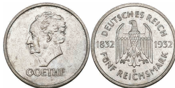
795 Weimar Republic , Centenary of the death of Goethe, 5 reichsmark, 1932 G, surface scuffs, very fine, scarce £700-900