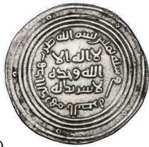
Lot 64 (obverses)