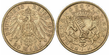
g709 Bremen, Free City , 20 mark, 1906 J, minor rim nicks, extremely fine £800-1,200