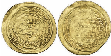
162 Abbasid, al-Muqtadir (295-320h) , medallion dinar with broad margins, Hamadan 319h, obv. , without name of the heir Abu'l-Abbas, rev. , letter jim above to right of lillah , letter 'ayn below, 4.00g (cf ICA 27, 10 December 2014, lot 330 for a dinar from the same obverse die struck on a smaller and thicker flan), reverse weak, good fine and extremely rare £1,000-1,500

Donative issues at this period were occasionally struck in different modules from the same dies: a smaller, thicker version without the plain outer margin, and a broader, thinner version with the characteristic medallionic border as on the present coin.