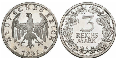
792 Weimar Republic , Regular Issue, proof 3 reichsmark, 1931 G, mint state, rare £400-600