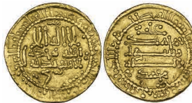
199 Aghlabid, Muhammad II b. Ahmad (250-261h) , dinar, 250h, 4.16g (al-'Ush 69), very fine, reverse better £200-250