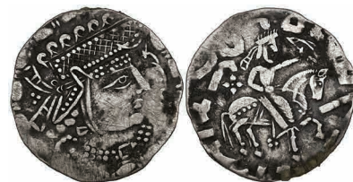
Afrighids of Khwarezm, Azkaswar II (c.770-800) , drachm, bust to right with ruler’s name before, rev. , horseman to right with quatrefoil behind bust, 2.43g (cf Zeno 123416), very fine, rare £200-300