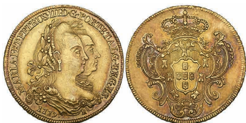
436 Brazil, Maria and Pedro III (1777-86) , peça, 1779 R, Rio de Janeiro mint (Gomes 25.03), good very fine to extremely fine, well toned £600-800