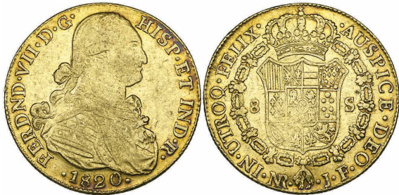
441 Colombia, Ferdinand VII , 8 escudos, Nuevo Reino, 1820 J.F., with portrait of Charles IV, very fine, scarce £1,000-1,200

Ex Coin Galleries sale, 17 May 1983, lot 756.