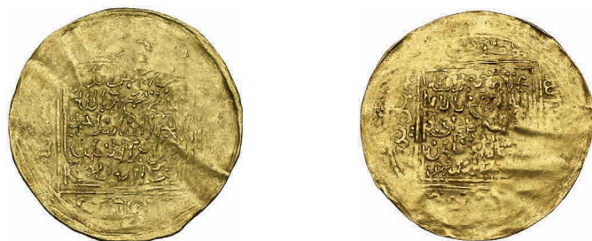
Lot 205 (obverses)

204 Aghlabid, Muhammad II b. Ahmad (250-261h) , dinar, 258h, 4.17g (al-'Ush 79), almost very fine £180-220