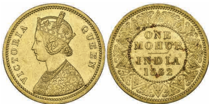
g450 India, Victoria , mohur, 1862, Calcutta mint (Pr. 1; S. & W. 4.1; KM 480), reverse slightly discoloured, generally extremely fine £800-1,000