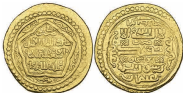
296 Ilkhanid, Abu Sa'id (716-736h) , dinar, Abu Ishaq 722h, 8.49g (Diler 502), good very fine £350-400