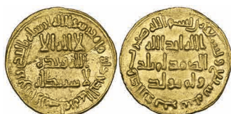
32 Umayyad , dinar, 97h, 4.27g (ICV 183; W. 212), extremely fine with some lustre £450-500