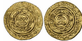
252 Fatimid, al-Fa'iz (549-555h) , dinar, Misr 553h, 3.51g (Nicol 2677), clipped, fine and rare £300-400

The child imam al-Fa'iz was only nine years old when this dinar was issued.