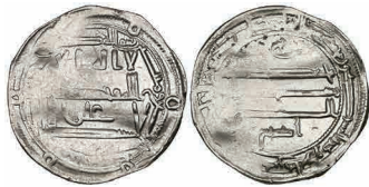
194 Idrisid, Idris II (175-213h) , dirham, Mrira 204h, 2.18g (Eustache 265), weakly struck in parts but with little wear from circulation, hence very fine and rare £120-150