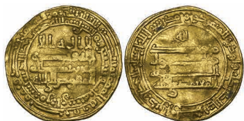
139 Abbasid, al-Mu'tamid (256-279h) , dinar, Surra man ra'a 263h, 4.11g (Bernardi 175Jc), wavy flan, almost very fine £300-400