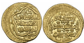
297 Ilkhanid, Abu Sa'id (716-736h) , dinar, Basra 723h, 5.23g (Diler 502), almost extremely fine, rare £500-700