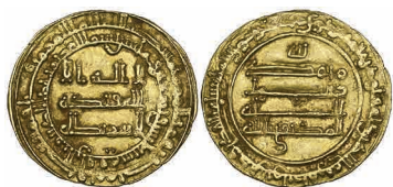
151 Abbasid, al-Muktafi (289-295h) , dinar, al-Rafiq 292h, 4.07g (Bernardi 226Hn), some marginal weakness on reverse, very fine and rare £800-1,000