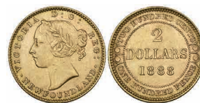
g438 Canada, Newfoundland, Victoria , 2 dollars, 1888, good very fine £150-200