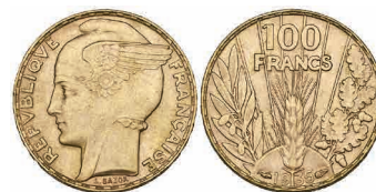
g449 France, Third Republic , 100 francs, 1935, by L. Bazor, very light bagmarks, virtually as struck £1,000-1,500