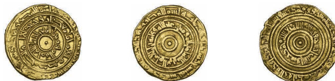
Lot 222 (obverses)