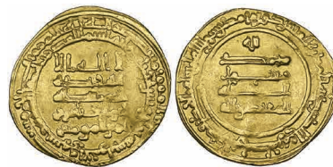
156 Abbasid, al-Muqtadir (295-320h) , dinar, Suq al-Ahwaz 318h, 4.22g (Bernardi 242Nf), good very fine £150-200