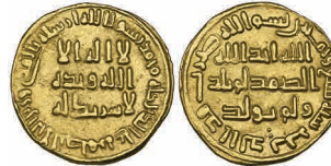
29 Umayyad , dinar, 89h, rev. , two pellets below i of dinar , 4.23g (ICV 167; W. 200), good very fine £400-450