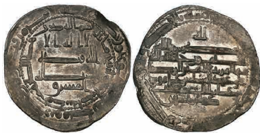
111 Abbasid, al-Ma'mun (194-218h) , dirham, Madinat Isbahan 204h, rev., citing the Shi'ite al-Rida as heir, letter sin below, 2.96g (Lowick 1538), margins weak, good very fine £400-500