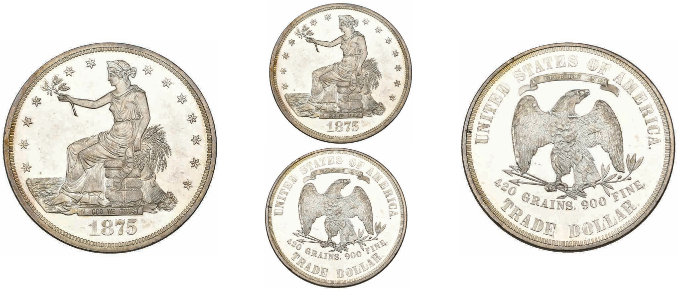
557 U.S.A., proof Trade dollar, 1875, brilliant mint state, with minimal traces of handling, in PCGS holder graded PR64+DC £2,500-3,500