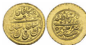
313 Qajar, Fath 'Ali Shah (1212-1250h) , half-toman, Tabriz 1238h, with hand-engraved oblique graining on edge, 2.29g (Album 2866), extremely fine and rare £250-300