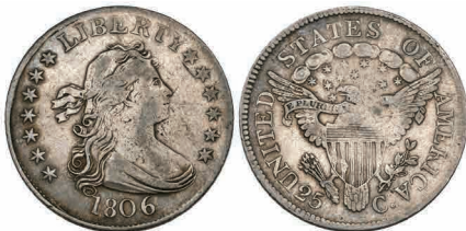
542 U.S.A. , quarter-dollar, 1806, cleaned, about very fine, in PCGS holder graded 'Genuine Cleaned - XF Detail' £500-700