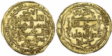
191 Abbasid, al-Musta'sim (640-656h) , dinar, Madinat al-Salam 642h, 4.56g (BMC I, 505), light crease, has been cleaned, good very fine £250-300