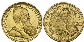
g435 Albania , 20 frangi ari, 1927, mint state £300-400