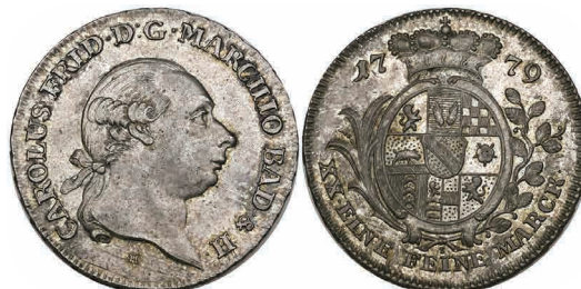
597 Baden, Karl Friedrich , half convention thaler, 1779 H / w, similar (Wielandt 726; KM 126), extremely fine £600-800