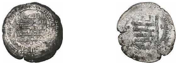
Lot 164 (obverses)