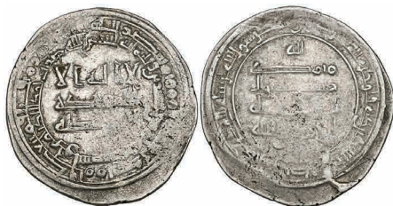
185 Abbasid, al-Radi (322-329h) , double-weight dirham, Wasit 325h, 5.56g (cf SICA 4, 1704), some weak striking and reverse flan fault, good fine and rare £150-200