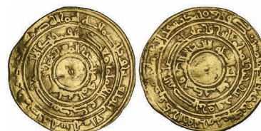
221 Fatimid, al-Mu'izz (341-365h) , dinar, al-Mansuriya 347h, 4.00g (Nicol 400), good fine £150-200