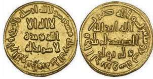
19 Umayyad , dinar, 79h, 4.26g (ICV 157; W. 189), reverse graffiti, extremely fine £450-500