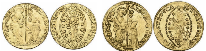
467 Italy, Venice, Aloysius Contarini (1676-84) , zecchino, 3.50g (F. 1338), good very fine ; Paolo Rainier , zecchino, 3.00g (F. 1434), ex-mount (edge trimmed), about fine (2) £250-300