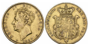
g369 George IV , sovereign, 1827 (Marsh 12), about very fine £400-500