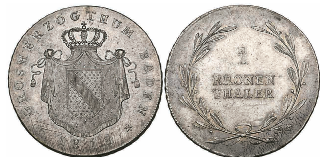
602 Baden, Karl Ludwig Friedrich , kronenthaler, 1818, similar (Wielandt 801; KM 169), adjustment marks at date, extremely fine £300-400