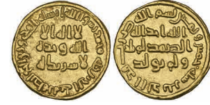
26 Umayyad , dinar 85h, rev. , pellet by kham s in date, 4.24g (ICV 162; W. 195), good very fine and a rare date £600-800