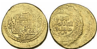
305 Ilkhanid, Sulayman (739-746h) , dinar, Tabriz 74[1]h, 9.03g (Diler 766; cf Morton and Eden auction 89, 25 October 2017, lot 102, same dies ), struck off-centre but with little wear from circulation, better than very fine for issue £500-700