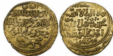
255 Bahri Mamluk, Baybars I (658-676h) , dinar, al- Iskandariya 665h, 7.01g (SICA 6, 1160, same reverse die ), minor weakness, otherwise about extremely fine £300-350