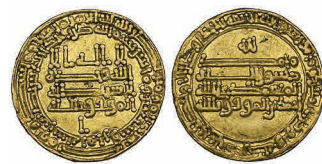
144 Abbasid, al-Mu'tamid (256-279h) , dinar, San'a 278h, 2.88g (Bernardi 185El), very fine £200-250