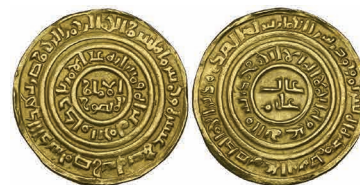
254 Crusaders , imitation of a Fatimid dinar of al-Amir, 'Misr 517h', 3.75g very fine to good very fine £200-250