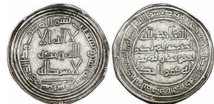
53 Umayyad , dirham, Sarakhs 92h, 2.65g (Klat 452), about very fine £150-200