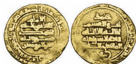
216 Fatimid, al-Qa'im (297-324h) , posthumous dinar, al-Qayrawan 335h, 4.12g (Nicol 148), fair to fine, rare £300-400