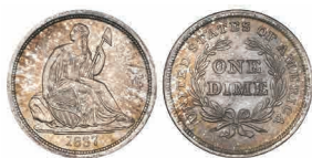
548 U.S.A. , dime, 1837 no stars, with large date, mint state and with light, mottled tone, in PCGS holder graded MS63 £700-900