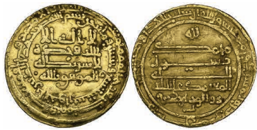
138 Abbasid, al-Mu'tamid (256-279h) , dinar, al-Ahwaz 269h, 4.40g (Bernardi 178Nd), good fine, scarce £300-400