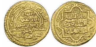
299 Ilkhanid, Abu Sa'id (716-736h) , dinar, Baghdad 719h, 4.17g (Diler 488), very fine £250-300