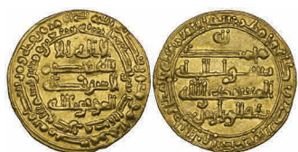
143 Abbasid, al-Mu'tamid (256-279h) , dinar, San'a 270h, rev. , citing Dhu'l-Wizaratayn , 2.89g (Bernardi 178El), good very fine £300-400