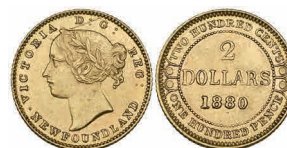
g437 Canada, Newfoundland, Victoria , 2 dollars, 1880, a few surface scuffs, good very fine to extremely fine and scarce, the key date of the series £1,000-1,500