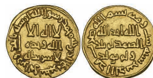
38 Umayyad , dinar, 106h, 4.23g (ICV 200; W. 226), graffiti, very fine or better £300-400