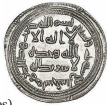
Lot 54 (obverses)

54 Umayyad , dirhams (2), Sarakhs 93h, rev. , margin ends mushrikūn , and Sijistan 93h, 2.91, 2.91g (Klat 453.b, 435), good very fine and extremely fine (2) £250-300