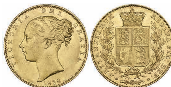
g373 Victoria , young head, sovereign, 1838, normal shield (Marsh 22), very fine to good very fine, with traces of original mint colour £1,500-2,000