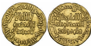
35 Umayyad , dinar, 98h, 4.24g (ICV 185; W. 213), traces of mounting on edge, otherwise good very fine £250-300