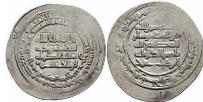
264 Hamdanid, Nasir al-dawla and Sayf al-dawla (330-356h) , dirham, al-Mawsil 348h, without sanat in mint/date formula, 3.42g (Bikhazi 40-42), minor striking weakness on both sides, good very fine and scarce £150-200