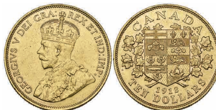
g439 Canada, George V , 10 dollars, 1912, scuffed, good very fine £400-500