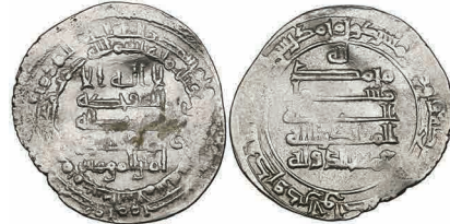
166 Abbasid, al-Muqtadir (295-320h) , dirham, Madinat al-Salam 319h, obv. , citing Abu'l-Abbas ibn amir al-mu'minin , rev. , citing 'Amid al-dawla , 3.73g (Album 249, where known date given as '320 only'), cleaned, slightly creased, fine to good fine and extremely rare £120-150

Donative issues at this period were occasionally struck in different modules from the same dies: a smaller, thicker version without the plain outer margin, and a broader, thinner version with the characteristic medallionic border as on the present coin.