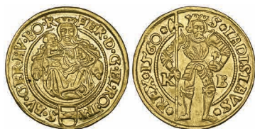
409 Hungary, Ferdinand I (1556-64) , ducat, Kremnitz, 1560, 3.55g (F. 48), extremely fine £900-1,100