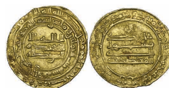
149 Abbasid, al-Mu'tadid (279-289h) , dinar, al-Rafiq 283h, 3.89g (Bernardi 211Hn), slightly ragged edge, very fine and rare £1,000-1,200

Ex Baldwin's Islamic Coin Auction 14, 8 July 2008, lot 129