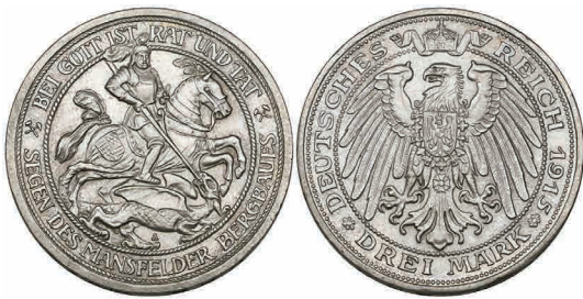
756 Prussia, Wilhelm II , commemorative 3 mark, 1915, on the centenary of the Absorption of Mansfeld, 1915, 3 mark, mint state, lightly toned, scarce £300-400