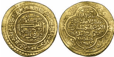
295 Ilkhanid, Uljaytu (703-716h) , dinar, Sultaniya 709h, 8.61g (Diler 365), very fine £300-350