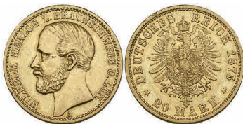
g711 Brunswick-Wolfenbüttel, Wilhelm I (1831-84) , 20 mark, 1875 A (J. 203), about very fine £400-500