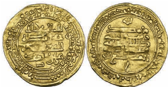
213 Ikhshidid, 'Ali b. al-Ikhshid (350-354h) , dinar, Filastin 353h, 2.76g (Bacharach 99), centres weak, about very fine £200-250