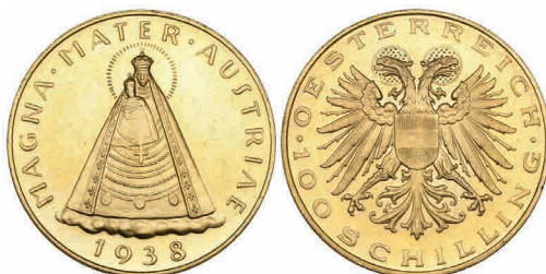
g434 Austria, Republic , 100 schilling, 1938, an excellent example, also prooflike mint state and extremely rare; in PCGS holder graded PL64 £25,000-30,000

All except a very few examples of the 1938 100 schilling (of which 1,400 were reportedly struck originally) were melted following the Anschluss. Purchased from Sternberg, 1973.