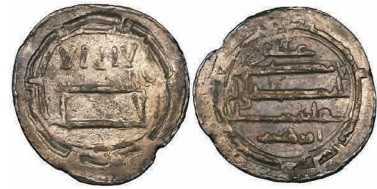
196 Aghlabid, Ibrahim I (184-196h) , dirham, Ifriqiya 186h, with Ibrahim's name only, 2.80g (Album 435.1; al-'Ush 173), very fine, scarce £100-150