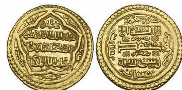
303 Ilkhanid, Abu Sa'id (716-736h) , dinar, Baghdad 724h, 8.65g (Diler 502), about extremely fine £400-500