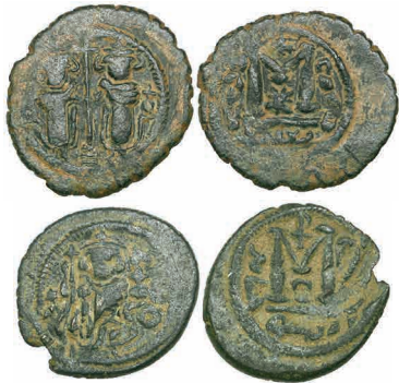
12 Arab-Byzantine , fals, Ba’albakk, two standing figures, rev. , eight-pointed star below M, 4.79g (cf Foss 60ff), almost very fine and a scarce variety ; and a Standing Imperial Figure fals of Dimashq (Foss 52-53), good fine (2) £100-150