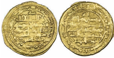
283 Buwayhid, Abu Kalijar (415-440h) , dinar, 'Uman 432h, 5.05g (Treadwell Um432G), fine to good fine £500-600