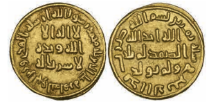
21 Umayyad , dinar, 80h, rev. , without pellet over m of al-samad , 4.26g (ICV 158; W. 190 var. ), about extremely fine £450-500