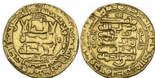
287 Ghaznavid, Mahmud (389-421h) , dinar, Naysabur 406h, 4.52g (SNAT XIVa 564), traces of mounting at 12 o'clock on obverse, otherwise very fine £150-200