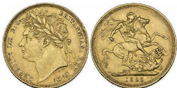
g366 George IV , sovereign, 1825, laureate head type (Marsh 9), surface knock below King's ear, good fine and scarce £600-800