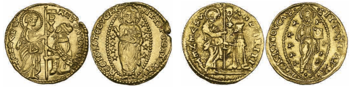
465 Italy, Venice, Antonio Venier (1382-1400) , ducat, 3.53g (F. 1229), edge nick, about extremely fine ; Andrea Gritti (1523-39) , ducat, 3.50g (F. 1246), very fine (2) £400-450