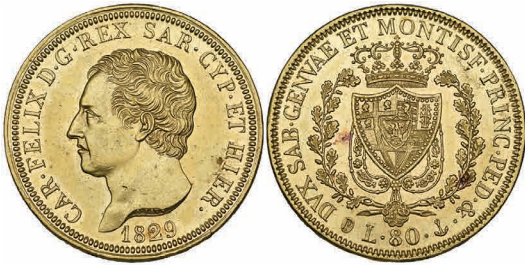
g461 Italy, Sardinia, Carlo Felice , 80 lire, 1829, Genoa mint (F. 1133), extremely fine £800-1,000

Ex Stack's auction, New York, 13-15 May 1982, lot 1487.