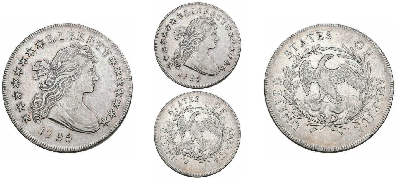
537 U.S.A. , Draped Bust type 1 dollar, 1795, with centred bust, good very fine, clear and evenly struck, in PCGS holder graded XF40 £3,500-4,500