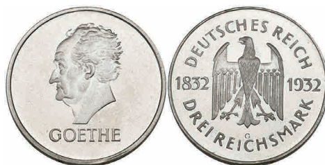
794 Weimar Republic , Centenary of the death of Goethe, proof 3 reichsmark, 1932 G, mint state £150-200