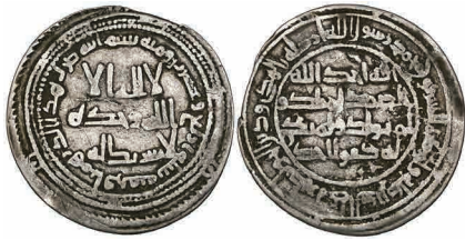
43 Umayyad , dirham, Ifriqiya 124h, rev. , pellet below field, 2.66g (Klat 108.a), edge clip, fine and very rare £1,000-1,500