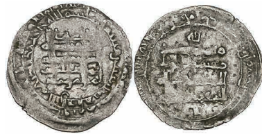
165 Abbasid, al-Muqtadir (295-320h) , dirham, al-Rafiq 310h, 1.50g, struck to the weight of a half-dirham, good fine and rare £80-120