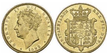
g370 George IV , sovereign, 1829, good very fine, with some original mint colour £600-800