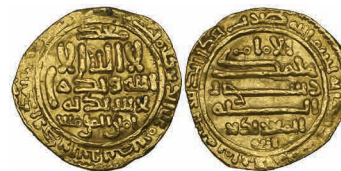
217 Fatimid, al-Mu'izz (341-365h) , dinar, without mint-name (Sijilmasa), 348h, 4.03g (Nicol 273), very fine and scarce £300-400