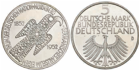
800 Federal Republic , Nuremberg Museum Centenary, proof 5 mark, 1952 D, virtually as struck £600-800