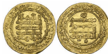
158 Abbasid, al-Muqtadir (295-320h) , dinar, Madinat al-Salam 306h, 4.09g (Bernardi 242Jh), about extremely fine £200-250