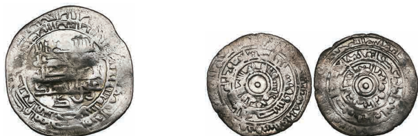
214 Ikhshidid, 'Ali b. al-Ikhshid (350-354h) , dirham, Filastin 353h, 2.70g (Bacharach 193), fine ; Fatimid, al-Mu'izz (341-365h) , half-dirham, al-Mu'izziya 3xx, date partly flat, good fine (2) £100-120