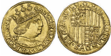
460 Italy, Naples, Ferdinand I of Aragon (1458-94) , ducat, crowned arms, rev. , crowned bust right, τ behind neck, 3.51g (F. 819), good extremely fine and virtually as struck, with a strong portrait £1,200-1,500