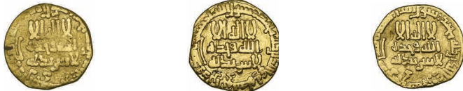
Lot 99 (obverses)

98 Abbasid, al-Mahdi (158-169h) , fals, Sabur 167h, citing Nusayr and the caliph, 3.31g (Shamma p.281, 9), about very fine £60-80