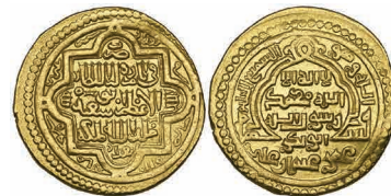
300 Ilkhanid, Abu Sa'id (716-736h) , dinar, Baghdad 720h, 7.63g (Diler 488), about extremely fine £400-500