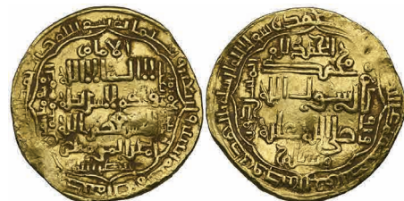
190 Abbasid, al-Musta'sim (640-656h) , dinar, Madinat al-Salam 642h, 8.65g (BMC I, 505), buckled flan and some weakness in margin, very fine or better £300-400