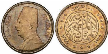
443 Egypt, Fuad , 100 piastres, 1348h/1929 (KM 354), toned, virtually as struck £300-400