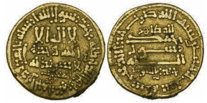
108 Abbasid, temp. al-Ma'mun (194-218h) , dinar, 206h, obv., al-maghrrib , rev., lillah Tahir | Muhammad bin al-Sari , 4.16g (Bernardi 95; Album 222.8), fine to good fine £180-220