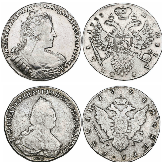
512 Anna (1730-40) , rouble, 1733 (Bitkin 66), with a vertical scratch on portrait, otherwise fine and Catherine II (1762-96) , rouble, 1794, surface corrosion and has been cleaned, fair to fine (2) £400-600