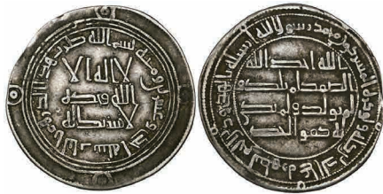
44 Umayyad , dirham, al-Bab 121h, 2.84g (Klat 148), very fine £150-200