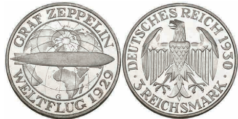
789 Weimar Republic , Zeppelin's Round-the-World Flight of 1929, proof 3 reichsmark, 1930 G, mint state £250-350