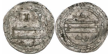
112 Abbasid, temp. al-Ma'mun (194-218h) , dirham, Ma'dan Bajunays 212h, rev., citing Khalid b. Yazid , 3.05g (cf Vardanyan 229 [dated 213h]), some spotting, very fine to good very fine and very rare, the date apparently unpublished £180-220