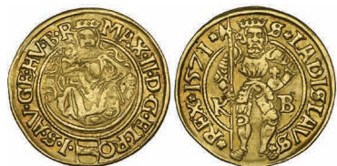
410 Hungary, Maximilian II (1564-76) , ducat, Kremnitz, 1571, 3.46g (F. 57), lightly buckled, good very fine £800-1,000