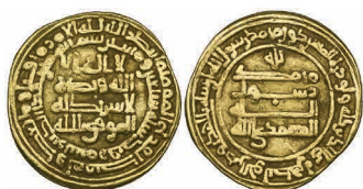
140 Abbasid, al-Mu'tamid (256-279h) , dinar, Samarqand 270h, 4.21g (Bernardi 177Qe), very fine £180-220