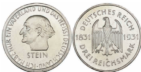
793 Weimar Republic , Centenary of the birth of von Stein, proof 3 reichsmark, 1931 A, mint state £150-200