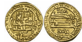
201 Aghlabid, Muhammad II b. Ahmad (250-261h) , dinar, 253h, 4.23g (al-'Ush 72), very fine, reverse better £200-250

Eustache records two varieties of dirham from a mint he read as 'Ziz', both bearing the same date as the present coin [229h]. It is tempting to equate this with the mint-name on the piece offered here, although this does appear to be longer than 'Ziz' – 'Zila', suggested here, is a possibility.