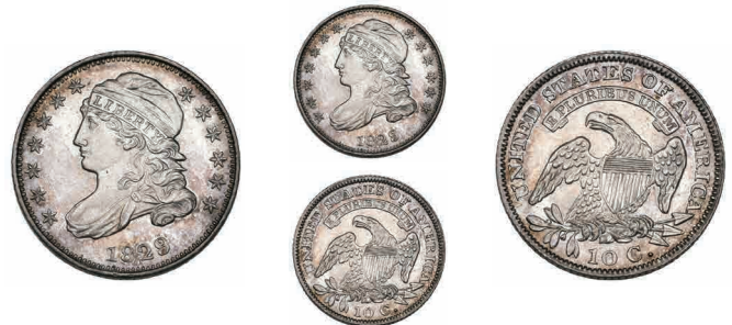
546 U.S.A. , dime, 1829, rev., small '10C', mark in field before bust, otherwise gem mint state, well struck and lightly toned, in PCGS holder graded MS64 £1,200-1,800