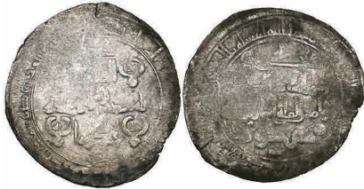
285 Ghaznavid, Mahmud (389-421h) , dirham, Balkh 397h, obv. , elaborate calligraphy with five lam-alifs of stylised 'horseshoe' form, 2.78g (SNAT XIVc, 689), an uneven striking with date weak but legible, fine and rare £150-200