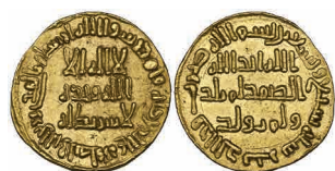
33 Umayyad , dinar, 97h, 4.27g (ICV 183; W. 212), good extremely fine £450-500