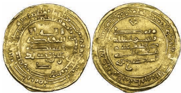
212 Ikhshidid, 'Ali b. al-Ikhshid (350-354h) , dinar, Filastin 351h, 4.04g (Bacharach 97), almost very fine £200-250