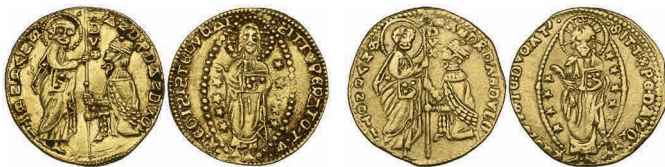
463 Italy, Venice, Andrea Dandolo (1343-54) , ducat, 3.49g (F. 1221), good very fine ; and another example, 3.48g, plugged, about very fine (2) £350-400

Provenance : Count Emeryk Hutten Czapski (1897-1979), grandson and heir of the celebrated collector, numismatist and historian of the same name; hence by descent.