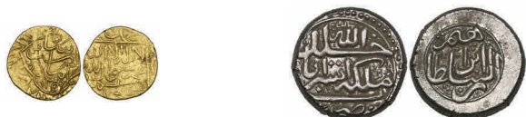
306 Safavid, Tahmasp I (930-984h) , sixth-mithqal, 930h, 0.77g (cf Album 2592 and note), very fine and apparently rare ; Afsharid, Ibrahim (1161-1162) , 6-shahi, Astarabad [116]2h, 6.87g (Album 2765), extremely fine and scarce (2) £120-150