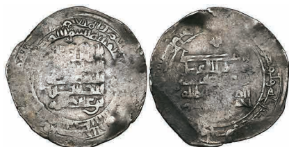
215 Ikhshidid, Ahmad b. 'Ali (357-358h) , dirham, Filastin 358h, 3.26g (Bacharach 203; SICA 6, 215), date weak, a typically crude striking, fine overall and rare £200-300