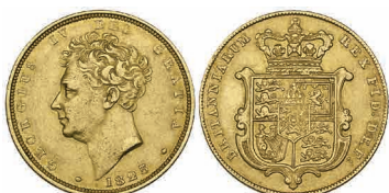
g367 George IV , sovereign, 1825, bare head type (Marsh 10), surface marks, good fine £350-400