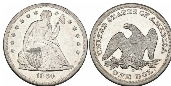
555 U.S.A. , 1 dollar, 1860 O, bagmarked, mint state and, with much original mint lustre, in PCGS holder graded MS62 £1,000-1,200