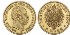
g717 Prussia, Wilhelm I , 5 mark, 1877 B, good extremely fine £150-200