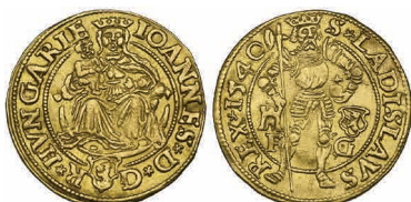
408 Hungary, John I (1526-40) , goldgulden, Kolozsvar, 1540, 3.51g (Lengyel 157/1/1540), lightly buckled, good very fine £1,000-1,200