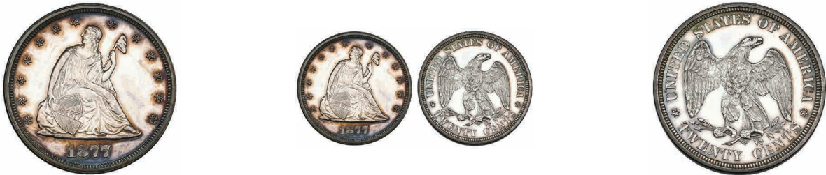
558 U.S.A., proof 20 cents, 1877, some hairlines, almost as struck with frosty devices and pleasing, even peripheral toning, in PCGS holder graded PR63CA, rare £6,000-8,000