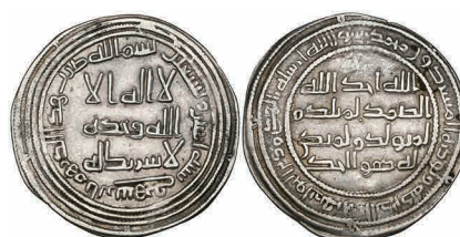
40 Umayyad , dirham, Abrashahr 92h, rev. , margin ends mushrikūn , 2.67g (Klat 6.b), very fine £100-150