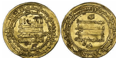
157 Abbasid, al-Muqtadir (295-320h) , dinar, Madinat al-Salam 304h, rev. , letter ha below, 4.20g (Bernardi 242Jh), minor staining, good very fine £200-250