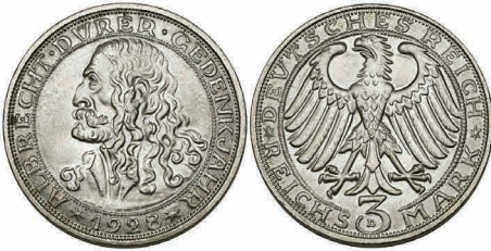
782 Weimar Republic , 400 th Anniversary of the death of Dürer, 3 reichsmark, 1928 D, mint state £200-250