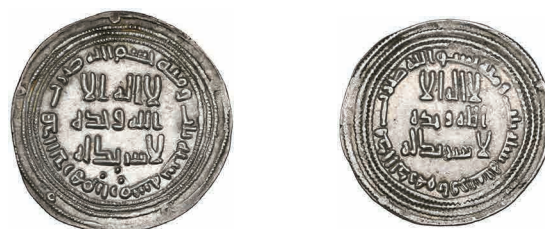
Lot 41 (obverses)