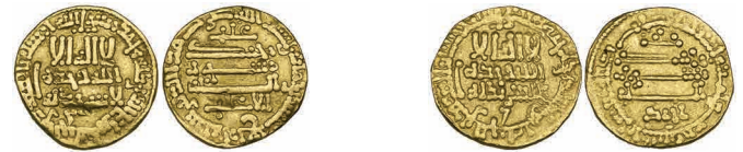
197 Aghlabid, al-Aghlab b. Ibrahim (223-226h) , dinar, 224h, 4.13 g (al-'Ush 36), almost very fine and Ahmad b. Muhammad (242-249h) , dinar, 242h, 4.26g (al-'Ush 55), almost very fine (2) £400-500