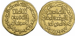
20 Umayyad , dinar, 80h, rev. , pellet over m of al-samad , 4.20g (ICV 158; W. 190), good very fine £350-400