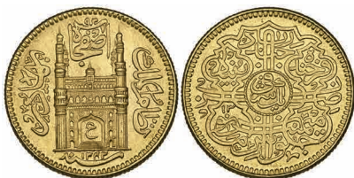
g451 India, Hyderabad, Mir Usman Ali Khan , mohur, 1342h, year 13, 11.17g (F. 1165; Y. 57a), virtually as struck, unlisted regnal year £700-1,000