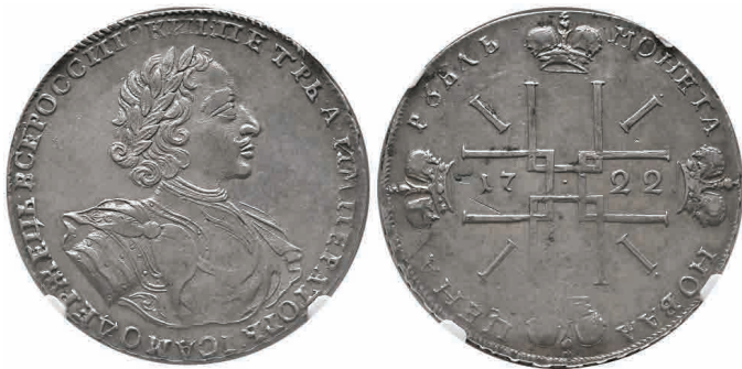
510 Peter the Great , rouble, 1722, (Bitkin 491; Diakov 1/3), extremely fine and lightly toned, with strong portrait, in NGC holder graded AU55 £5,000-7,000