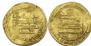
145 Abbasid, al-Mu'tamid (256-279h) , dinar, al-Muhammadiya 260h, 4.19g (Bernardi 173Mh RR; Miles, Rayy - ), an uneven striking, about fine and rare £200-250