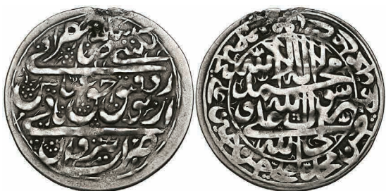
307 Safavid, 'Abbas II (1052-1077h) , abbasi, Irawan (Yerevan in Armenia), date not visible, 7.17g (Album 2645X), a nineteenth-century jewellery piece, ex-mount, very fine £80-120