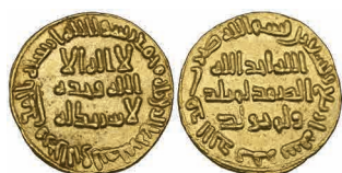
31 Umayyad , dinar, 94h, 4.28g (ICV 176; W. 207), extremely fine £450-500