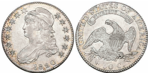
543 U.S.A. , half-dollar, 1820, small date, with curled base to 2 of date, extremely fine or better, in PCGS holder graded AU58 £1,500-2,500