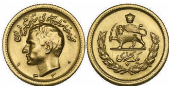
g452 Iran, Mohammad Reza Pahlawi (1941-1979) , gold pahlawi, 1330h, head in high relief (KM 1150), about uncirculated and scarce £350-450