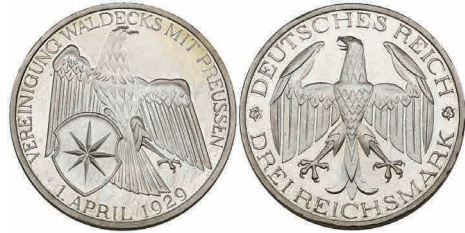
786 Weimar Republic , Union of Waldeck and Prussia, proof 3 reichsmark, 1929 A, mint state £150-200