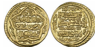
302 Ilkhanid, Abu Sa'id (716-736h) , dinar, Baghdad 723h, 4.32g (Diler 502), extremely fine £350-400