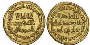
22 Umayyad , dinar, 82h, rev. , two points below y of yulad , 4.25g (ICV 160; W. 192), extremely fine £450-500