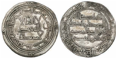
46 Umayyad , dirham, al-Bab 126h, 2.58g (Klat 153), very fine £280-320