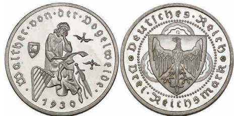
790 Weimar Republic , von der Vogelweide 700 th Anniversary, proof 3 reichsmark, 1930 G, mint state £200-300