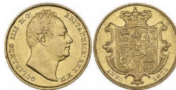
g371 William IV , sovereign, 1831, first bust, signed on truncation w.w. (with stops) incuse (Marsh 16), good fine to very fine £450-550