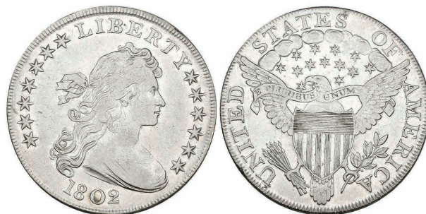
539 U.S.A. , 1 dollar, 1802, divided date, with serif missing from base of T of LIBERTY (Bolender 6), minor surface and edge marks, generally very fine [actually struck in 1804, according to Breen] £600-800