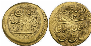
310 Qajar, Fath 'Ali Shah (1212-1250h) , toman, Tehran 1227h, type V, 4.77g (Album 2864; KM 749), good very fine £150-200

Ex Sotheby's, 28 April 1982, lot 451 (offered with envelope).