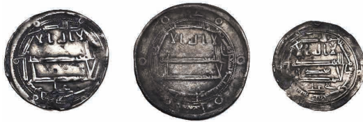
Lot 192 (obverses)