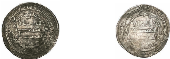
Lot 128 (obverses)

Abbasid, al-Mu'tasim (218-227h) , dirhams (7), comprising Isbahan 222h, Dimashq 222h, al-Shash 219h, Fars 219h, al-Muhammadiya 218h, Madinat al-Salam 219h and Marw 220h, the al-Muhammadiya creased, generally very fine (7) £200-250