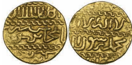
260 Burji Mamluk, Barsbay (825-841h) , ashrafi, mint-name (al-Qahira) off-flan, dated 840h, 3.39g (Balog 711), very fine £100-150