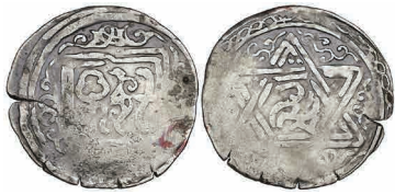
293 Chaghatayid, temp. Tuqa Timur (c. 670-690h) , dirham, Taraz, undated, triple tamgha in square, 1.72g (Album 1985), good fine £150-200