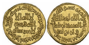
37 Umayyad , dinar, 105h, 4.26g (ICV 199; W. 224), tiny edge knock, extremely fine and rare £3,000-4,000