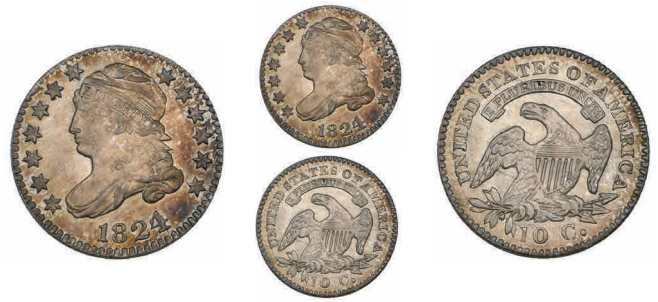
544 U.S.A. , dime, 1824/2, from slightly worn dies, virtually as struck and gently toned, in PCGS holder graded MS64 £2,500-3,500