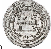
48 Umayyad , dirhams (2), al-Basra 128h and al-Jazira 128h, 2.89, 2.93g (Klat 175, 224), good very fine to extremely fine (2) £180-220