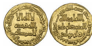
39 Umayyad , dinar, 115h, 4.26g (ICV 209; W.235), almost extremely fine and a scarce date £600-800