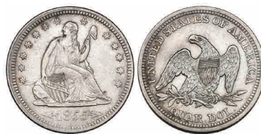
553 U.S.A. , quarter-dollar, 1855 arrows, extremely fine, in PCGS holder graded AU55 £120-150