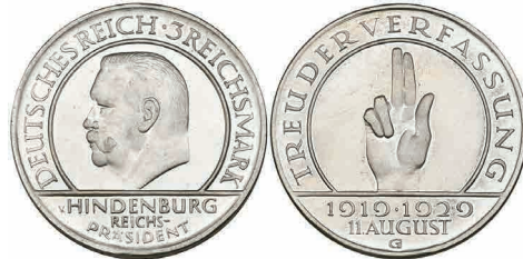
787 Weimar Republic , Hindenburg and Weimar 10 th Anniversary, proof 3 reichsmark, 1929 G, mint state £200-300