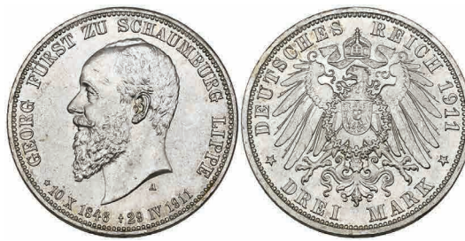
762 Schaumburg Lippe, Memorial to Prince Georg, 1911 , 3 mark, light bagmarks, mint state £100-150