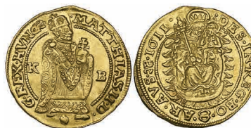
412 Hungary, Matthias II (1608-19) , ducat, Kremnitz, 1611, 3.42g (F. 81), minor striking flaw, extremely fine £400-500