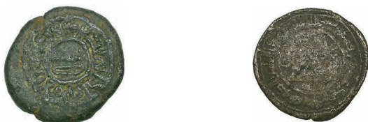
Lot 78 (obverses)