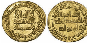
28 Umayyad , dinar, 87h, rev. , pellet below b of sab'a , 4.27g (ICV 165; W. 198), extremely fine £450-500