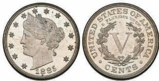
559 U.S.A., proof Liberty Head nickel, 1885, a few small carbon spots, otherwise virtually as struck, in PCGS holder graded PR65CA £600-800