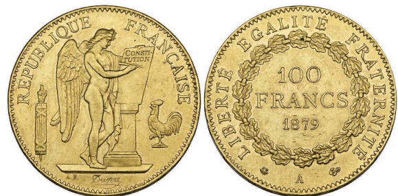
g448 France, Third Republic (1870-1940) , 100-francs, 1879-A, 32.24g (Gad. 1137; KM 832), extremely fine £800-1,000

Ex Sotheby's, 28 April 1982, lot 416 (offered with envelope).