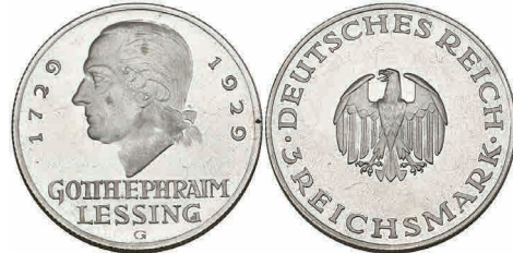
788 Weimar Republic , 200 th Anniversary of the birth of Lessing, proof 3 reichsmark, 1929 G, mint state £100-150