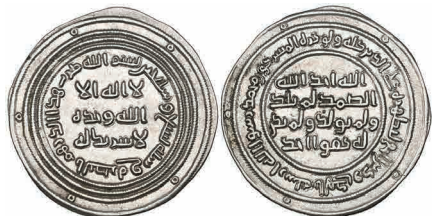
47 Umayyad , dirham, al-Basra 79h, 2.91g (Klat 168), extremely fine £200-250