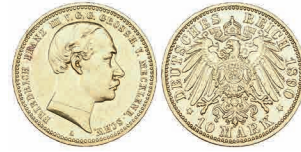
g714 Mecklenburg-Schwerin, Friedrich Franz III (1883-1897) , 10 mark, 1890 A (J. 232), polished, good fine but with scratches on bust, rare £300-400