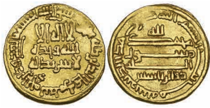
107 Abbasid, temp. al-Ma'mun (194-218h) , dinar, 200h, rev., Dhu'l-Riyasatayn , 4.24g (Bernardi 100), very fine £150-200