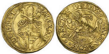
462 Italy, Vatican, Alexander VI, Borgia (1492-1503) , fiorino di camera, papal arms, rev. , St. Peter in ship, 3.35g (F. 31), slightly creased, very fine £600-800