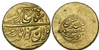
308 Afsharid, Shah Rukh (1161-1210h) , mohur, Mashhad, undated, 11.04g (Album 2779; Rabino 414), almost extremely fine £600-800