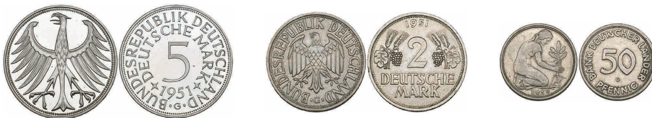
799 Federal Republic of Germany , Karlsruhe mint, proof 5 mark, 1951 G, virtually as struck ; together with circulated examples of 2 mark, 1951 G and BANK DEUTSCHER LÄNDER type 50 pfennig, 1951 G, both of which were re-struck unofficially from original dies, good very fine and about very fine (3) £600-800