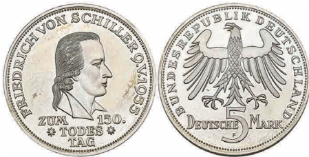
801 Federal Republic of Germany , 150 th Anniversary of the death of Schiller, proof 5 mark, 1955 F, a few tone spots, virtually as struck £200-300