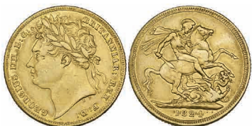
g365 George IV , sovereign, 1824, fine £350-400