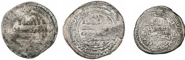
Lot 116 (obverses)