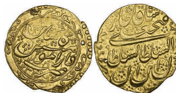
312 Qajar, Fath 'Ali Shah (1212-1250h) , toman, type W, Dar al-Mu'minin Kashan 1233h, 4.63g (Album 2865), good very fine £180-220

All ex Sotheby's, 28 April 1982, lot 453 (offered with envelope).