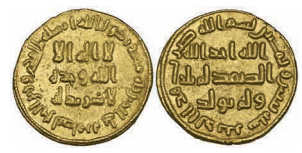
23 Umayyad , dinar, 82h, rev. , without points below y of yulad , 4.27g (ICV 160; W. 192 var. ), obverse die rust, about extremely fine £400-450