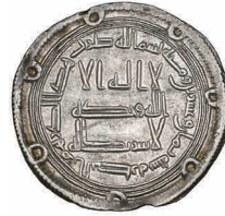
Lot 48 (obverses)