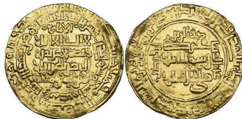
189 Abbasid, al-Nasir (575-622h) , dinar, Madinat al-Salam 621h, 6.05g (BMC I, 494), cleaned, very fine to good very fine £250-300