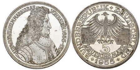
802 Federal Republic of Germany , 300 th Anniversary of the birth of Ludwig Wilhelm von Baden, proof 5 mark, 1955 G, a few tone spots, virtually as struck £200-300