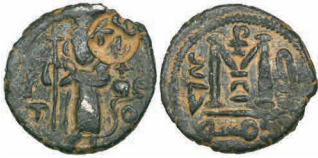
10 Arab-Byzantine , fals, Standing Imperial figure type, Dimashq, rev. , duriba – bi-Dimashq – ja’iz around, with circular countermark ω | KN at one o’clock on obverse, 3.64g (Foss 53 for undertype), very fine £80-120