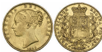
g374 Victoria , young head, sovereign, 1839 (Marsh 23), slightly weak in shield, otherwise fine £800-1,000