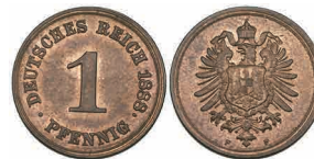
766 German Imperial Standard Coinage , copper 1 pfennig, 1888 F, mint state, with much original lustre, scarce thus £70-100