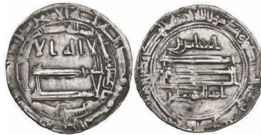
113 Abbasid, temp. al-Ma'mun (194-218h) , dirham, Ma'dan Bajunays 218h, rev., citing al-Abbas bin – amir al-mu'minin above and below field, 2.70g, almost very fine and excessively rare, apparently unpublished £700-1,000