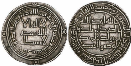
45 Umayyad , dirham, al-Bab 123h, 2.74g (Klat 150), very fine £180-220