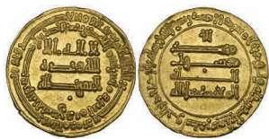
150 Abbasid, al-Mu'tadid (279-289h) , dinar, San'a 289h, obv. , pellet below, 2.91g (Bernardi 211El), extremely fine £300-400