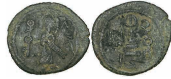
14 Arab-Byzantine, temp. ‘Abd al-Malik b. Marwan , fals, Harran, undated, standing figure of caliph with hand on sheathed sword; in field: Muhammad (to left); Harran (to right), rev. , modified cross on steps; in field: Greek monogram (to left); Muhammad (to right); IS (below), 2.90g (Walker p.25, Vat.1; Album 3537 RR), green patina, good fine and rare £400-600