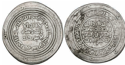
50 Umayyad , dirham, Ramhurmuz 90h, 2.72g (Klat 383), good very fine £70-100