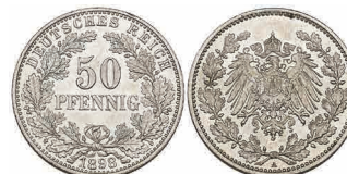
767 German Imperial Standard Coinage , silver 50 pfennig, 1898 A, mint state, rare thus £400-500