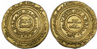
247 Fatimid, al-Amir (495-524h) , dinar, al-Iskandariya 515h, 4.31g (Nicol 2460), about extremely fine and scarce £250-300