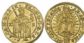
413 Hungary, Ferdinand II (1619-37) , ducat, Kremnitz, 1624, 3.41g (F. 98), virtually as struck £1,000-1,500