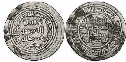
49 Umayyad , dirham, Junday Sabur 83h, 2.76g (Klat 237), some staining, good fine and rare £200-250