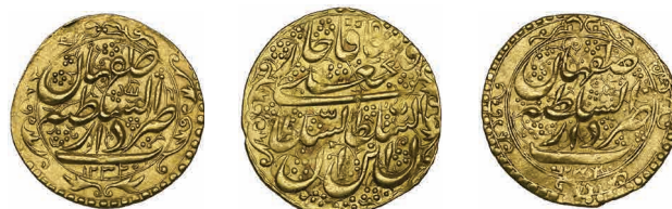
Lot 311 (obverses)

Ex Sotheby's, 28 April 1982, lot 451 (offered with envelope).