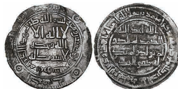
83 Revolutionary Period, al-Kirmanī b. 'Alī , drachm, Marw 128h, obv. , governor's name in outer margin, 2.29g (Klat 603; Wurtzel 30), toned, some peripheral corrosion and minor edge losses, otherwise almost very fine and very rare £1,200-1,500