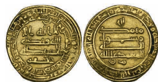
147 Abbasid, al-Mu'tamid (256-279h) , dinar, Madinat al-Salam 257h, 4.07g (Bernardi 173Jh), edge shaved, about very fine £200-250