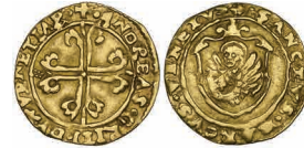
466 Italy, Venice, Andrea Gritti (1523-39) , half scudo d'oro, 1.56g (Paolucci 59, 4; F. 1449), very fine £200-250

Ex Stack's auction, New York, 13-15 May 1982, lot 1487.