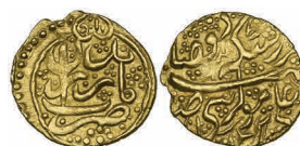
309 Qajar, Agha Muhammad Khan (1193-1211h) , quarter-mohur, Mazandaran 1199h obv. , be-zar sekkeh az meymanat zad qaza | be-nam-e 'Ali ebn-e Musa al-Reza , rev. , mint-name with date above, 2.71g (Album 2837), edge ragged to left of date, otherwise very fine or better, scarce £120-150