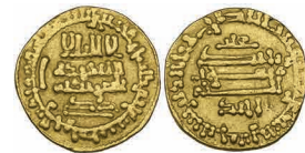
198 Aghlabid, Ahmad b. Muhammad (242-249h) , dinar, 245h, 4.24g (al-'Ush 59), about very fine £200-250