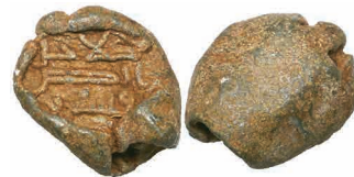
80 Umayyad , lead seal, uniface, in three lines: jalajal | Ard | Qinnasrin , 9.90g, good very fine £150-200