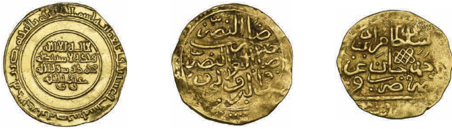
Lot 235 (obverses)

235 Fatimid, al-Zahir (411-427h) , dinar, Misr 426h, 4.04g (Nicol 1536), edge shaved and possibly ex-mount, otherwise very fine ; Ottoman , sultanis (2), Qustantaniya 1012h and Misr 1032h, good fine (3) £400-500