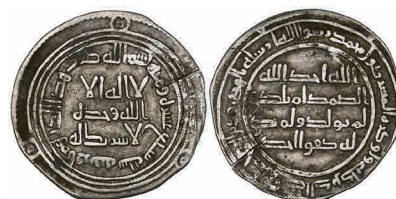
42 Umayyad , dirham, Ifriqiya 117h, 2.59g (Klat 104), edge split and some graffiti, almost very fine and scarce £150-200