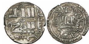
291 Chaghatayid, temp. Alughu (659-664h) , dirham, Almaligh 661h, 1.91g (Album 1983), good very fine, scarce £150-200