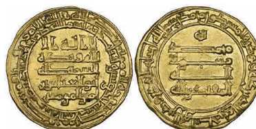
159 Abbasid, al-Muqtadir (295-320h) , dinar, Madinat al-Salam 311h, 4.40g (Bernardi 242Jh), about extremely fine £200-250