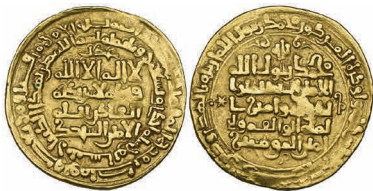
286 Ghaznavid, Mahmud (389-421h) , dinar, Naysabur 391h, 5.29g (Qatar 4788/4783), very fine to good very fine £180-220