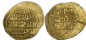
256 Bahri Mamluk, Qala'un (678-689h) , dinar, Hamah, date off flan, 5.60g, a crude striking on an irregular flan, very fine for issue and rare £300-400