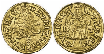
406 Hungary, Matthias Corvinus (1458-90) , goldgulden, Nagyszeben, 3.53g (Lengyel 39/4), very fine £400-500