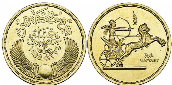
444 Egypt, Republic (1953-1958) , five-pounds, 1955/1374h, rev., ancient Egyptian charioteer riding to right, holding drawn bow, 42.65g (KM 388), struck in yellow gold, minor hairlines otherwise almost as issued £1,000-1,500

Ex Sotheby's, 28 April 1982, lot 412 (offered with envelope).