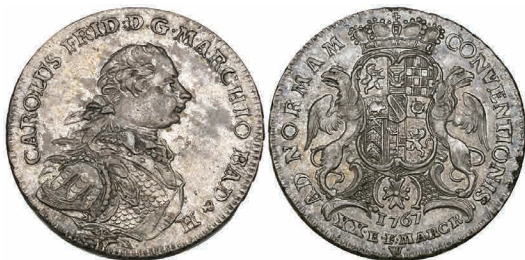
592 Baden, Karl Friedrich , half convention thaler, 1767, similar type (Wielandt 722; KM 116), about extremely fine £800-1,000