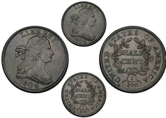
540 U.S.A. , half-cent, 1804, plain 4 in date, no stems in wreath, good extremely fine and scarce thus, in in PCGS holder graded MS63BN £1,200-1,500