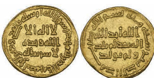
36 Umayyad , dinar, 100h, 4.25g (ICV 189; W. 216), extremely fine £500-600