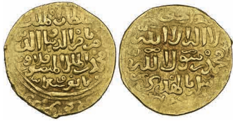
257 Bahri Mamluk, Nasir al-Din Muhammad (Third Reign, 709-741h) , dinar, Dimashq al-Mahrusa 709h, 5.94g (Balog -), very fine, scarce £300-400