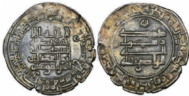
182 Abbasid, al-Radi (322-329h) , dirham, al-Rafiqqa 327h, 3.64g (Lavoix 1240), minor edge faults, almost very fine and toned, rare £100-150