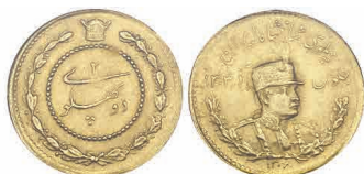
g454 Iran, Reza Shah Pahlawi (1925-1941) , gold 2-pahlawi, 1308 (KM 1115), extremely fine [in NGC holder where graded MS61] £200-250