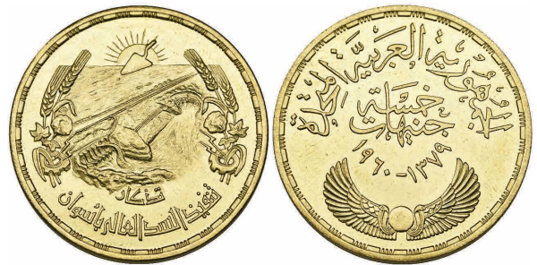
446 Egypt, United Arab Republic (1958-1971) , five-pounds, 1960/1379h, Aswan Dam, 42.51g (KM 402), about uncirculated £1,000-1,200

All ex Sotheby's, 28 April 1982, lot 413 (offered with envelope).