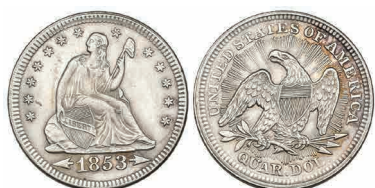
551 U.S.A. , quarter-dollar, 1853, with arrows and rays, a few light marks, otherwise mint state, in PCGS holder graded MS62 £500-600