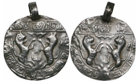
290 An Islamic silver medallion , probably Seljuq period, both sides depicting two confronted lions with tamgha between them, legend around and also in horizontal band above, 2.73g, with contemporary suspension loop, apparently made from two joined repoussé plates, very fine and rare £400-500