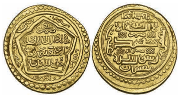
304 Ilkhanid, Abu Sa'id (716-736h) , dinar, Shiraz 722h, 8.89g (Diler 502), good very fine £350-400