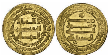
153 Abbasid, al-Muktafi (289-295h) , dinar, Madinat al-Salam 295h, 4.15g (Bernardi 226Jh), extremely fine £250-300