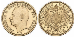
g706 Baden, Friedrich II , 10 mark, 1913 G, good extremely fine, rare thus £1,000-1,500