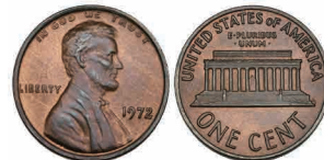
562 U.S.A., Lincoln cent, 1972, obv., 'Doubled Die', mint state, with much lustre, in PCGS holder graded MS65RB £150-250