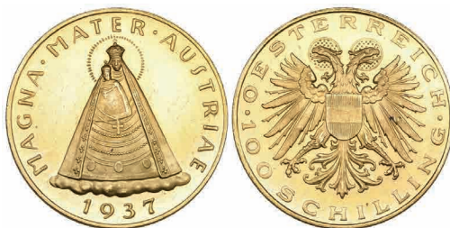
g433 Austria, Republic , 100 schilling, 1937, one or two tiny marks, prooflike mint state, in PCGS holder graded PL65 £1,500-2,000