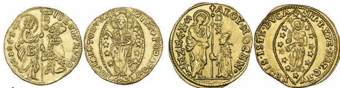
464 Italy, Venice, Giovanni Delfino (1356-61) , ducat, 3.53g (F. 1224), very fine ; Aloysius Mocenigo IV (1763-78) , zecchino, 3.47g (F. 1434), about extremely fine (2) £400-450