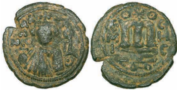
11 Arab-Byzantine , fals, Imperial Bust type, Hims, rev. , pelleted annulets to either side of star above M, o-o below tayyib , 4.00g (cf Foss 69 [without o-o below]), good fine and a rare variety £100-150