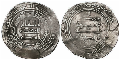
184 Abbasid, al-Radi (322-329h) , dirham, Filastin 322h, 3.11g (Miles, RIC p.97, note 183), edge damage, fine to good fine and very rare £200-300