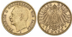
g704 Baden, Friedrich II , 10 mark, 1910 G, surface scuffs, very fine £350-450