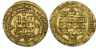
288 Great Seljuq, Tughril Beg (429-455h) , dinar, Naysabur 447h, 3.75g (SNAT XIVa 628; Alptekin 35), edge shaved, very fine £300-400