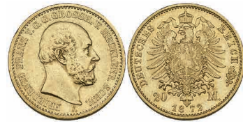
g713 Mecklenburg-Schwerin, Friedrich Franz II (1842-83) , 20 mark, 1872 A (J. 230), very fine £500-600