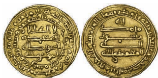
142 Abbasid, al-Mu'tamid (256-279h) , dinar, San'a 268h, 2.92g (Bernardi 177El), about extremely fine and a rare date £250-300