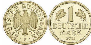
804 Federal Republic of Germany , Retirement of the Deutschmark, 2001, proof 1 mark struck in gold, 2001 F, mint state £250-350