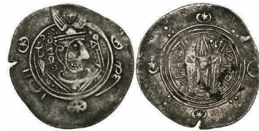
17 Abbasid Governors of Tabaristan, Ma’add (fl. 173h) , hemidrachm, TPWRSTAN PYE 138, with governor’s name before bust, 1.72g (Album 66 RR; Malek 108.6), edge nick, almost very fine and rare £400-600