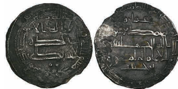
114 Abbasid, al-Ma'mun (194-218h) , dirham, Jund Dimashq 200h, rev., citing Umara | ibn Junayd (?) above and below field, 2.61g (Lowick 627; cf Baldwin's Islamic Coin Auction 26, 6 August 2014, lot 188, where a similar coin is discussed with historical conjectures on the circumstances of its issue), stained and with small edge clip, fine overall with reverse field very clear, extremely rare £300-400