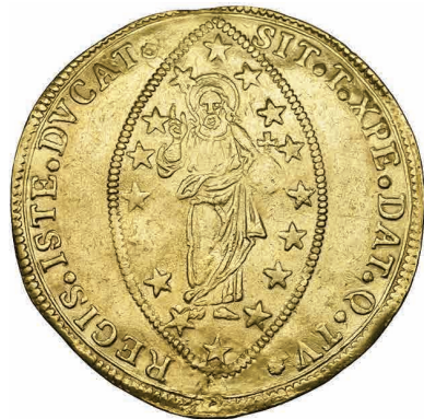
468 Italy, Venice, Paolo Rainier (1779-89) , 8 zecchini, 27.15g (Paolucci 130, 11; F. 1432), ex-mount and repaired at 6 o'clock, otherwise good fine and rare £2,000-3,000