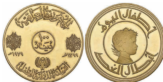
g457 Iraq, Republic, proof gold 100-dinars, 1979/1399h, International Year of the Child, 26.02g (KM 167), misty surfaces, otherwise almost as issued £600-800