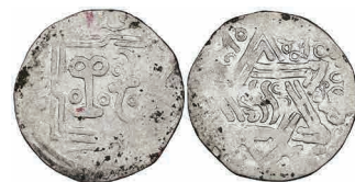
292 Chaghatayid, temp. Tuqa Timur (c.670-690h) , dirham, Taraz, undated, double tamgha in square, 1.56g (Album 1985; Nyamaa 46 var. ), good fine £150-200