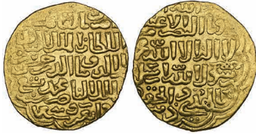
258 Bahri Mamluk, Hasan, First Reign (748-752h) , dinar, al-Qahira 749h, 5.69g (Balog 317), better than very fine £200-250