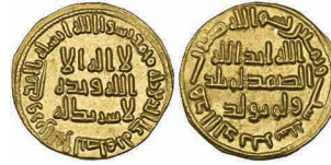
27 Umayyad , dinar, 86h, 4.30g (ICV 164; W. 197), good extremely fine with some lustre £450-500