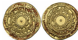
219 Fatimid, al-Mu'izz (341-365h) , dinar, Misr 362h, month of Muharram, 4.23g (Nicol 365), good very fine £250-300