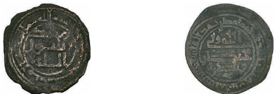
Lot 77 (obverses)