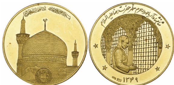
453 Iran, temp. Mohammad Reza Pahlawi (1941-1979) , proof gold medal, struck to commemorate the visit of the Shah to the shrine of Imam Reza, 1970, .900 fine, 25.08g, virtually as struck £800-1,000