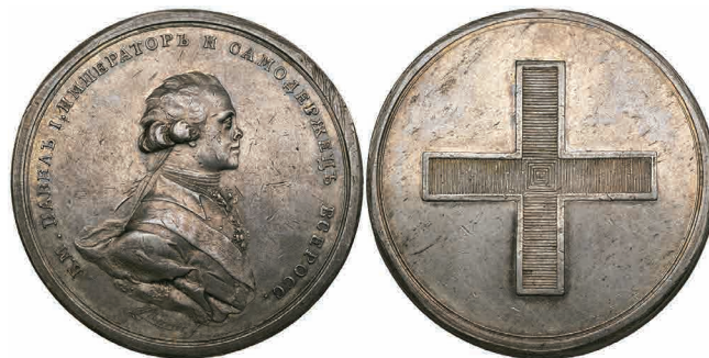
515 Russia, Paul I , Coronation, silver medal, by C. Leberecht, similar to lot 479 above but Leberecht f. below bust, 43.5mm, 34.72g (Bitkin M227; Diakov 243.7, this piece cited), better than very fine and rare £400-600

First coin ex World-Wide Coins of California Auction III, 18 November 1982, lot 1026.