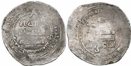
183 Abbasid, al-Radi (322-329h) , dirham, Tabariya 323h, 3.49g (Bacharach 123, citing Lavoix 1229 [where the coin is described as a dinar]), considerable weak striking, fine with clear mint and date, very rare £300-400