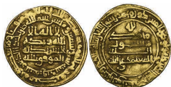
141 Abbasid, al-Mu'tamid (256-279h) , dinar, Samarqand 272h, 4.06g (Bernardi 177Qe), some deposit, good fine £200-250