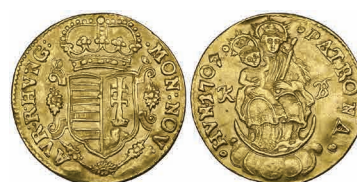
415 Hungary, Rebellion of the Malcontents (time of Franz II Rakoczi, 1703-11) , ducat, Kremnitz, 1707, 3.06g (F. 160), edge carefully clipped or filed, lightly creased, otherwise good very fine and very rare £2,000-3,000