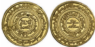
248 Fatimid, al-Amir (495-524h) , dinar, Misr 516h, 4.29g (Nicol 2539), scrape on obverse, otherwise almost uncirculated and lustrous £200-250