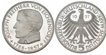
803 Federal Republic of Germany , Centenary of the death of Joseph Freiherr von Eichendorff, proof 5 mark, 1957 J, a few tone spots, virtually as struck £200-300