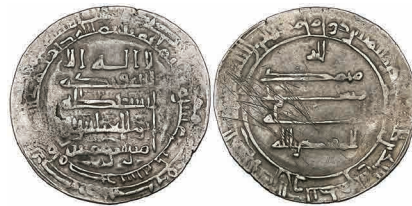
167 Abbasid, al-Muqtadir (295-320h) , dirham, Misr 313h, 2.64g (SICA 4, 1626), good fine £150-200