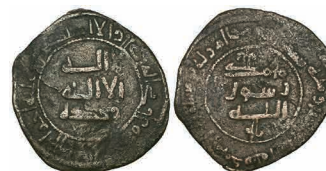
84 Revolutionary Period, Abu Muslum , fals, without mint-name, 132h, obv. , in margin: bismillah amr bihi Abu Muslim amir Al Muhammad sanat... , 2.38g (Wurtzel 37 var.; Album 208), good fine, rare £150-200

Rawh b. Zinba' was a member of an Arab tribe rooted in Palestine. He commanded a Palestinian contingent of the Umayyad forces who suppressed a rebellion in the Hijaz in 63h, and in the following year is said to have supported the claims of Marwan b. al-Hakam to the caliphate during. After Marwan's death in 65h, Rawh became a key adviser to his son and successor, 'Abd al-Malik b. Marwan, under whom he was also deputy governor of his native Palestine.