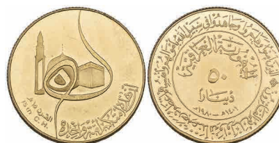
g459 Iraq, Republic, Fifteenth Century of the Hijri Calendar, proof gold 50-dinars, 13.79g (KM 150), reverse somewhat 'misty', otherwise virtually as struck £300-350