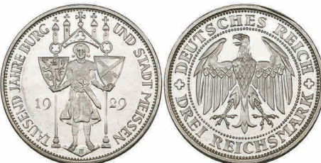
785 Weimar Republic , Meissen 1,000 th Anniversary, proof 3 reichsmark, 1929 E, mint state £100-150