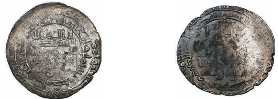
Lot 168 (obverses)