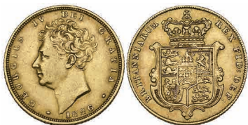
g368 George IV , sovereign, 1826 (Marsh 11), good fine £400-500