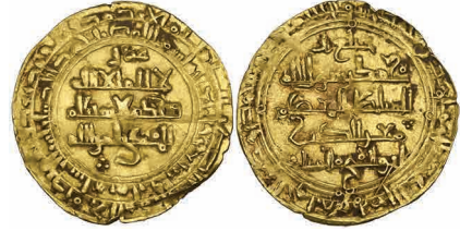
289 Great Seljuq, Malikshah (465-485h) , dinar, Shiraz (?) 478h, citing the governor Khutlugh Beg , 3.64g (Album 1674 and note), very fine and scarce £250-300