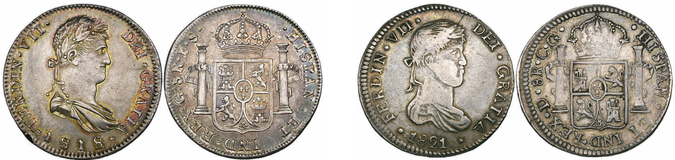
ex lot 1038

Mexico, Fernando VII , miscellaneous silver and copper issues, Mexico City, 8-reales (14), 2-reales (8), two pierced , 1-reales (3), one pierced , half-reales (14), quarter real, 1810, copper 2 quartos (3), copper quarto, 1814, copper octavo, 1814; together with Morelos Rebel Issue, copper 8-reales (3), one counterstamped with countermark on obverse , copper 2-reales, 1813, copper half-reales (2); also First Empire, Agustin de Iturbide (1822-23) , Province of Nueva Viscaya, copper 1 octavo, 1822, Durango, silver poor to very fine, copper slightly porous, one corroded, poor to fine (52) £350-450