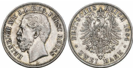
757 Reuss-Schleiz, Heinrich XIV (1867-1913) , 2 mark, 1884 A, very fine and scarce £100-120