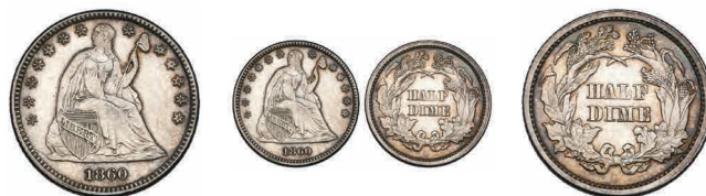
554 U.S.A. , half-dime, 1860, 'transitional pattern' lacking the legend UNITED STATES OF AMERICA on either side, obv. with hollow-centred stars around Liberty, rev., value in wreath (Judd 267), light traces of handling, good extremely fine and lightly toned, rare £800-1,200