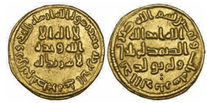
24 Umayyad , dinar, 83h, rev. , two points below y of yulad , 4.28g (ICV 161; W. 193), extremely fine £450-500