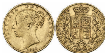
g375 Victoria , young head, sovereign, 1839 (Marsh 23), about fine £700-900