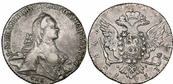
513 Russia, Catherine II , rouble, 1764 яІ, St Petersburg (Bitkin 185), very fine £120-150