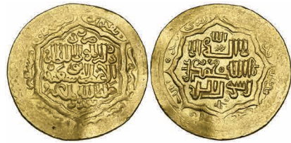
298 Ilkhanid, Abu Sa'id (716-736h) , dinar, Baghdad 717h, 8.18g (Diler 478), buckled flan and margins a little weak, good very fine £300-400