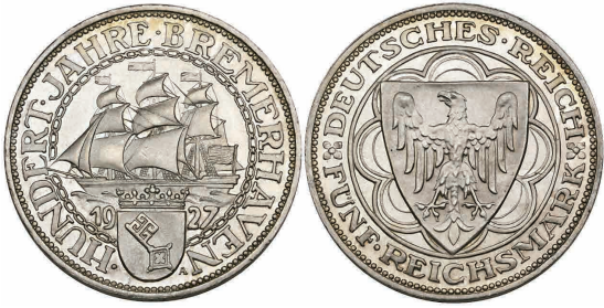
781 Weimar Republic , Bremerhaven Centenary, proof 5 reichsmark, 1927 A, mint state £500-600