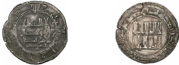
284 Lot 284 (obverses) Qarakhanid , dirhams (2), Yarkand 409h and Isbijab 401h, 4.32, 2.53g, very fine (2) £120-150