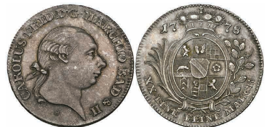
596 Baden, Karl Friedrich , half convention thaler, 1778 H / s, similar but a variety with stop replacing colon after FRID in legend (Wielandt 725; KM 126), extremely fine and toned £600-800