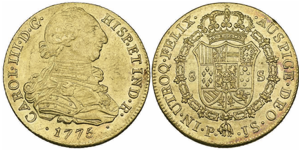
440 Colombia, Charles III , 8 escudos, Popayán mint, 1775 JS, with normal date, bagmarked, virtually mint state and well struck, with much original mint bloom £1,500-1,800

Ex Coin Galleries sale, 17 May 1983, lot 756.