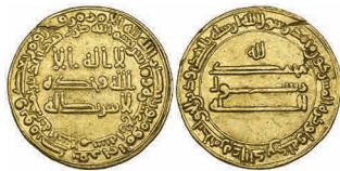
109 Abbasid, temp. al-Ma'mun (194-218h) , dinar, Madinat al-Salam 214h, 4.27g (Bernardi 116Jh), good very fine £200-300