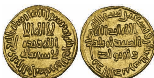
34 Umayyad , dinar, 98h, 4.27g (ICV 185; W. 213), extremely fine £450-500