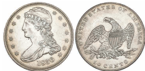
547 U.S.A. , half-dollar, 1836, with reeded edge, surface scuffs, in PCGS holder graded AU53 £2,000-3,000