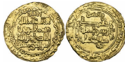
188 Abbasid, al-Nasir (575-622h) , dinar, Madinat al-Salam 600h, 3.93g (MWI 260), cleaned, minor edge marks, very fine and a rare date £300-350