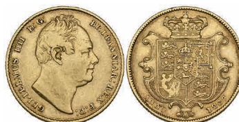
g372 William IV , sovereign, 1837, surface scratch behind head, fine to good fine £350-450