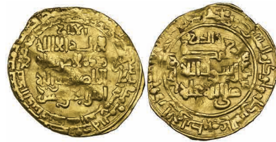
187 Abbasid, al-Nasir (575-622h) , dinar, Madinat al-Salam 591h, 4.51g (Diler p. 1143, citing Casanova, Collection Princesse Ismail , Paris 1896, otherwise apparently unpublished in the standard references), a little crimped, otherwise very fine and rare £300-400