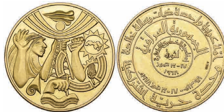
458 Iraq, Republic , gold medal, 1978, Tenth Anniversary of the Revolution, 15.67g (KM -), minor marks on reverse, otherwise almost uncirculated £350-400