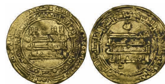
148 Abbasid, al-Mu'tamid (256-279h) , dinar, Madinat al-Salam 278h, obv. , citing the future caliph al-Mu'tadid , 4.16g (Bernardi 187Jh RR), good fine and rare £400-600