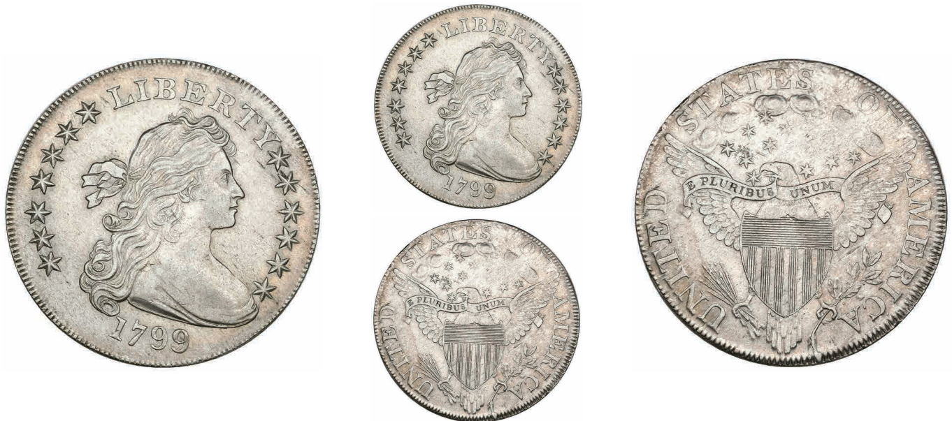
538 U.S.A. , 1 dollar, 1799, extremely fine and lightly toned, in PCGS holder graded AU58 £8,000-12,000