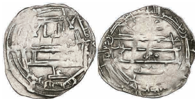
195 Idrisid, 'Ali b. Muhammad (221-234h) , dirham, 'Zila' 229h, 2.03g (cf Eustache 81-82 ['Ziz']), crudely struck, fine and very rare £400-500