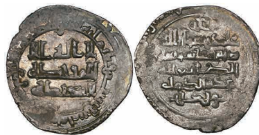
265 Hamdanid, 'Uddat al-dawla Abu Taghlib (358-369h) , dirham, Mayyafarqin 365h, 4.29g (Album 750.1), about very fine and rare £150-200