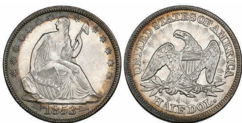
552 U.S.A. , half-dollar, 1853, with arrows and rays, extremely fine, with rather uneven edge toning, in PCGS holder graded AU58 £500-700