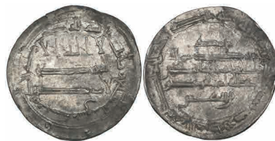
115 Abbasid, al-Ma'mun (194-218h) , dirham, Dimashq 207h, rev., citing the caliph and Muhammad b. Bayhas , 2.99g (Lowick 617, citing a single specimen noted by Markov), wavy flan, very fine for issue and very rare £200-300