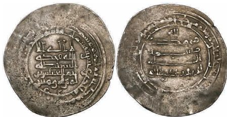
163 Abbasid, al-Muqtadir (295-320h) , dirham, Arrajan 311h, 2.91g, struck on a broad flan, good fine and toned, rare £100-150