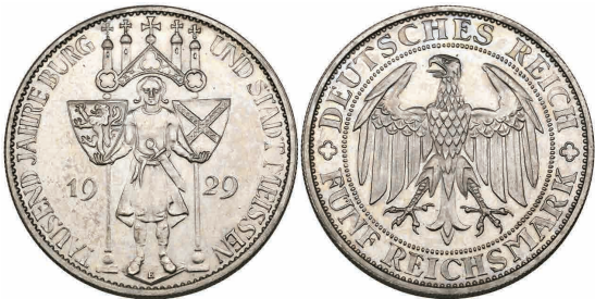
784 Weimar Republic , Meissen 1,000 th Anniversary, proof 5 reichsmark, 1929 E, a few surface marks and tone spots, good extremely fine £350-450