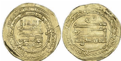
155 Abbasid, al-Muqtadir (295-320h) , Dinar, Suq al-Ahwaz 316h, 7.15g (Bernardi 242Nf), flan split, otherwise very fine and of unusually heavy weight £400-600