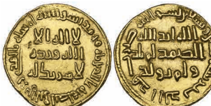
30 Umayyad , dinar, 92h, 4.26g (ICV 172; W.204), cleaned, good very fine £300-400