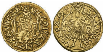
407 Hungary, Vladislaus II (1490-1516) , goldgulden, Nagybánya, 3.49g (Lengyel 81/2), very fine, rare £1,500-2,000