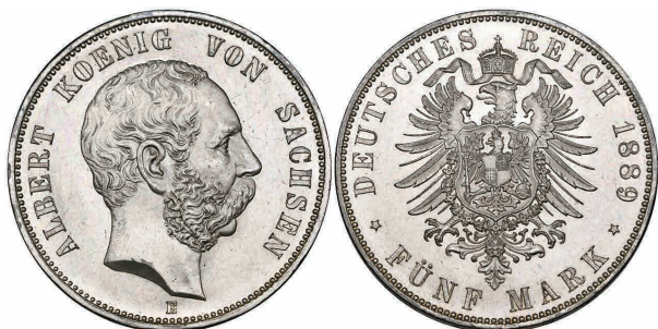
758 Saxony, Albert (1873-1902) , currency issue 5 mark, 1889, very minor bagmarks, mint state, rare thus £2,000-2,500