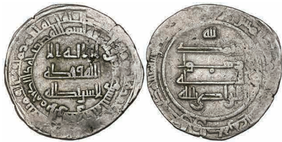
181 Abbasid, al-Radi (322-329h) , double-weight dirham, al-Rafiqqa 322h, 6.16g (cf Lavoix 1239), some marginal weakness, almost very fine and rare £200-250