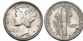
561 U.S.A., Mercury dime, 1925-D, good extremely fine to mint state, scarce £150-250