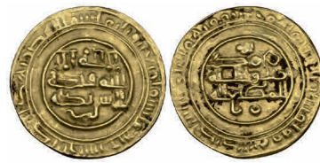
186 Abbasid, al-Muti' (334-363h) , dinar, Baysh 342h, rev. , crescent below field, 2.66g (SICA 10, 41), very fine and a very rare variety £1,500-2,000