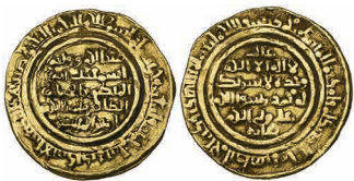
251 Fatimid, al-Zafir (544-549h) , dinar, al-Iskandariya 545h, 4.17g (Nicol 2651), struck from rusty dies, about fine and rare £300-400