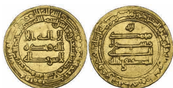
152 Abbasid, al-Muktafi (289-295h) , dinar, Madinat al-Salam 290h, 4.16g (Bernardi 226Jh), good very fine £300-400