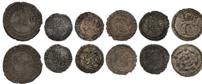
Plate coin in Bull English Silver Coinage as an example of the Second Hammered Issue Sixpence.

Ex Dix Noonan and Webb, Auction 132, 15th September 2015, lot 537.