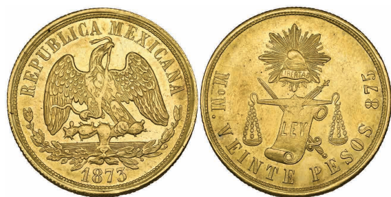
669 Decimal Coinage , 20 pesos, Mexico City mint, 1873 M, good extremely fine, with some original mint bloom £1,500-2,000