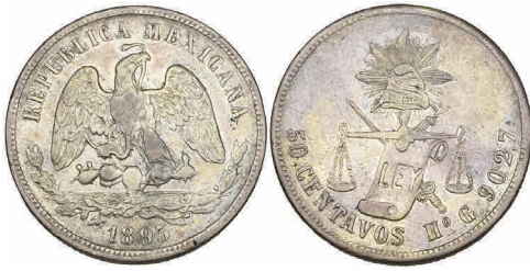
615 Decimal Coinage , 50 centavos, Hermosillo mint, 1895 G, fine and scarce £60-80