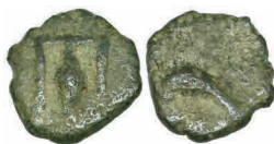
ex lot 67

Corinthia, Corinth, staters (4), 350-300 BC (Ravel 1014, 1021, 1056 and 997), fine to very fine, the last with smoothed edge from mounting ; Corinthian hemidrachms (3); Achaean League , hemidrachms (2); Sikyon , hemidrachm and diobol; Mysia, Parium , hemidrachm ( pierced ); and cistophori of Tralles and Pergamum, some fine or better (14) £400-600