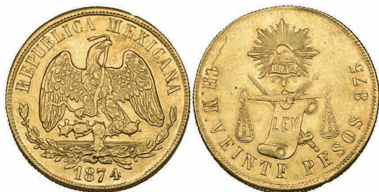
664 Decimal Coinage , 20 pesos, Chihuahua mint, 1874 M, file test-mark on rim at 1 o'clock, extremely fine, rare [1,116 pieces struck] £1,500-2,000