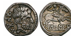
ex lot 2