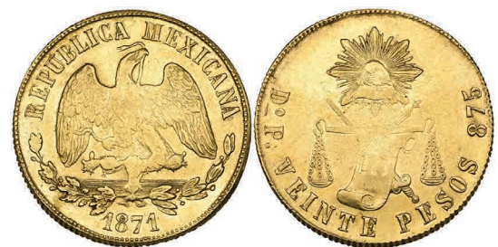
667 Decimal Coinage , 20 pesos, Durango mint, 1871/o P, 1 of date over o, weakly struck at centre, about extremely fine, scarce [1,073 pieces struck in 1871] £1,500-2,000

Ex Galerie des Monnaies, Geneva and New York.