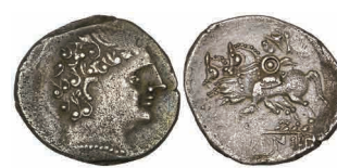
ex lot 3