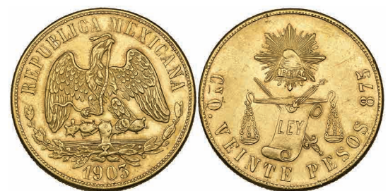
666 Decimal Coinage , 20 pesos, Culiacán mint, 1903 Q, minor marks, extremely fine or better, rare [1,121 pieces struck} £1,500-2,000