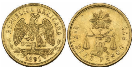
663 Decimal Coinage , 10 pesos, Zacatecas mint, 1891 Z, uncirculated [1,930 pieces struck] £700-900