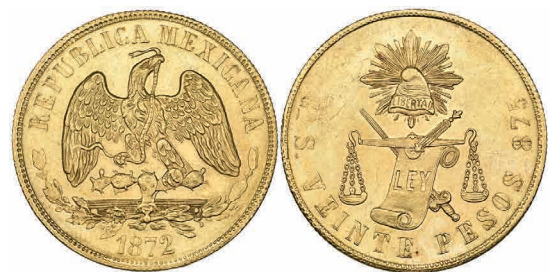
668 Decimal Coinage , 20 pesos, Guanajuato mint, 1872 S, weak at mintmark, about uncirculated £1,500-2,000

Ex Galerie des Monnaies, Geneva and New York.