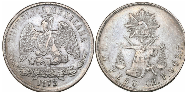
621 Decimal Coinage , 1 peso, Chihuahua mint, 1872 P, 72 of date repunched, minor rim bruise, very fine and rare £300-400