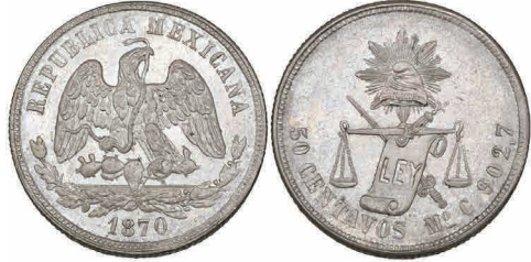
616 Decimal Coinage , 50 centavos, Mexico City mint, 1870 C, virtually mint state and toned £120-150