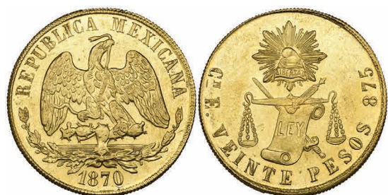
665 Decimal Coinage , 20 pesos, Culiacán mint, 1870 E, mint state £1,800-2,200