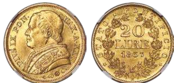
34369 Papal States. Pius IX gold 20 Lire Anno XII (1867)-R MS64 NGC , Rome mint, KM1382.3. AGW 0.1867 oz. Starting Bid: $200