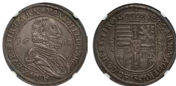
33345 Archduke Maximilian Taler 1618-CO MS64 NGC, Hall mint, KM227.1, Dav-3324. A lavish representative of a type that can be quite firmly said to simply never come so fine. While localized areas of flatness exist in portions of the design, wear is entirely absent, along with surface marks, the fields instead nearly satin and lightly iridescent. Starting Bid: $400