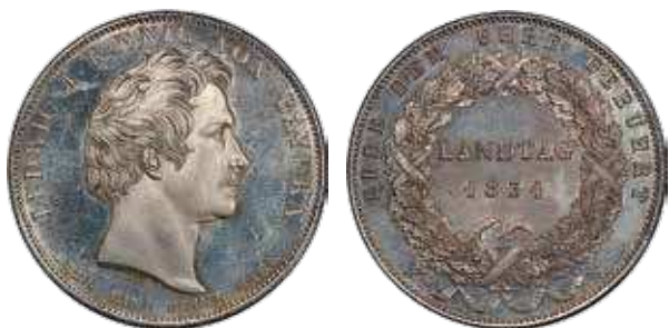
33815 Bavaria. Ludwig I "Landtag" Taler 1834 MS64 PCGS, KM-A765. Struck to honor the Provincial Legislature. Razor sharp and nearly medallion in character, the devices heavily frosted and contrasting clearly against the surrounding shimmering fields, graced by a delicate silver patina. Starting Bid: $750