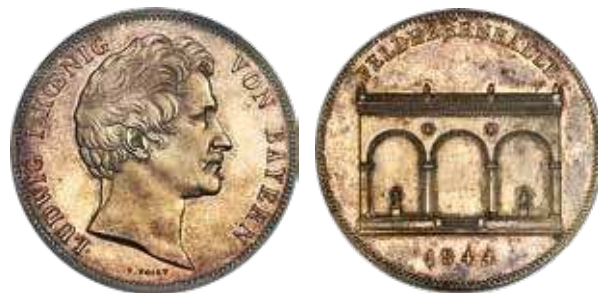
33820 Bavaria. Ludwig I "Feldherrnhalle" 2 Taler 1844 MS63 Prooflike PCGS, KM818. Struck to commemorate the completion of the Feldherrnhalle in Munich. Handsomely frosted over Ludwig's bust with a sharp contrast achieved against the enveloping mirrored fields, delicately speckled with minute and alluring flow lines. Reserve: $1,500