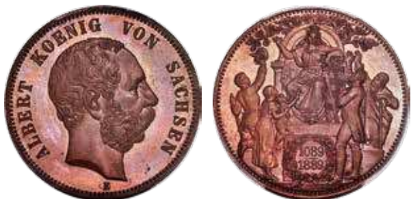
33919 Saxony. Albert bronze-copper Specimen Off-Metal "House of Wettin" 5 Mark 1889-E SP65 Brown PCGS , Muldenhutten mint, KM1249a. Mintage: 4,310. Struck on a rich red flan despite the Brown designation from PCGS with an especially strong medalllic feel. Reserve: $1,000