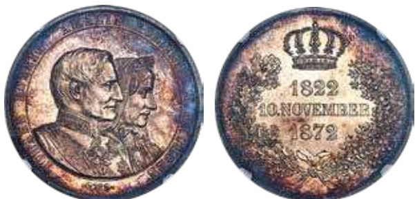
33917 Saxony. Johann 2 Taler 1872-B MS65 NGC , Dresden mint, KM1231.1. This example has a prooflike appearance while displaying deep gunmetal blues and maroon tones. Starting Bid: $250