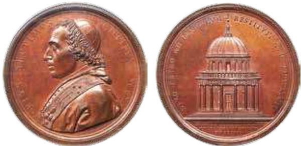
34365 Pius VII bronzed copper Specimen "Restoration of St. Peter's Church" Medal 1807 SP64 PCGS , Bertuzzi-84. 66mm. By Mercandetti. An impressive large-size commemorative medal with even mahogany hues. Starting Bid: $500