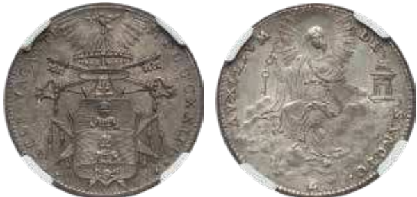
34366 Papal States. Sede Vacante 2 Giulio (Doppio) 1823-B MS65 NGC , Rome mint, KM1823. Of clear conditional rarity for the type, and attractive for the issue, the surfaces dressed in steel-blue tone with soft tangerine accents on the obverse. Starting Bid: $400