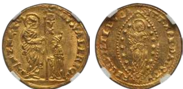
34403 Venice. Silvestro Valier gold Zecchino ND (1694-1700) MS64 NGC, Fr-1354. Well struck for this type with sparkling golden luster. Clearly a premium coin of the type. Starting Bid: $250