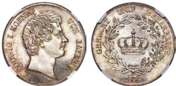
33814 Bavaria. Ludwig I Taler 1834 MS66 NGC, KM751. A resplendent representative of the issue marked by fully lustrous fields showcasing pale honeyed accents that cling to the legends and central devices. The very finest of the type seen by either NGC or PCGS to-date. Reserve: $1,500