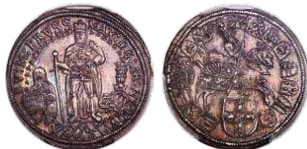
33923 Teutonic Order. Maximilian I of Austria 1/4 Taler ND (1590-1618) MS63 PCGS , Prok-71. Full strike with strong detail. Starting Bid: $200