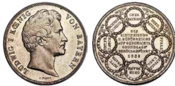
33818 Bavaria. Ludwig I "Reapportionment" 2 Taler 1838 MS63 PCGS, Munich mint, KM795. As close to Proof as is likely conceivable, possessing fully mirrorlike reflectivity even from a distance, the whole of the design finished with extreme care. Starting Bid: $500