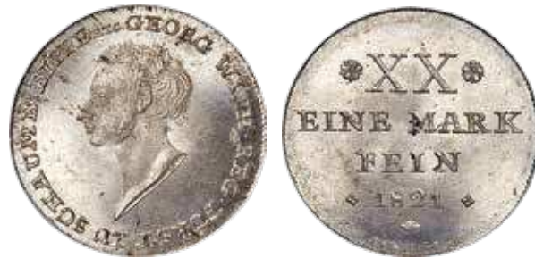
33920 Schaumburg-Lippe. Georg Wilhelm 1/2 Taler 1821 MS65 NGC , KM34. A brilliant silvery pattern of tone produces a pleasant reversion between darker devices and brighter fields that seems highly evocative of German coins of this period. Dual cartwheels whirl furiously across the fields with only a brief scattering of haymarks standing in their path, which, for their part, hardly disrupt the flow of the luster. The devices moreover appear highly frosty as the coin is turned in hand, bringing the visual allure full circle. Starting Bid: $200