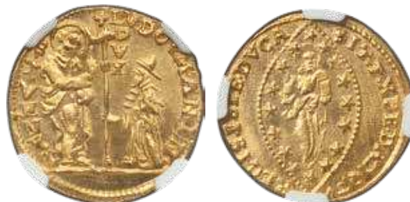
34407 Venice. Ludovico Manin gold Zecchino ND (1789-1797) MS65 NGC, KM755, Fr-1445. LVDO • MANIN • | S | • M | • V | E | N | E | T • / SIT • T • XPE • DAT • Q • TV | REGIS • ISTE • DVCA. Tied for the second-finest yet certified by NGC, and exhibiting a much clearer strike than is usually seen for the issue. From the Caranett Collection Starting Bid: $300