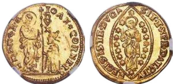
34404 Venice. Giovanni Corner II gold Zecchino ND (1709-1722) MS65 NGC, KM481. 3.49gm. IOAN ★ CORNEI | S | • M | • V | E | N | E | T • / SIT • T • XPE • DAT • Q • TV | REGIS • ISTE • DVCA. An elite specimen displaying a remarkably crisp strike. Produced from mildly worn dies with the C looking to be repurposed from a Q punch. Starting Bid: $250