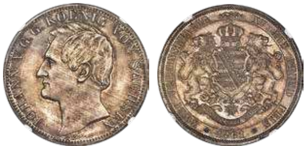
33916 Saxony. Johann 2 Taler 1861-B MS64 NGC , Dresden mint, KM1215. Lightly adjusted over toned surfaces revealing minimal handling. The finest example certified by NGC. Reserve: $1,400