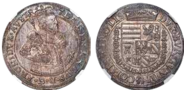
33340 Archduke Ferdinand Taler ND (1564-1595) MS64 NGC, Hall mint, Dav-8099B. Stunning, nearly a gem with considerable reflectivity in the recesses. Perhaps most noteworthy is the gorgeous tone this piece has developed, golds, blues and reds floating atop the luster and bolstering the eye appeal. Reserve: $1,400