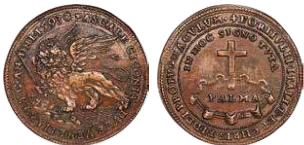
34400 Venice. Palmanova Fortress copper Medal 1593 AU53 Brown NGC, Voltolina-691. 43 mm. Starting Bid: $250