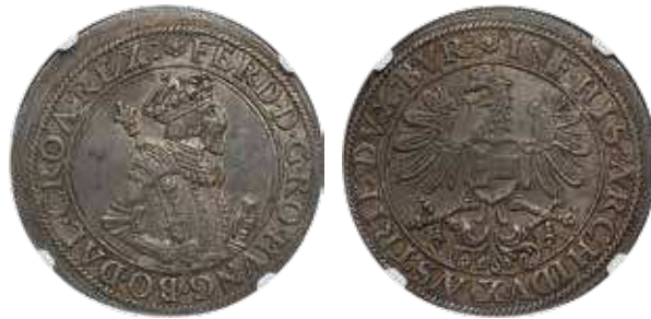
33341 Ferdinand I Posthumous Taler ND (after 1564) AU53 NGC, Hall mint, Dav-8030. Produced during the reign of Maximilian II, possibly from 1565. A very handsome issue, struck just mildly off-center with a rich argent and champagne patina. Starting Bid: $250