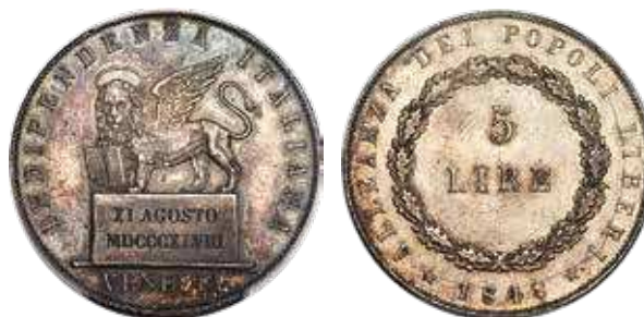
34409 Venice. Revolutionary 5 Lire 1848 MS63 PCGS, KM803 (prev. KM-C185). A strikingly clean piece for both the type and grade, only the most minor of wisps present and quickly offset by a pale blue and apricot patina. Starting Bid: $500