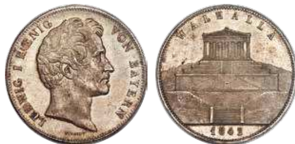
33819 Bavaria. Ludwig I "Walhalla" 2 Taler 1842 MS63 PCGS, Munich mint, KM811, Dav-587. Strongly radiant with a distinctive flashiness to the fields that borders on prooflike. Some faint adjusting marks are noted around the temple on the reverse, creating the illusion of rays emanating from the building. Starting Bid: $500