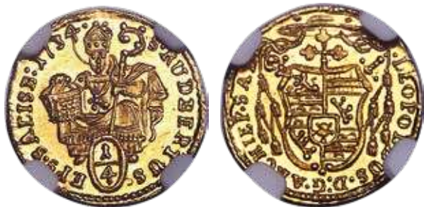
33338 Salzburg. Leopold Anton Eleutherius gold 1/4 Ducat 1734 MS66 NGC, KM330. A small golden gem with a powerful, prooflike visual allure and presently the finest at NGC to wit. Starting Bid: $250