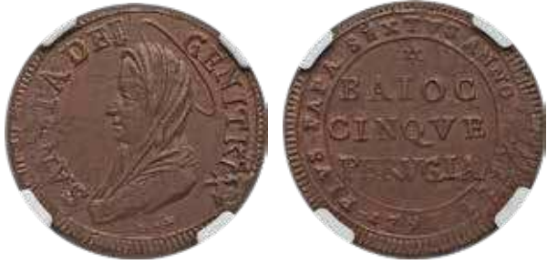
34364 Papal States. Pius VI 5 Baiocchi Anno XXIII (1797) MS64 Brown NGC , Perugia mint, KM8, B-3130. Exhibiting glossy and clay red surfaces with hints of fiery luster in the legends. An exceptional high-quality survivor of the issue. Starting Bid: $200