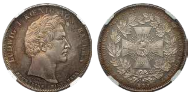
33816 Bavaria. Ludwig I "Order of Merit" Taler 1837 MS65 NGC, KM790. Commemorating the Order of St. Michael as Order of Merit. Gorgeous, a true gem with dazzling prooflike reflectivity and sublime toning. Starting Bid: $400