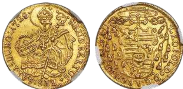
33339 Salzburg. Leopold Anton Eleutherius gold Ducat 1728 MS64 NGC, KM323, Fr-849. A distinctive example of this scarce type with a sharp strike and fetching mint brilliance. Tied with only a single other example seen by NGC for finest certified. Reserve: $1,400