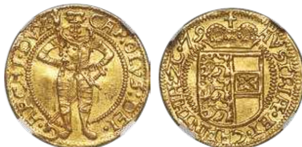
33342 Archduke Karl gold Ducat 1579 MS61 NGC, Klagenfurt mint, Fr-54. Satiny and lustrous, with the sharpness of the strike and general surface preservation yielding better eye appeal than what is usually expected at this level. The only example yet certified by NGC of this scarce type. Reserve: $1,300