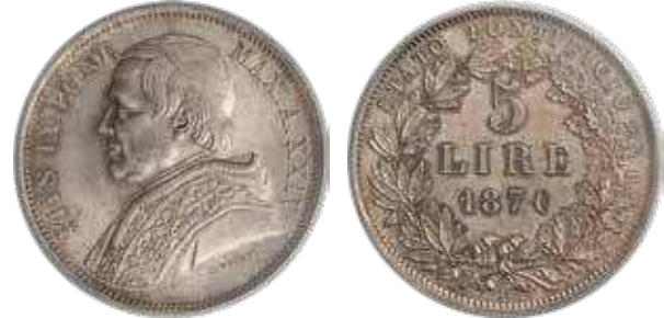
34368 Papal States. Pius IX 5 Lire Anno XXIV (1870)-R MS64 PCGS , Rome mint, KM1385. A very high level of preservation for an often well-circulated type, only a single piece certified a grade point higher at PCGS. Starting Bid: $200