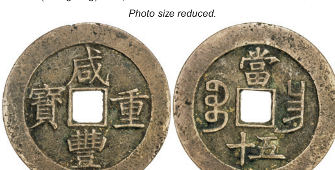
1433. QING: Xian Feng , 1851-1861, AE 50 cash (46.89g), Nanchang mint, Jiangxi Province, H-22.931, 52mm, cast 1855-60, brass ( huáng tóng ) color, F-VF $75 - 100