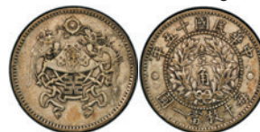
1479. CHINA: Republic , AR 10 cents, year 15 (1926), Y-334, L&M-83, dragon and peacock coat of arms, PCGS graded EF45 $150 - 250