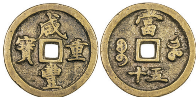
1428. QING: Xian Feng , 1851-1861, AE 50 cash (47.01g), Kaifeng mint, Henan Province, H-22.847, 46mm, cast 1854-55, brass ( huáng tóng ) color, some porosity, F-VF $75 - 100