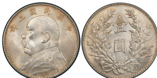
1475. CHINA: Republic , AR dollar, year 3 (1914), Y-329, L&M-63, triangular yuan, PCGS graded MS62 $150 - 250