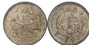
1477. CHINA: Republic , AR 10 cents, year 15 (1926), Y-334, L&M-83, dragon and peacock, cleaned, PCGS graded AU details $200 - 300

On 12 December 1915, one year after these coins were struck,, Yüan proclaimed himself Emperor of the Chinese Empire under the era name of Hongxian (Constitutional Abundance). The new Empire of China was to formally begin on 1 January 1916, when Yüan Shih-kai, the Hongxian Emperor, intended to conduct the accession rites. Funding for the Hongxian Emperor's accession ceremony was cut on 1 March 1916, and Yüan Shih-kai formally abandoned the empire on 22 March 1916 after a 'reign' of only 83 days.