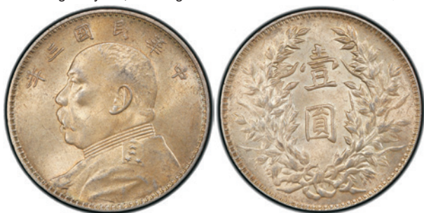
1472. CHINA: Republic , AR dollar, year 3 (1914), Y-329, L&M-63, triangular yuan, PCGS graded MS62 $150 - 250