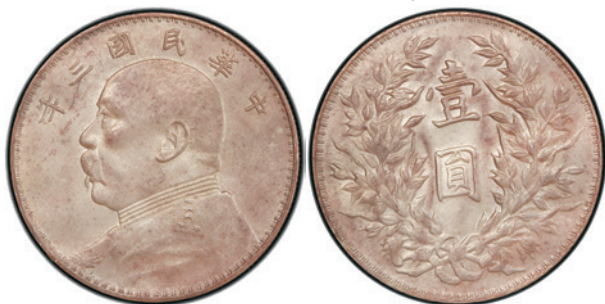
1471. CHINA: Republic , AR dollar, year 3 (1914), Y-329, L&M-63, triangular yuan, PCGS graded MS62 $150 - 250