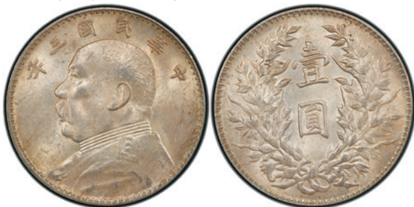
1473. CHINA: Republic , AR dollar, year 3 (1914), Y-329, L&M-63, triangular yuan, PCGS graded MS62 $150 - 250