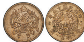
1478. CHINA: Republic , AR 10 cents, year 15 (1926), Y-334, L&M-83, dragon & peacock coat of arms, PCGS graded AU53 $125 - 175