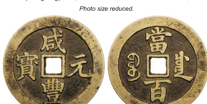
1434. QING: Xian Feng , 1851-1861, AE 100 cash (54.73g), Chengdu, Sichuan Province, H-22.981, 56mm, cast in 1854-55, brass ( huáng tóng ) color, VF $100 - 150