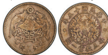
1480. CHINA: Republic , AR 20 cents, year 15 (1926), Y-335, L&M-82, dragon & peacock coat of arms, PCGS graded EF45 $125 - 175