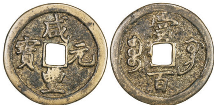
1427. QING: Xian Feng , 1851-1861, AE 100 cash (38.02g), Gongchang mint, Gansu Province, H-22.809, 52mm, curved gong in Manchu script, cast 1854-57, brass ( huáng tóng ) color, Fine $75 - 100