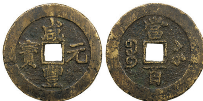
1431. QING: Xian Feng , 1851-1861, AE 100 cash (65.99g), Suzhou mint, Jiangsu Province, H-22.913, 59mm, cast 1854-55, with hook style xian , rough surfaces as made, VG-F $75 - 100