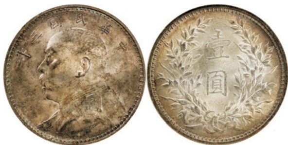
1470. CHINA: Republic , AR dollar, year 3 (1914), Y-329, L&M 63, lovely multicolored tone, old NGC holder, NGC graded MS64 $800 - 1,000