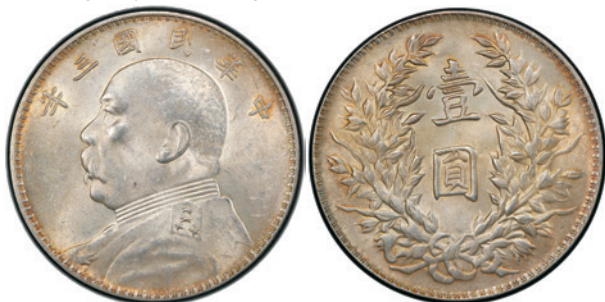
1474. CHINA: Republic , AR dollar, year 3 (1914), Y-329, L&M-63, triangular yuan, PCGS graded MS62 $150 - 250