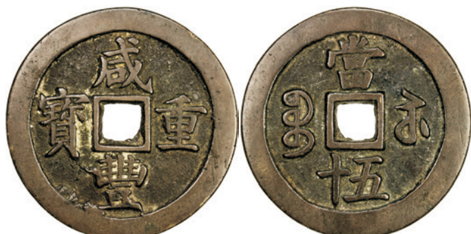
1430. QING: Xian Feng , 1851-1861, AE 50 cash (47.42g), Suzhou mint, Jiangsu Province, H-22.907, 55mm, cast 1854-55, copper ( tóng ) color, VF $100 - 200