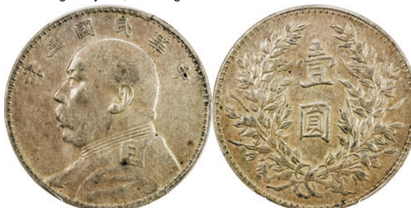
1476. CHINA: Republic , AR dollar, year 3 (1914), Y-329, L&M-63, Yuan Shih-Kai, PCGS graded AU50 $100 - 150

On 12 December 1915, one year after these coins were struck,, Yüan proclaimed himself Emperor of the Chinese Empire under the era name of Hongxian (Constitutional Abundance). The new Empire of China was to formally begin on 1 January 1916, when Yüan Shih-kai, the Hongxian Emperor, intended to conduct the accession rites. Funding for the Hongxian Emperor's accession ceremony was cut on 1 March 1916, and Yüan Shih-kai formally abandoned the empire on 22 March 1916 after a 'reign' of only 83 days.