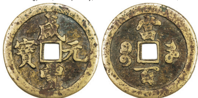
1429. QING: Xian Feng , 1851-1861, AE 100 cash (46.89g), Kaifeng mint, Honan Province, H-22.848, 50mm, cast 1854-55, brass ( huáng tóng ) color, Fine $75 - 100