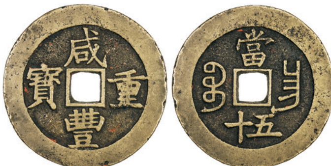
1432. QING: Xian Feng , 1851-1861, AE 50 cash (50.01g), Nanchang mint, Jiangxi Province, H-22.931, 51mm, cast 1855-60, brass ( huáng tóng ) color, VF $75 - 100